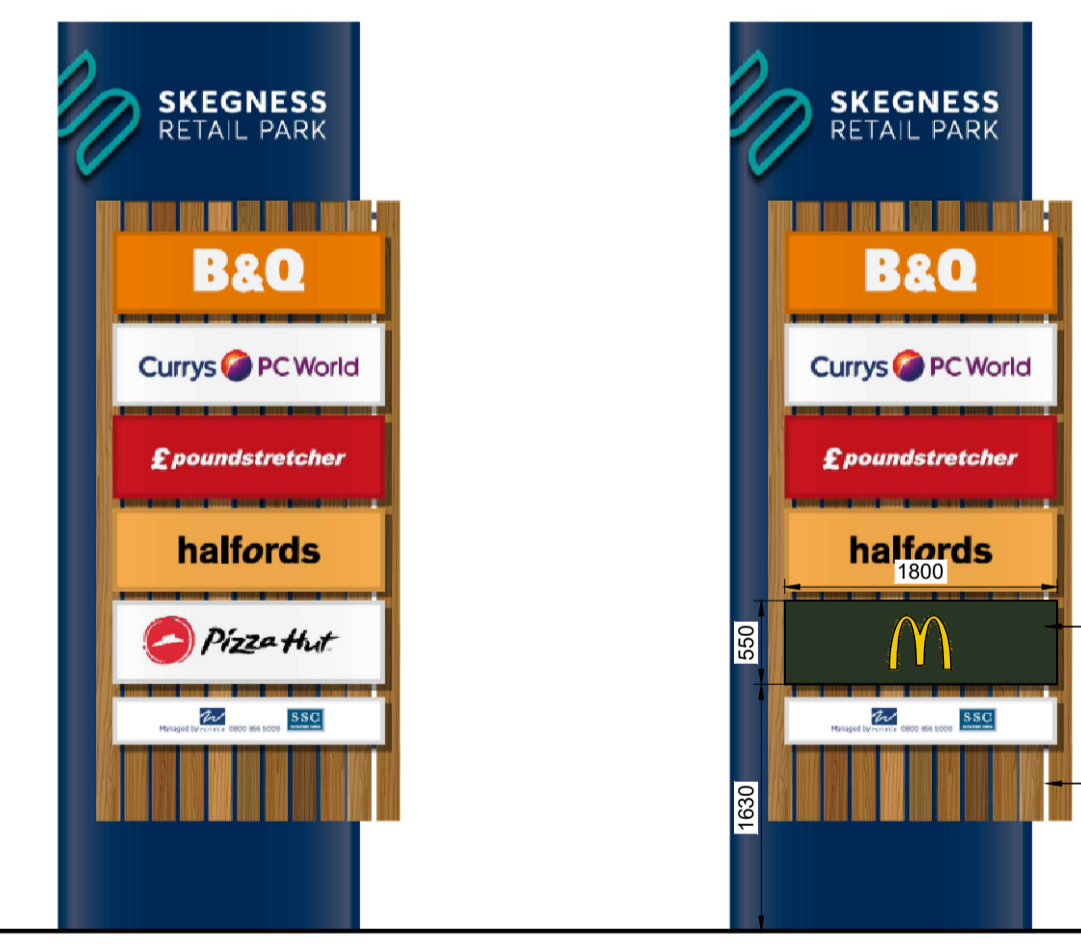
NEW ESTATE SIGN SCALE 1:50 PROPOSED NEW ESTATE SIGN SCALE 1:50

New McDonald's panel New proposed estate sign McDonald's representation on New Estate Sign McDonald's Golden Arch on green back panel. Yellow vinyl M on aluminium panel. 1800mm W x 550mm H. To replace existing tenant sign.