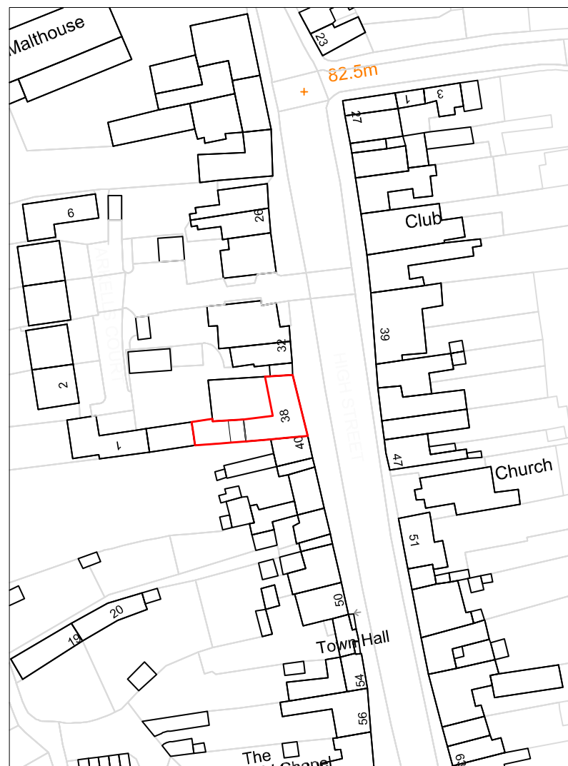
LOCATION PLAN 1:1250 (m) 1:1250 SCALE