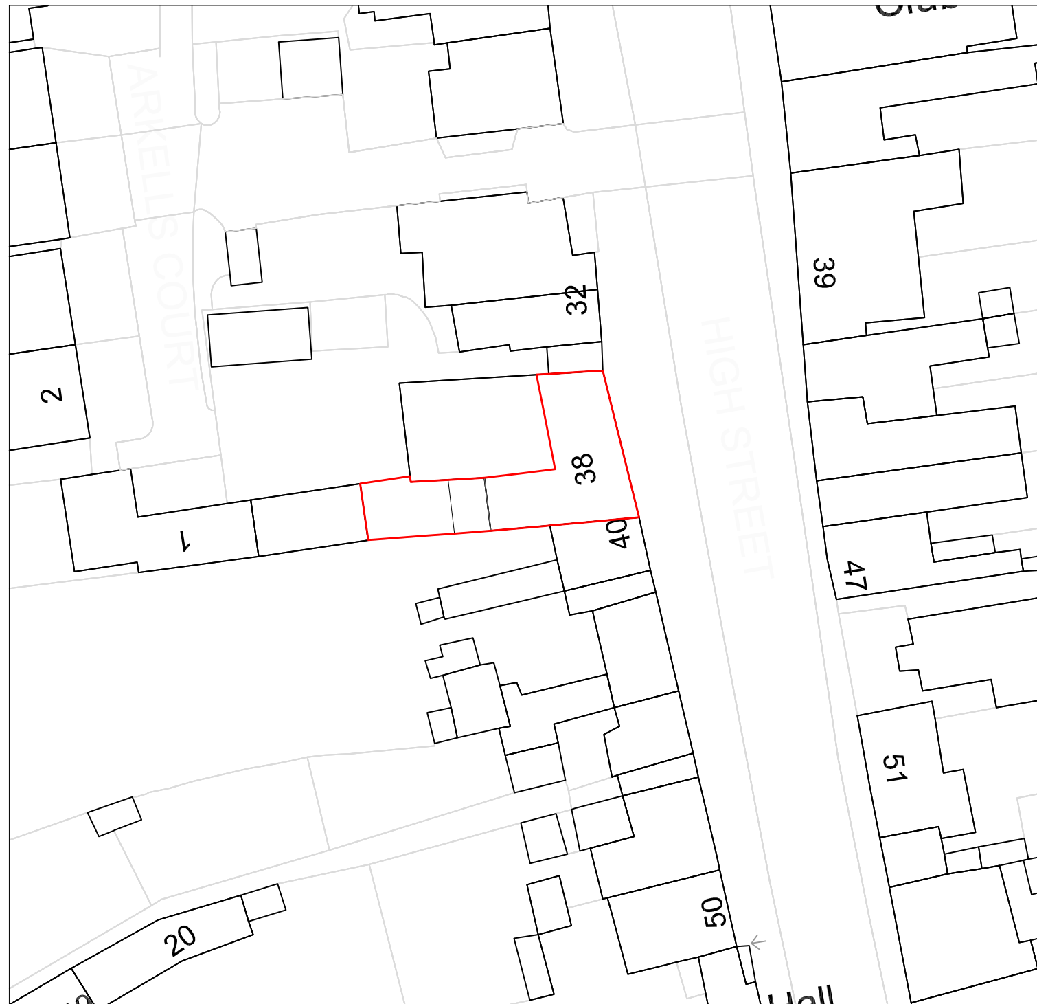
BLOCK PLAN 1:500 (m) 1:500 SCALE