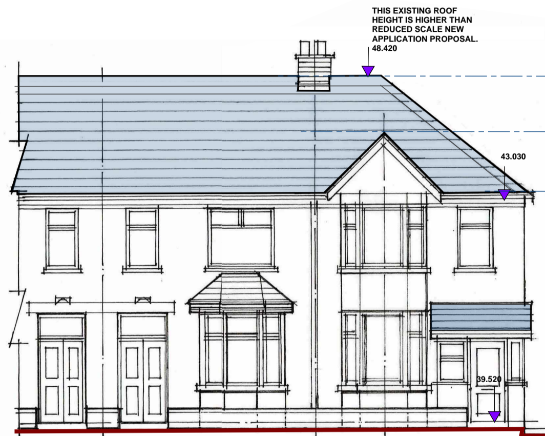
FRONT ELEVATIONS AS PROPOSED IN THIS SECTION 73 APPLICATION SCALE 1:100 A2