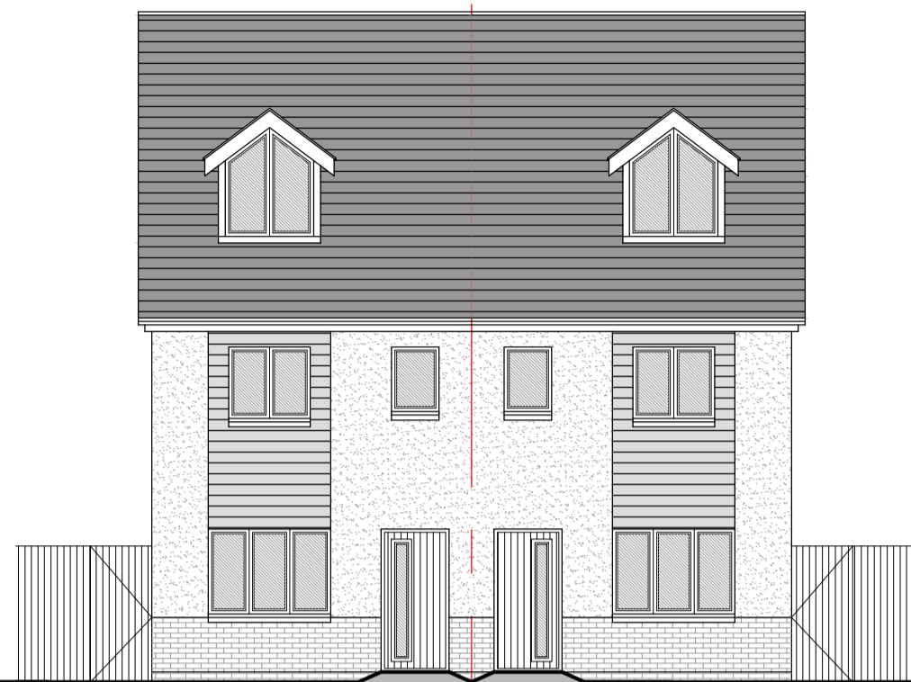
FRONT ELEVATIONS AS APPROVED IN NO: 21/00667/MNR APPLICATION SCALE 1:100 A2