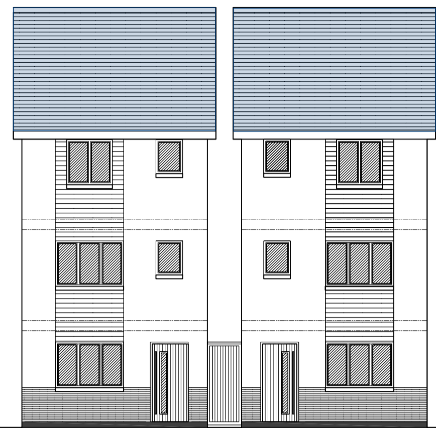
FRONT ELEVATIONS AS PROPOSED IN THIS SECTION 73 APPLICATION SCALE 1:100 A2