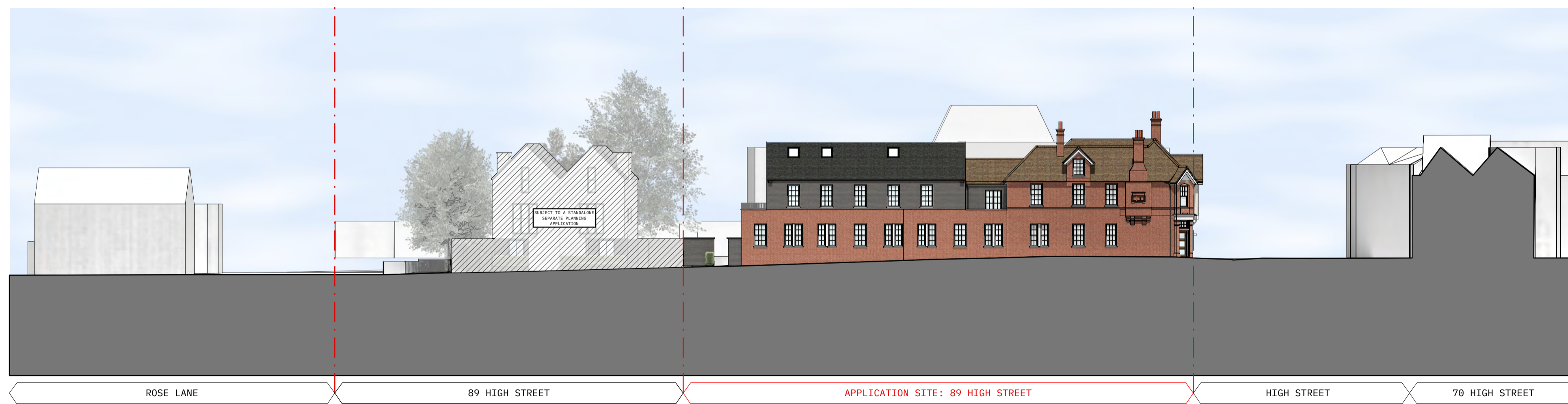
B Proposed Context Elevation GE.20 1:250 @ A1 1:500 @ A3