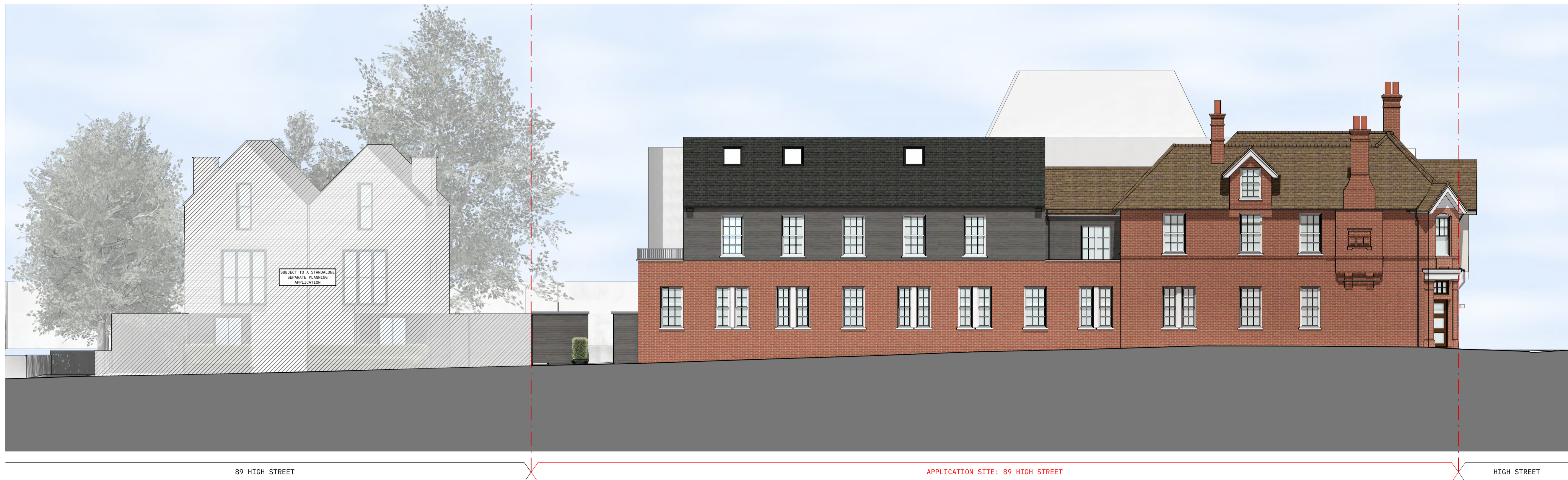
A Proposed South Site Elevation GE.20 1:100 @ A1 ; 1:200 @ A3