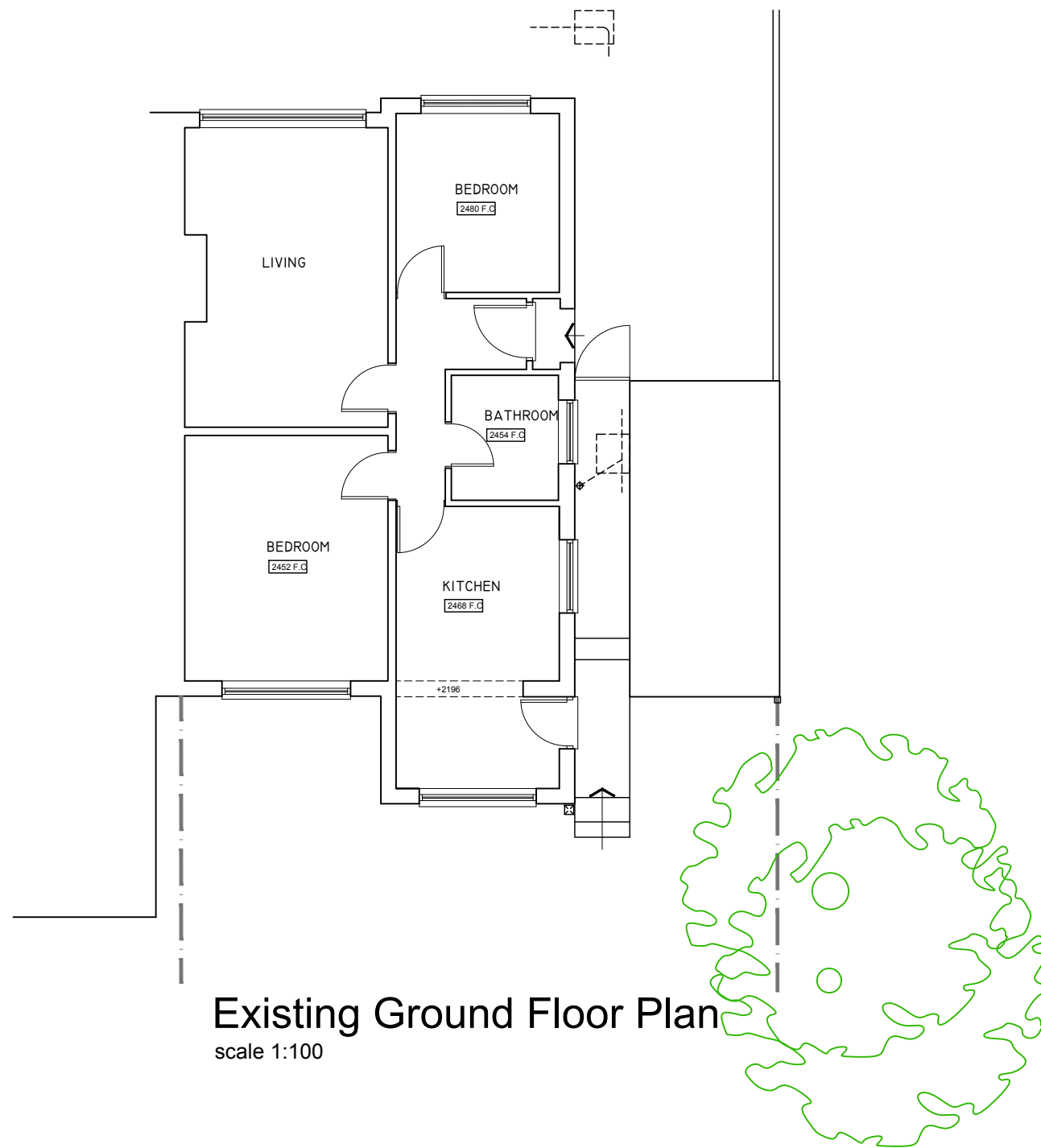
Existing Ground Floor Plan scale 1:100