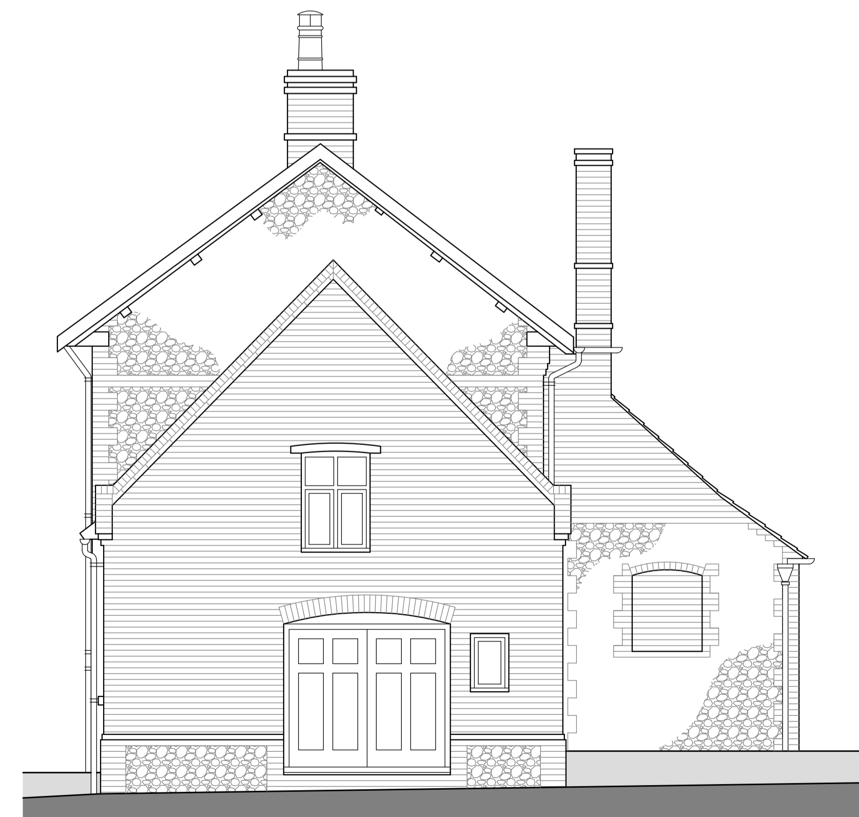
North Elevation 1:50