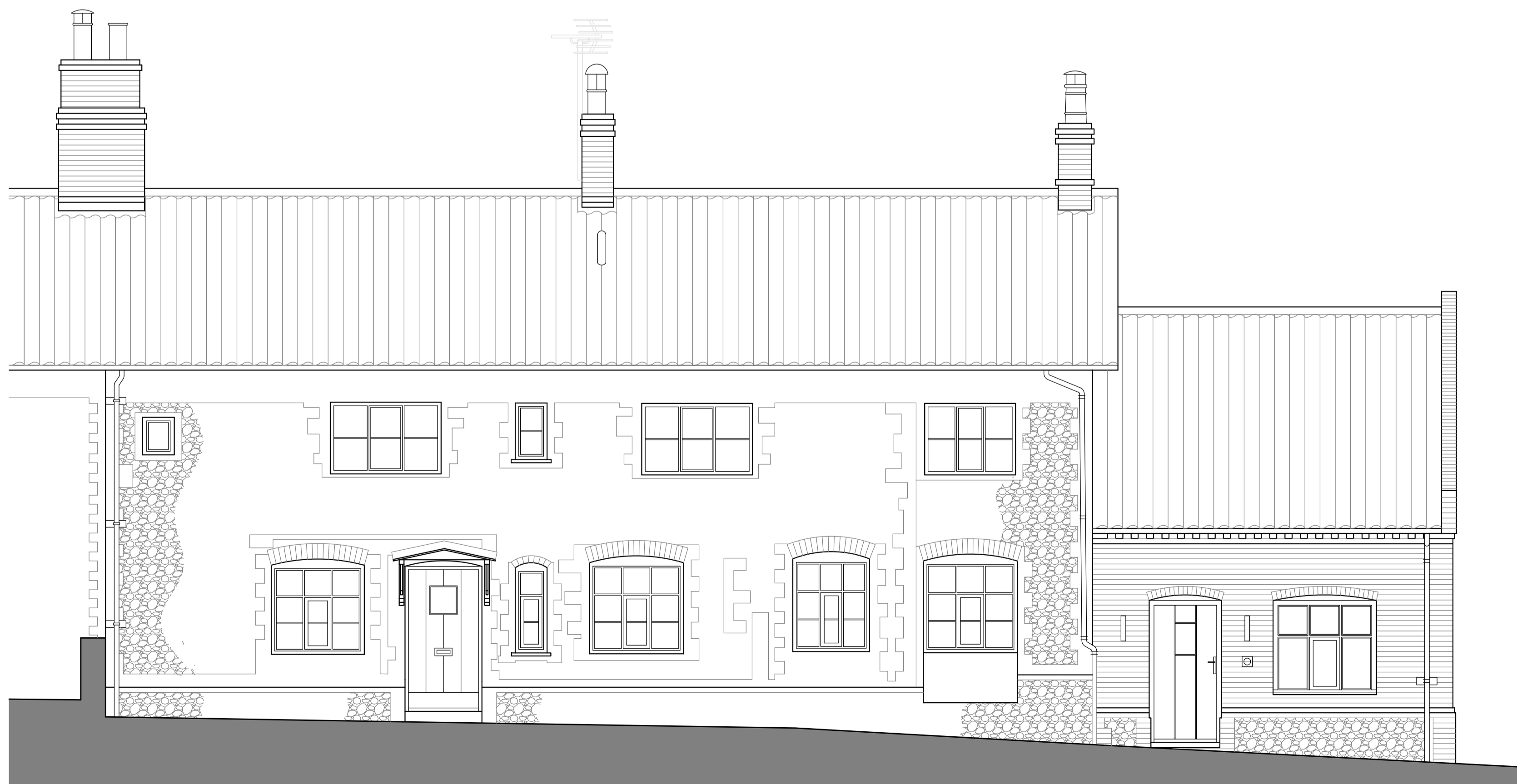
East Elevation 1:50