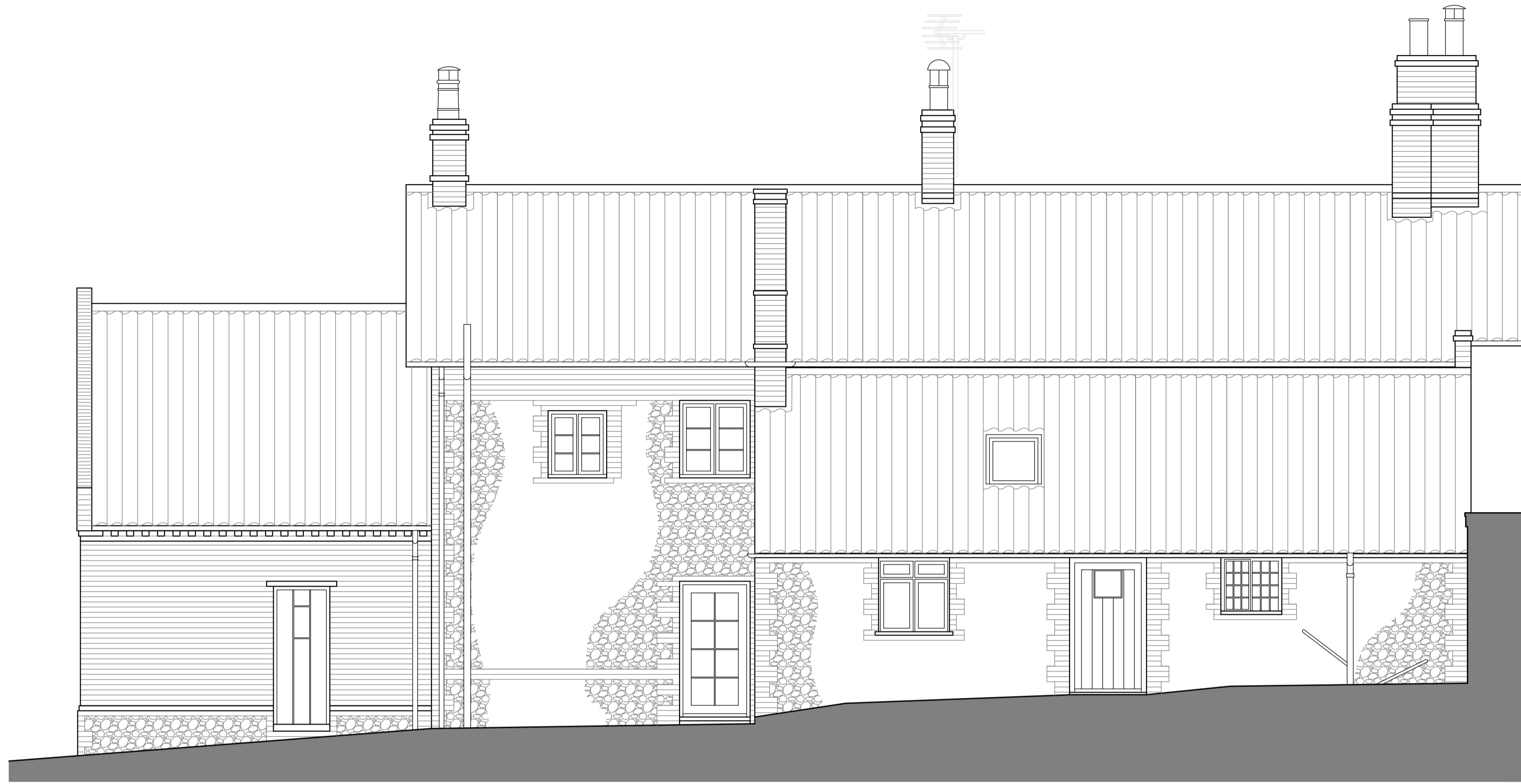
West Elevation 1:50