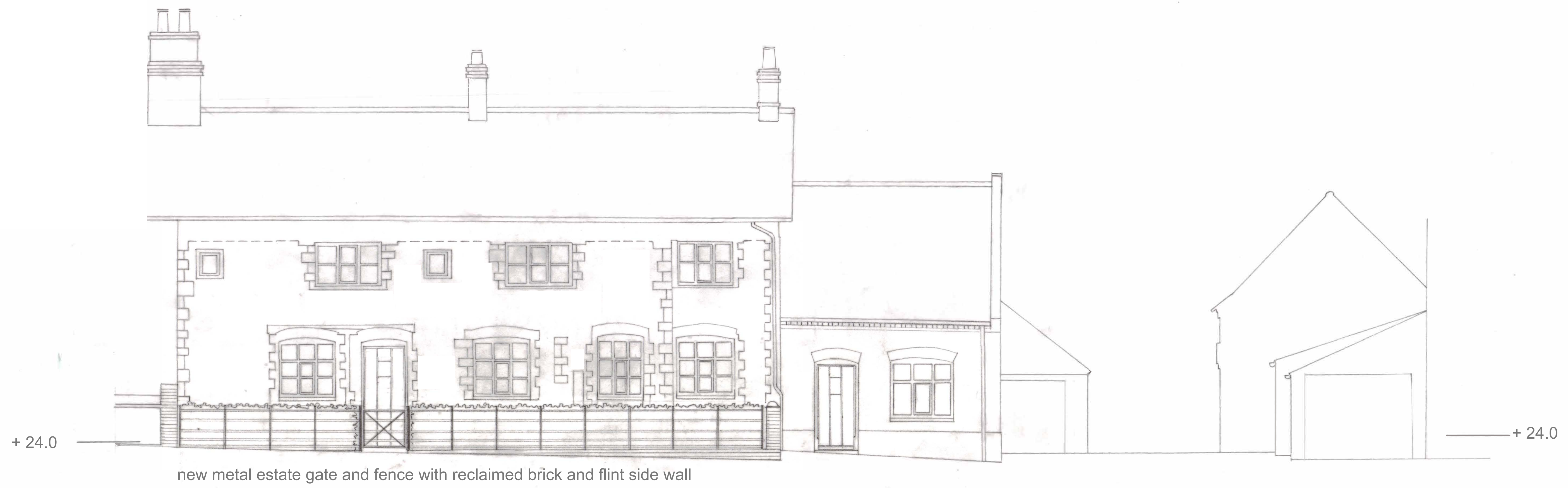
PROPOSED GARDEN FENCE AND WALL ELEVATION - FRONT STREET