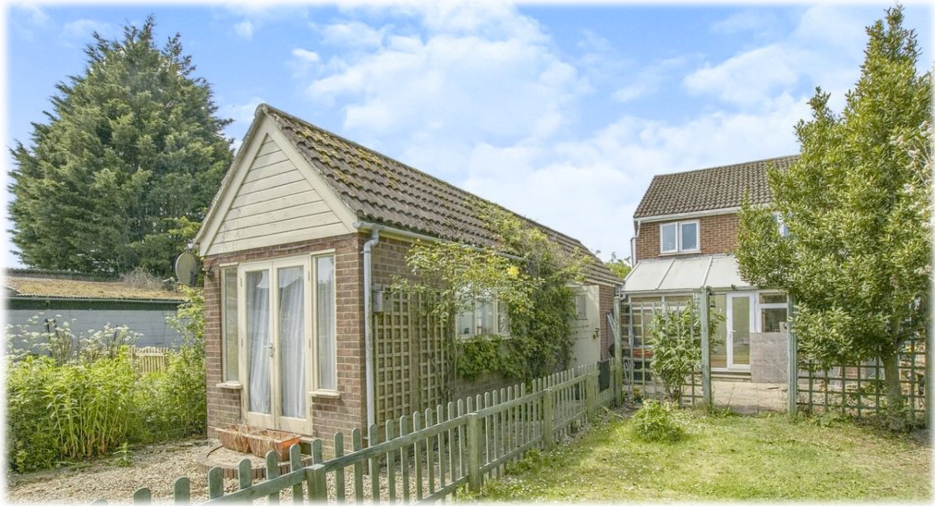
Poplar house Garage, Station road, Potter Heigham Supporting statement