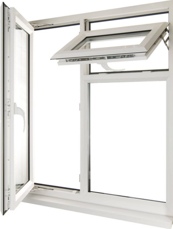
White UPVC Windows