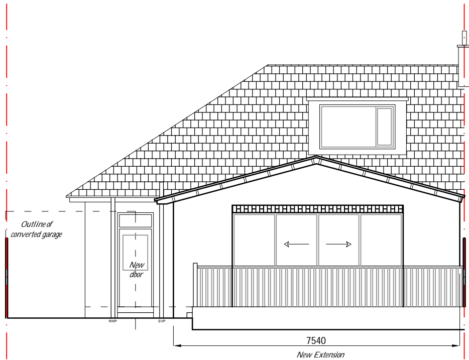
1 Rear Elevation As Proposed

Revision, Notes, Date, By. A. Client Update. 17/01/24. JC B. Client Update. 26/01/24. JC C. Drawing Update. 31/01/24. JC D. Planning Update. 12/02/24. JC