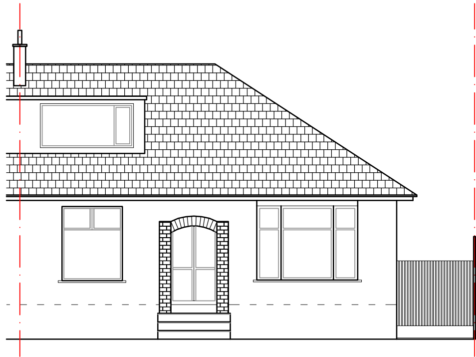
3 Front Elevation As Proposed