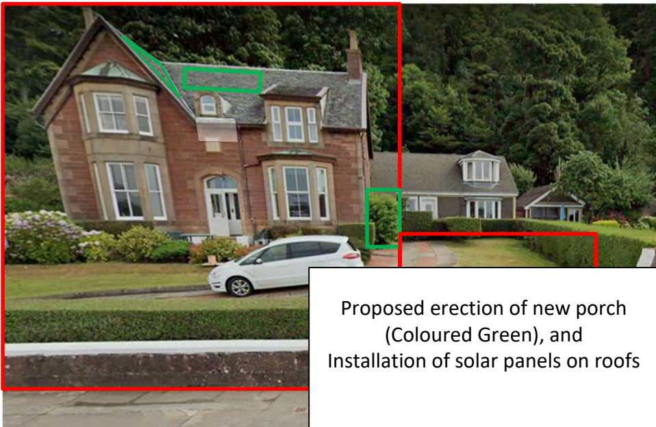
Proposed erection of new porch (Coloured Green), and Installation of solar panels on roofs

Phots Courtesy of Google Streetview Location Map Courtesy of North Ayrshire Council Local Plan