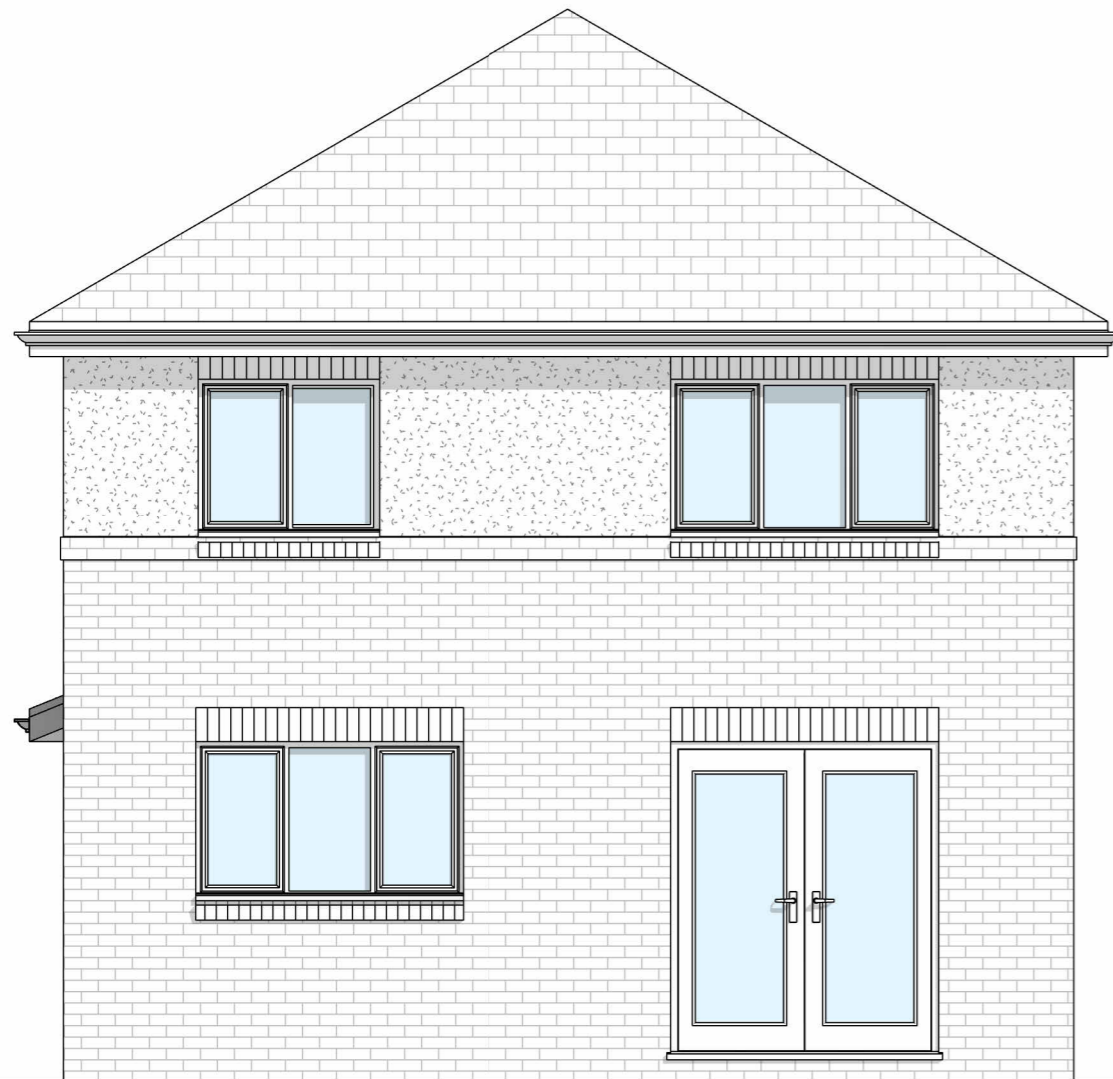
Existing Rear Elevation 1 : 50

THE PROPOSED WORKS ARE ESSENTIAL FOR THE HOUSE HOLDER TO ACCOMODATE THEIR DISABLED DAUGHTER WHO WILL BE MOVING HOME FROM HOSPITAL SHORTLY