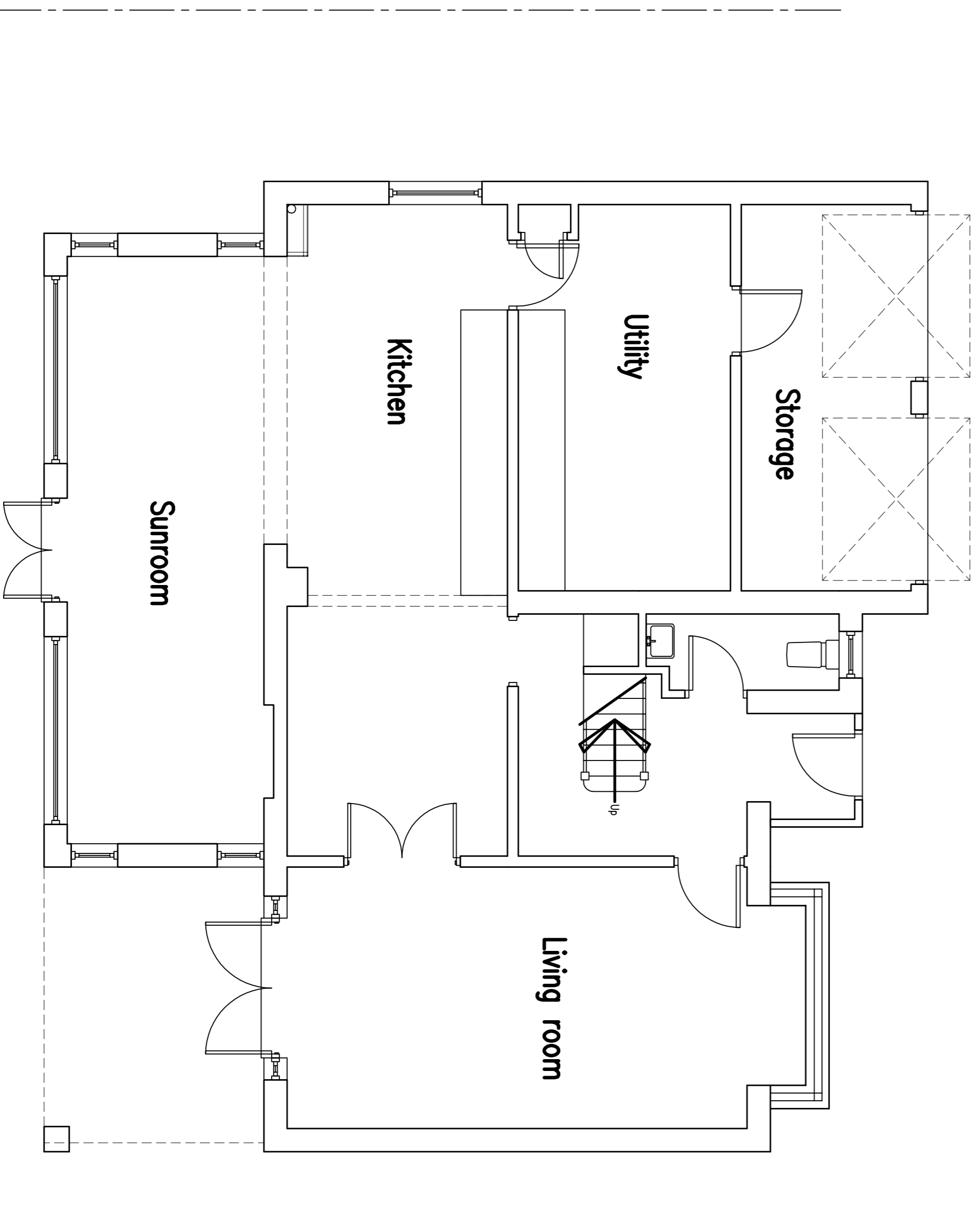
Existing Floor Plan