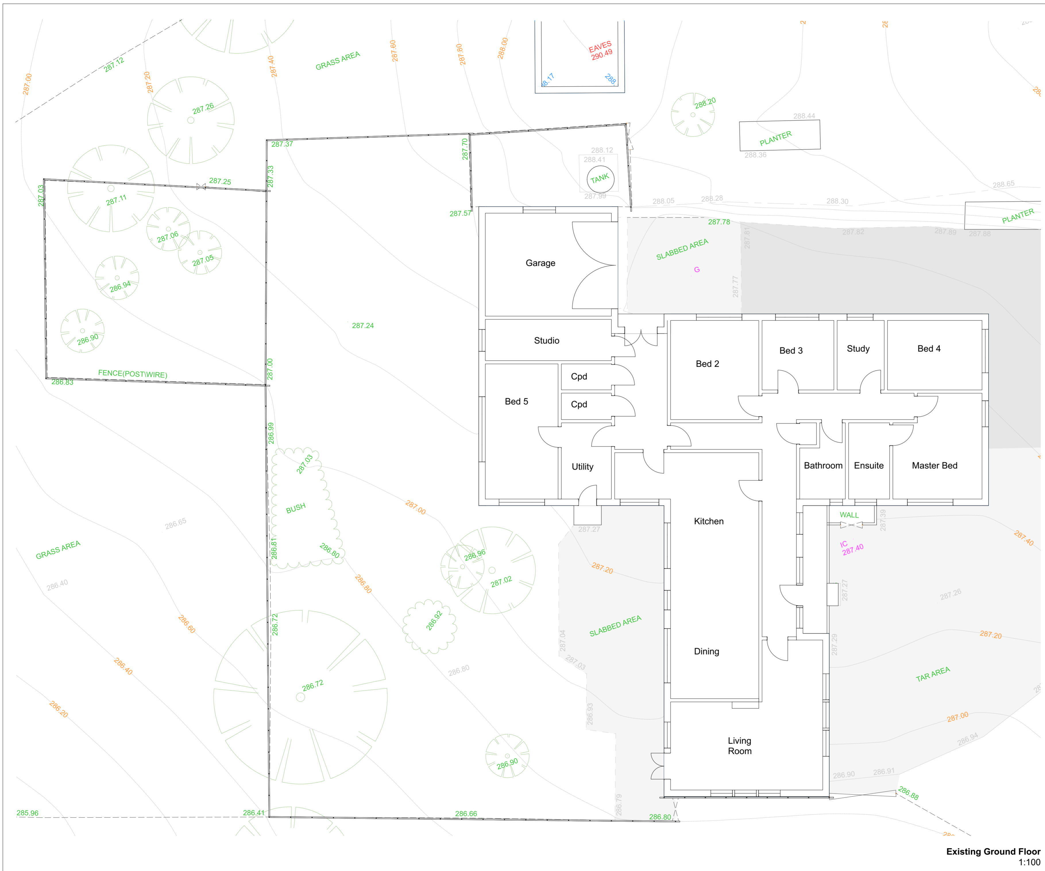
Existing Ground Floor 1:100