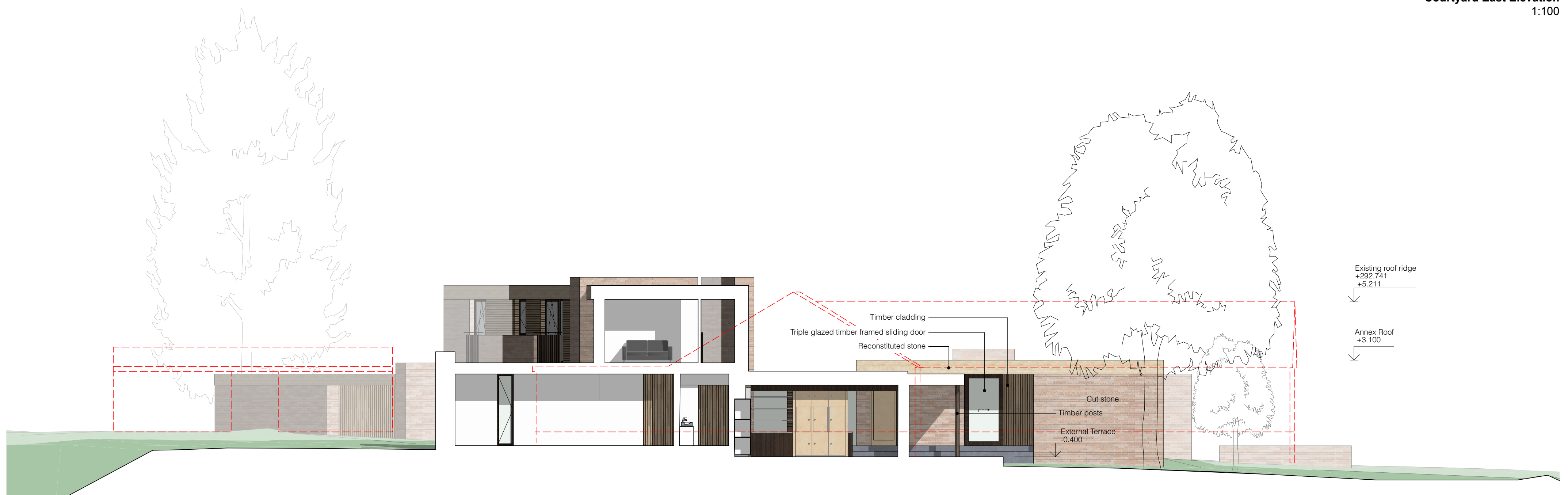
Courtyard West Elevation 1:100

Copyright © WT Architecture Ltd. To be read in conjunction with all other associated drawings, specifications and schedules. Immediately report any discrepancies, errors or omissions to the Architect CA. If in doubt ASK.