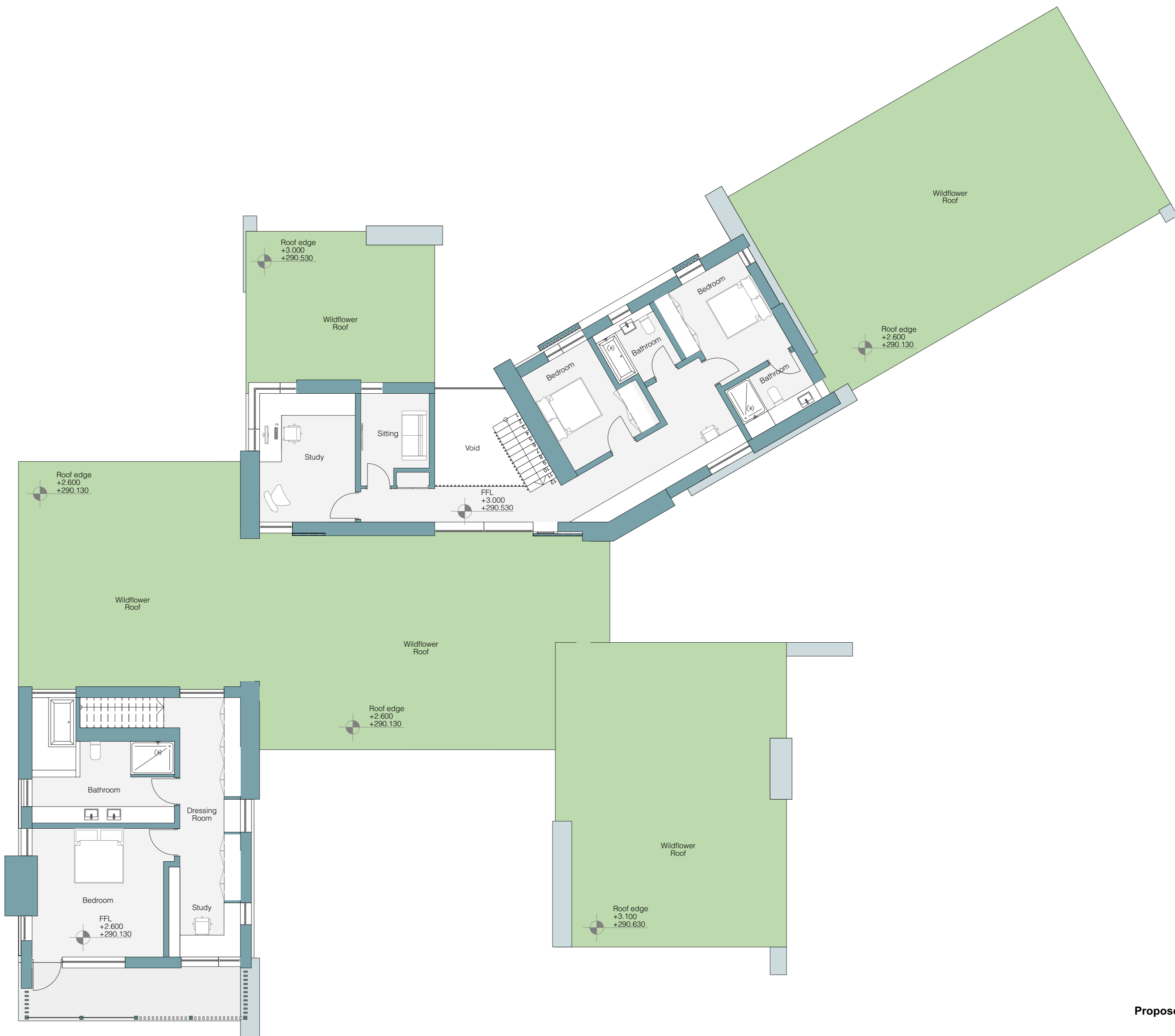
Proposed First Floor Plan 1:100

Copyright © WT Architecture Ltd. To be read in conjunction with all other associated drawings, specifications and schedules. Do not scale from this drawing, use figured dimensions only. All dimensions to be checked by Contractor on site. Immediately report any discrepancies, errors or omissions to the Architect/CA, if in doubt ASK.