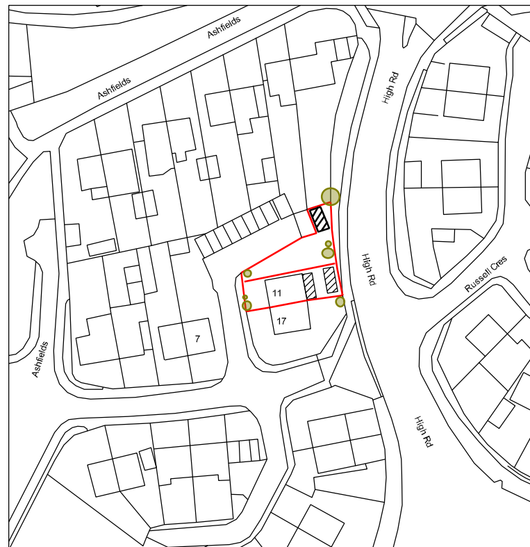
SITE BLOCK PLAN SCALE 1:500 ● = Existing Trees