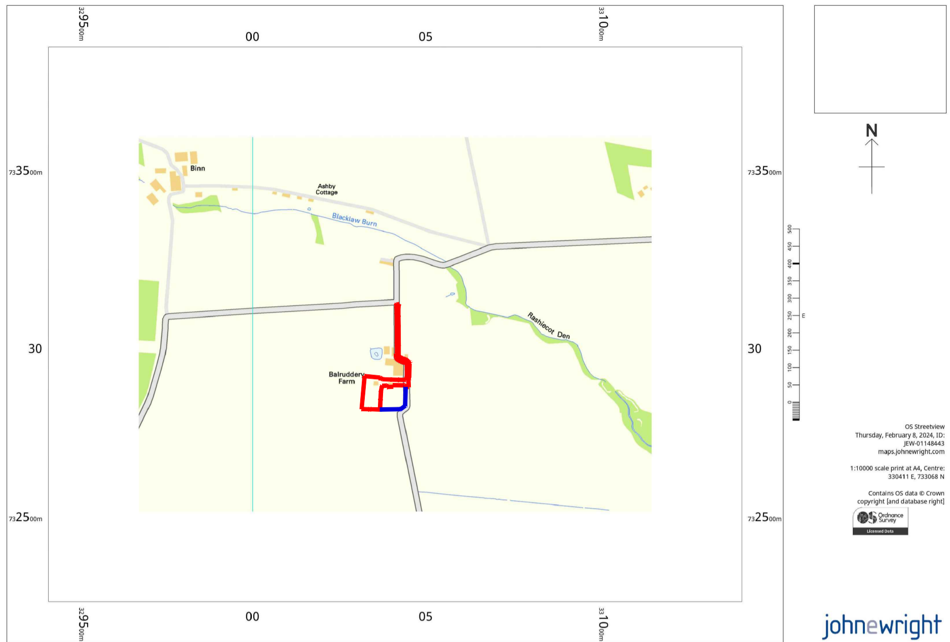
Location Plan 1:10,000 0 100 200 300 400 500 SCALE 1:10,000 (A2) LENGTHS SHOWN IN METRES

All dimensions and levels to be checked on site prior to the commencement of work. Architect to be informed of any discrepancies prior to the commencement of work. Unspecified dimensions are not to be scaled off this drawing for construction purposes. All dimensions are in millimetres unless stated otherwise. If any dimensions or details conflict please notify the Architect immediately. This drawing is to be used for STATUTORY purposes only. This is not a CONSTRUCTION drawing.