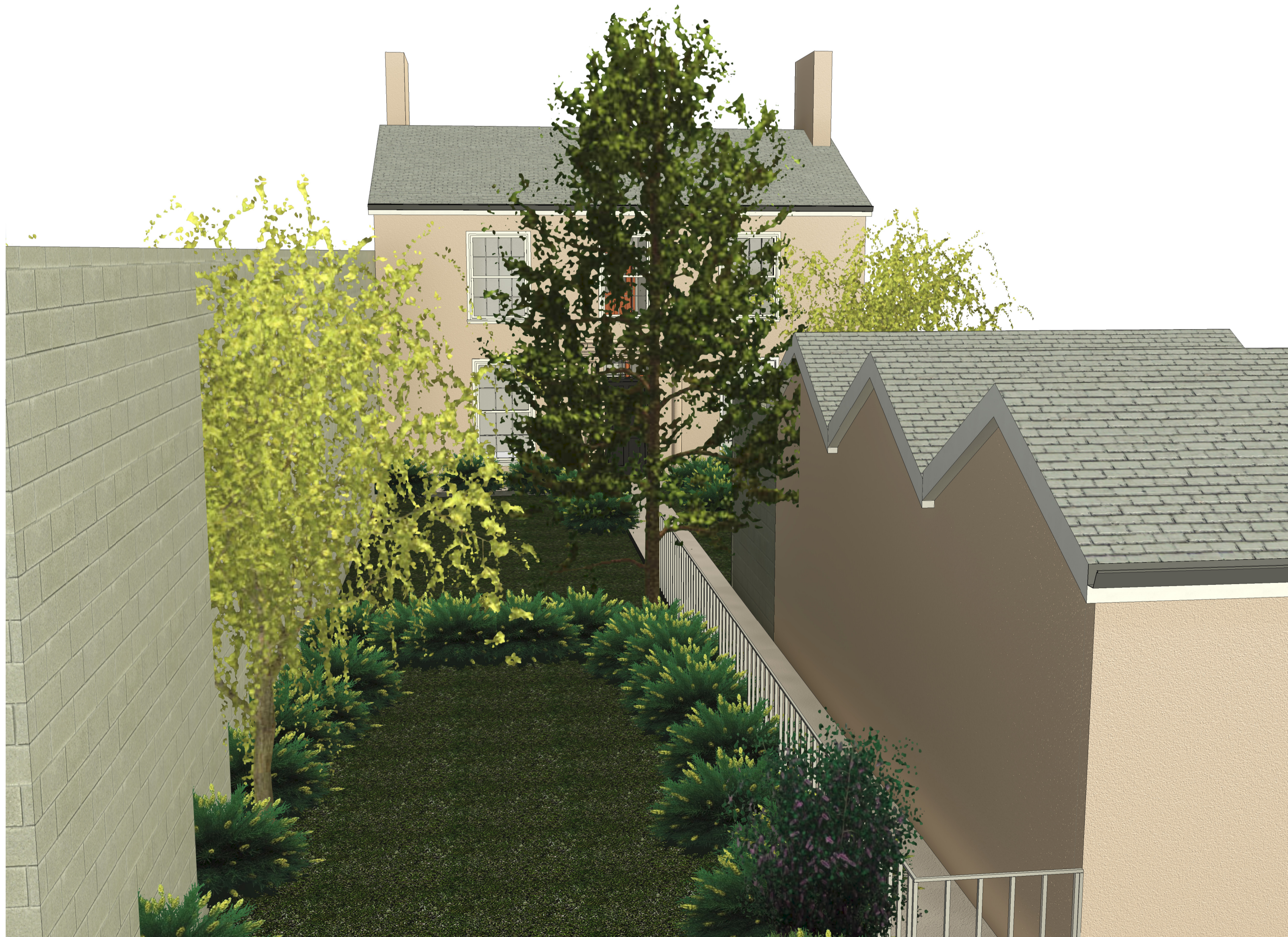
1 3D elevated camera position