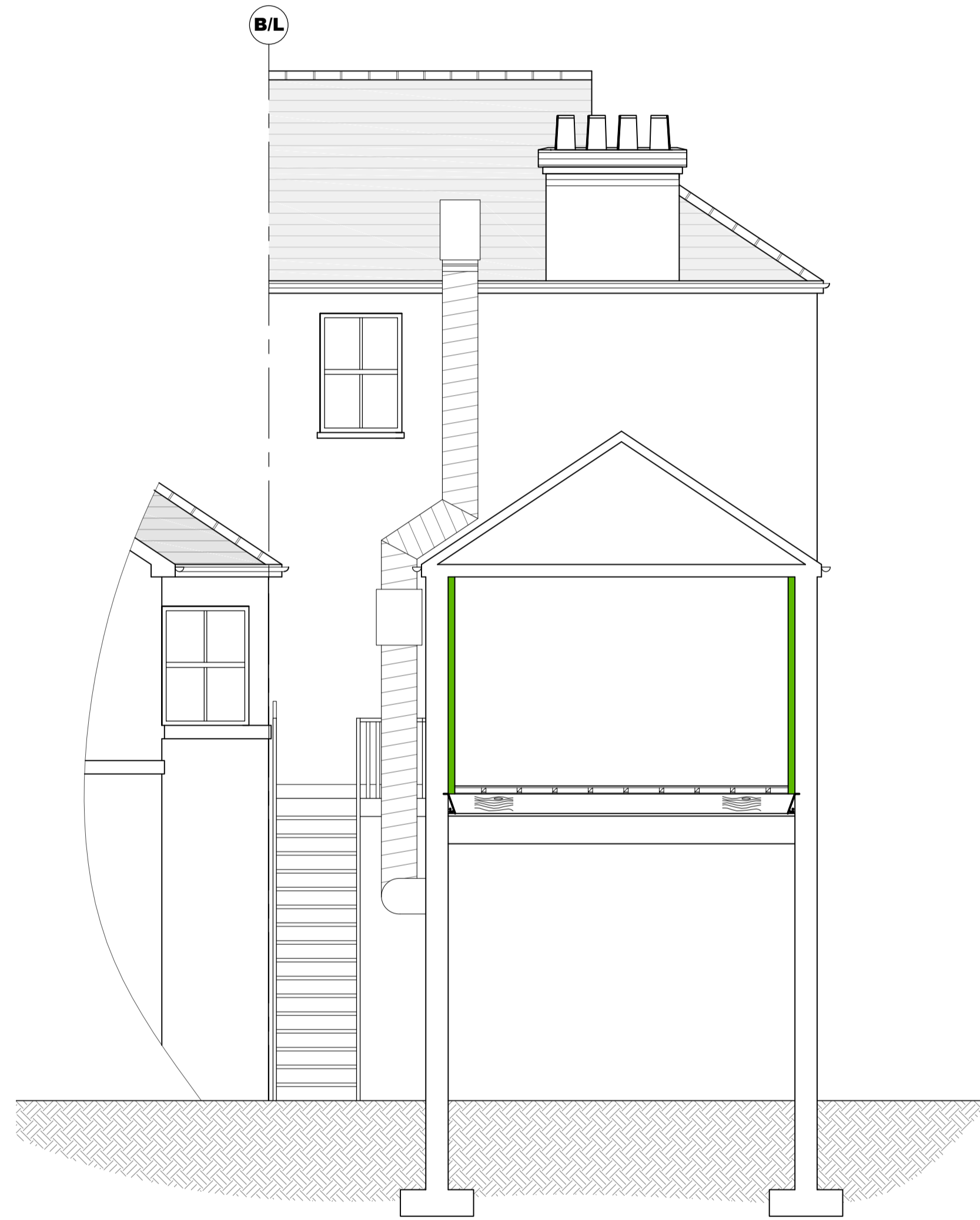
Existing Cross Section 1:50