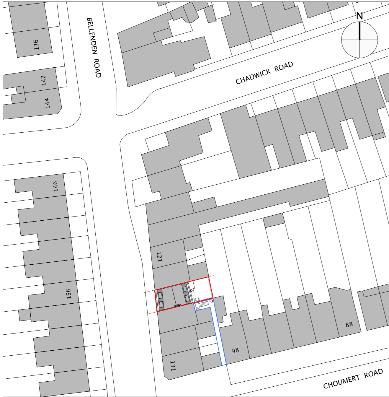
BLOCK PLAN - PROPOSED 1:500