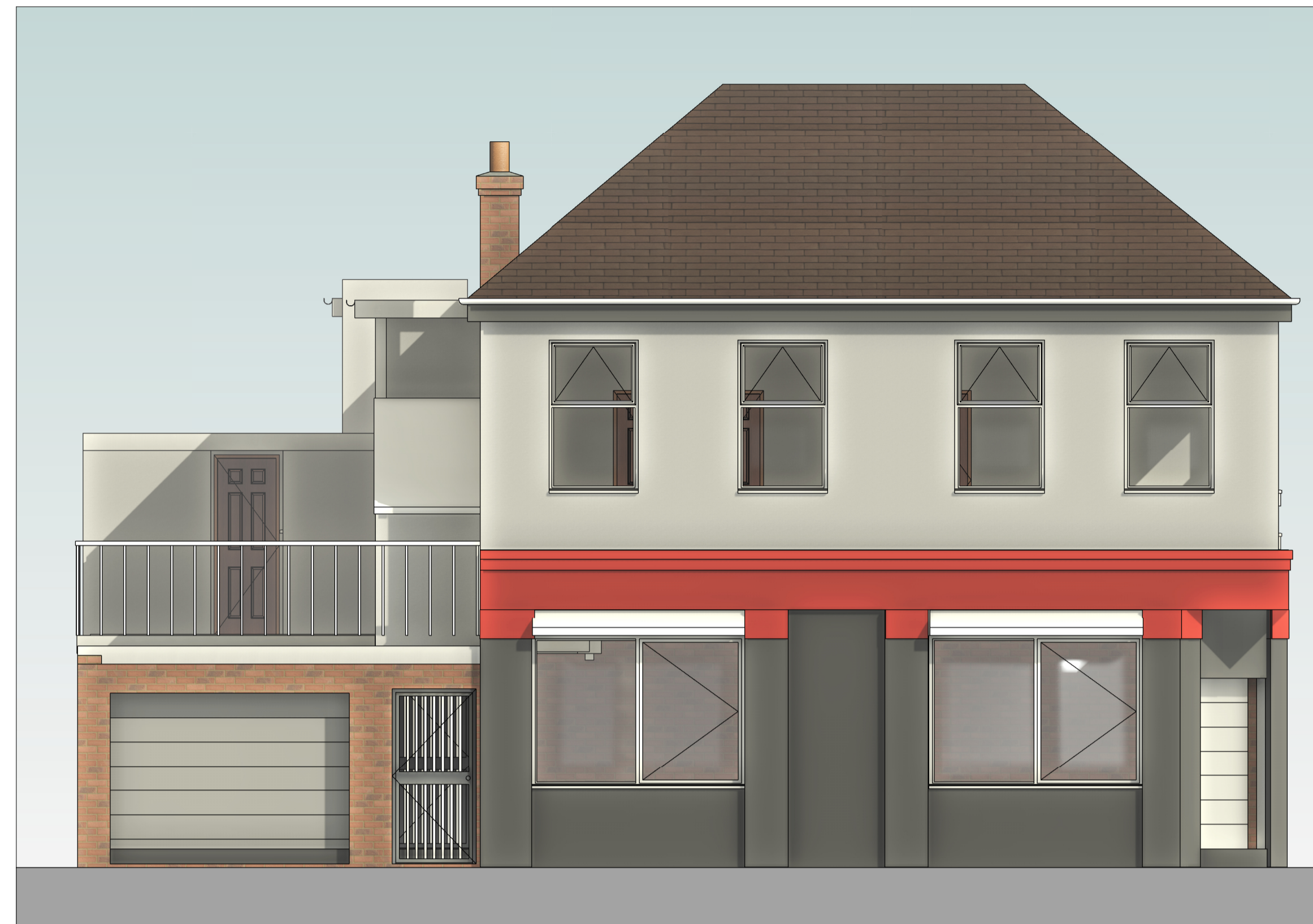
1 South/East 1 : 50