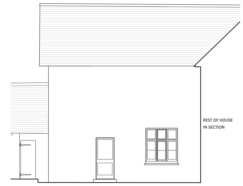
FRONT RECESS SOUTHEAST ELEVATION As Existing