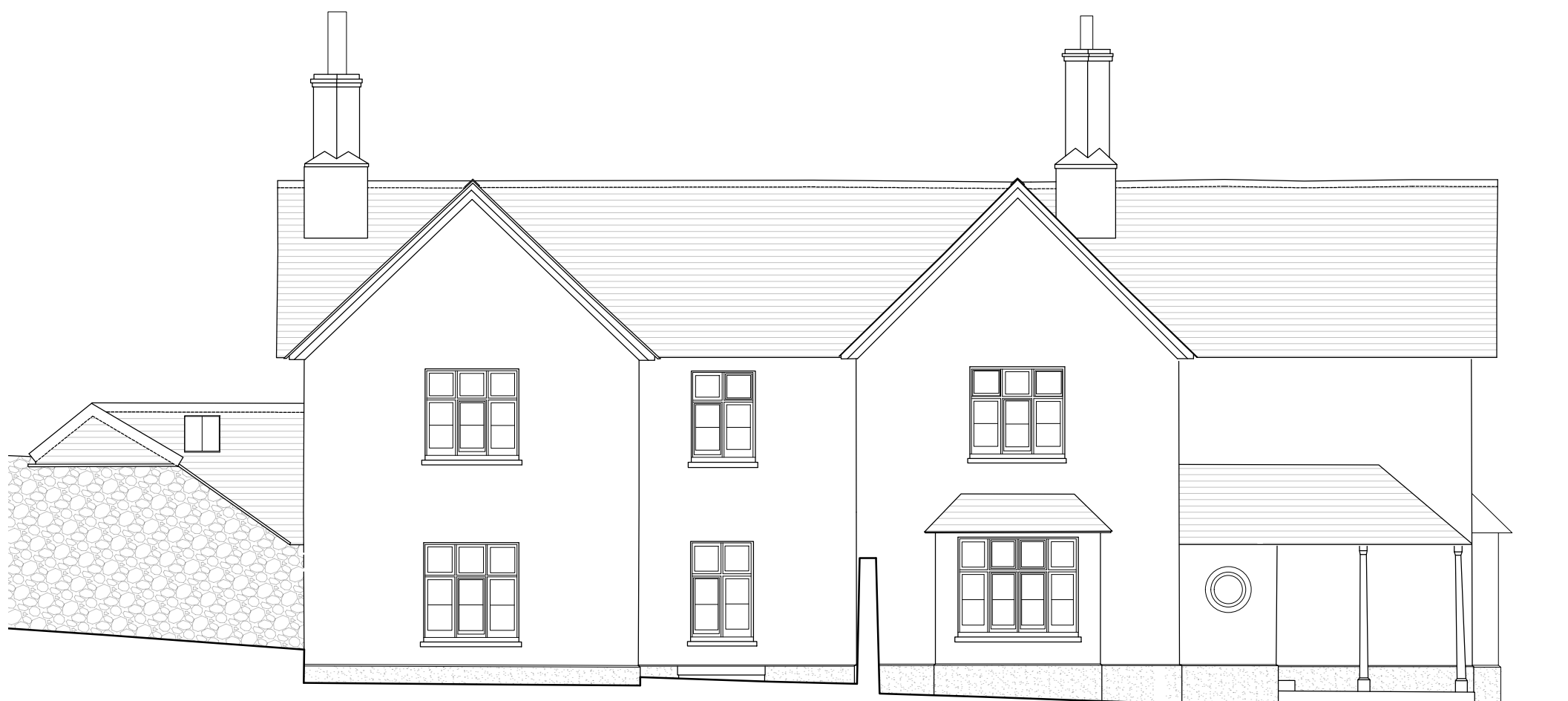
FRONT (NORTHWEST) ELEVATION As Existing