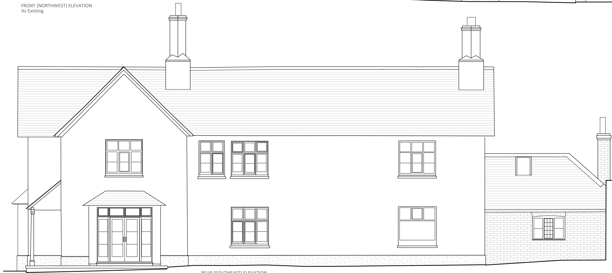
REAR (SOUTHEAST) ELEVATION As Existing