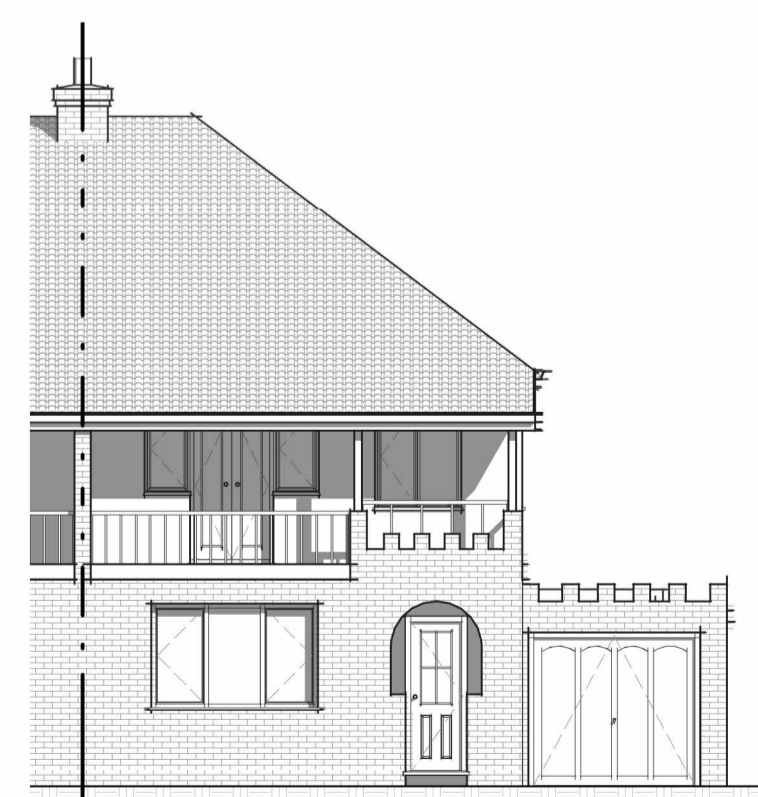
Existing North 1 : 100