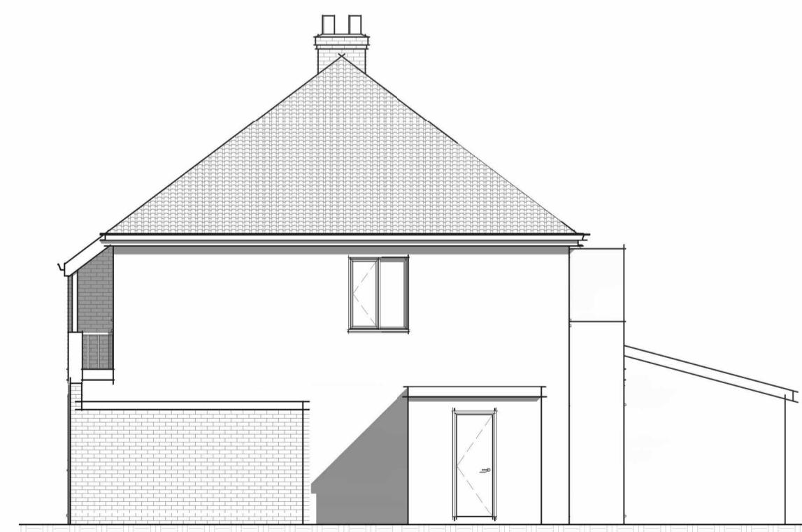
Existing West 1 : 100