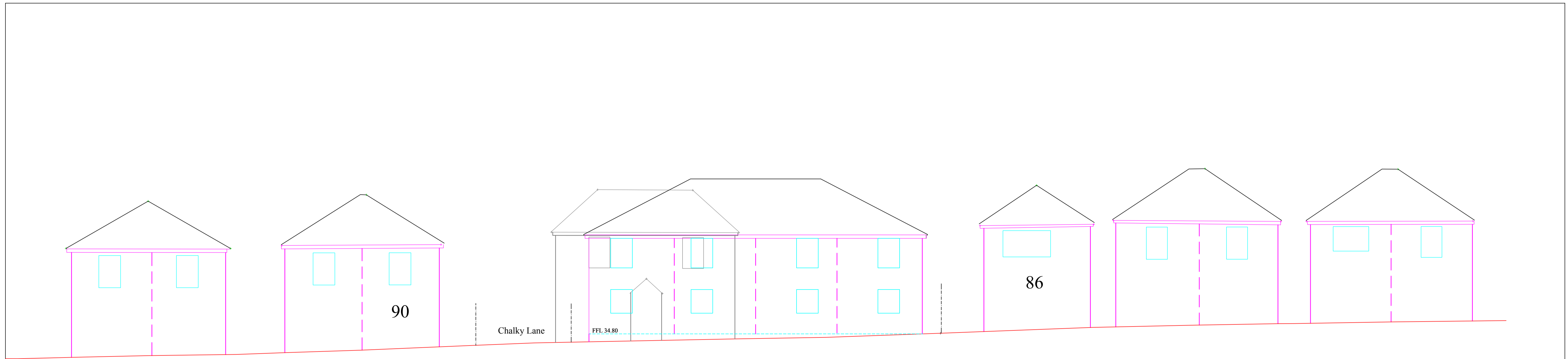
Wire frame Proposed street scene