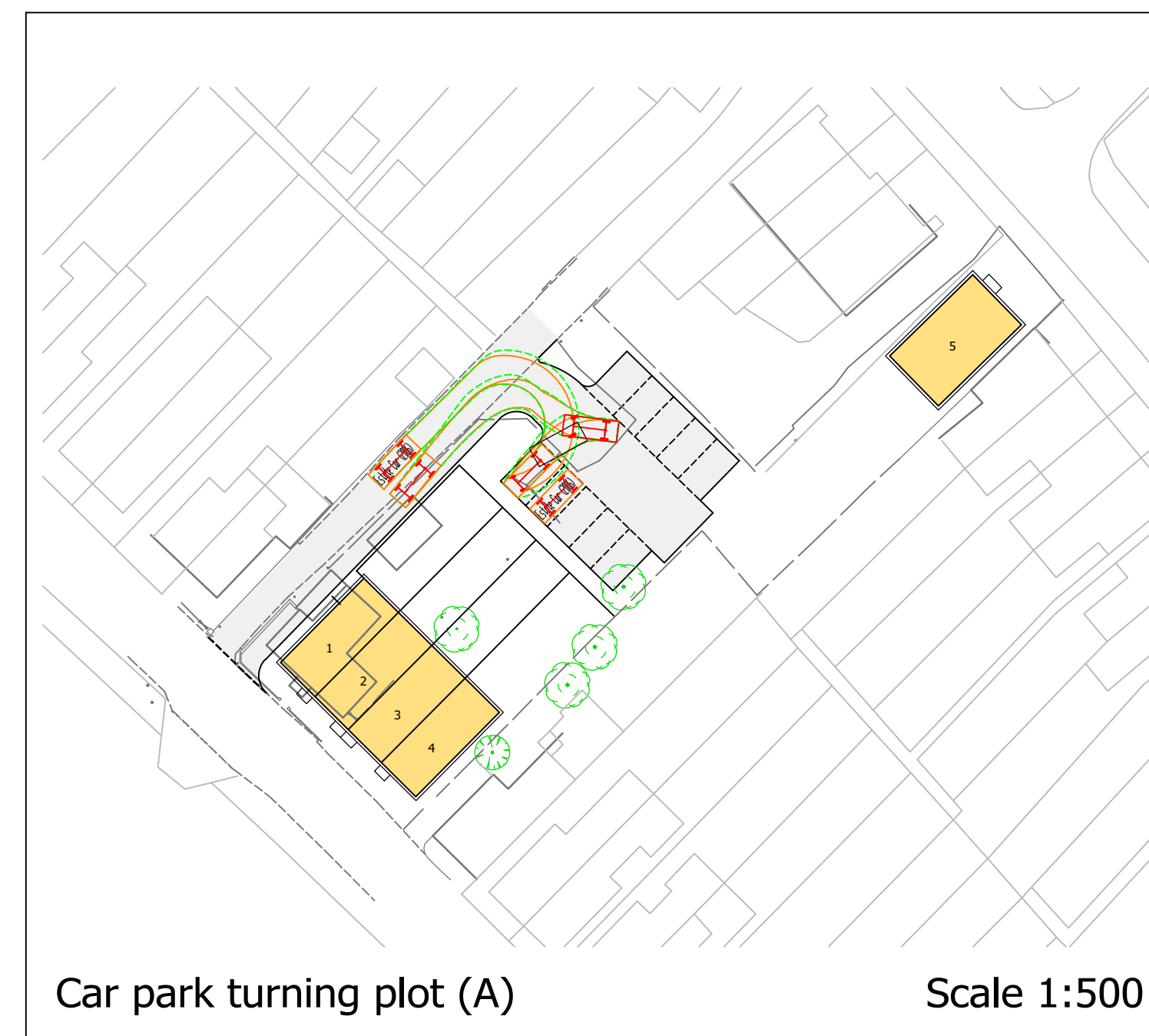
Car park turning plot (A) Scale 1:500