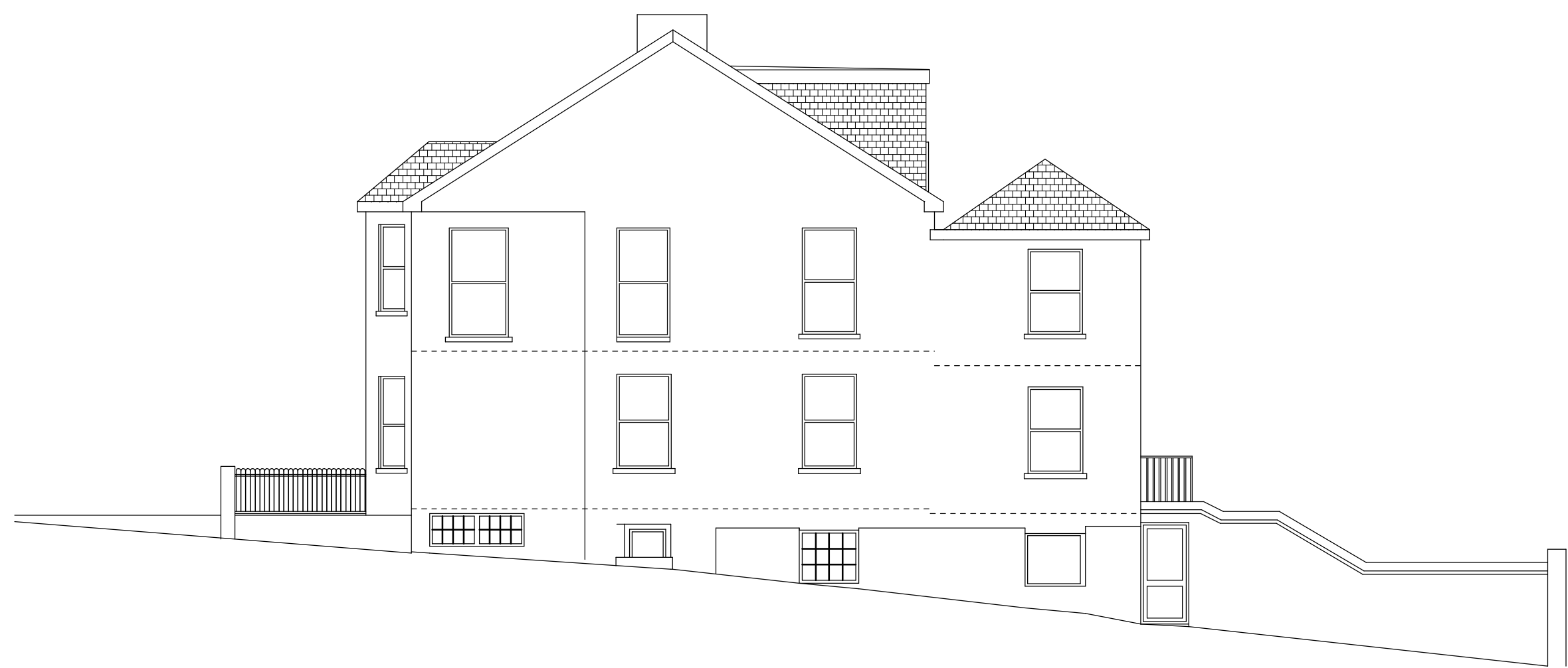
PROPOSED SIDE ELEVATIONS