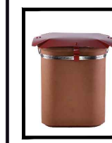
Photograph of typical chimney cowl to be installed on square chimney pots.