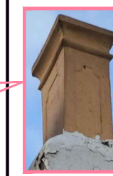
Photograph of chimney pot at party wall with No.23 to be replaced like for like.