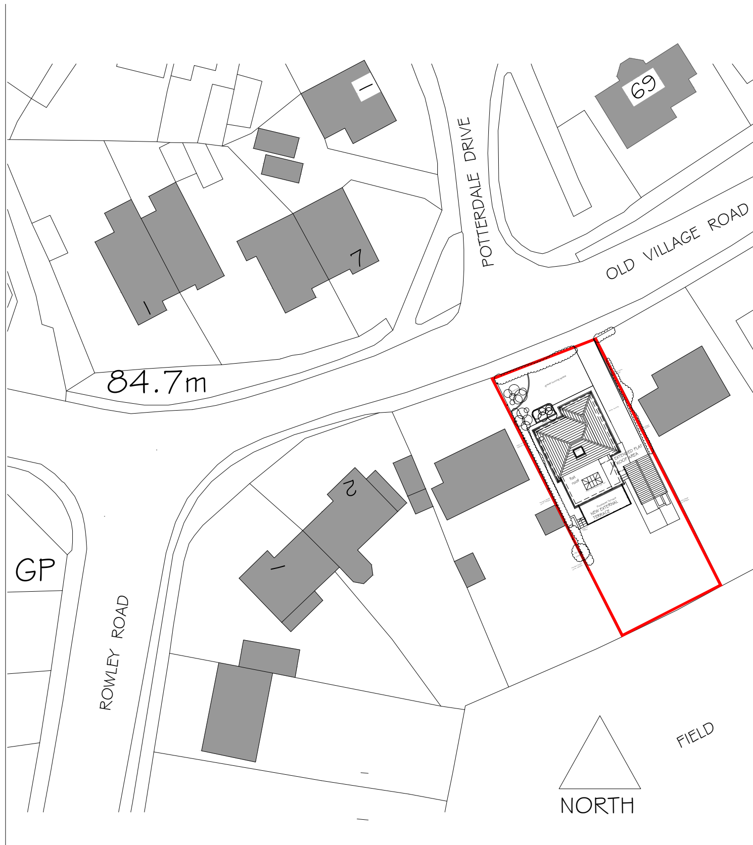
BLOCK PLAN PROPOSED