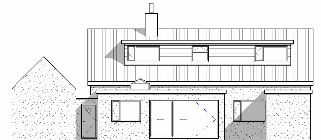
2 Proposed Rear 1 : 100