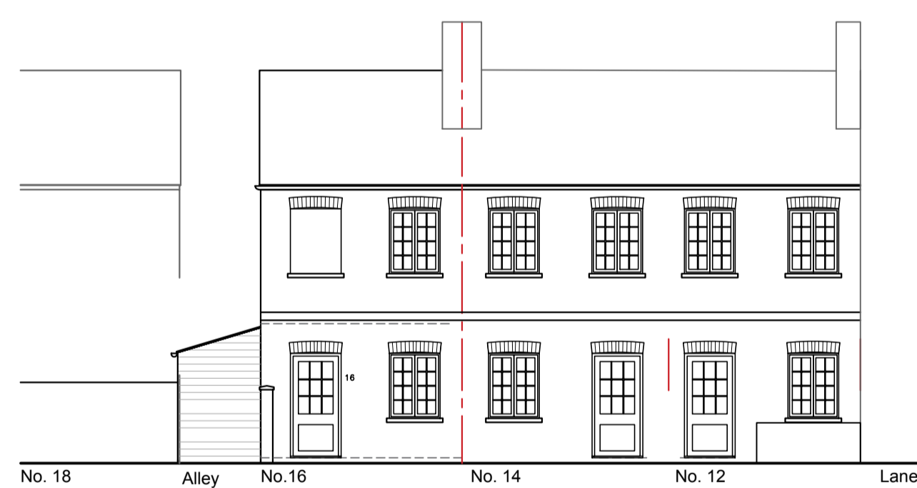
EXISTING FRONT ELEVATION - ALBION STREET B-B