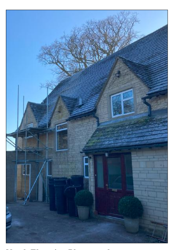
North Elevation Photograph