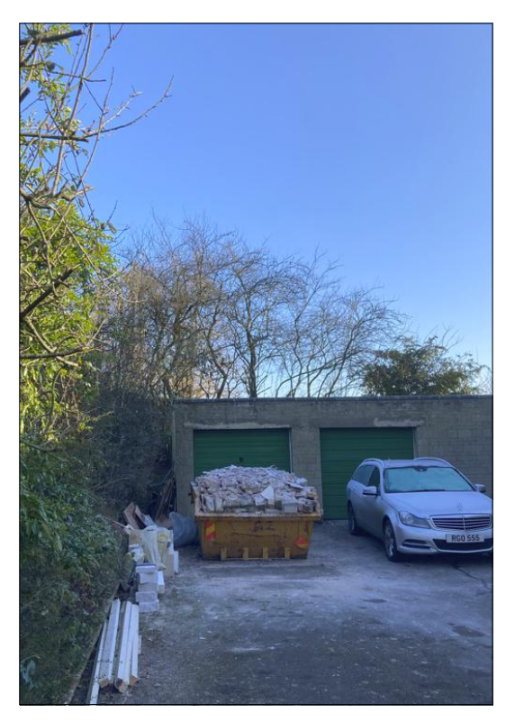
Garage West Elevation Photograph