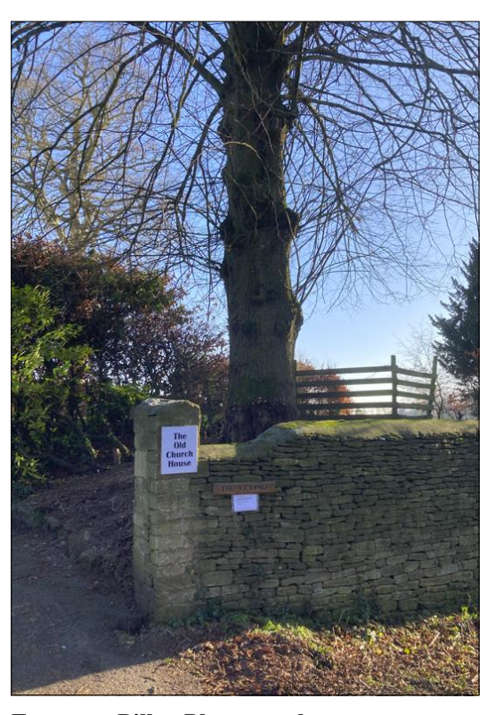
Entrance Pillar Photograph