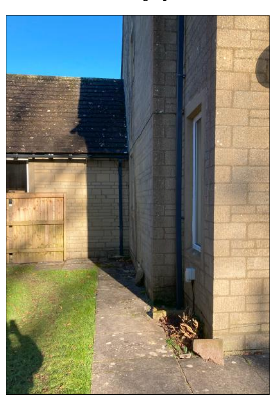
South Elevation Photograph