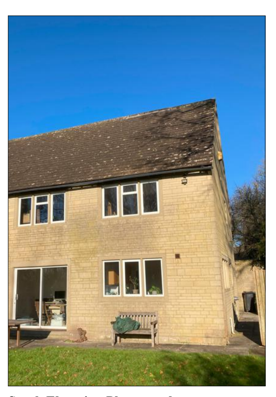
South Elevation Photograph