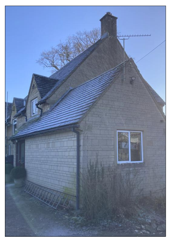
West Elevation Photograph