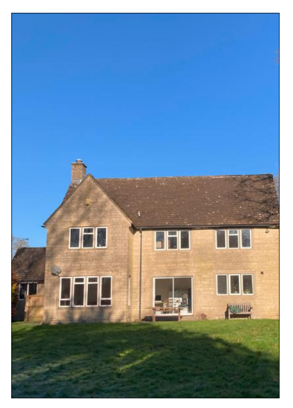
South Elevation Photograph