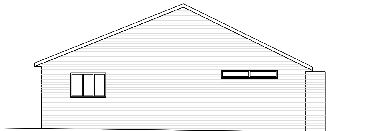
SIDE ELEVATIONS- REMAIN AS EXISTING