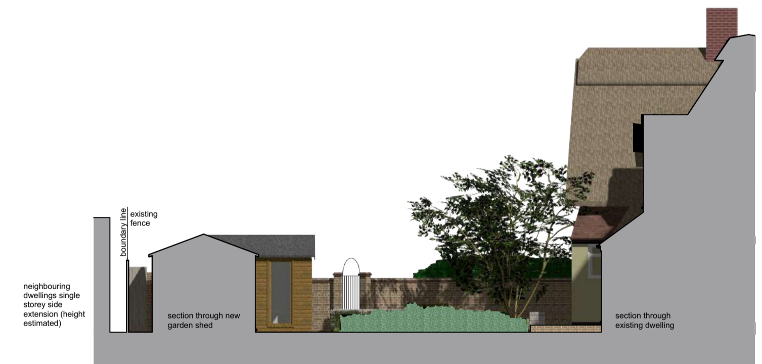
Proposed Section AA Through Shed, Garden, Boundary and House, also showing side of new shed