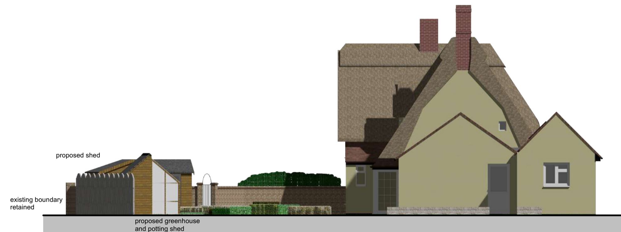
Proposed Rear Elevation - within site context