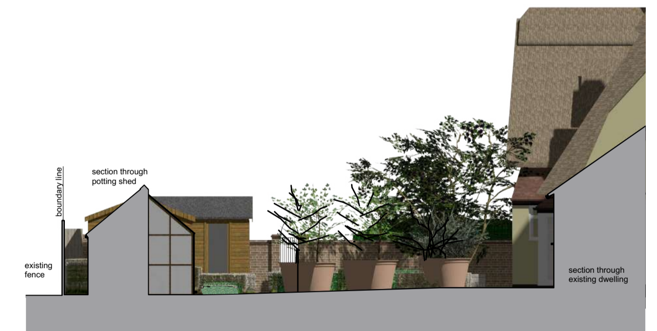
Proposed Section BB Through Potting Shed and Greenhouse, Garden, Boundary and House