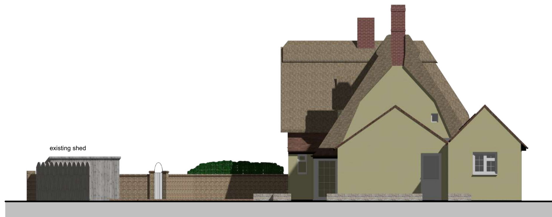
Existing Rear Elevation - within site context