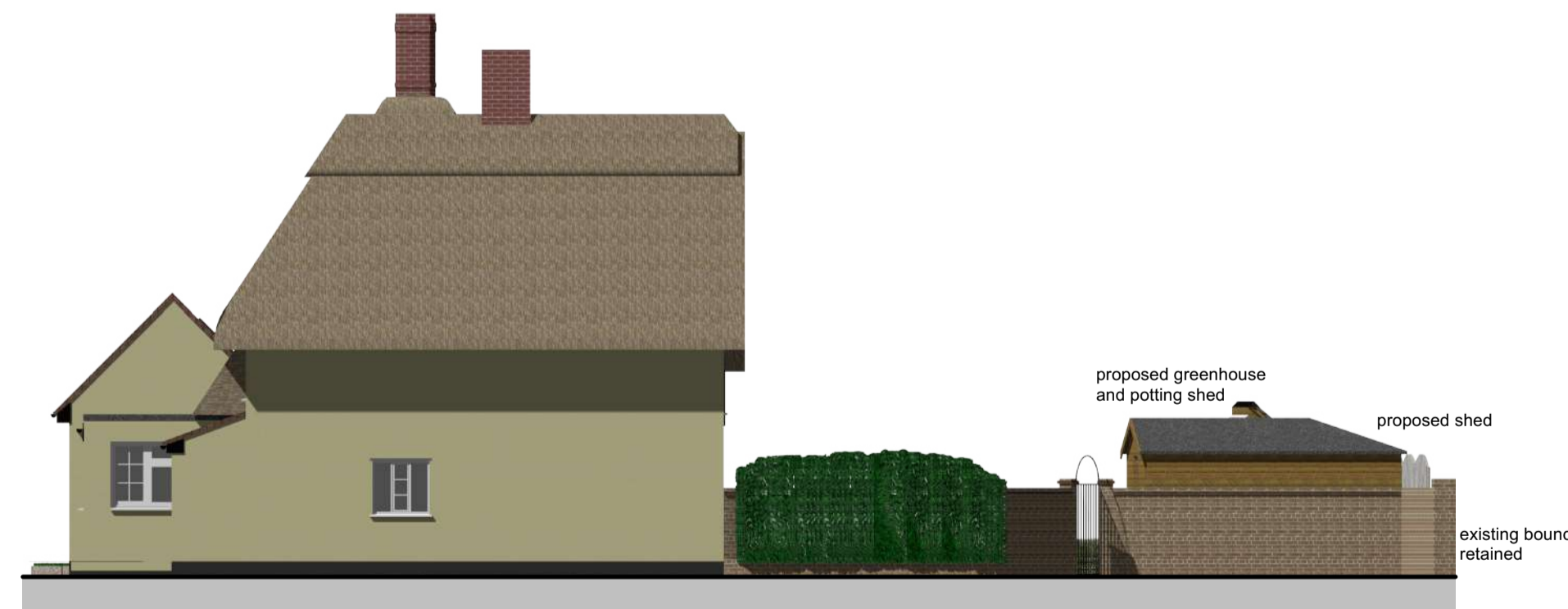
Proposed Front Elevation - within site context