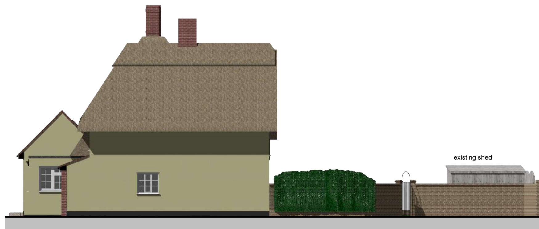
Existing Front Elevation - within site context