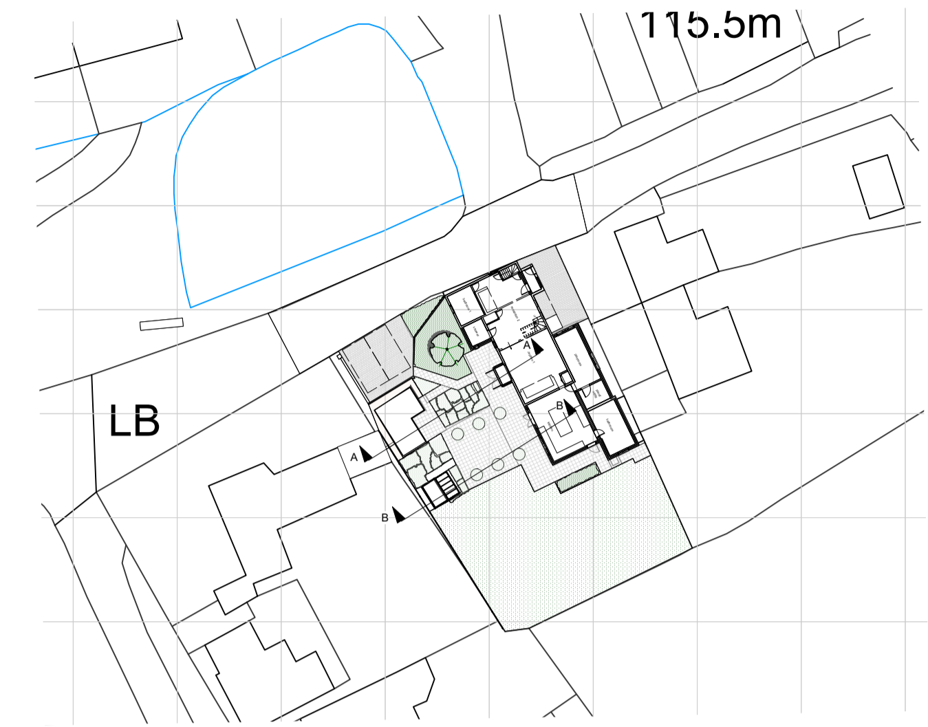
Site Plan - Key for Section Lines Scale 1:500