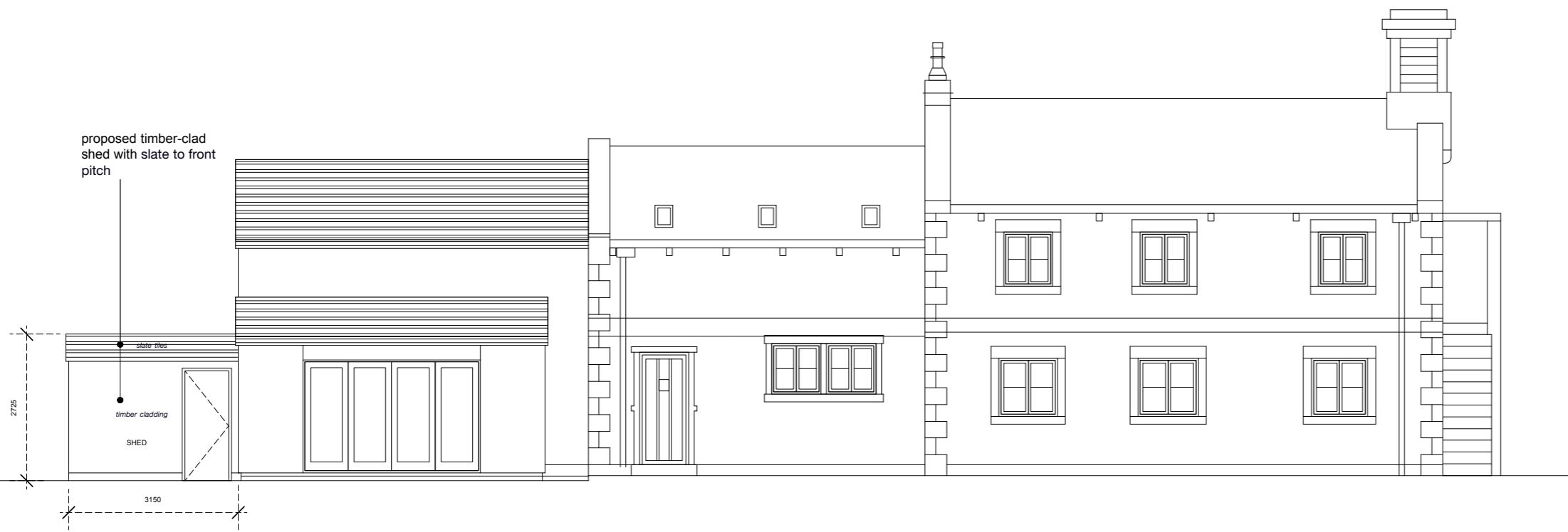
PRINCIPAL ELEVATION (W) Scale 1:100