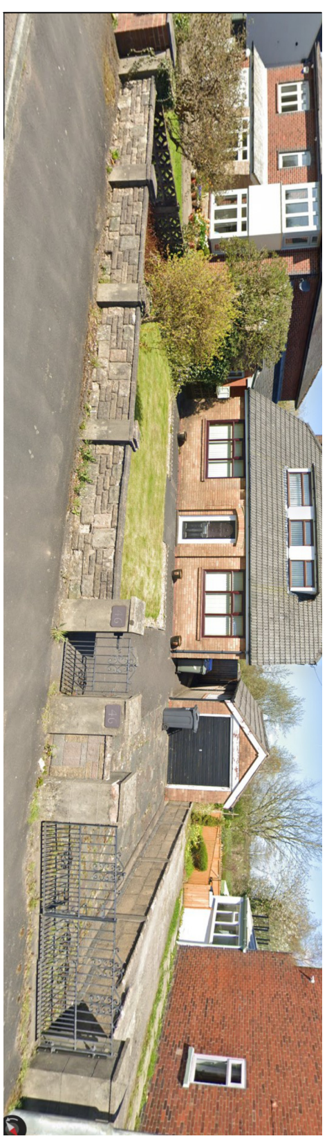
IMAGE OF EXISTING FRONT BOUNDARY WALL