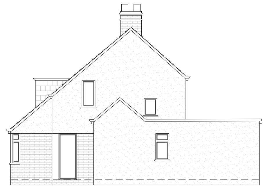
PROPOSED SIDE ELEVATION 1:100