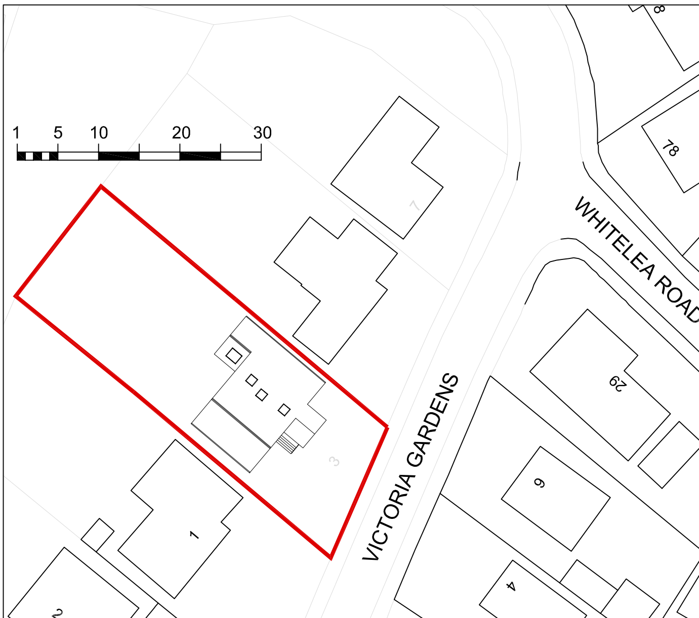
Block Plan as Proposed 1:500