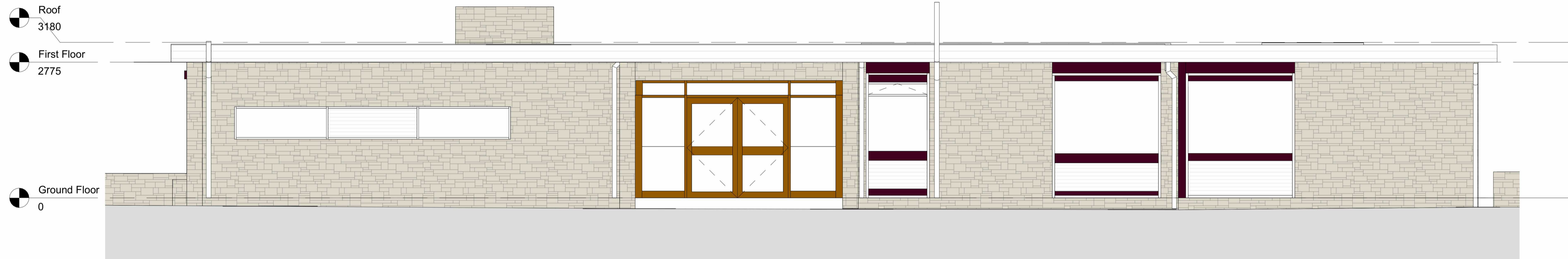
1 Existing North Elevation 1 : 50