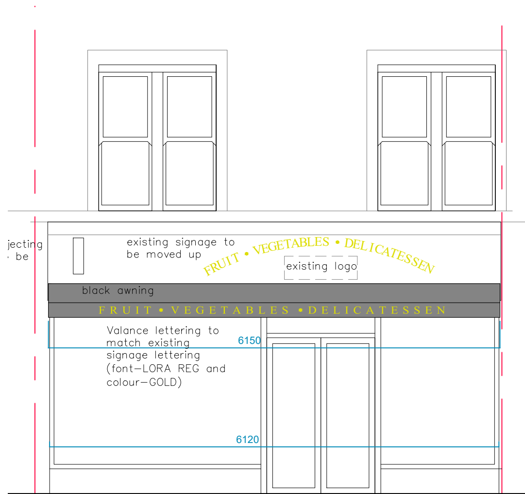
Proposed Front Elevation 1:50