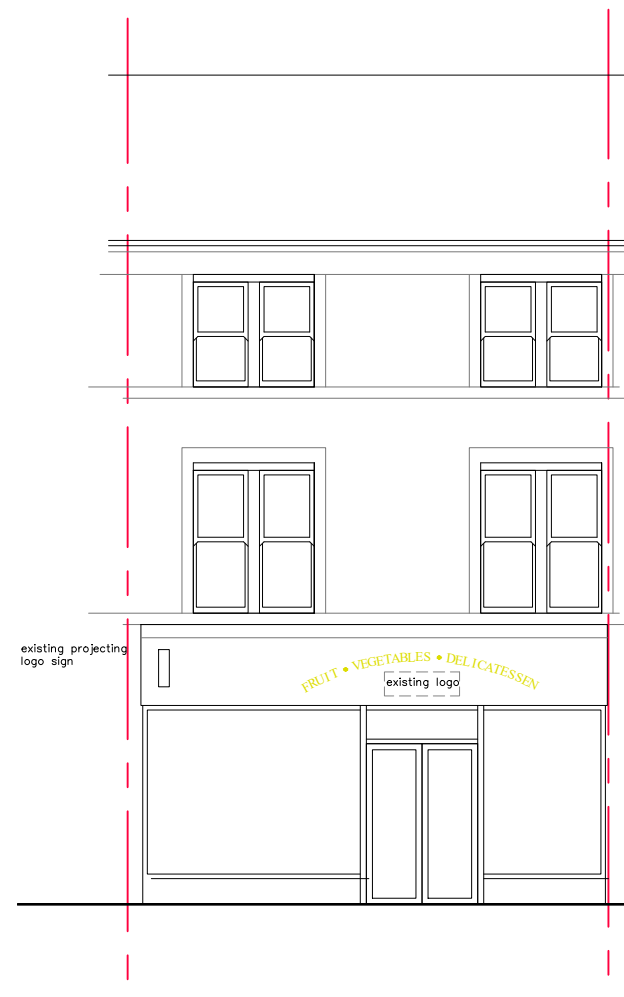
Existing Front Elevation 1:100