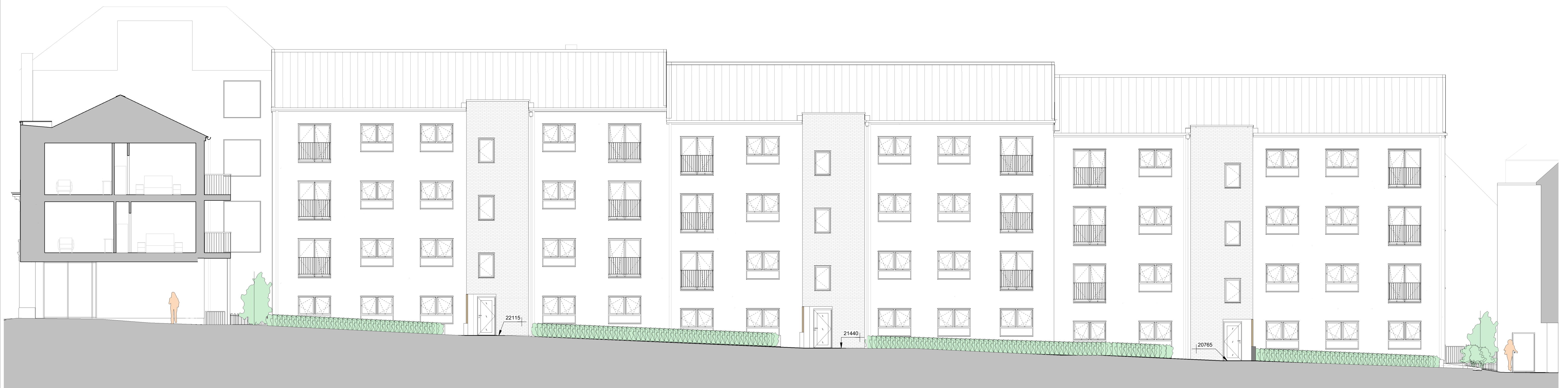
Section 8 - New Market Close Looking West 1 : 100