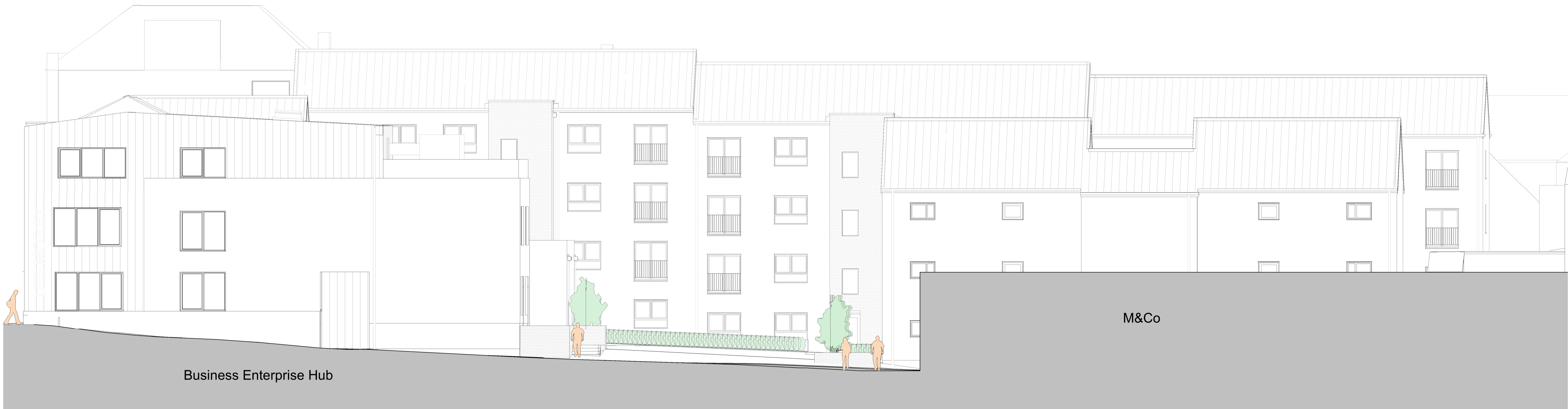
Elevation 2 - Service Lane and Plaza 1 : 100