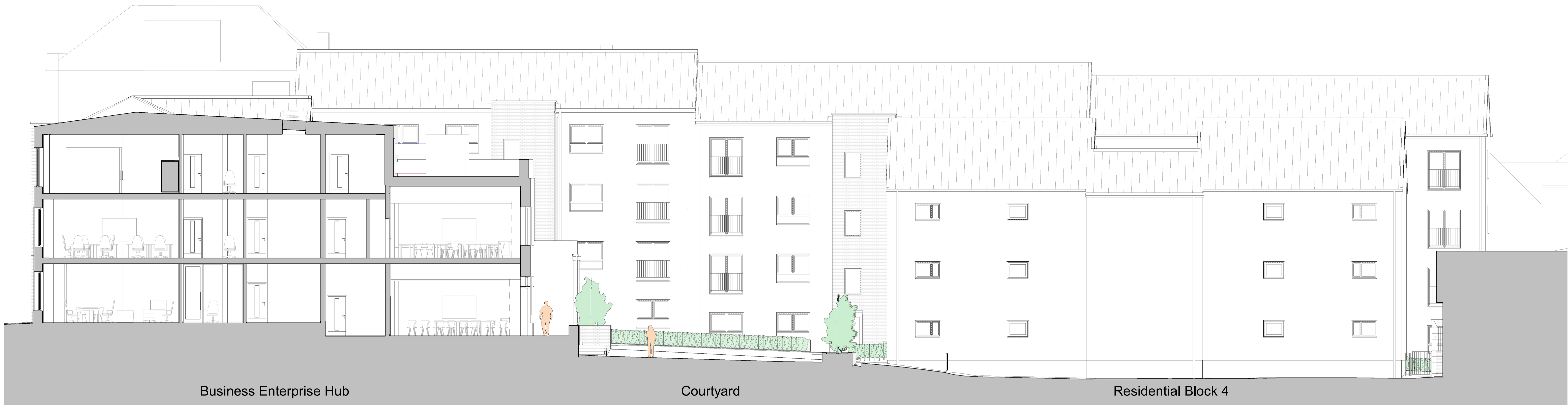
Section 2 - Looking West 1 : 100