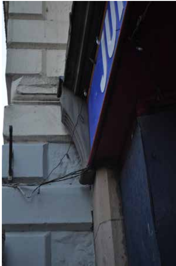
Plate 26: Building 1, detail of stone decoration on intersection of SSE facing elevation and adjoining building - upper detail, looking WSW