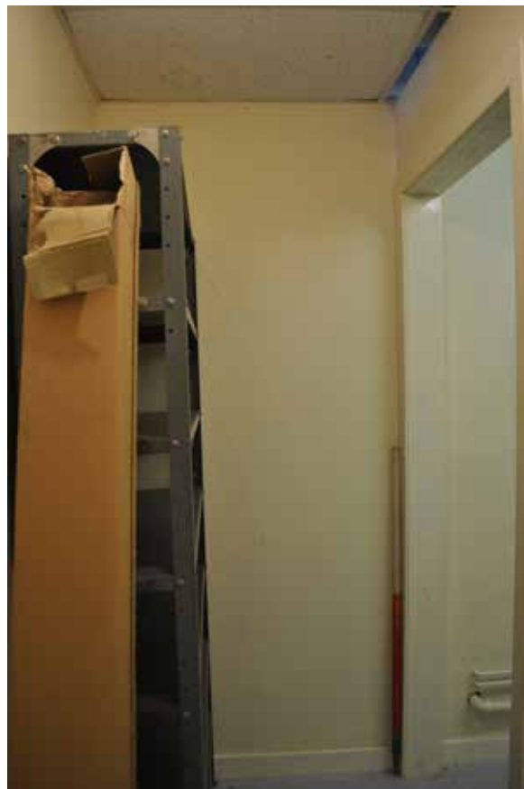
Plate 131: Building 3, general view of Room 1/6, looking WSW