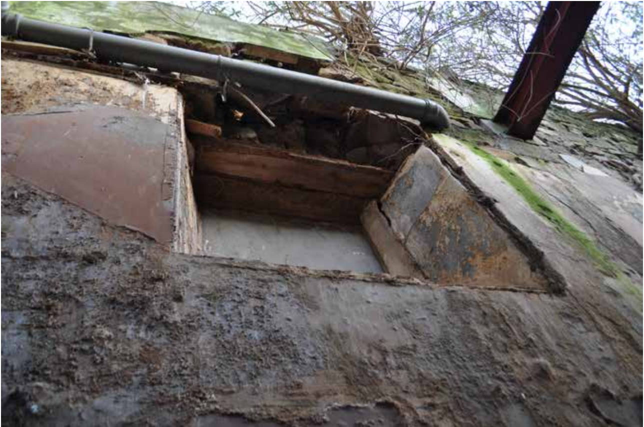
Plate 188: Building 4, Room 1/10, detailed view of south window on WSW facing wall, looking southeast