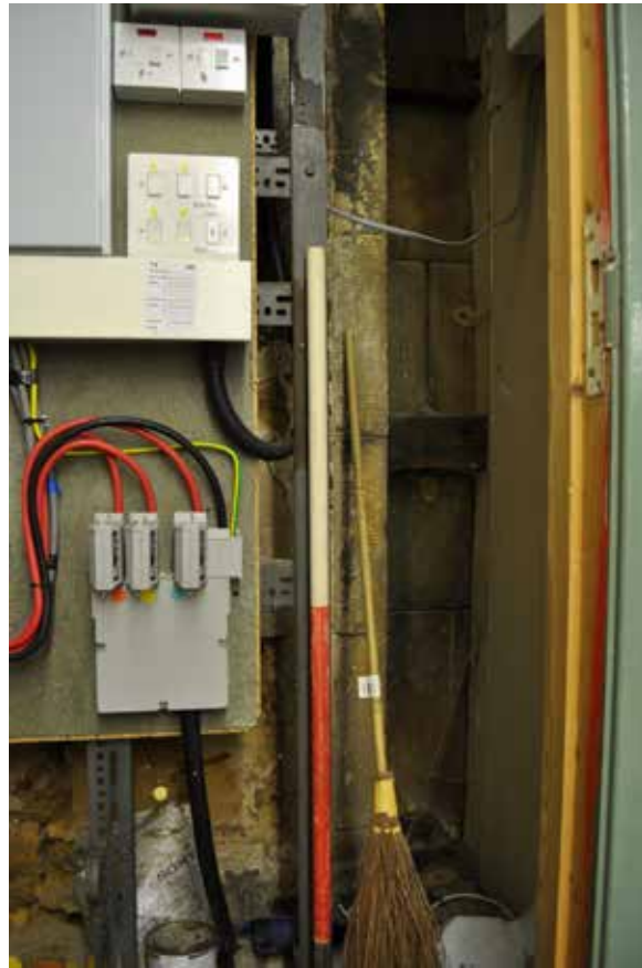
Plate 116: Building 3, detailed view of exposed stone in SW corner of Room 1/2, looking SSE