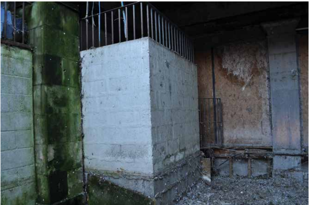
Plate 167: Building 4, general view of SE corner of Room 1/1, looking southeast