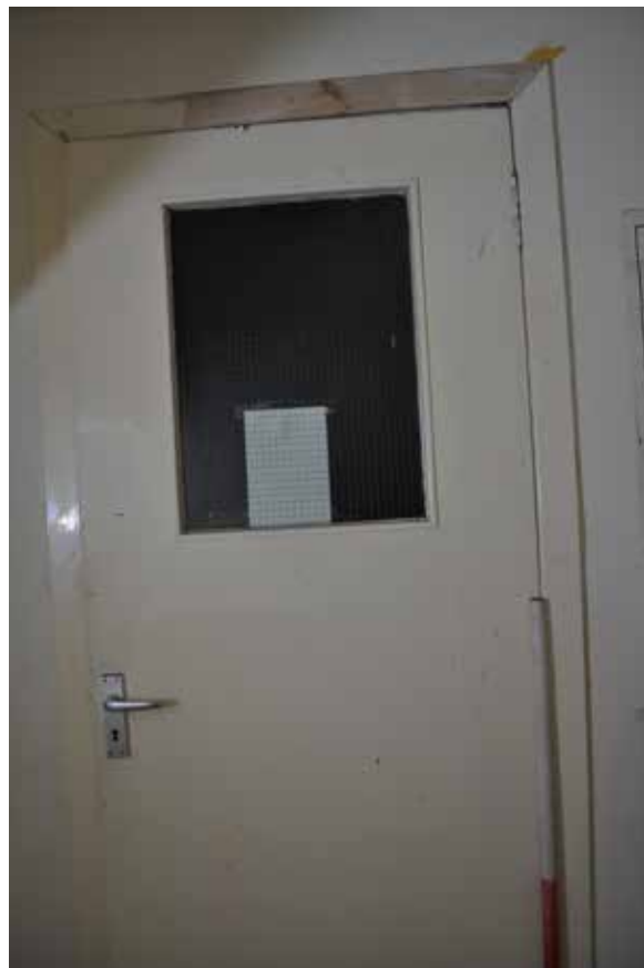
Plate 53: Building 1, Room 1/3, detailed view of door on NNW facing wall - upper detail, looking SSE