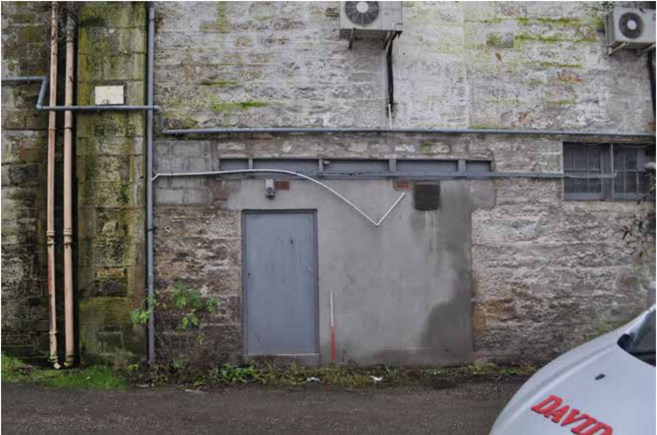
Plate 16: Building 1, general view of blocked openings (008) and (009) adjacent to modern fire exit on ENE facing elevation, looking WSW