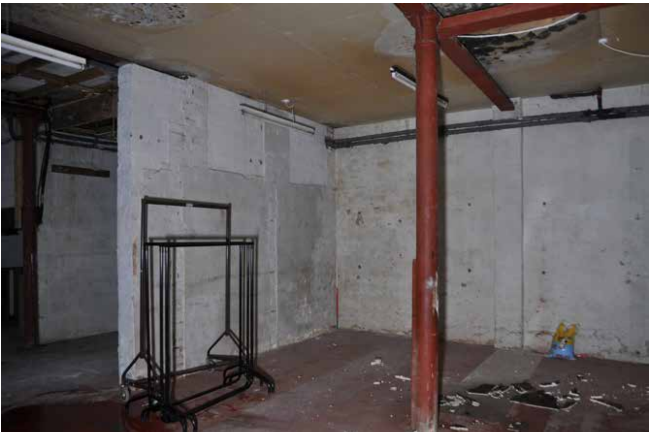
Plate 35: Building 1, Room 0/2, general view of northern area of ENE facing wall, looking southwest