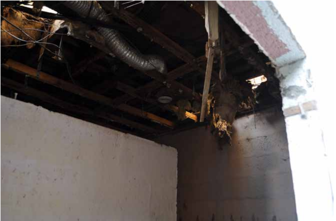
Plate 182: Building 4, Room 1/7, general view of SSE facing wall - upper detail, looking northwest