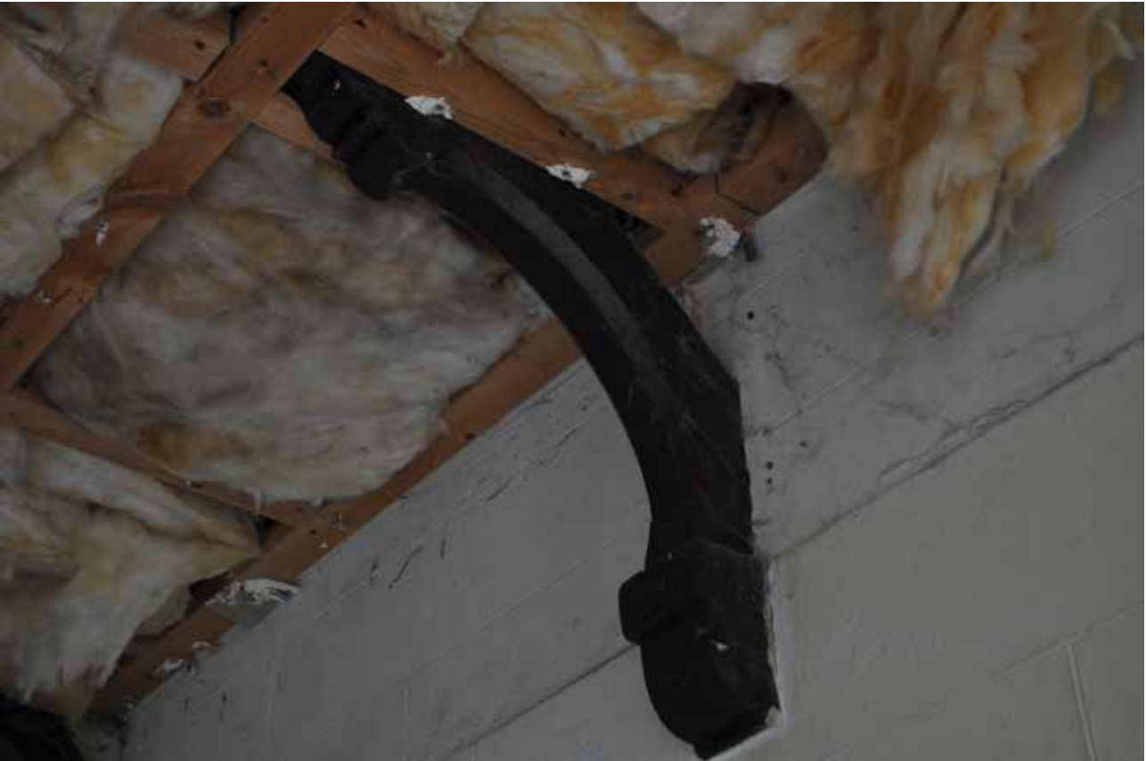
Plate 176: Building 4, Room 1/3, detailed view of timber corbel on SSE facing wall, looking northwest