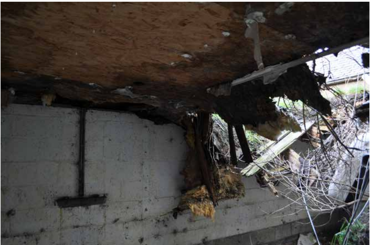
Plate 173: Building 4, Room 1/2, general view of ENE facing elevation, looking northwest