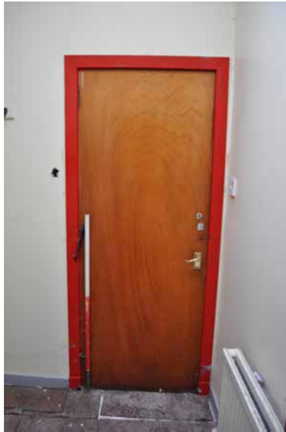
Plate 70: Building 1, Room 2/2, detailed view of door on WSW facing wall, looking ENE