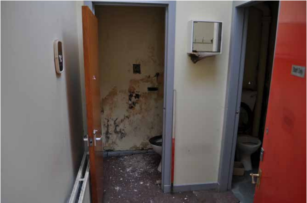
Plate 68: Building 1, Room 2/2, general view of ENE facing wall, looking WSW