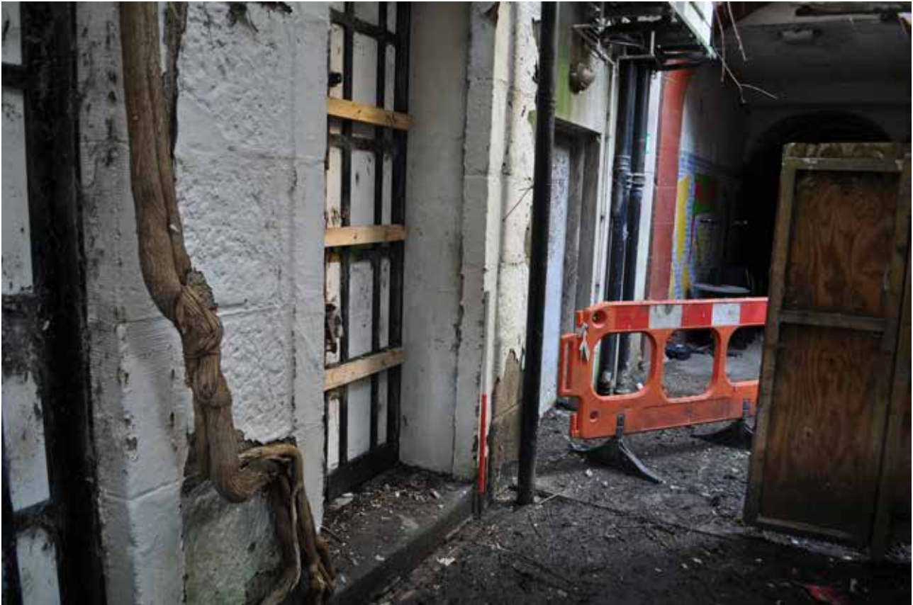
Plate 152: Building 4, general view of ENE facing elevation - north end, looking northwest