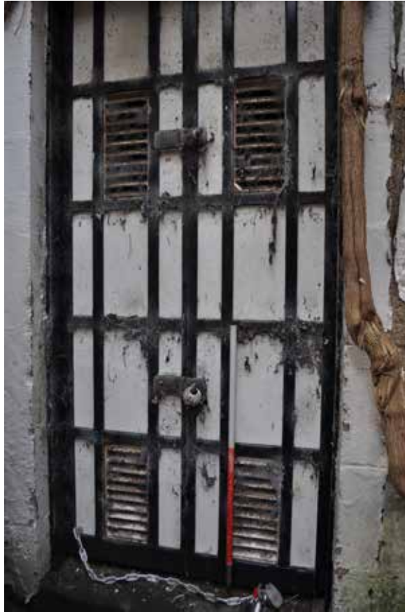
Plate 148: Building 4, detailed view of south door on ENE facing elevation , looking WSW