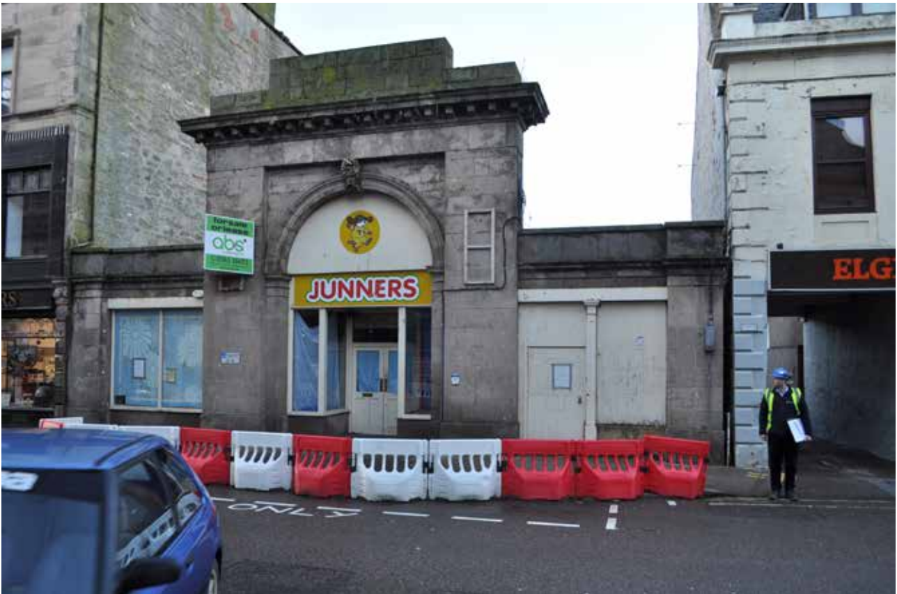
Plate 96: Building 3, general view of SSE facing elevation, looking NNW