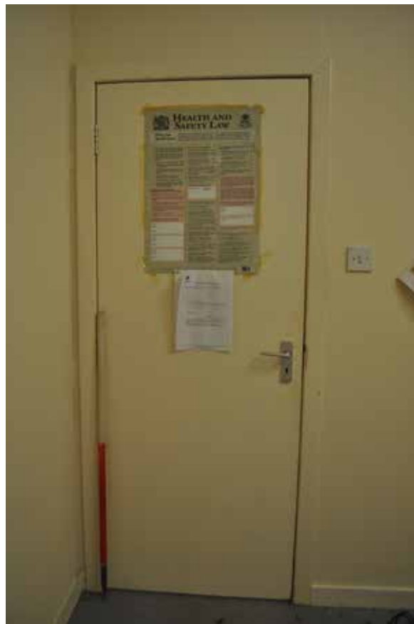
Plate 141: Building 3, Room 1/9, detailed view of door on NNW facing wall, looking SSE