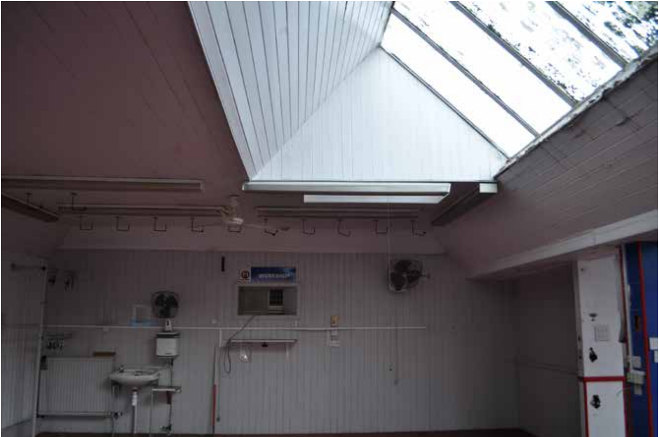
Plate 84: Building 1, Room 2/6, general view of SSE facing wall - upper detail, looking NNW