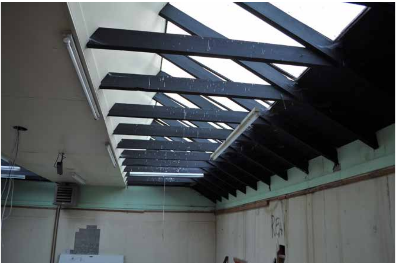
Plate 59: Building 1, Room 2/1, general view of exposed roof timbers and skylights running along SSE facing wall, looking WSW