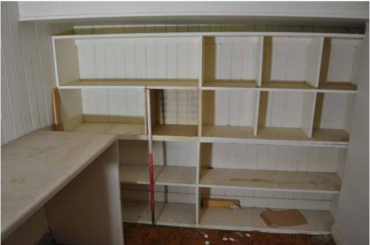
Plate 51: Building 1, Room 1/3, general view of WSW facing wall - lower detail, looking ENE