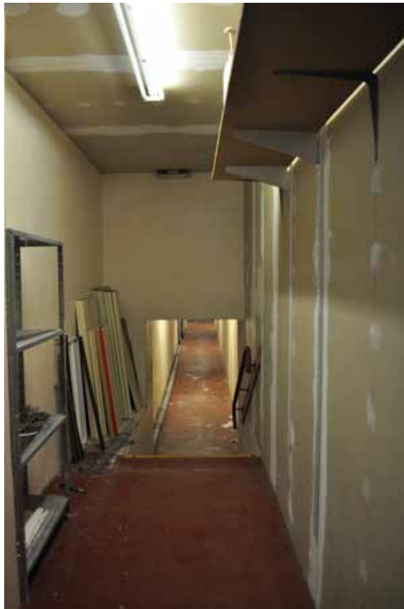
Plate 127: Building 3, general view of Room 1/4 , looking SSE