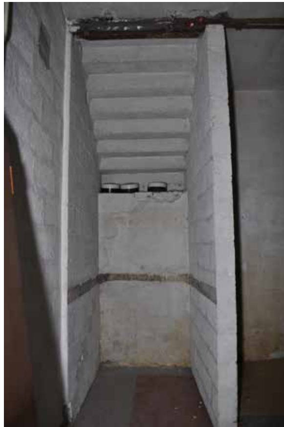
Plate 37: Building 1, Room 0/3, general view of under stair detail on NNW facing wall, looking SSE