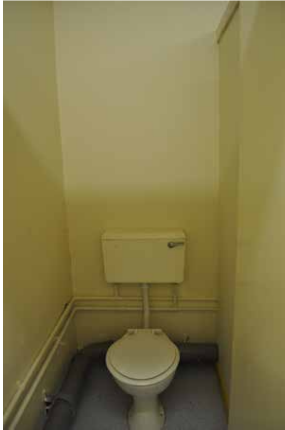
Plate 134: Building 3, Room 1/7, general view of WSW facing wall - north end, looking ENE