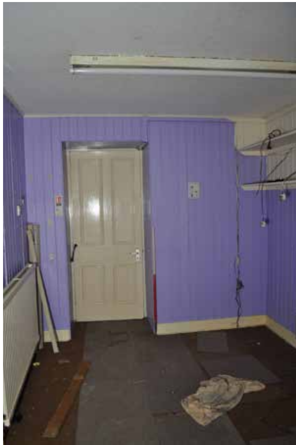
Plate 49: Building 1, Room 1/2, general view of NNW facing wall, looking SSE