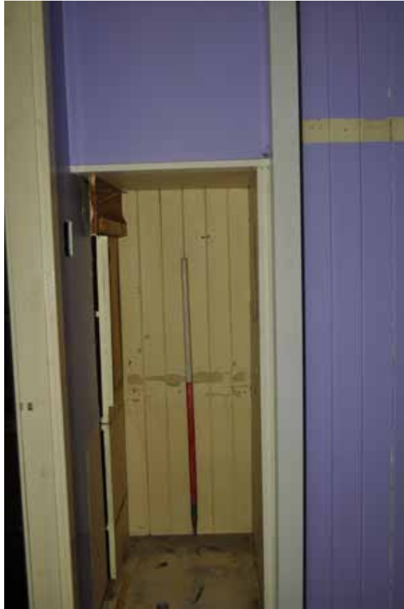
Plate 50: Building 1, Room 1/2, detailed view of recess on WSW facing wall, looking ENE