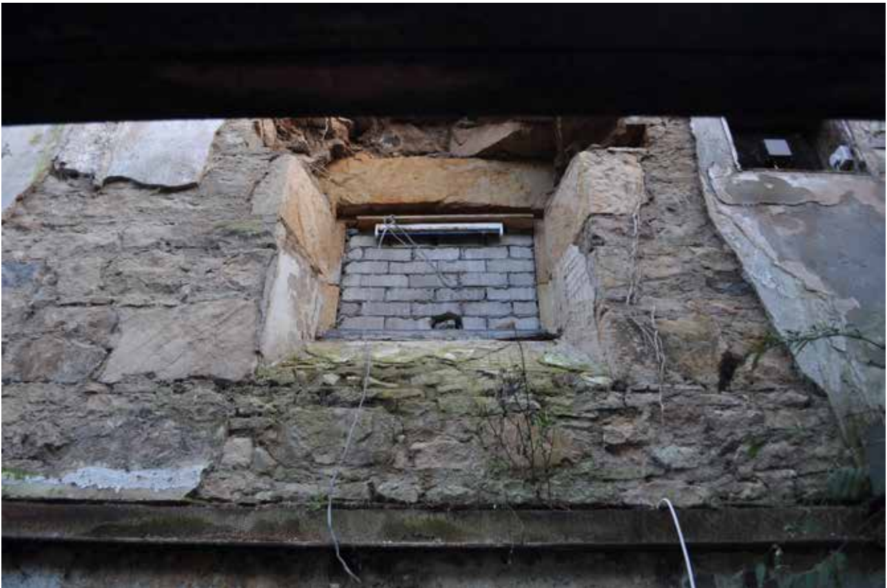
Plate 195: Building 4, Room 1/14, detailed view of window on WSW facing wall, looking ENE