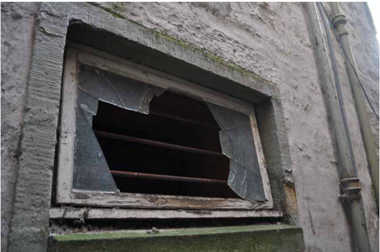
Plate 213: Building 5, detail view of lower window on NNW facing elevation of east building, looking southwest