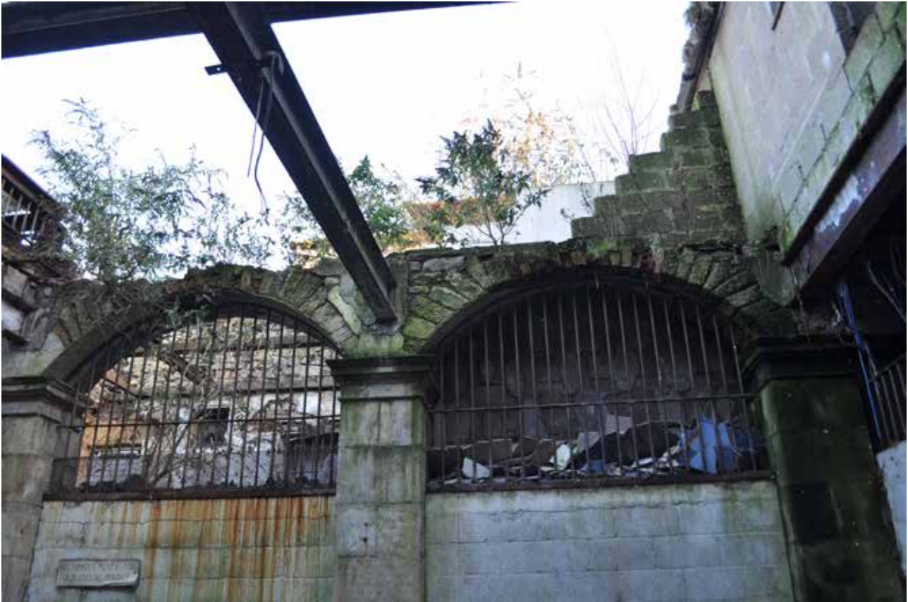
Plate 168: Building 4, Room 1/1, general view of arches in front of Rooms 1/14 and 1/15 - upper detail, looking ENE