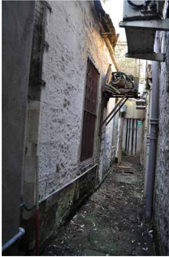
Plate 208: Building 5, general view of NNW facing elevation, looking west