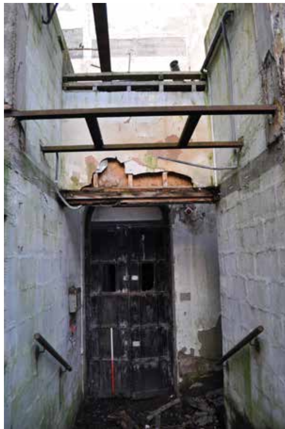
Plate 185: Building 4, Room 1/9, general view of SSE facing wall - upper detail, looking NNW