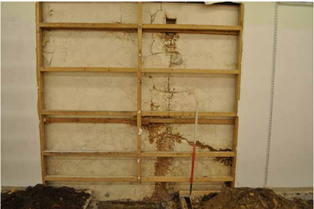
Plate 113: Building 3, Room 1/1, detail of exposed pipe located on ENE facing wall, looking WSW