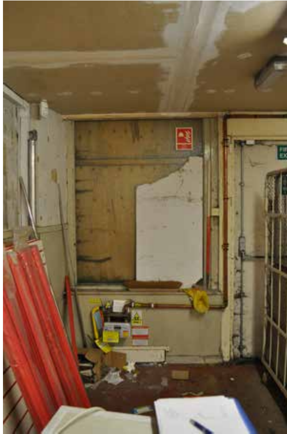
Plate 118: Building 3, Room 1/3, detailed view of window on NNW facing wall, looking SSE