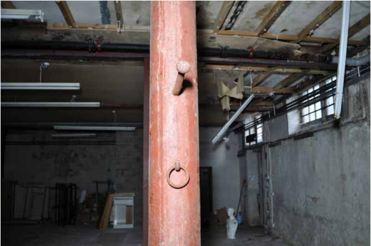
Plate 34: Building 1, Room 0/2, detailed view of fixtures on cast iron column, looking NNW