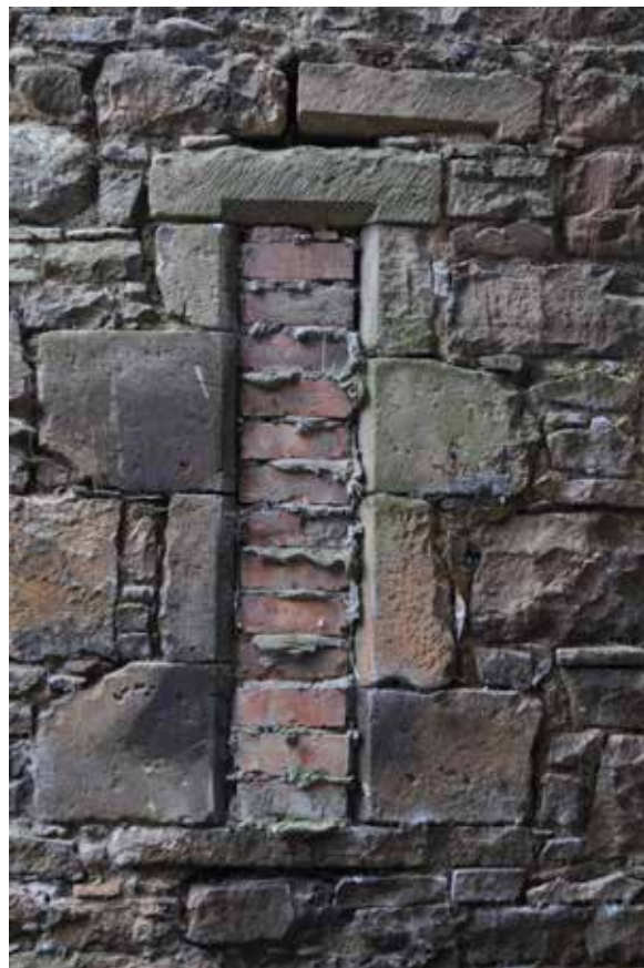
Plate 221: Building 5, detailed view of lower blocked opening on ENE facing elevation, looking WSW