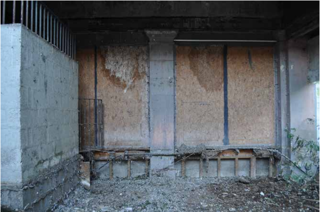
Plate 166: Building 4, Room 1/1, general view of NNW facing wall, looking SSE