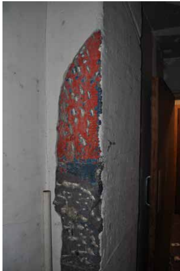
Plate 125: Building 3, Room 1/3, detail of toolmarks on exposed stonework on ENE facing wall of lower corridor, looking north