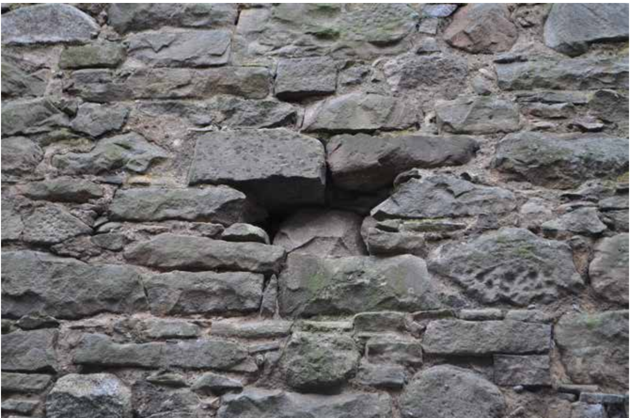
Plate 219: Building 5, detailed view of upper central opening on ENE facing elevation, looking WSW