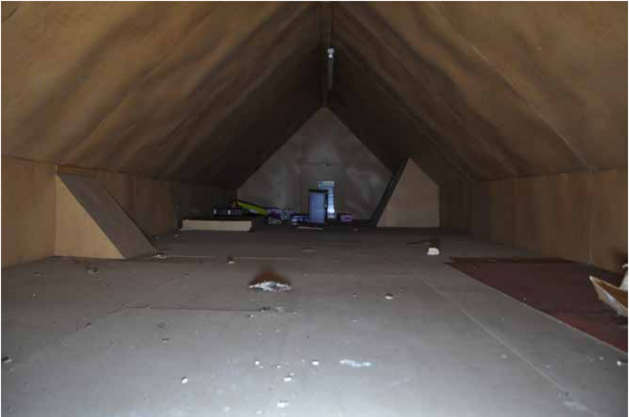
Plate 92: Building 1, Room 3/1, general view of roof space, looking NNW