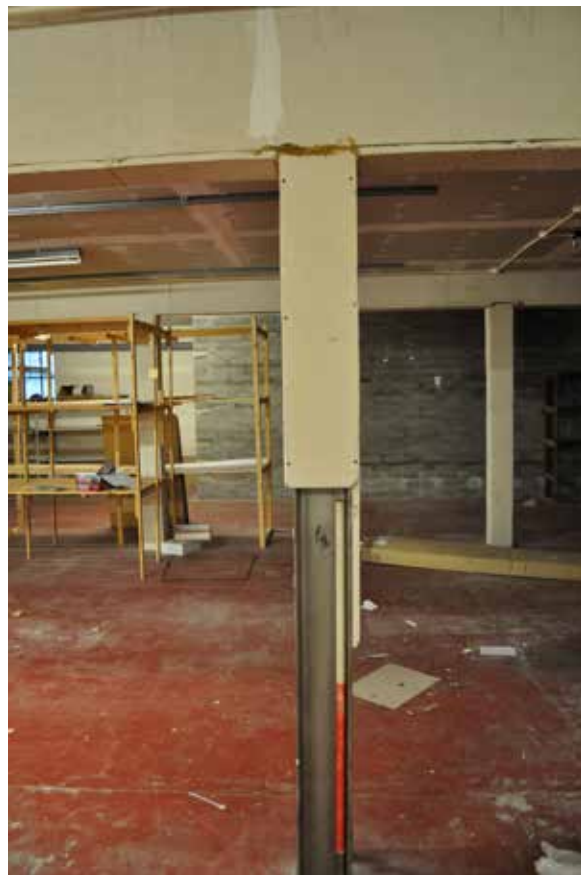
Plate 105: Building 3, Room 0/2, detailed view of exposed steel column, looking ENE