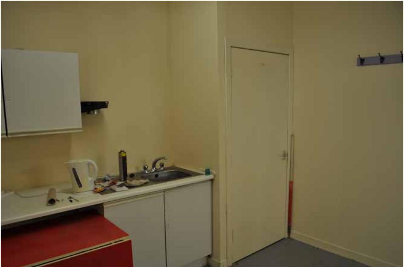
Plate 140: Building 3, general view of NE corner of Room 1/9 - lower detail, looking northeast