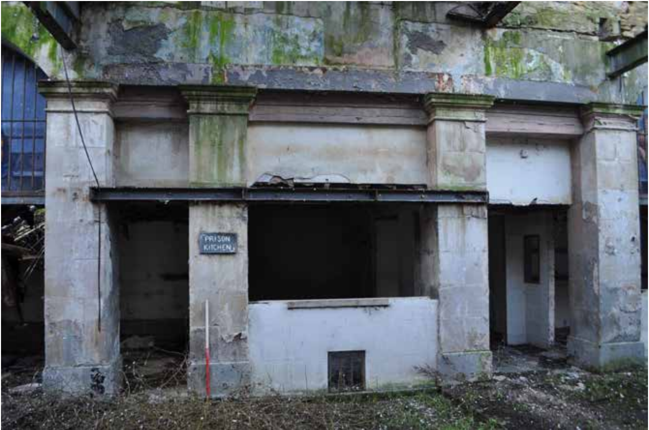
Plate 162: Building 4, Room 1/1, general view of ENE facing wall showing entrances to Rooms 1/2, 1/3 and 1/4, looking WSW