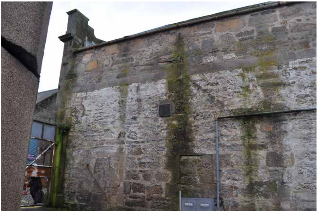
Plate 11: Building 1, general view of southeast corner on ENE facing elevation - upper detail, looking south