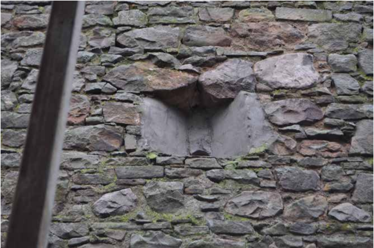
Plate 218: Building 5, detailed view of upper southern opening on ENE facing elevation, looking WSW