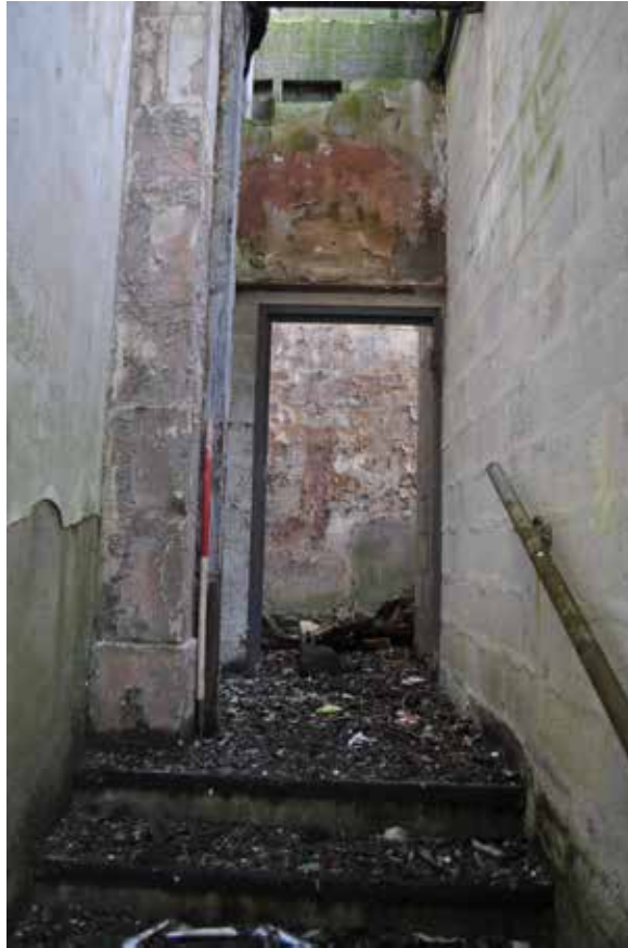
Plate 186: Building 4, Room 1/9, general view of WSW facing wall - lower detail, looking ENE