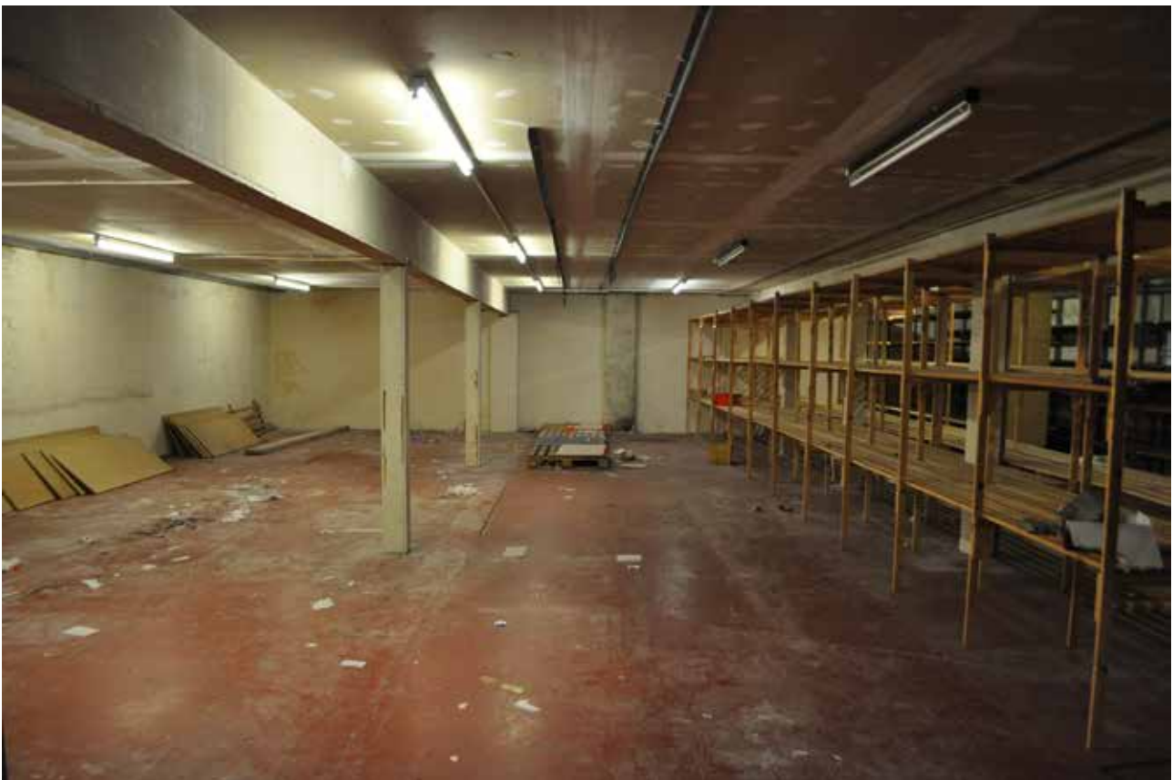
Plate 101: Building 3, Room 0/2, general view of SSE facing wall, looking NNW