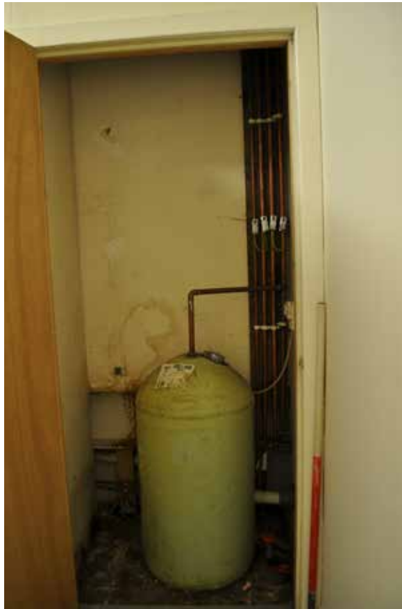
Plate 142: Building 3, Room 1/10, general view of SSE facing wall, looking NNW