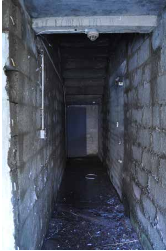
Plate 200: Building 4, general view of Room 1/16, looking SSE