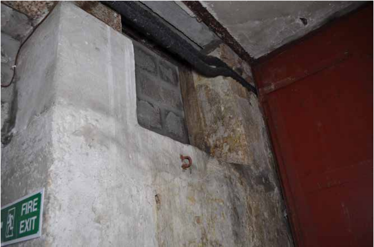
Plate 28: Building 1, Room 0/1, detailed view of window on WSW facing wall - (008), looking southeast