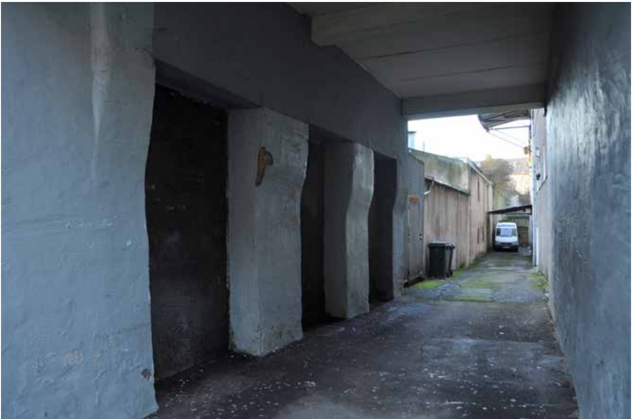
Plate 99: Building 3, general view of NNW facing elevation, looking northwest