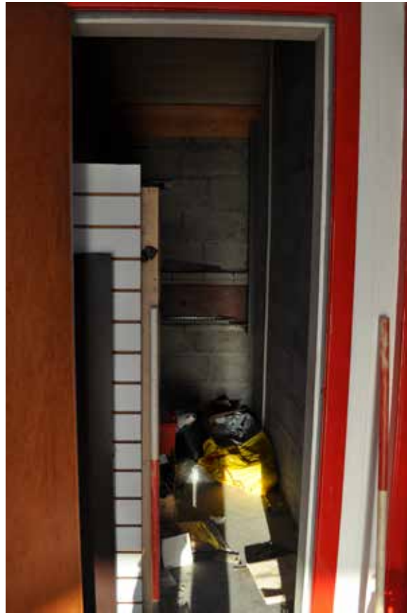
Plate 88: Building 1, general view of Room 2/7 looking towards SSE facing wall, looking NNW