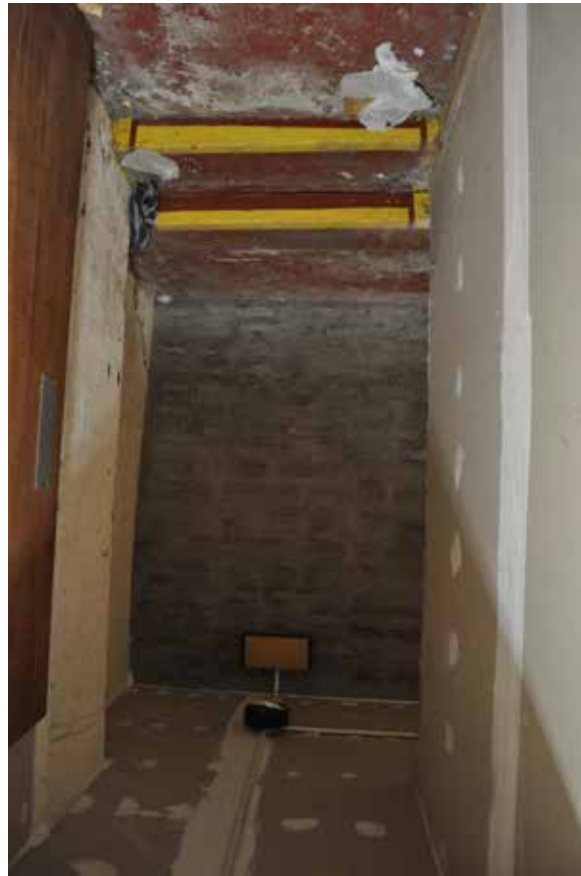
Plate 100: Building 3, general view of Room 0/1, looking SSE