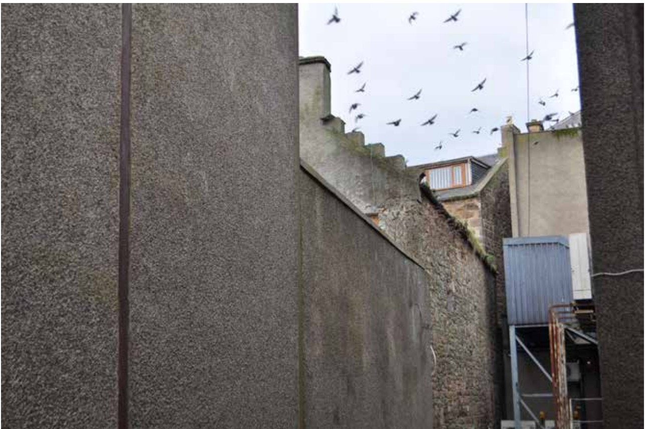
Plate 217: Building 5, general view of interface between SSE and ENE facing elevations, looking northwest