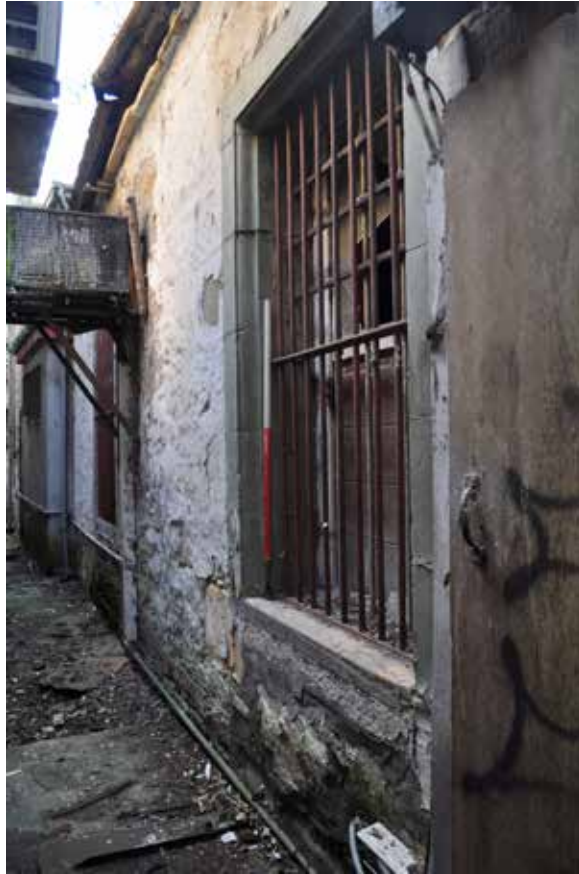
Plate 206: Building 5, detailed view of west window on NNW facing elevation - oblique, looking east