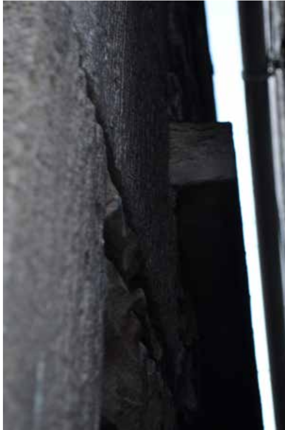
Plate 98: Building 3, detailed view of projecting stonework between buildings, looking NNW