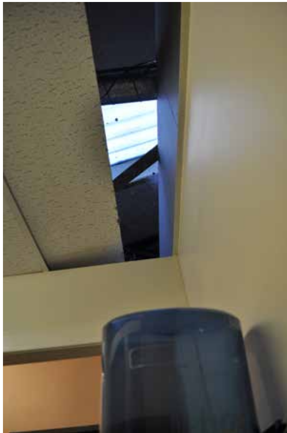
Plate 135: Building 3, Room 1/7, general view of skylight visible through removed tiles, looking SSE