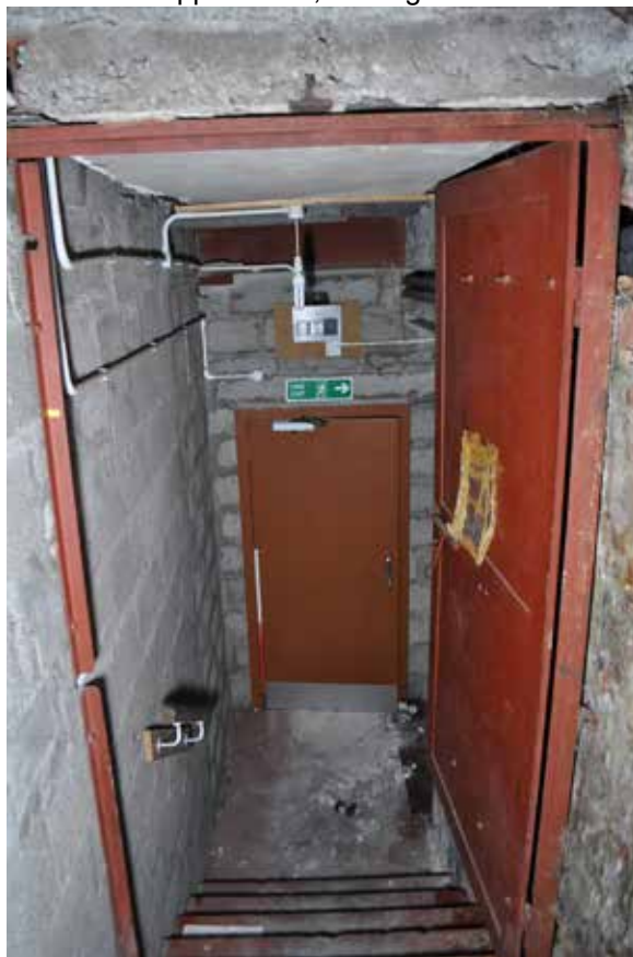
Plate 27: Building 1, Room 0/1, general view of SSE facing wall, looking NNW