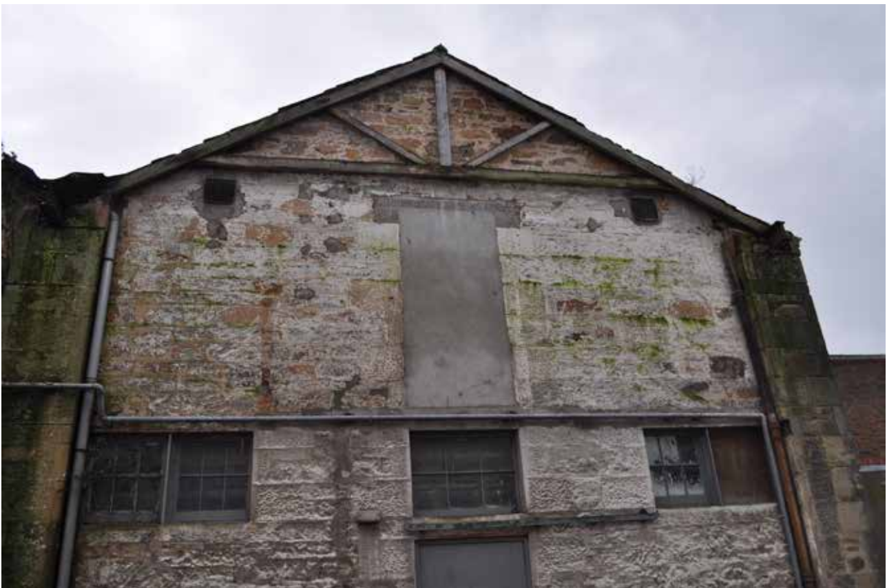
Plate 21: Building 1, general view of north gable on ENE facing elevation - upper detail, looking WSW