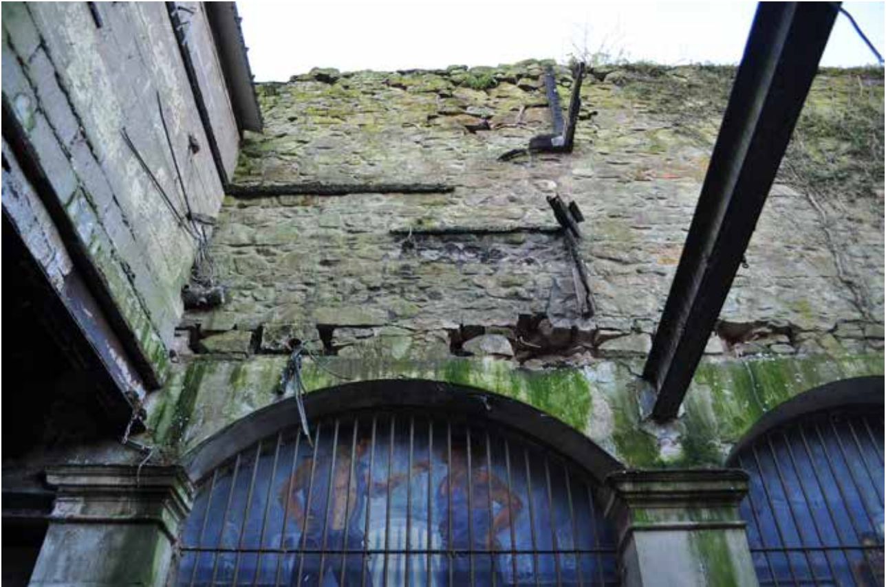
Plate 164: Building 4, Room 1/1, detailed view of floor remnants in southwest corner of Room 1/2 - upper floor area, looking WSW