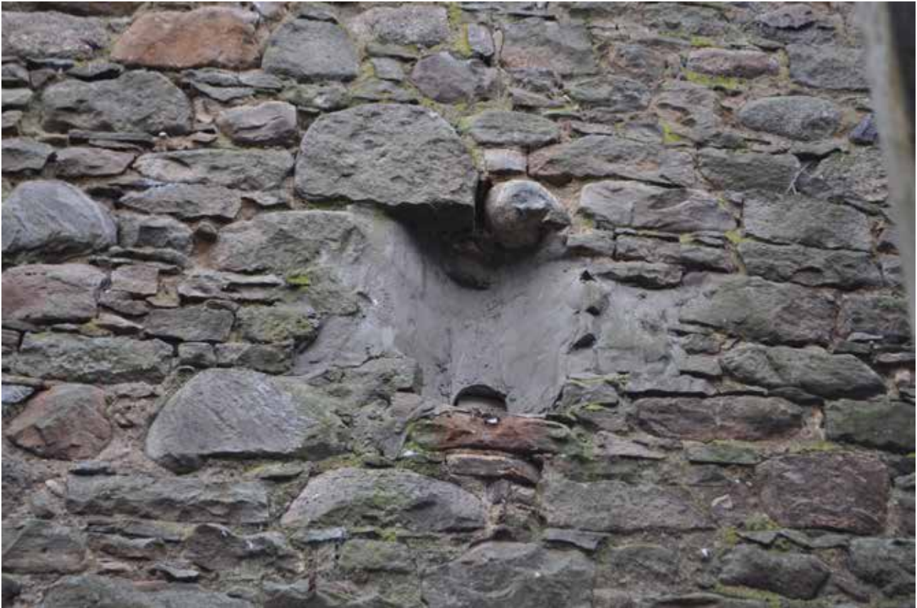
Plate 220: Building 5, detailed view of upper northern opening on ENE facing elevation, looking WSW