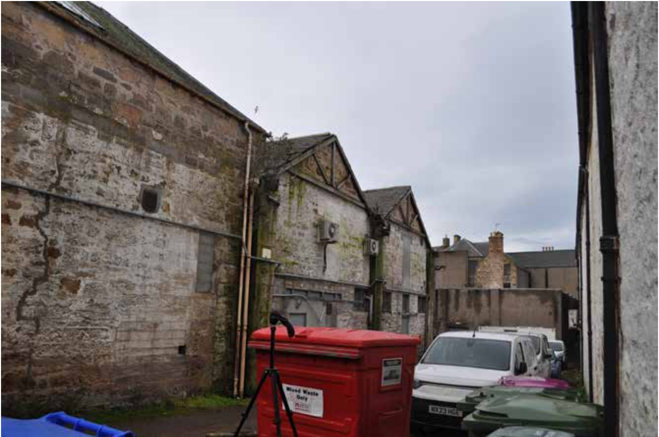
Plate 14: Building 1, general view of northeast corner on ENE facing elevation, looking north