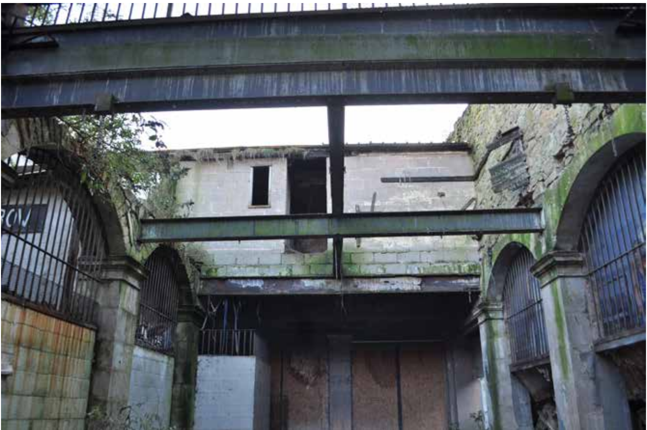
Plate 171: Building 4, Room 1/1, general view of NNW facing wall - upper detail, looking SSE