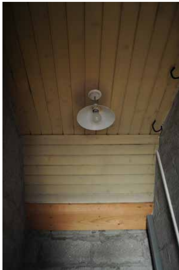
Plate 89: Building 1, general view of Room 2/7 looking towards SSE facing wall - upper detail, looking NNW