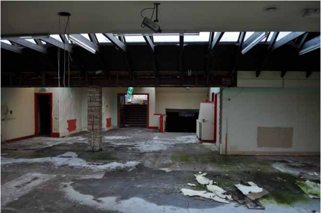
Plate 62: Building 1, Room 2/1, general view of NNW facing wall, looking SSE