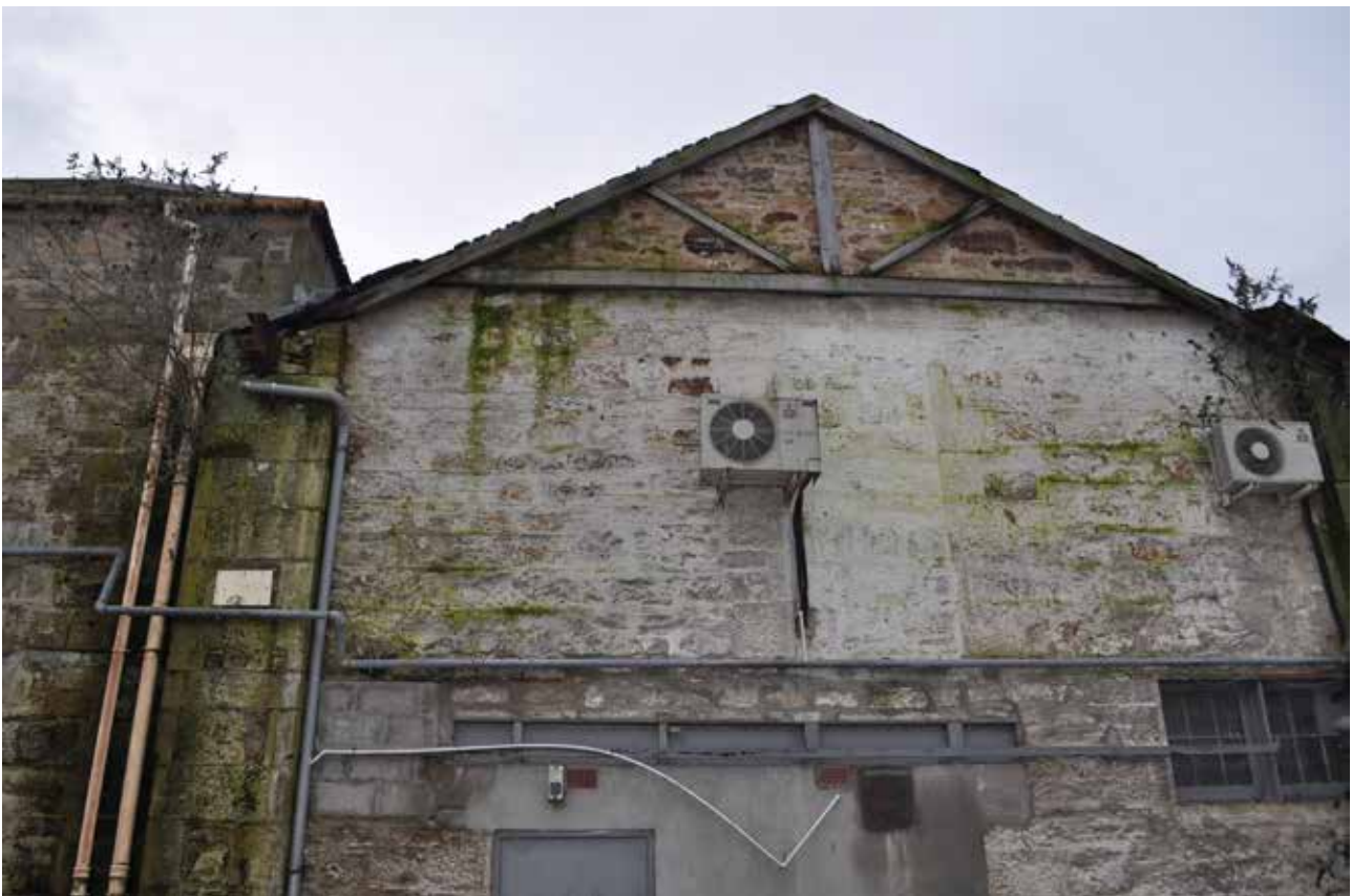
Plate 17: Building 1, general view of timber detail of south gable on ENE facing elevation, looking WSW