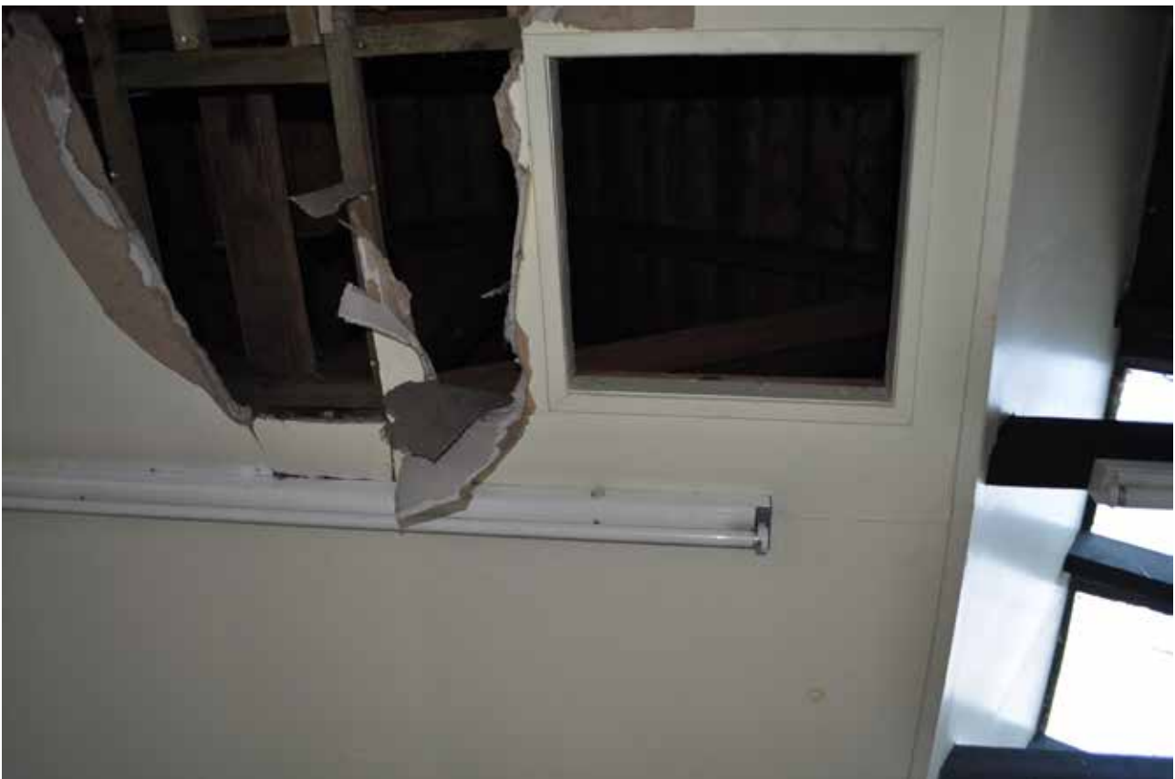
Plate 61: Building 1, Room 2/1, general view of exposed roof timbers, looking WSW