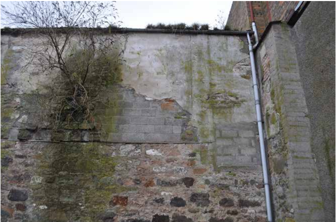
Plate 9: Building 1, detail view of upper stonework on northwest corner of NNW facing elevation, looking SSE