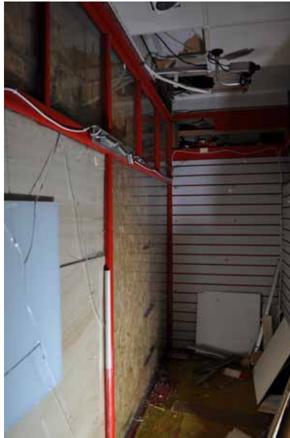
Plate 44: Building 1, Room 1/1, detailed view of display windows on NNW facing section - west end, looking southwest