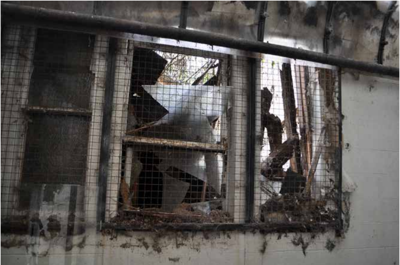
Plate 202: Building 5, detailed view of windows on WSW facing elevation, looking ENE