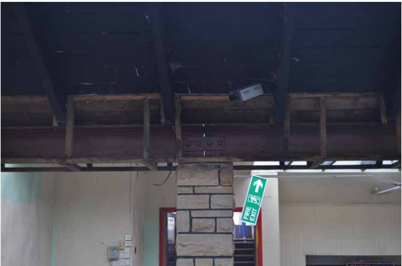
Plate 63: Building 1, Room 2/1, detailed view of stone clad column - upper detail, looking SSE