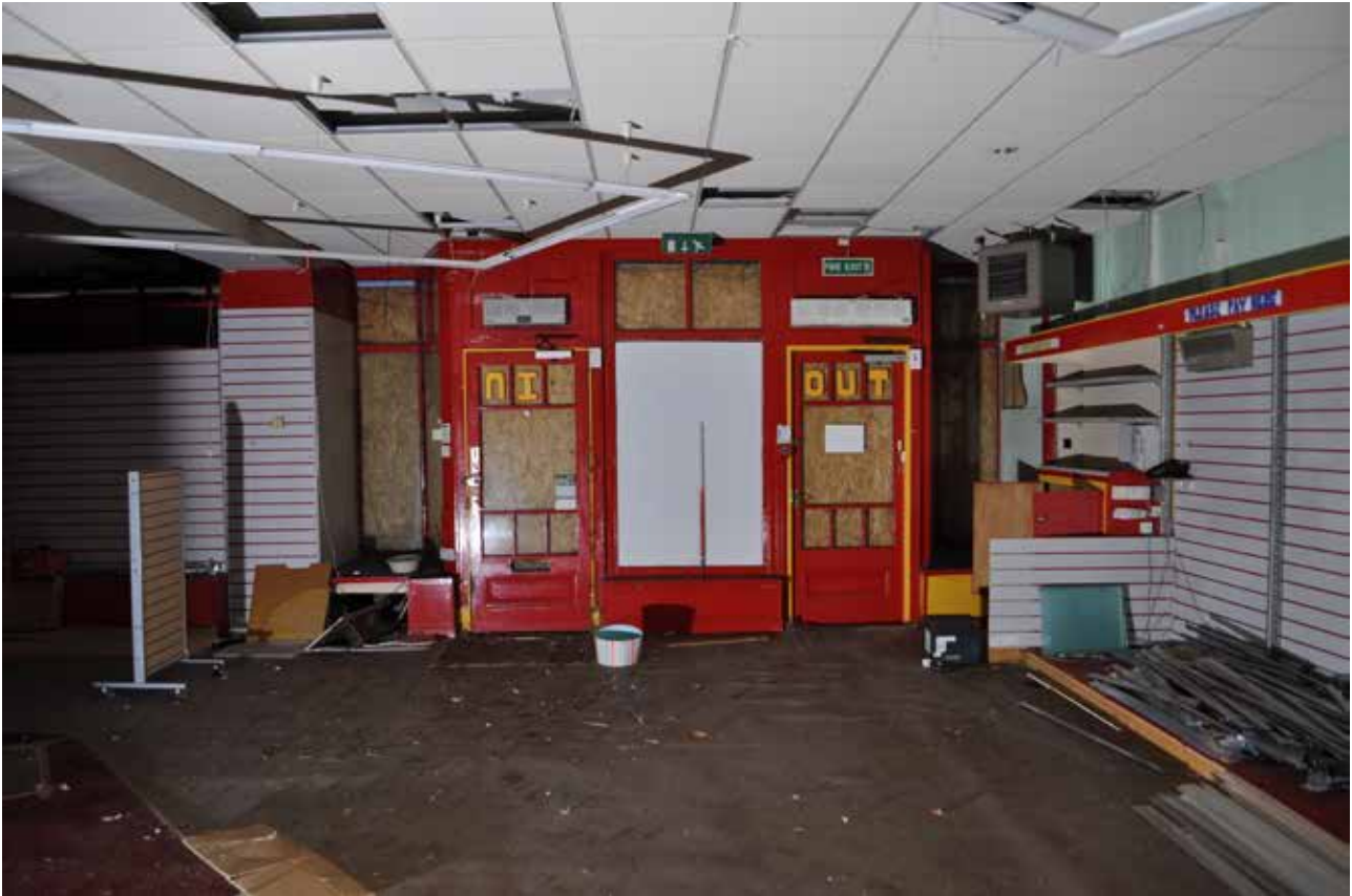
Plate 42: Building 1, Room 1/1, general view of NNW facing wall - west end, looking SSE