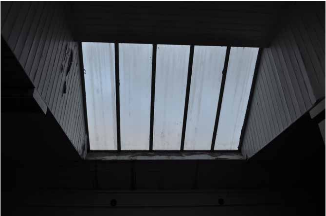
Plate 83: Building 1, Room 2/6, detailed view of central skylight - east, looking ENE