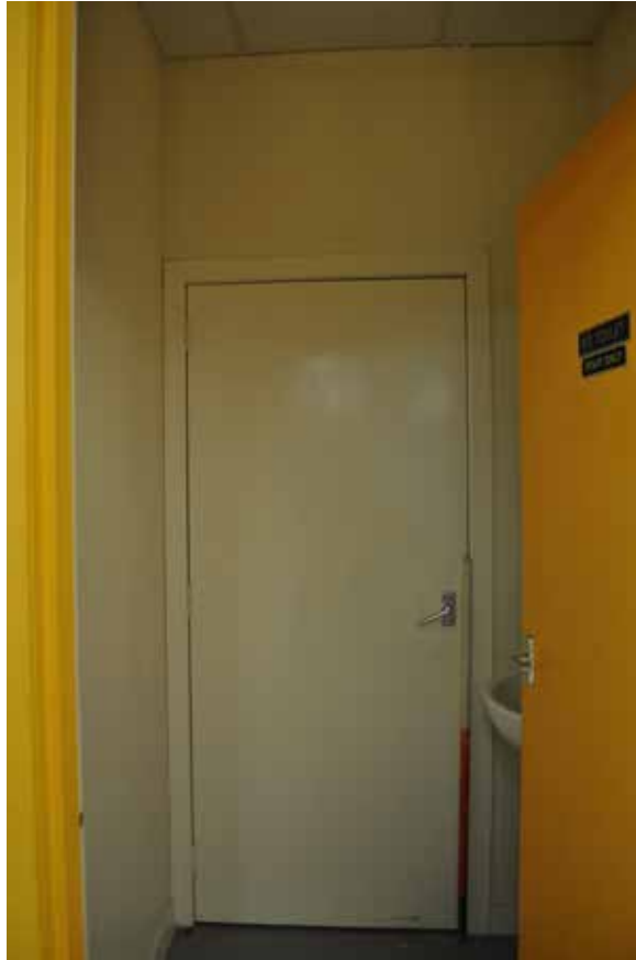
Plate 136: Building 3, Room 1/8, general view of SSE facing wall of toilet, looking NNW