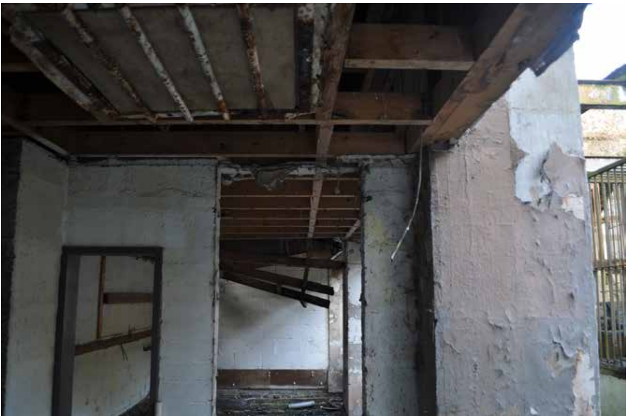
Plate 179: Building 4, Room 1/4, general view of opening leading to Room 1/5 on SSE facing wall - upper detail, looking NNW