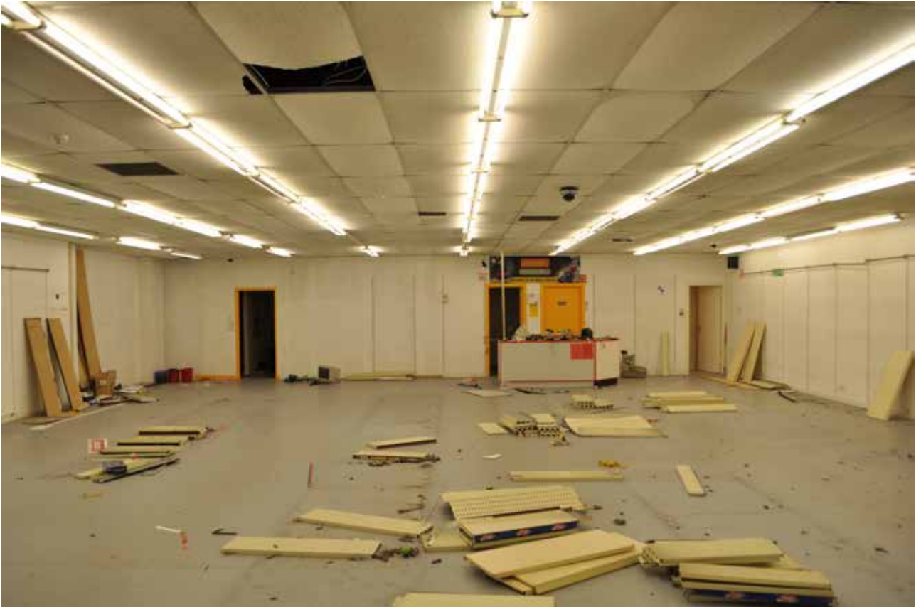
Plate 130: Building 3, Room 1/5, general view of SSE facing wall, looking NNW