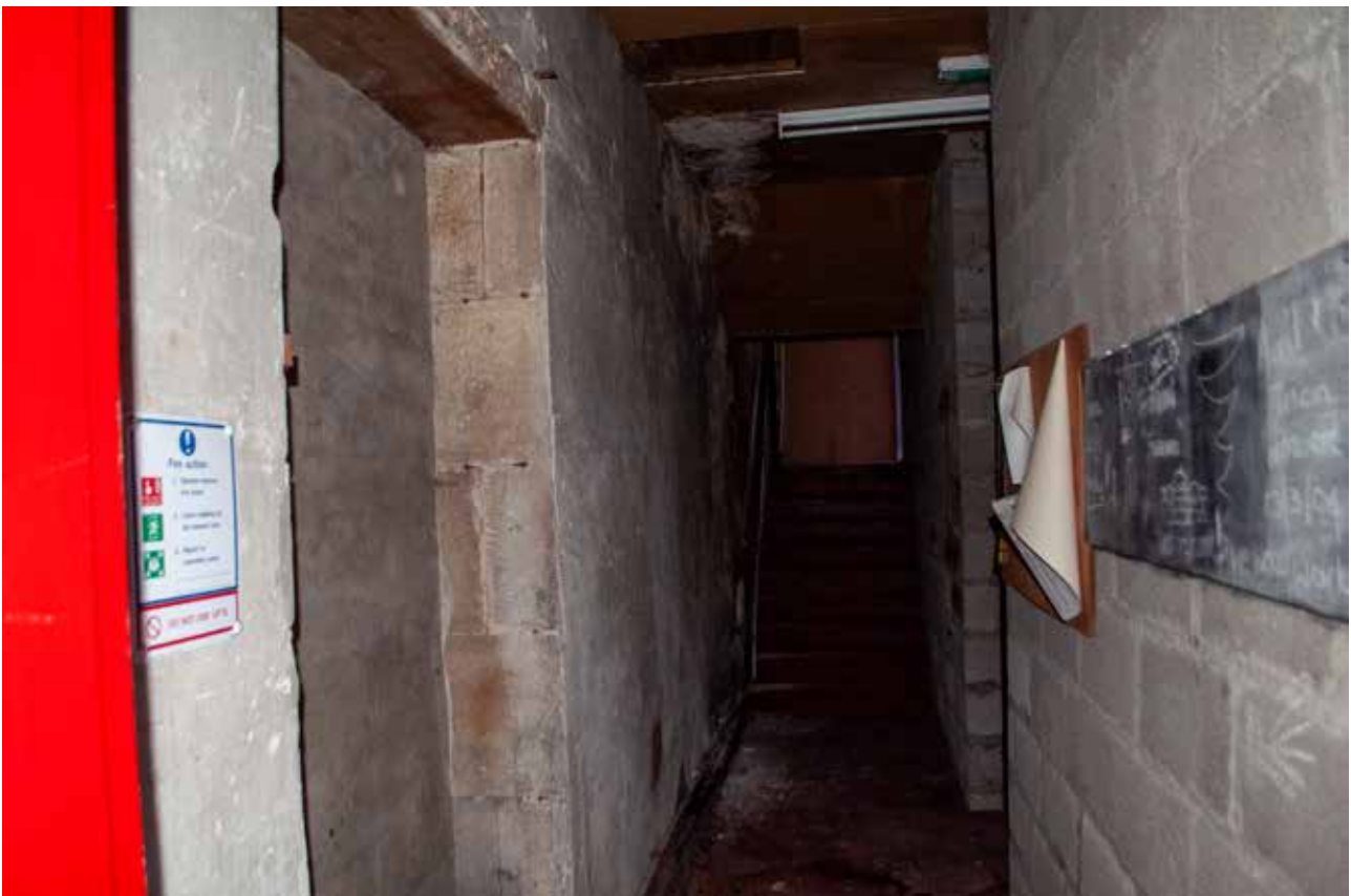
Plate 75: Building 1, general view of Room 2/5 looking towards NNW facing wall, looking SSE