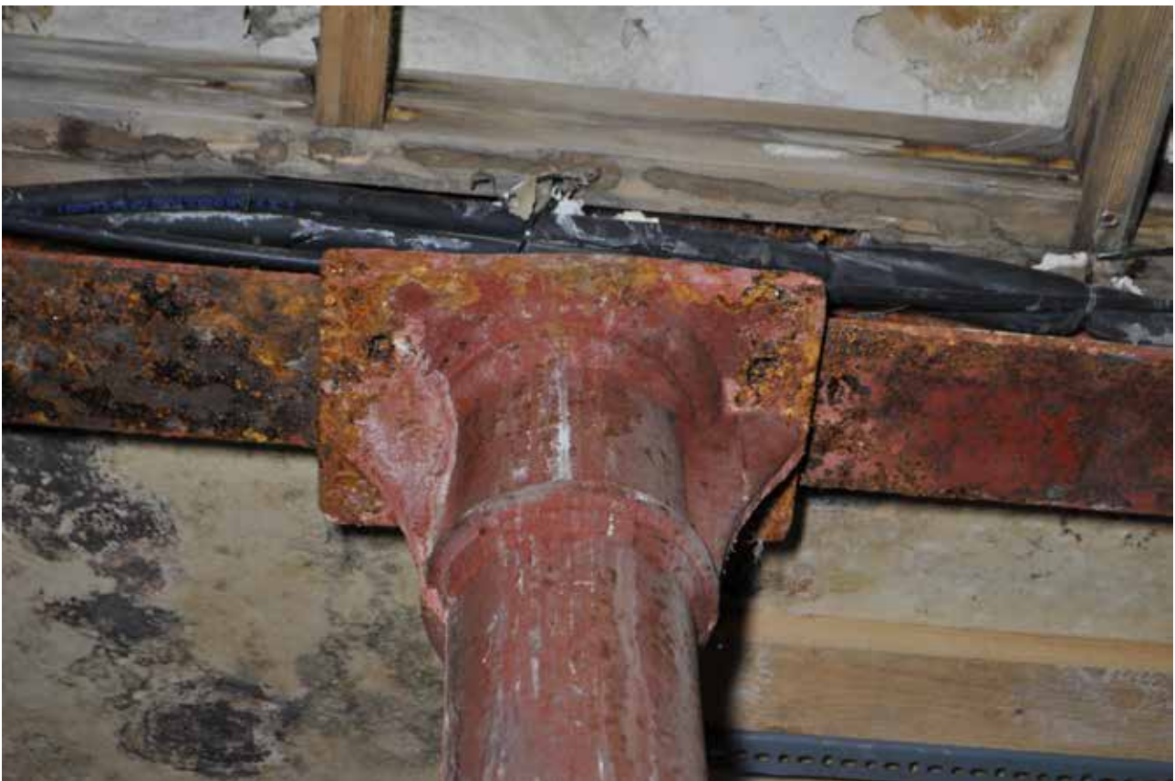
Plate 33: Building 1, Room 0/2, detailed view of cast iron column fixing plate, looking ENE