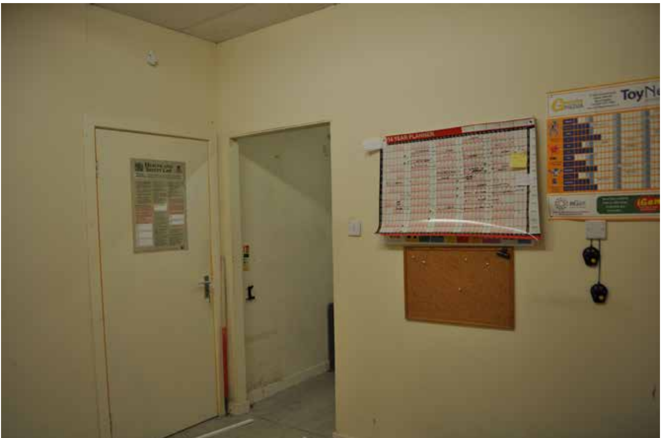
Plate 145: Building 3, general view of SW corner of Room 1/11, looking southwest