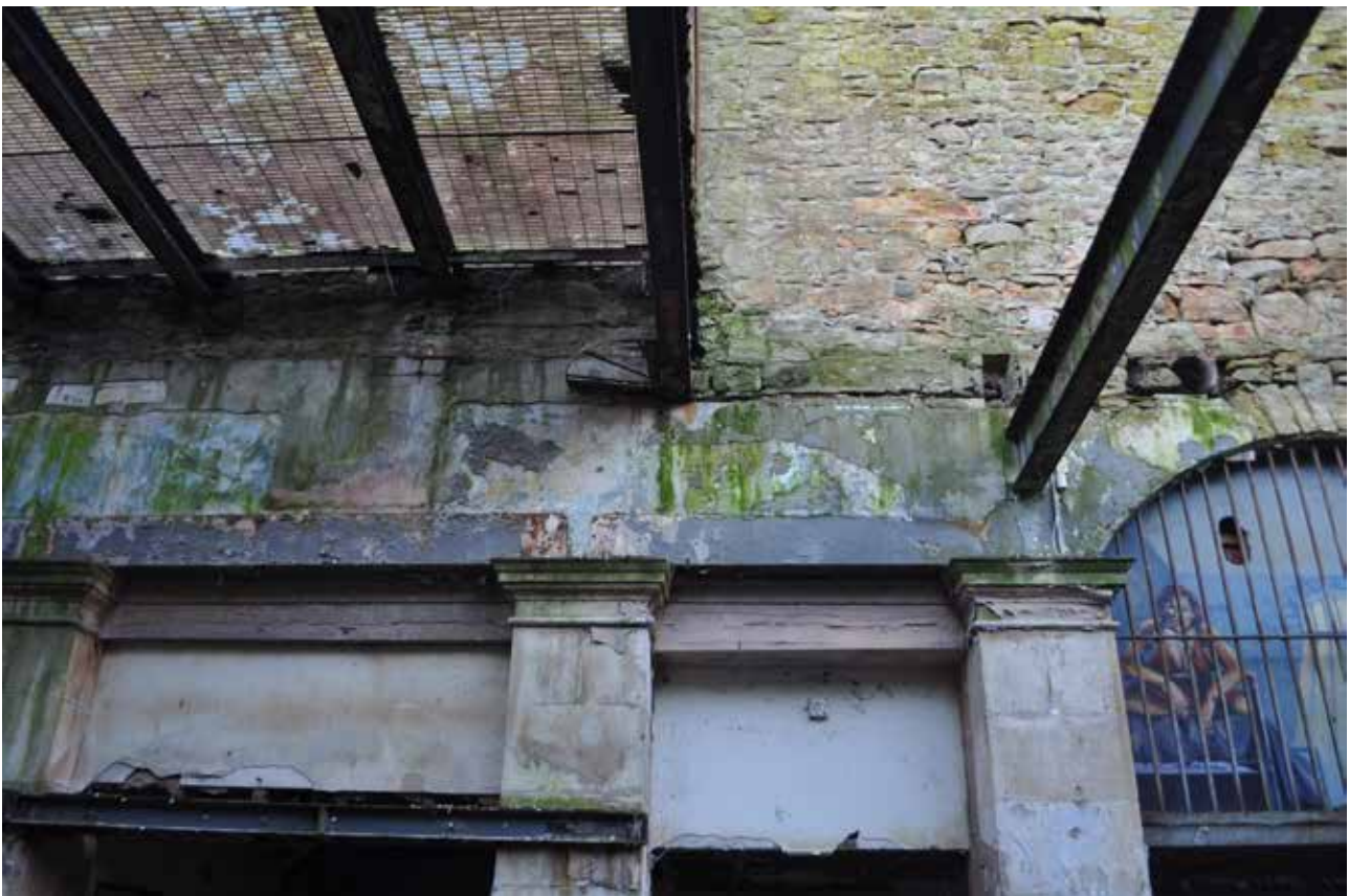
Plate 161: Building 4, Room 1/1, detailed view of entrance to Room 1/4 - upper detail, looking WSW