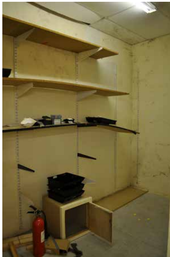
Plate 147: Building 3, general view of NW corner of Room 1/12, looking northwest