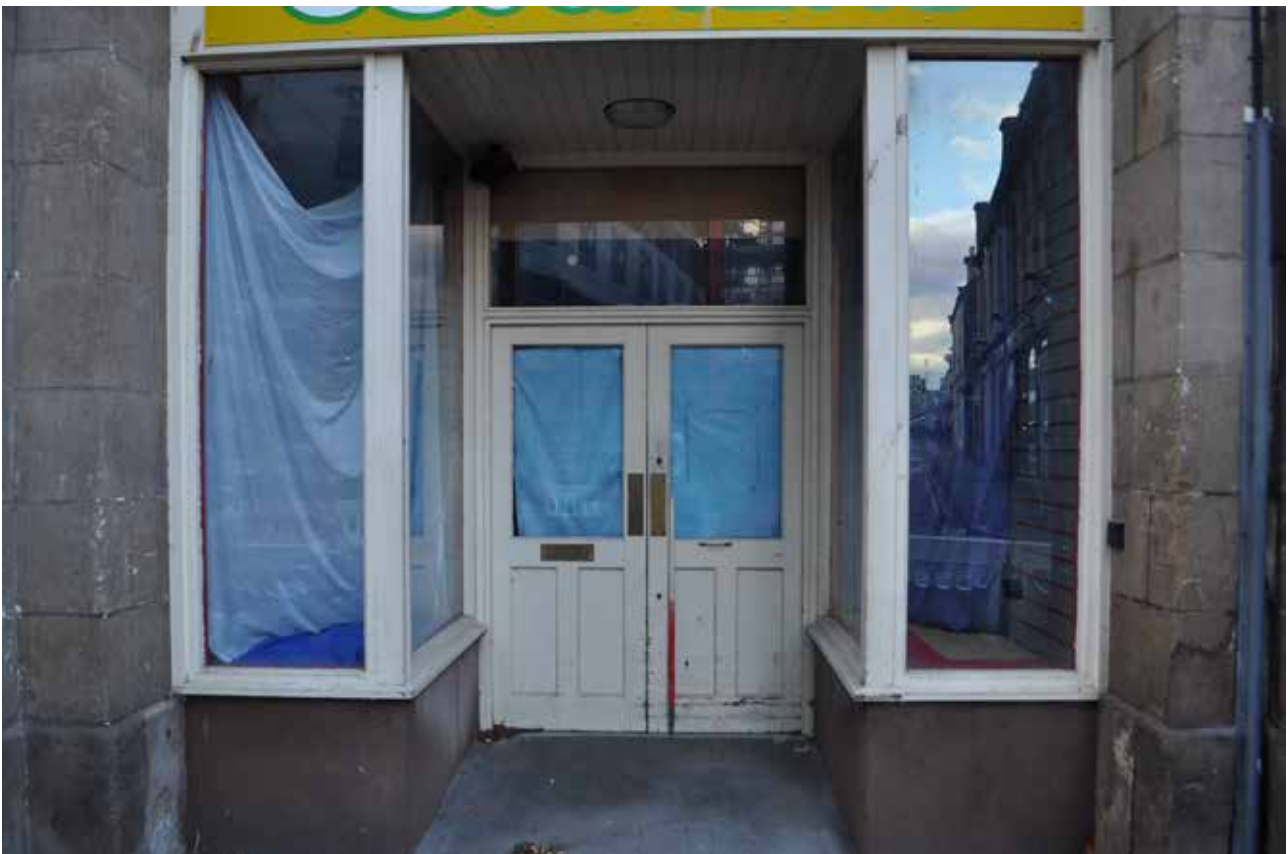
Plate 93: Building 3, general view of entrance on SSE facing elevation, looking NNW