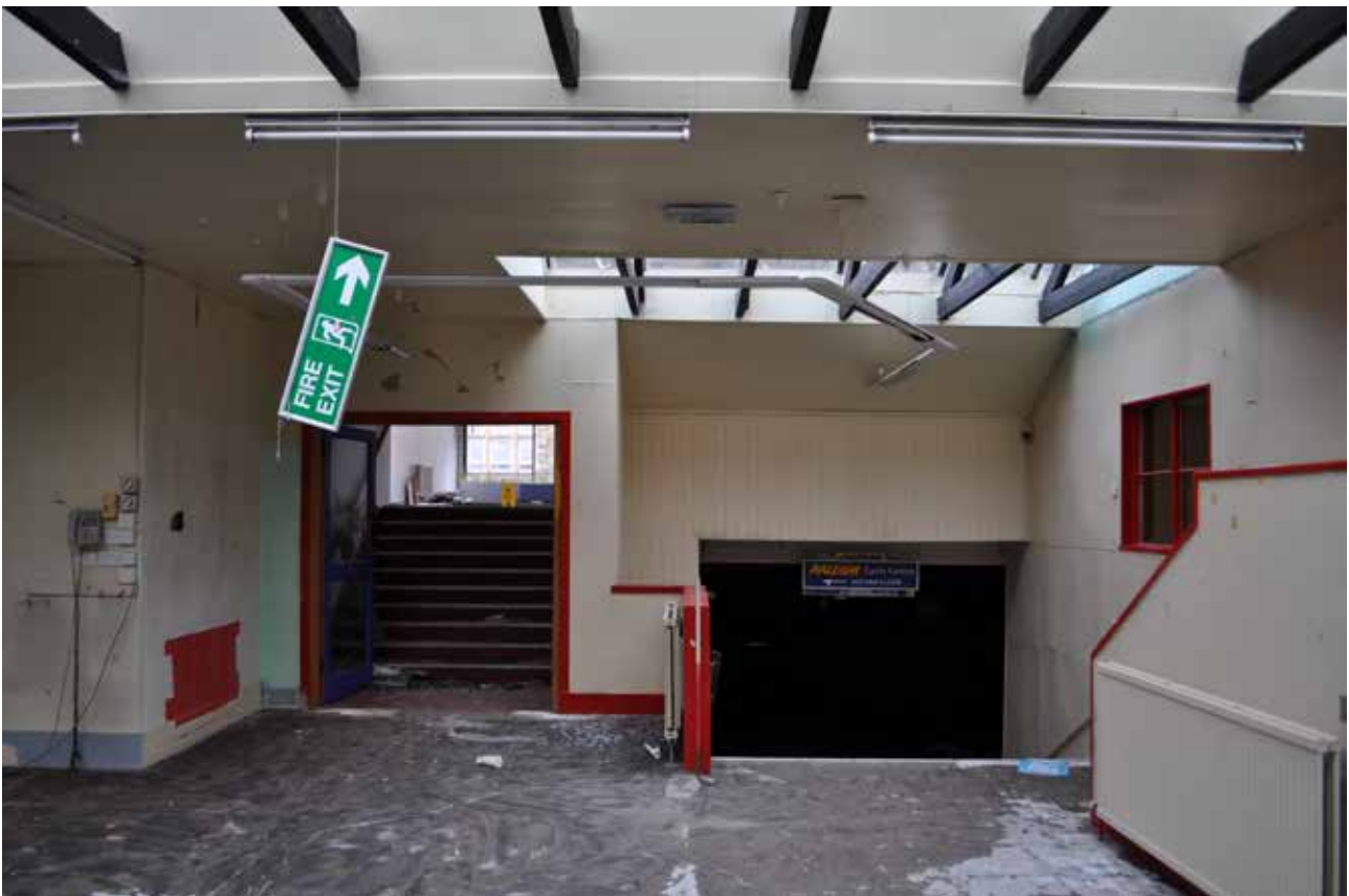
Plate 67: Building 1, Room 2/1, general view of NNW facing wall, looking SSE