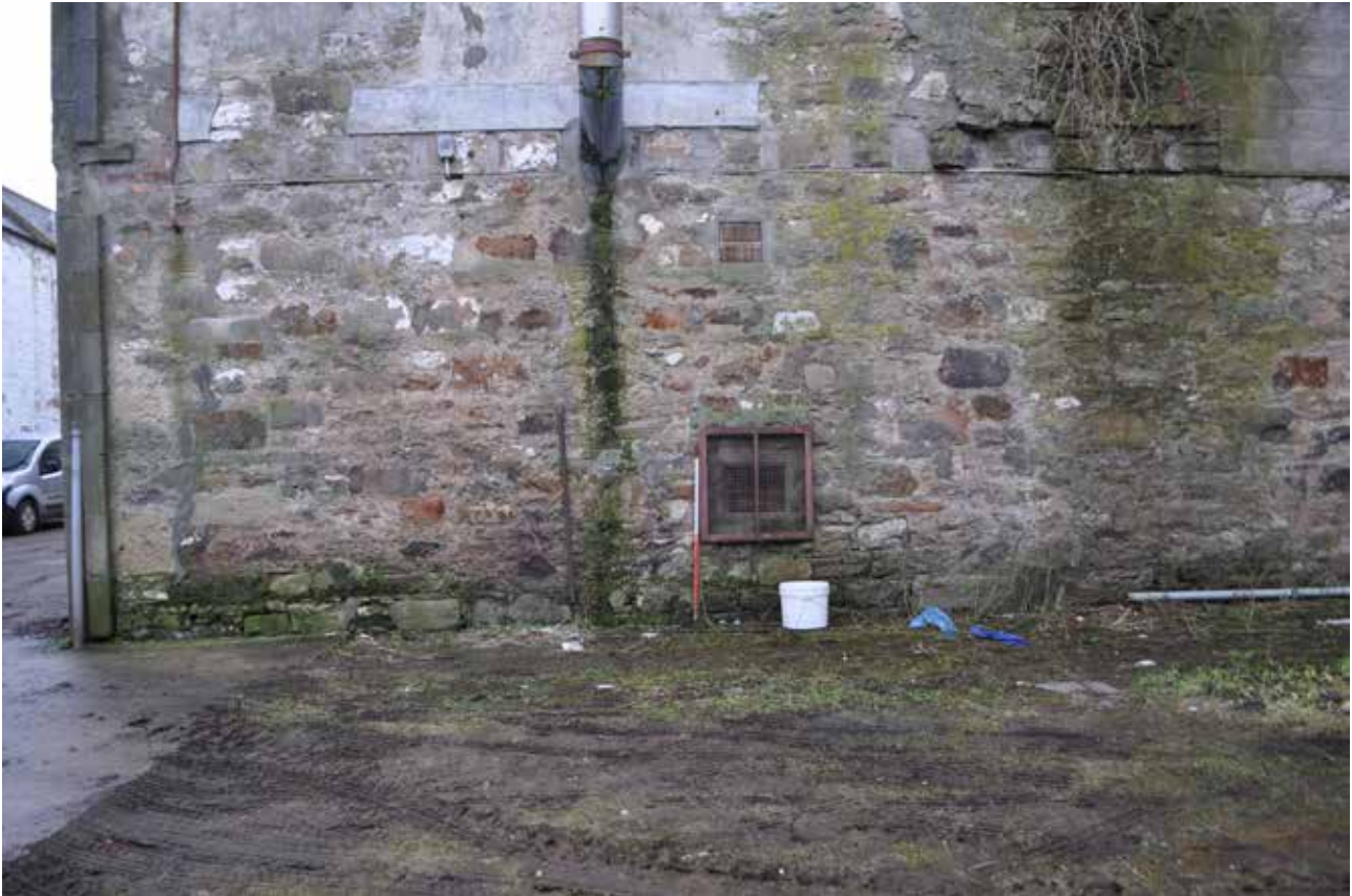
Plate 6: Building 1, general view of NNW facing elevation - upper east detail, looking SSE