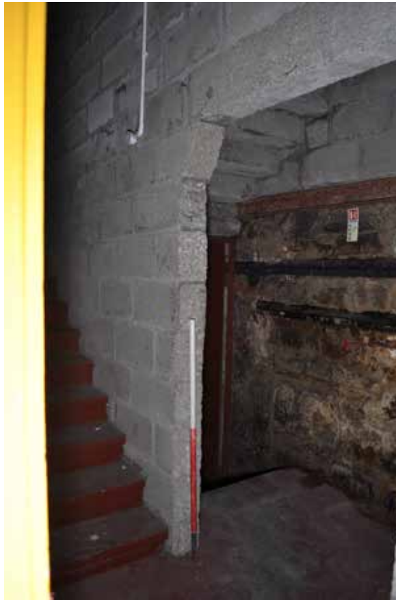
Plate 54: Building 1, Room 1/4, general view of WSW facing wall showing blocked opening (007), looking northeast