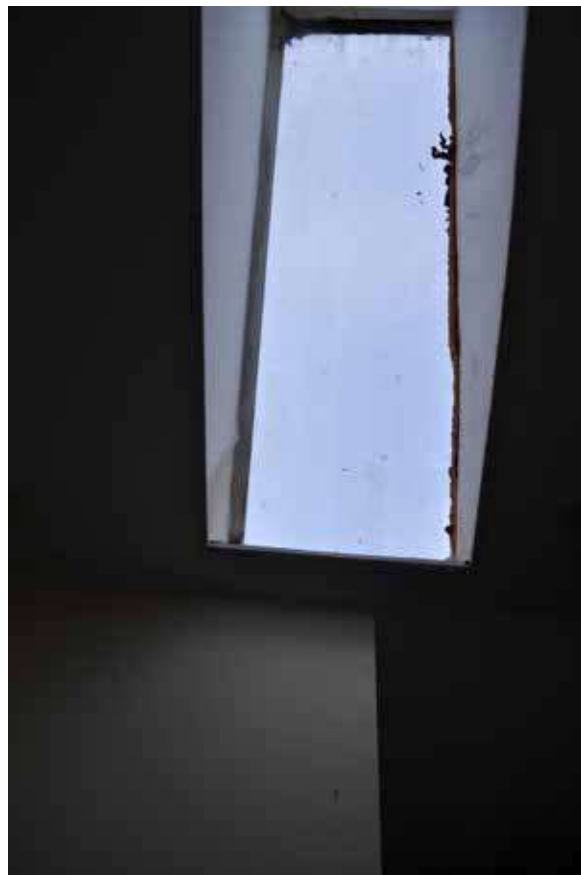
Plate 69: Building 1, Room 2/2, detailed view of skylight, looking NNW