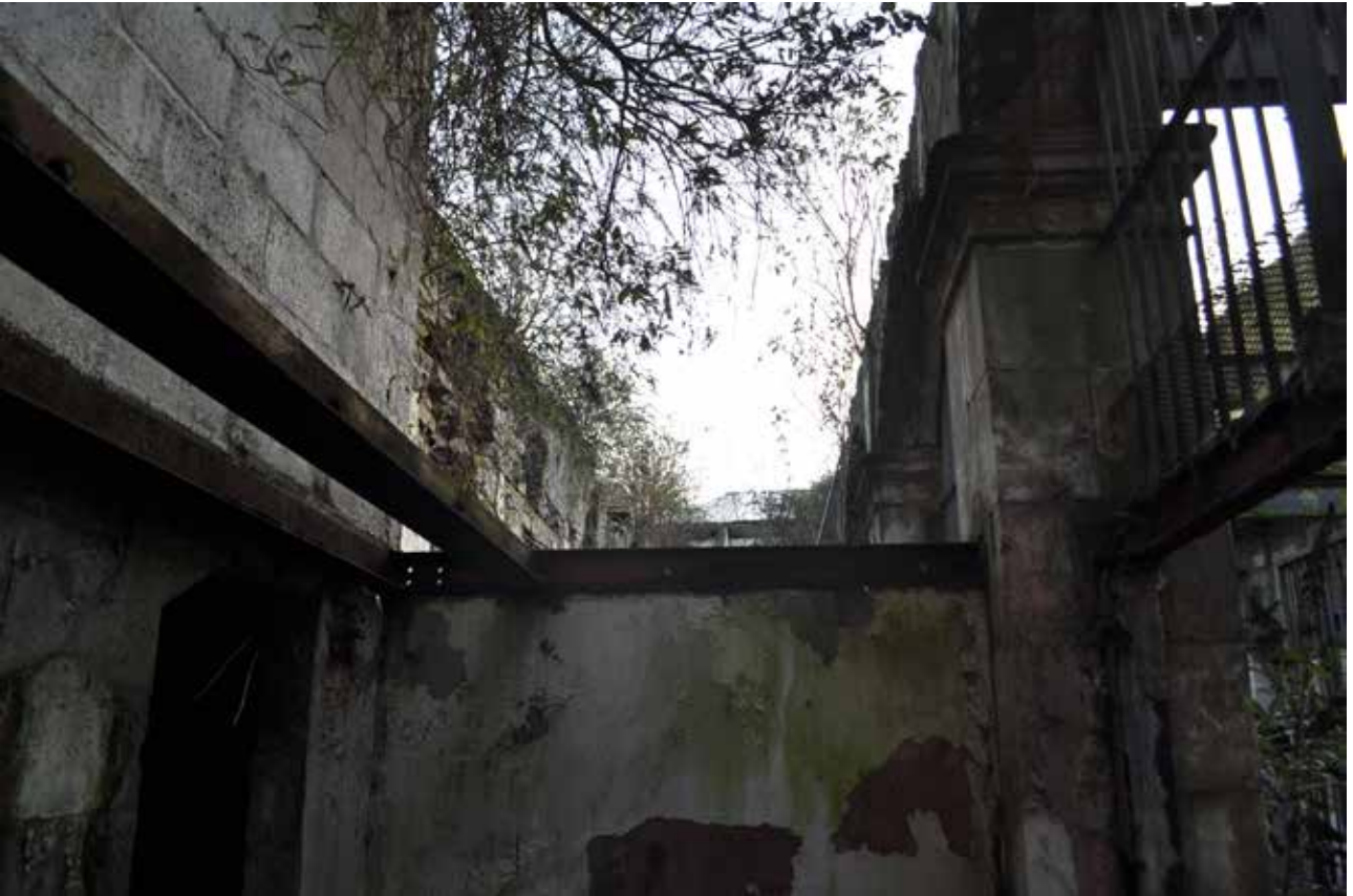
Plate 190: Building 4, Room 1/11, general view of NNW facing wall - upper detail, looking SSE