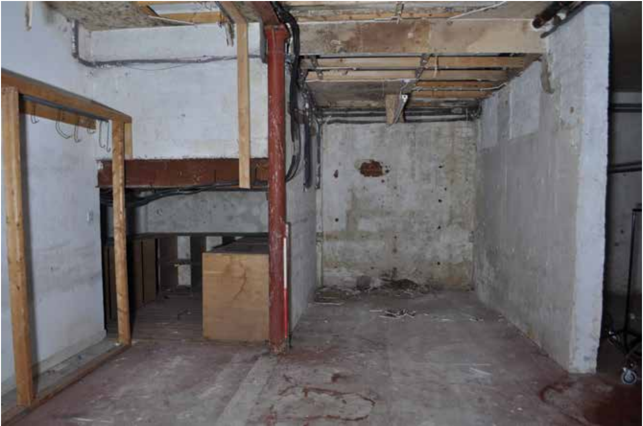
Plate 32: Building 1, Room 0/2, general view of entrance on ENE facing wall - south end, looking WSW