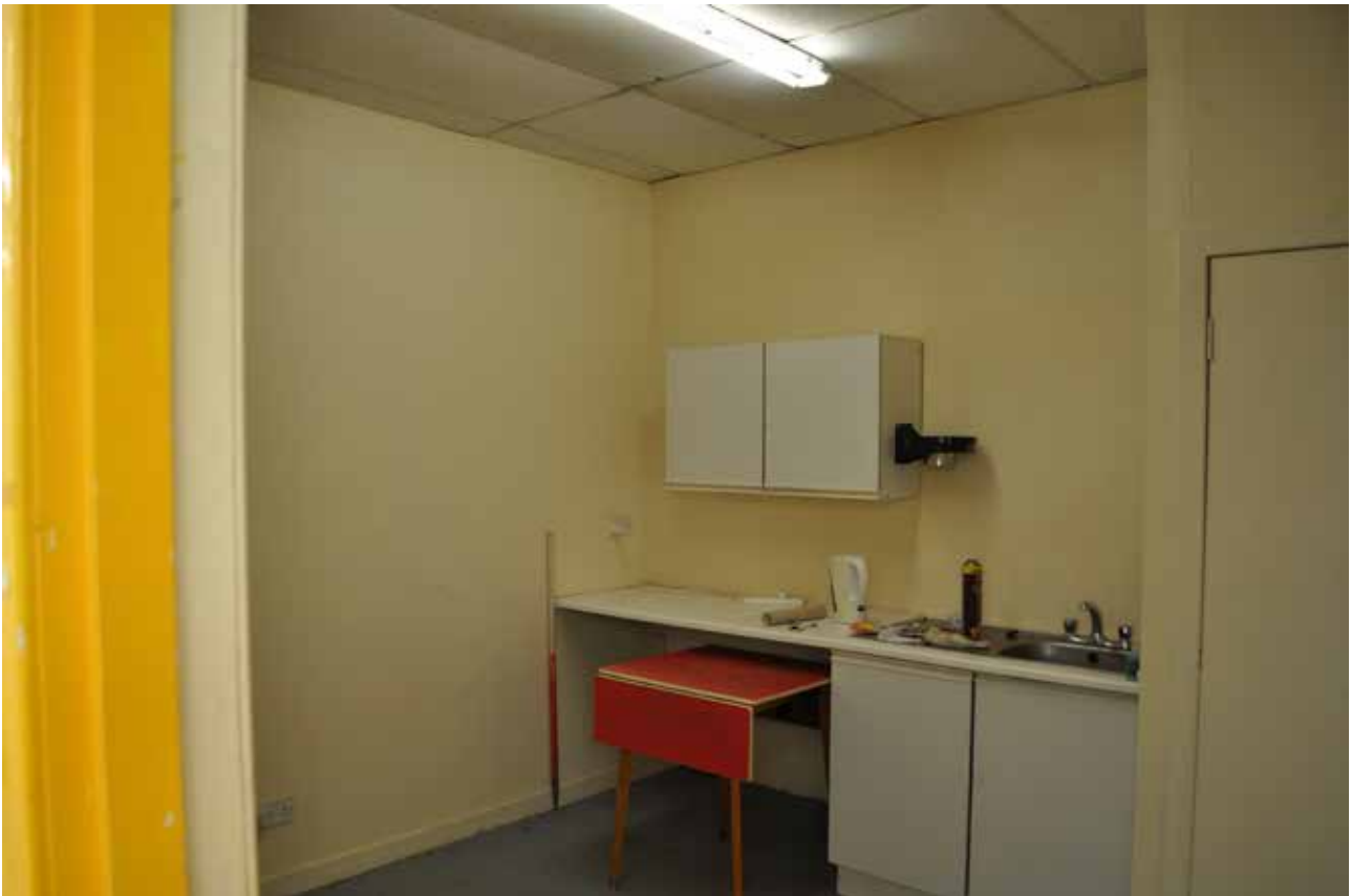
Plate 139: Building 3, general view of NW corner of Room 1/9, looking northwest