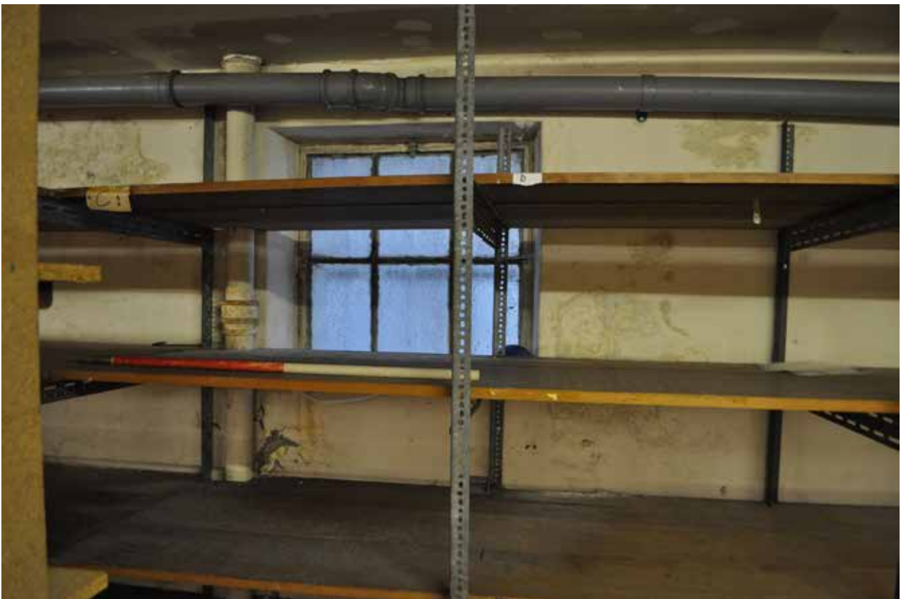
Plate 103: Building 3, Room 0/2, detailed view of north window on WSW facing wall, looking northeast