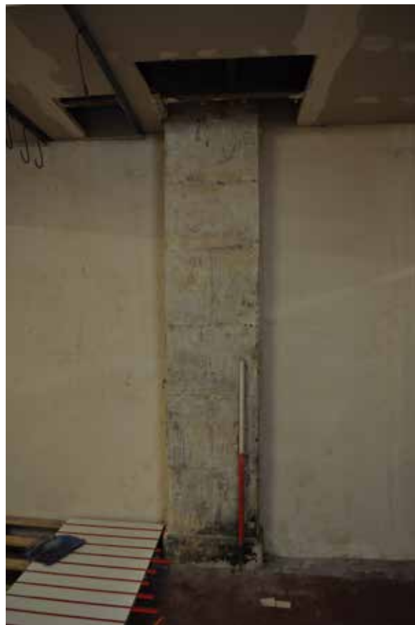
Plate 107: Building 3, Room 0/2, detailed view of stone column, looking NNW