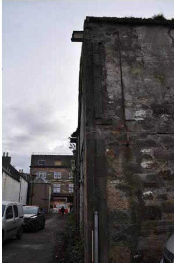
Plate 4: Building 1, general view of NNW facing elevation - upper detail, looking southwest