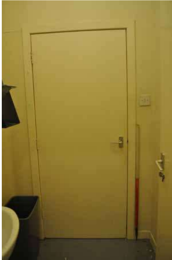
Plate 138: Building 3, Room 1/8, detailed view of door on NNW facing wall, looking SSE