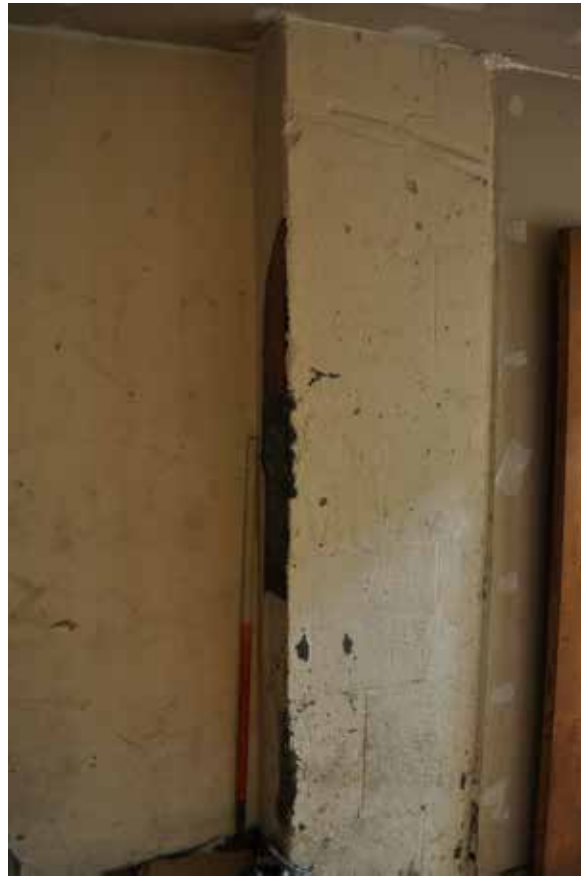
Plate 124: Building 3, Room 1/3, detail of exposed stonework on ENE facing wall of lower corridor, looking west