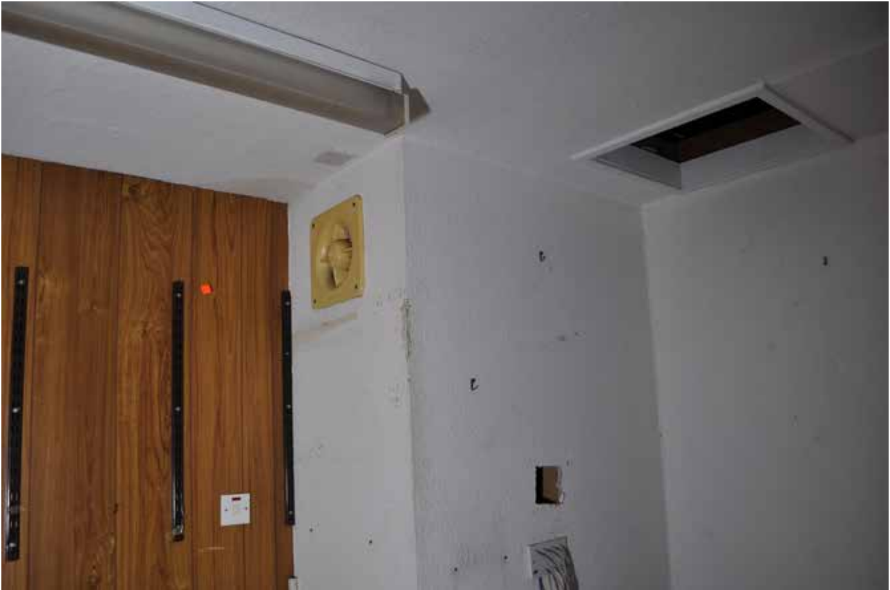
Plate 72: Building 1, general view of NW corner of Room 2/3 - upper detail, looking northwest