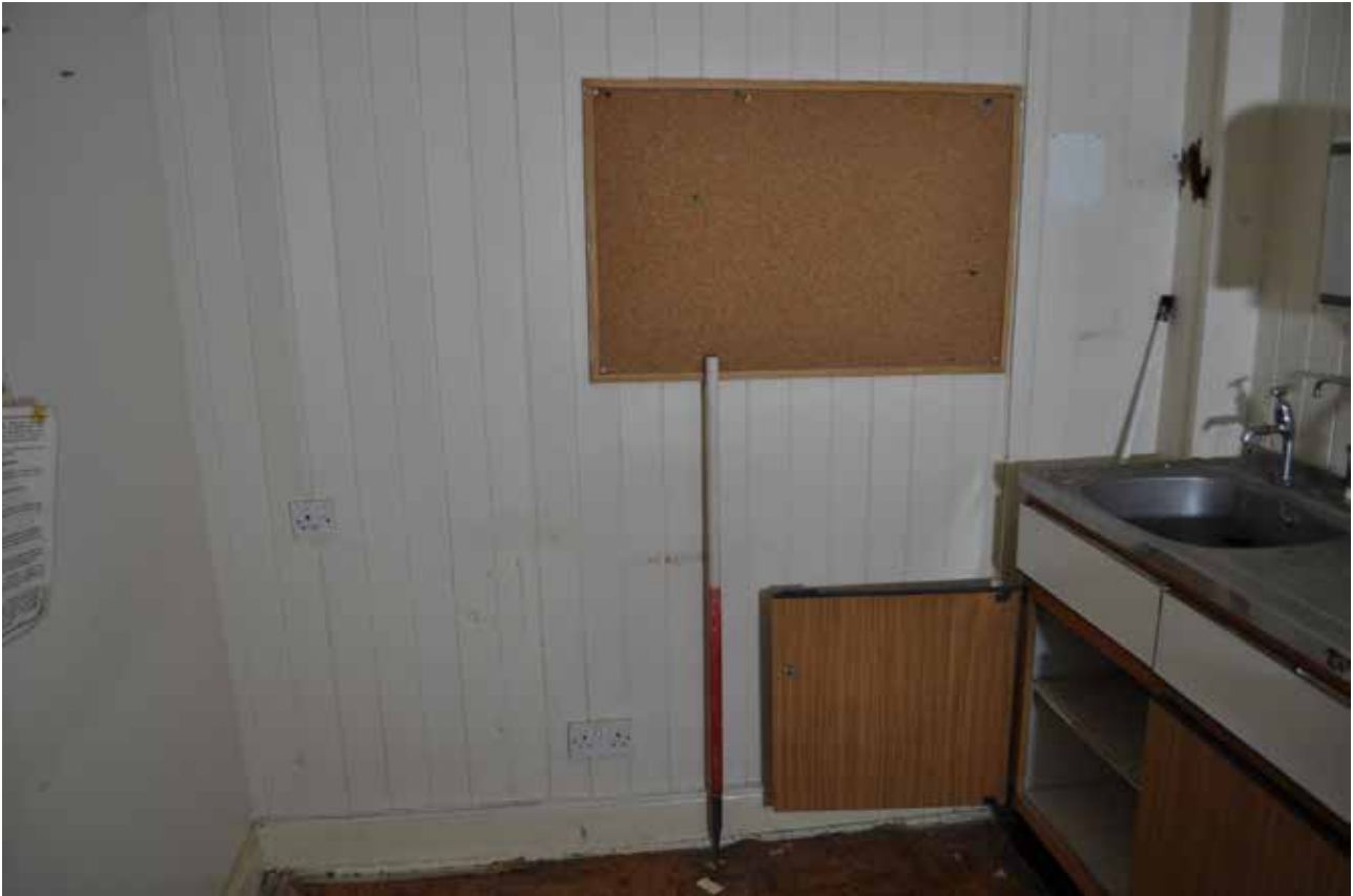
Plate 52: Building 1, Room 1/3, general view of ENE facing wall - lower detail, looking WSW