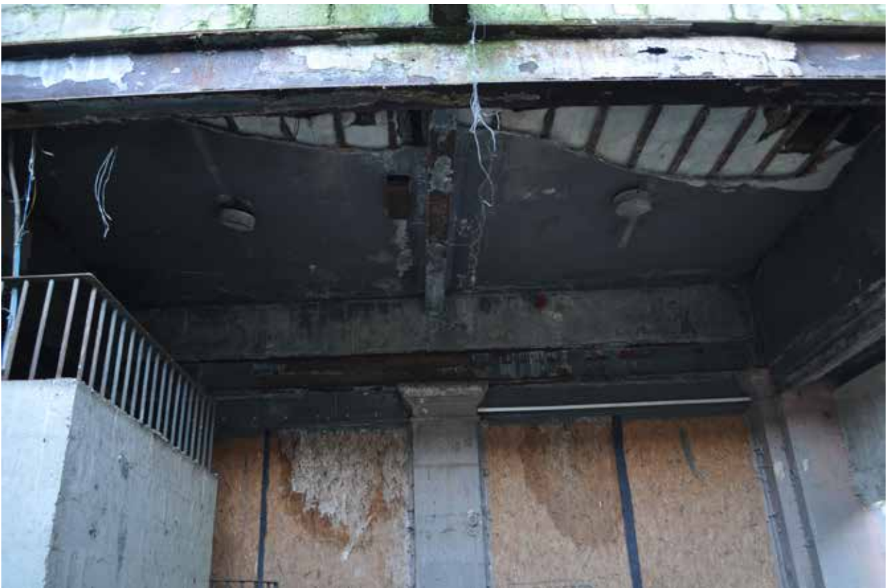
Plate 165: Building 4, detailed view of ceiling remnants at southern end of Room 1/1, looking SSE