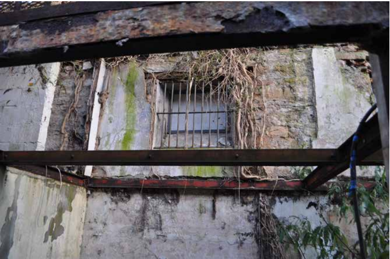
Plate 193: Building 4, Room 1/12, detailed view of north window on WSW facing wall, looking ENE