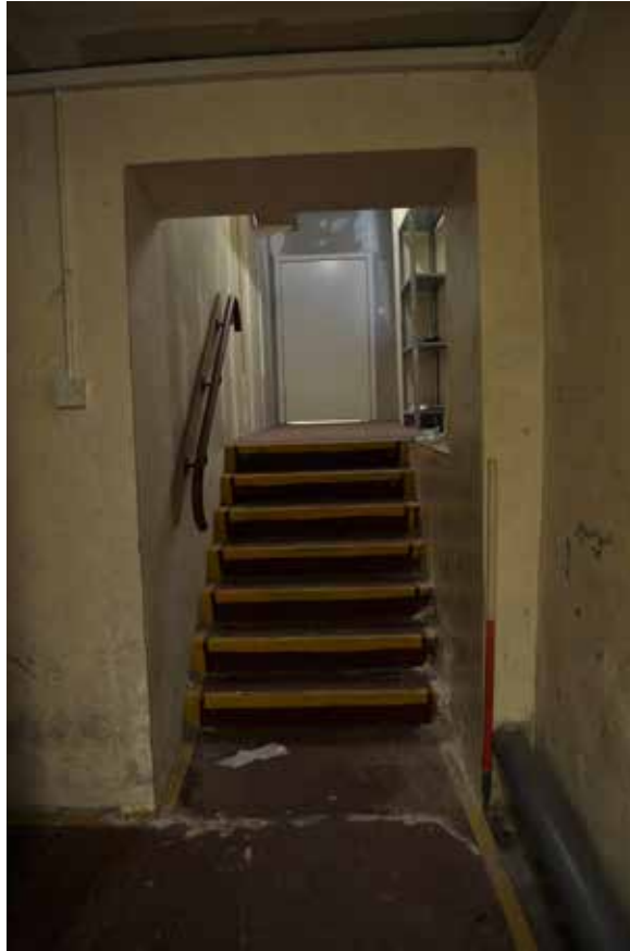
Plate 122: Building 3, Room 1/3, general view of opening to Room 1/4 on SSE facing wall, looking NNW