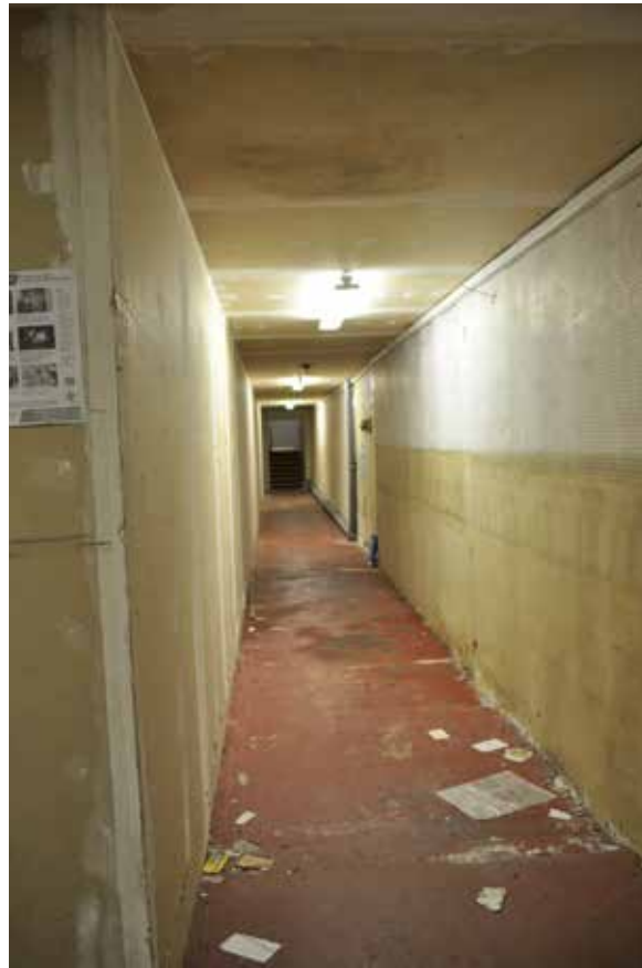
Plate 120: Building 3, Room 1/3, general view of corridor running along WSW facing wall, looking NNW