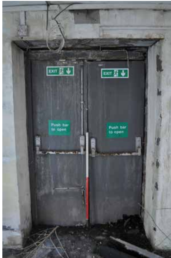
Plate 198: Building 4, Room 1/15, detailed view of fire exit on WSW facing wall, looking ENE