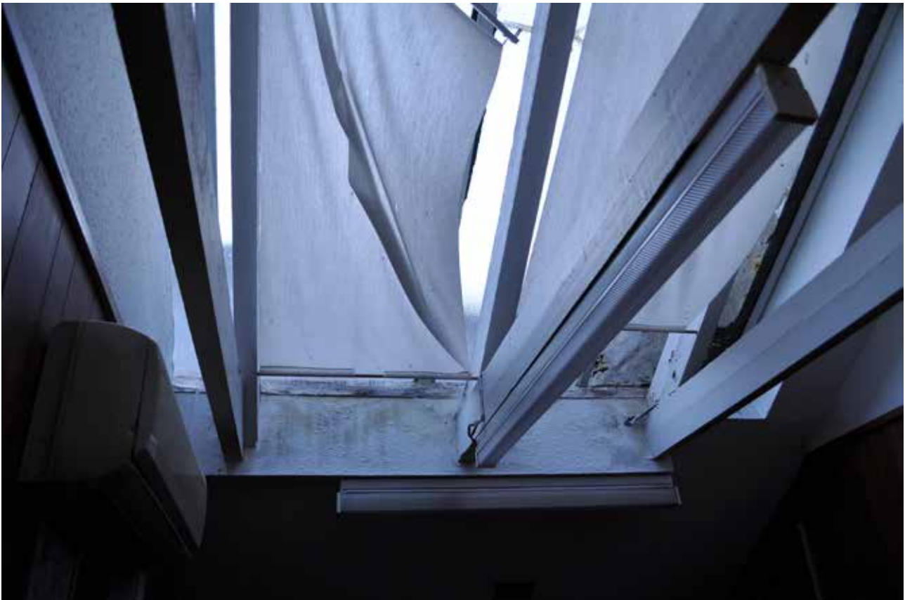
Plate 73: Building 1, Room 2/4, general view of NNW facing wall - upper window detail, looking SSE