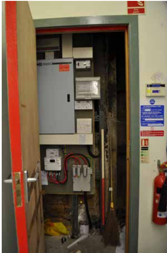
Plate 114: Building 3, Room 1/2, general view of NNW facing wall, looking SSE