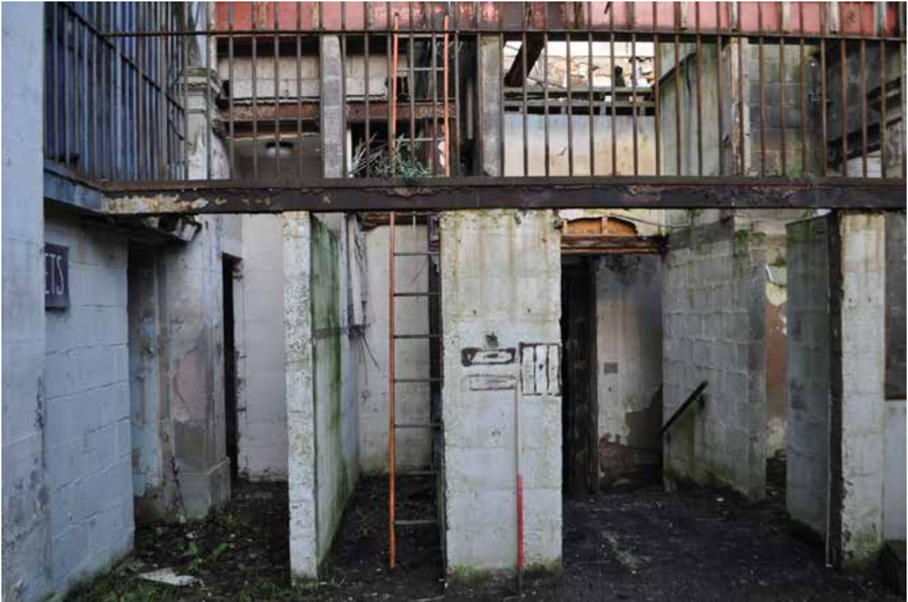
Plate 158: Building 4, Room 1/1, general view of SSE facing wall - west end, looking NNW