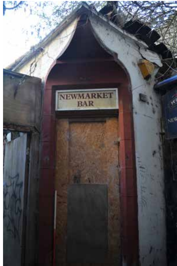
Plate 204: Building 5, detailed view of door chamfered wall on WSW facing elevation - upper detail, looking southeast