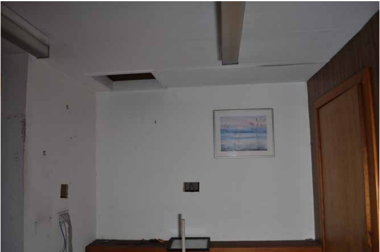
Plate 71: Building 1, Room 2/3, general view of SSE facing wall - upper detail, looking NNW