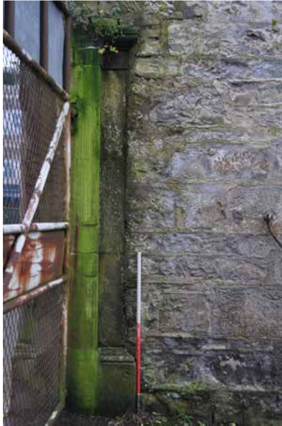
Plate 10: Building 1, detail view of pillar decoration on southeast corner of ENE facing elevation, looking WSW