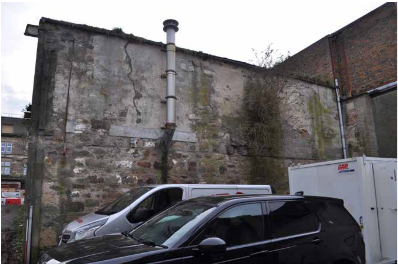
Plate 5: Building 1, general view of NNW facing elevation - lower east detail, looking SSE