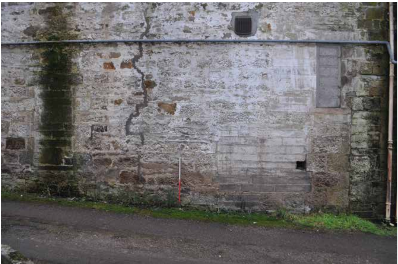
Plate 13: Building 1, general view of blocked openings (004), (005), (006) and (007) on ENE facing elevation, looking WSW