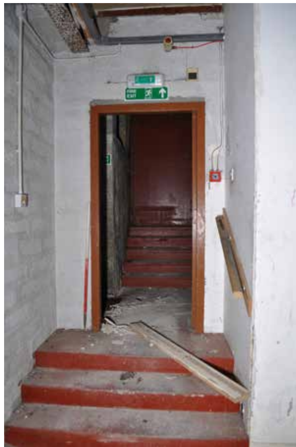
Plate 29: Building 1, Room 0/2, general view of entrance on NNW facing wall, looking SSE