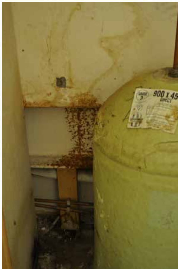
Plate 143: Building 3, Room 1/10, general view of SSE facing wall - lower detail, looking NNW