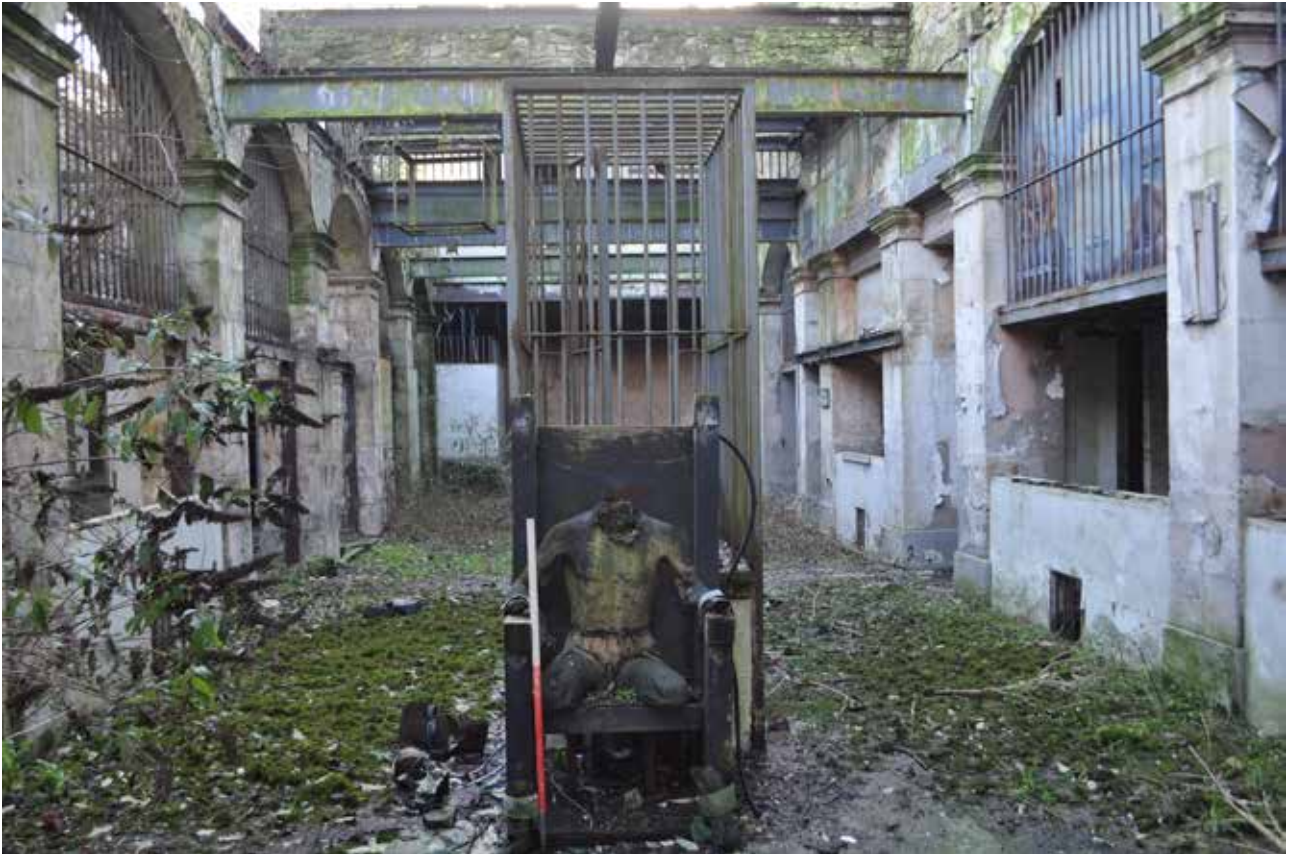
Plate 156: Building 4, general view of Room 1/1 from entrance, looking SSE