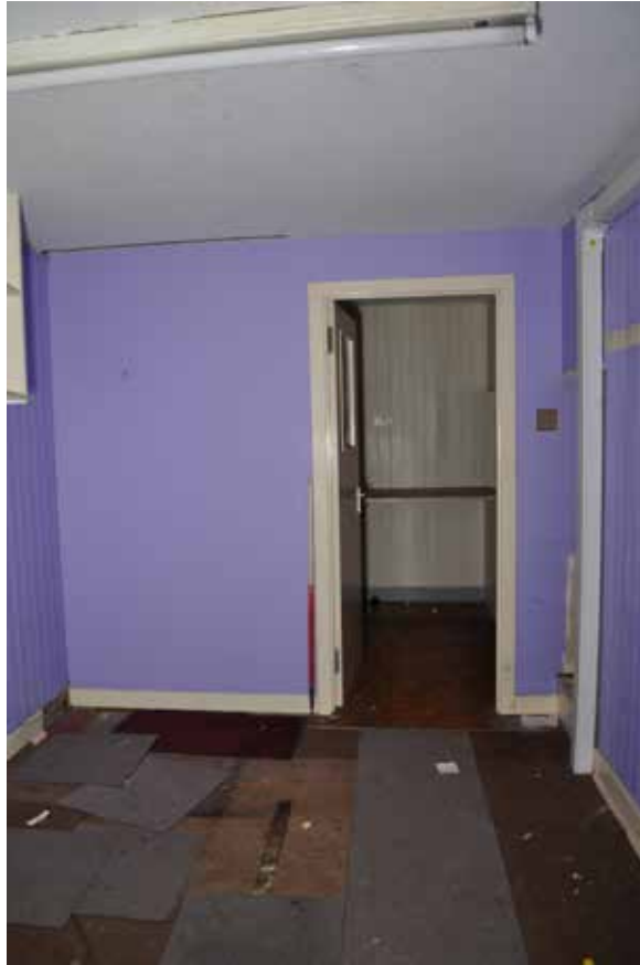
Plate 48: Building 1, Room 1/2, general view of SSE facing wall, looking NNW