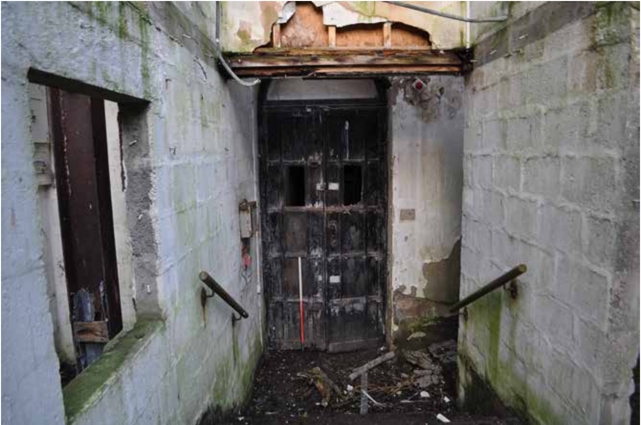
Plate 184: Building 4, Room 1/9, general view of SSE facing wall, looking NNW