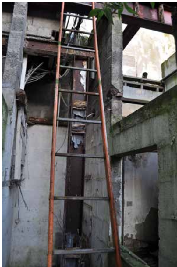
Plate 183: Building 4, Room 1/8, detailed view of SSE facing wall, looking NNW