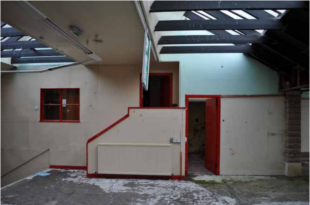
Plate 66: Building 1, Room 2/1, general view of ENE facing wall - south end, looking WSW