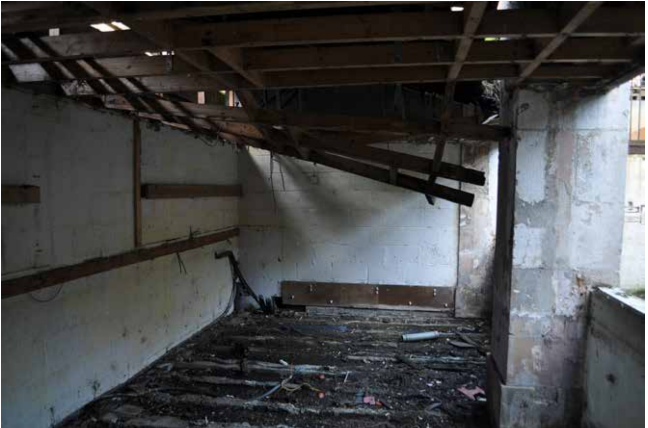
Plate 180: Building 4, Room 1/5, general view of Room 1/5, looking NNW