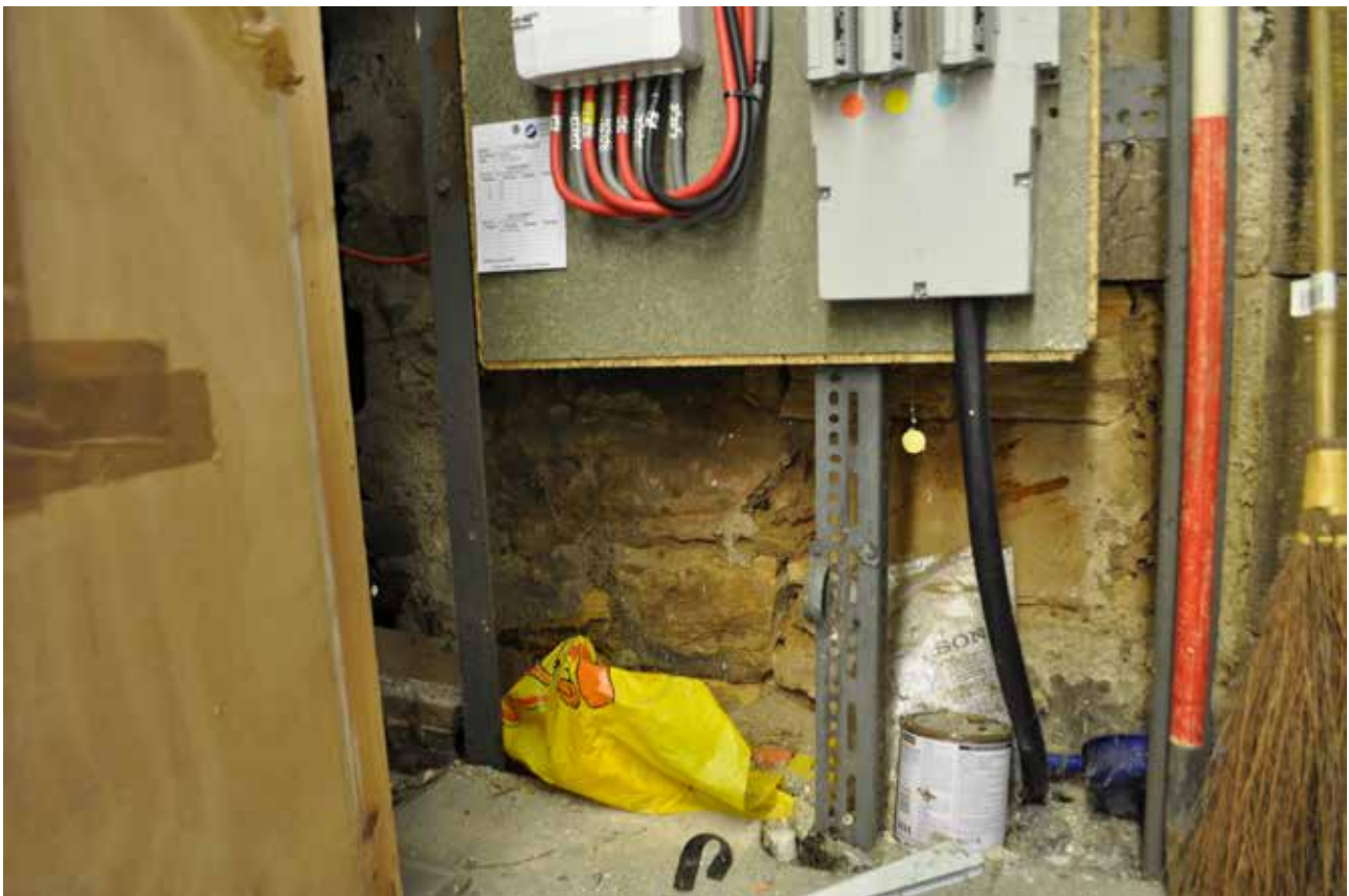
Plate 115: Building 3, detailed view of exposed stone in SE corner of Room 1/2, looking southeast