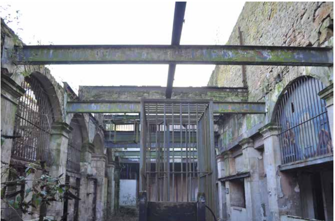
Plate 157: Building 4, general view of Room 1/1 from entrance - upper detail, looking SSE