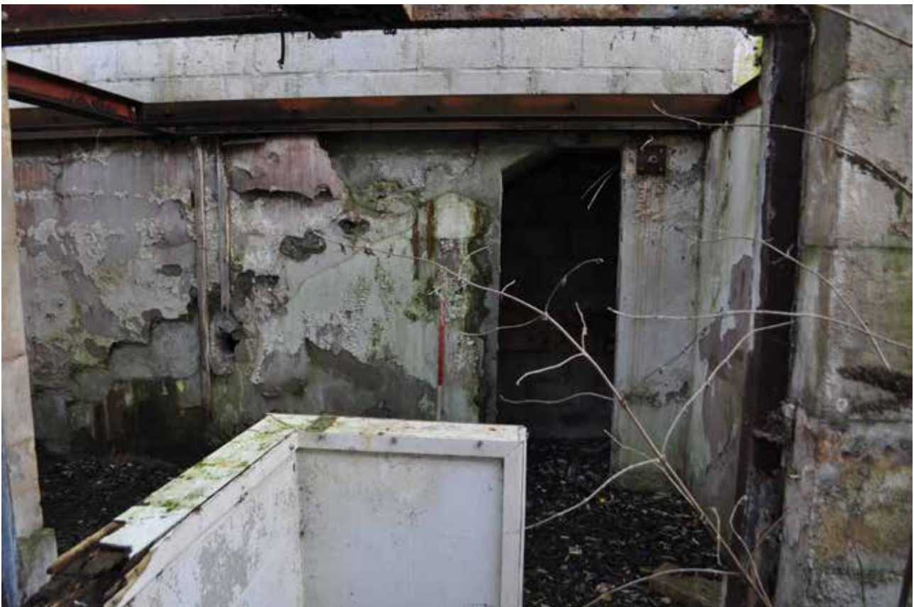
Plate 189: Building 4, Room 1/11, general view of WSW facing wall - lower detail, looking ENE