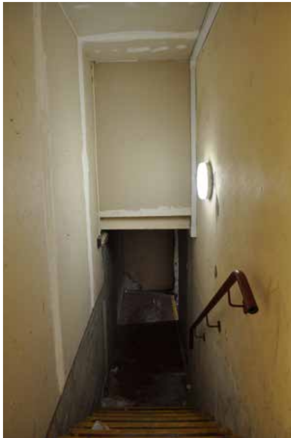
Plate 123: Building 3, Room 1/3, general view along lower WSW-ESE aligned corridor, looking WSW