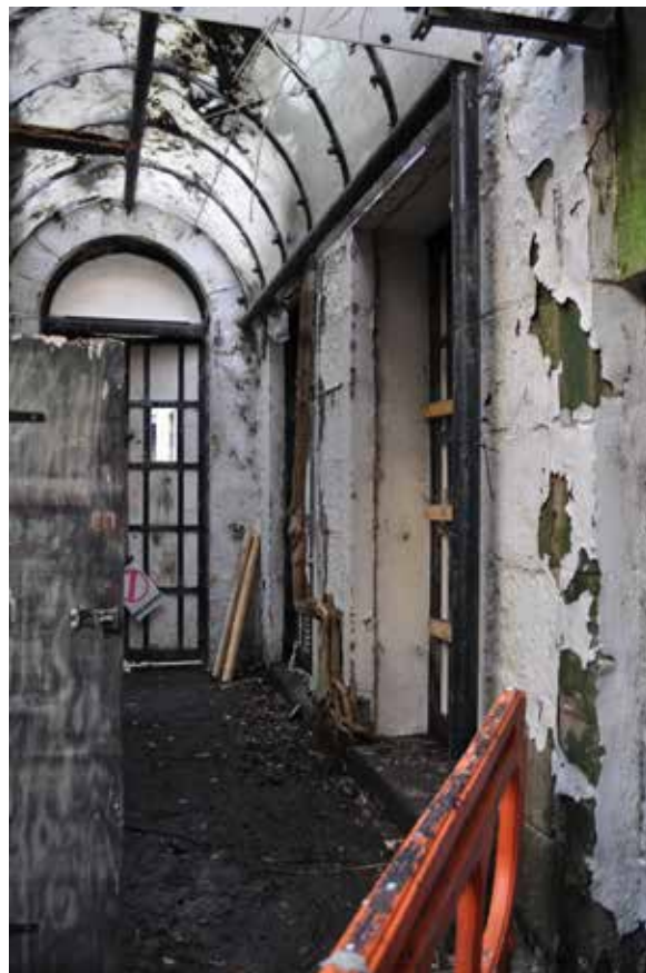
Plate 153: Building 4, general view of ENE facing elevation, looking southwest