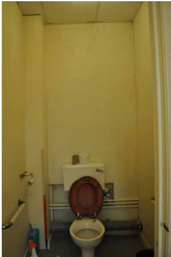
Plate 137: Building 3, Room 1/8, general view of WSW facing wall - north end, looking ENE