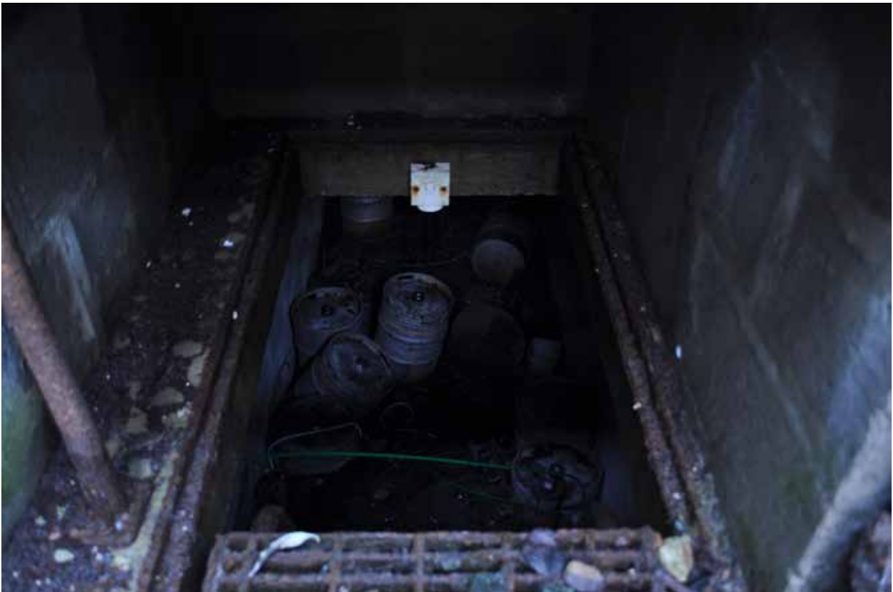
Plate 155: Building 4, Room 0/1, general view of cellar from access hatch, looking NNW