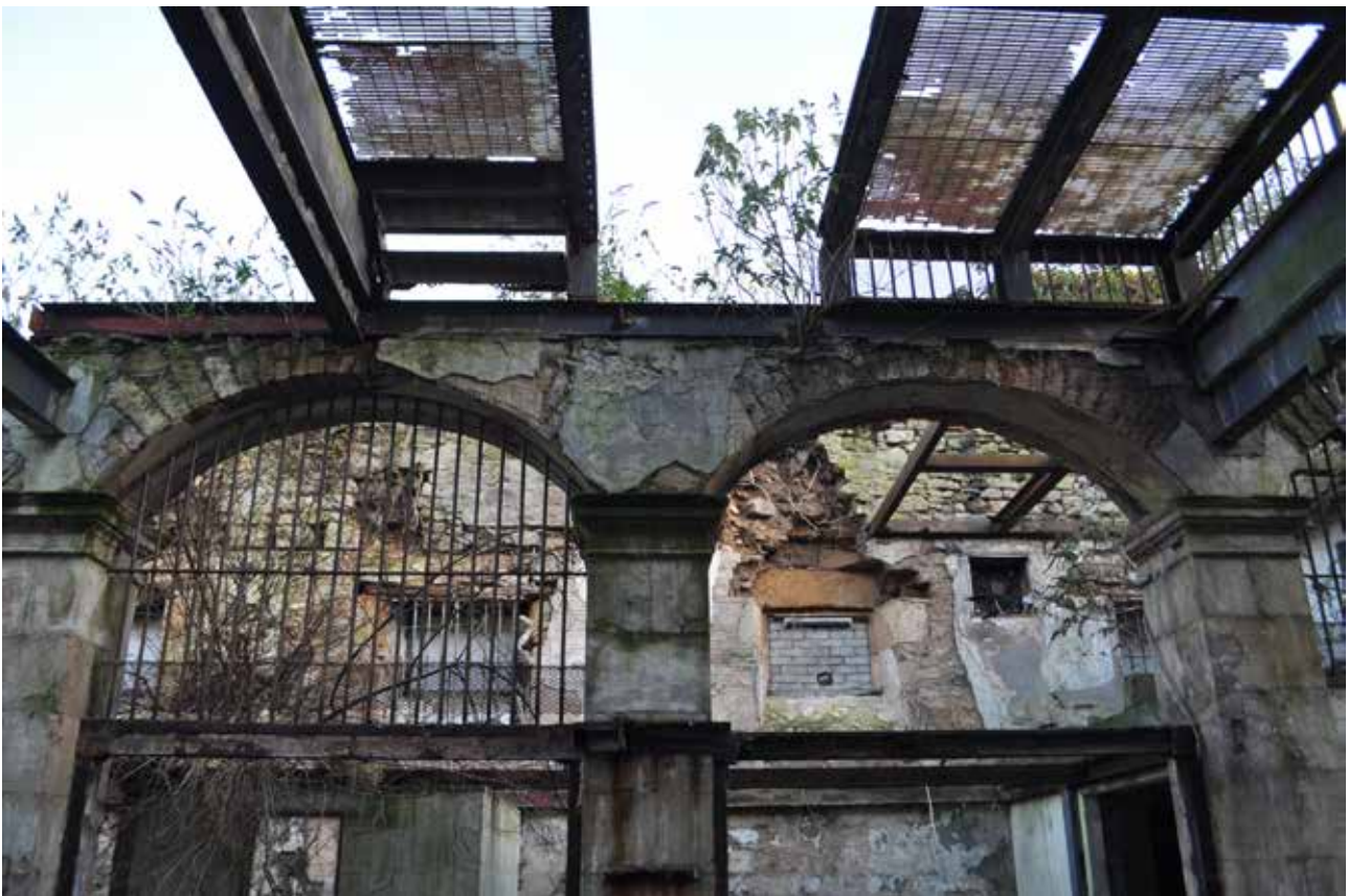
Plate 169: Building 4, Room 1/1, general view of arches leading to Room 1/14 - upper detail, looking ENE