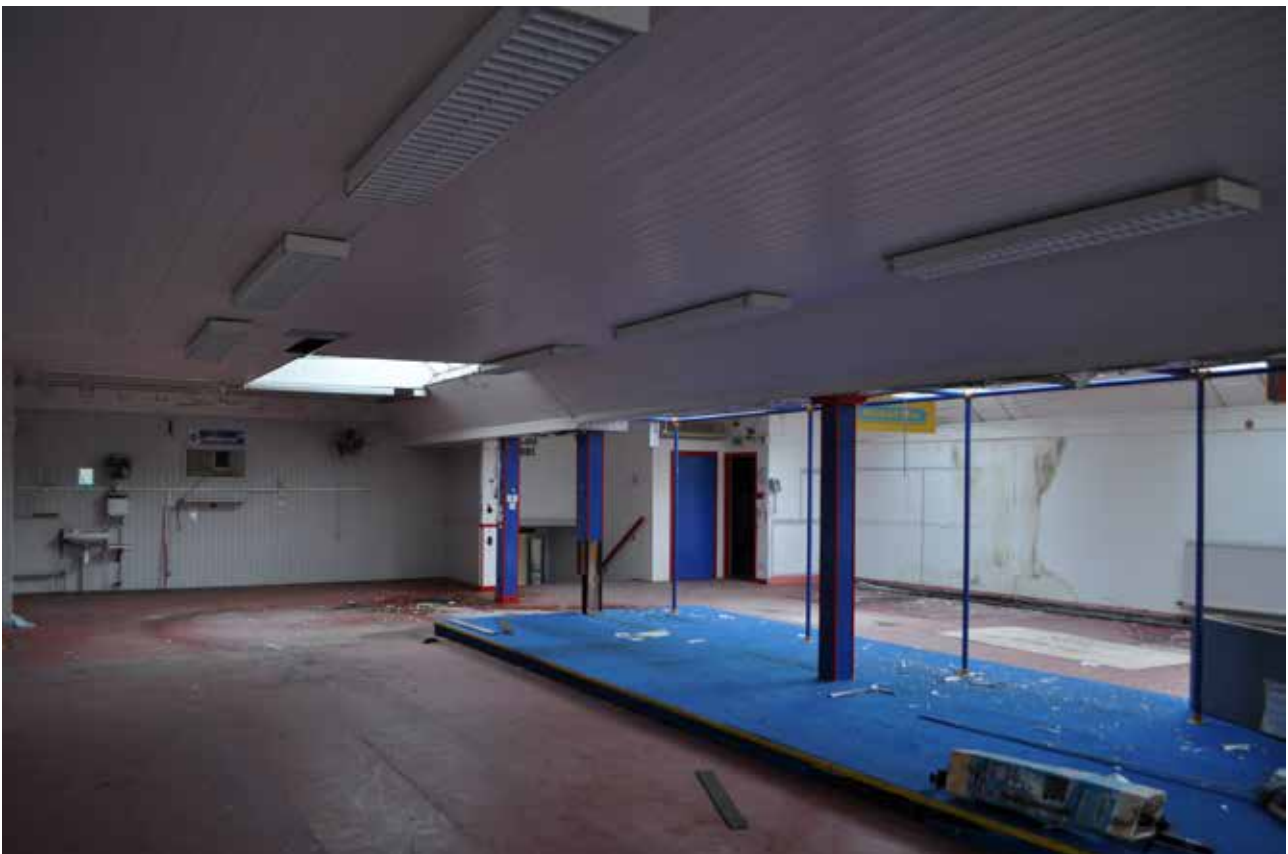
Plate 85: Building 1, Room 2/6, general view of Room 2/6 , looking northeast