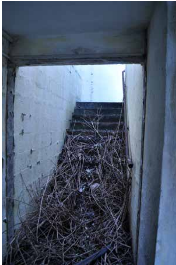
Plate 201: Building 4, general view of Room 1/17, looking SSE