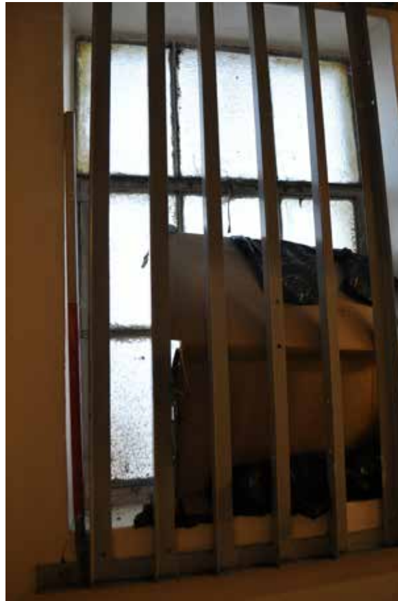
Plate 128: Building 3, Room 1/4, detailed view of window on WSW facing wall, looking east