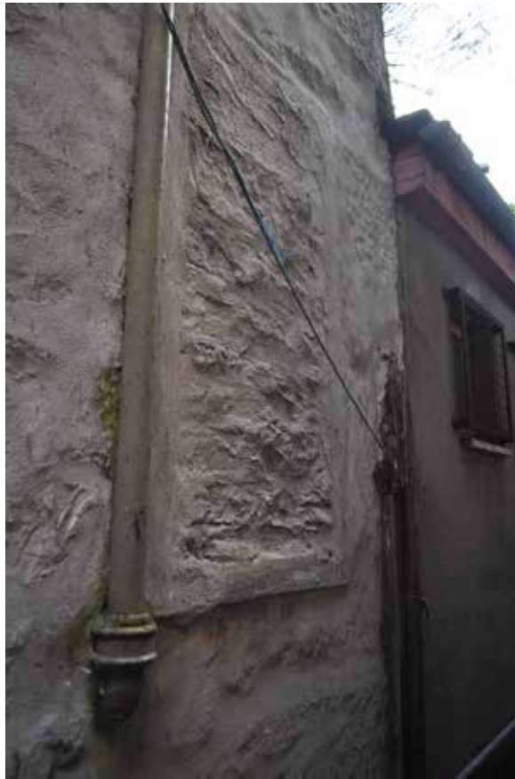
Plate 216: Building 5, detail view of blocked lower window on NNW facing elevation of east building, looking southwest