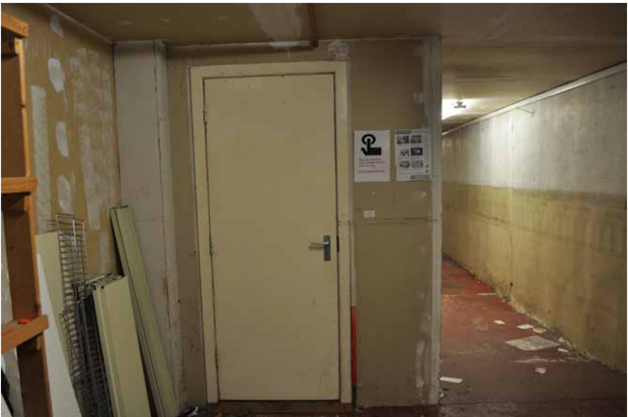
Plate 119: Building 3, Room 1/3, general view of door on SSE facing wall, looking NNW