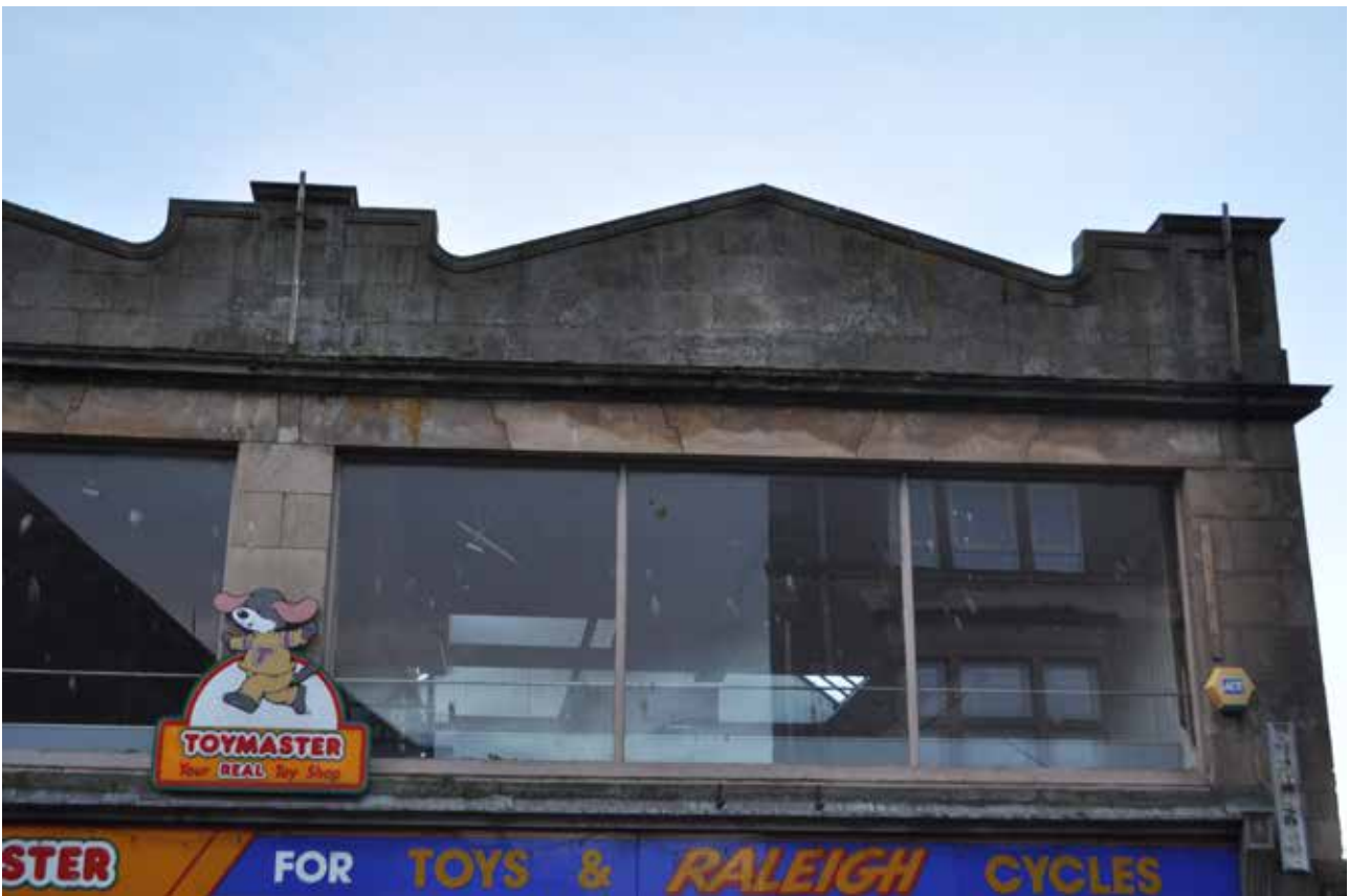
Plate 25: Building 1, general view of SSE facing elevation - upper east detail, looking NNW