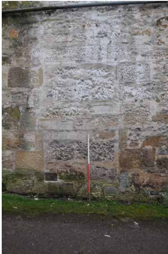
Plate 12: Building 1, detail view of blocked opening (003) on ENE facing elevation, looking WSW