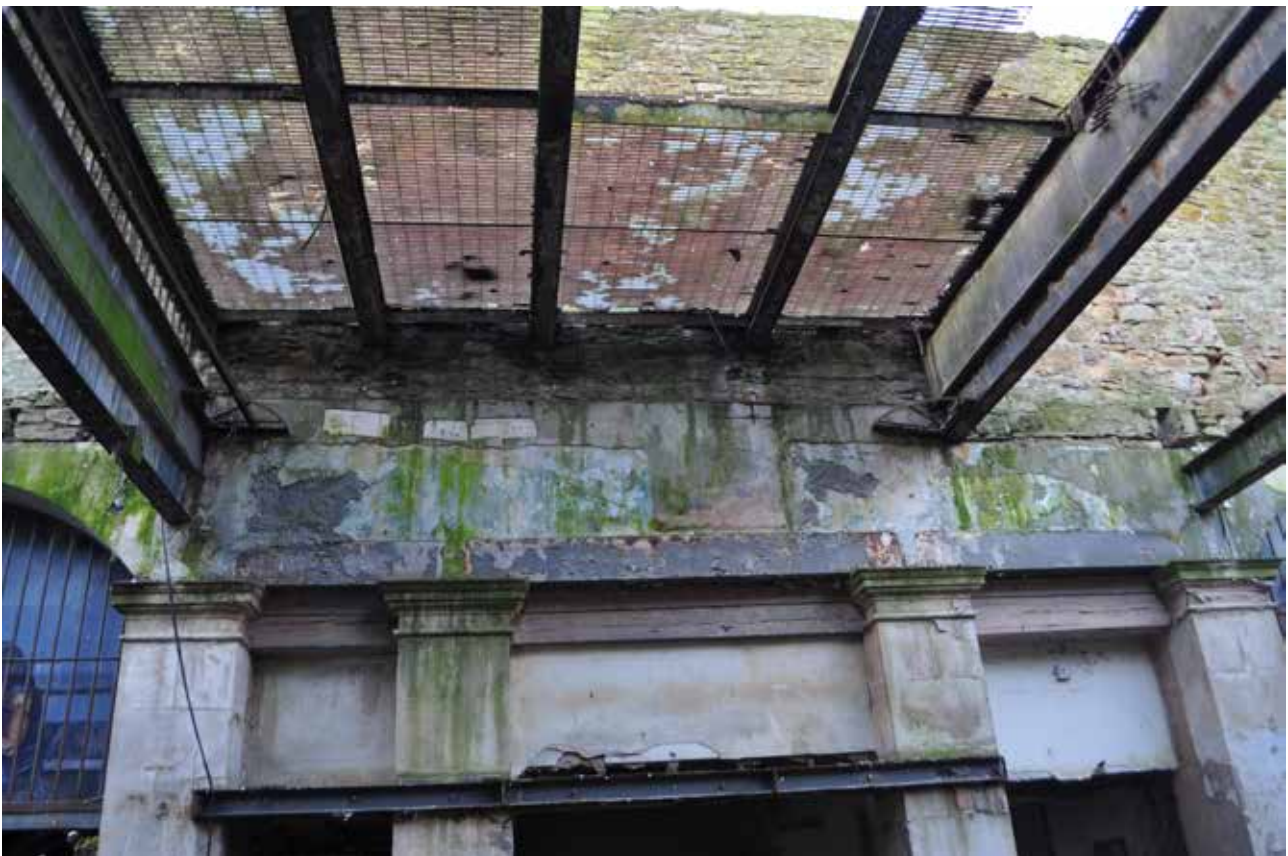
Plate 163: Building 4, Room 1/1, general view of ENE facing wall showing entrances to Rooms 1/2, 1/3 and 1/4 - upper detail, looking WSW