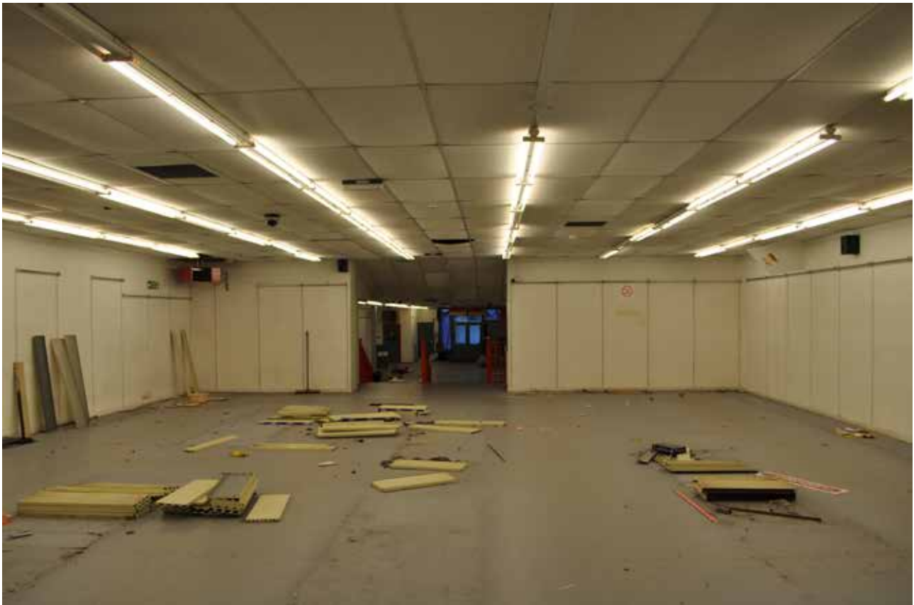
Plate 129: Building 3, Room 1/5, general view of NNW facing wall, looking SSE