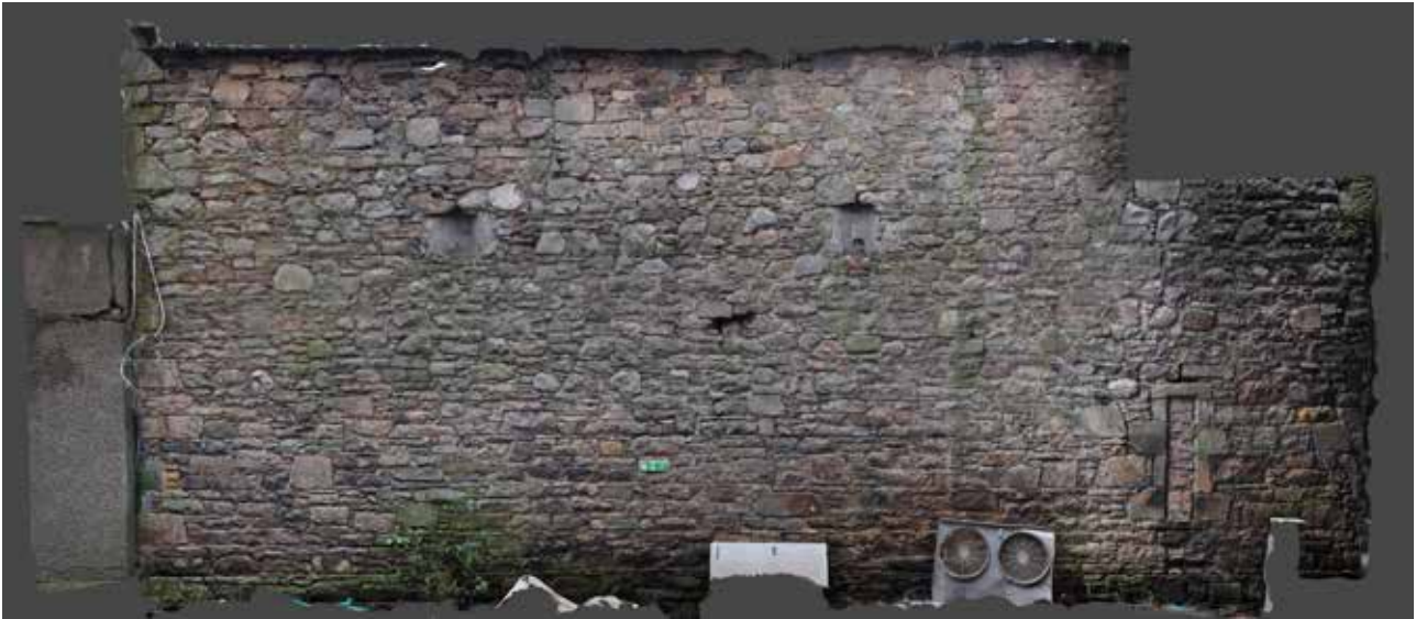
Plate 222: Building 5, general view of east elevation , looking WSW