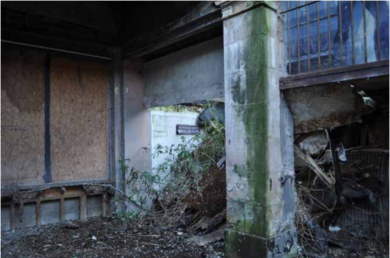
Plate 172: Building 4, general view of SW corner of Room 1/1, looking southwest