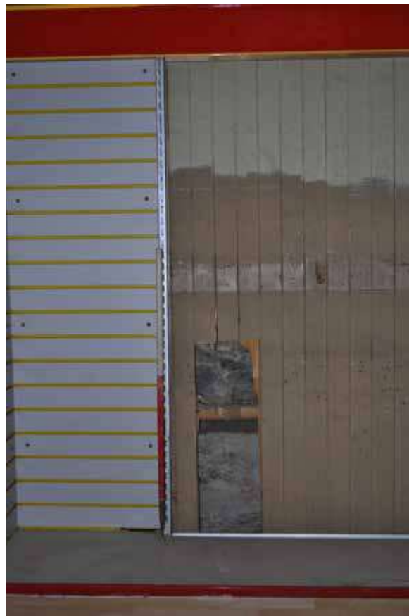
Plate 47: Building 1, Room 1/1, general view of WSW facing wall, looking ESE