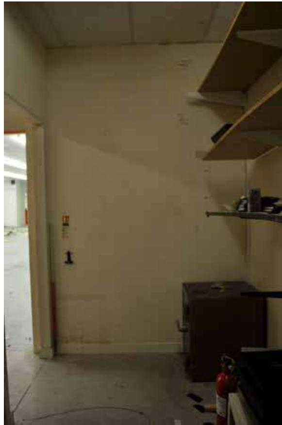
Plate 146: Building 3, Room 1/12, general view of NNW facing wall, looking SSE