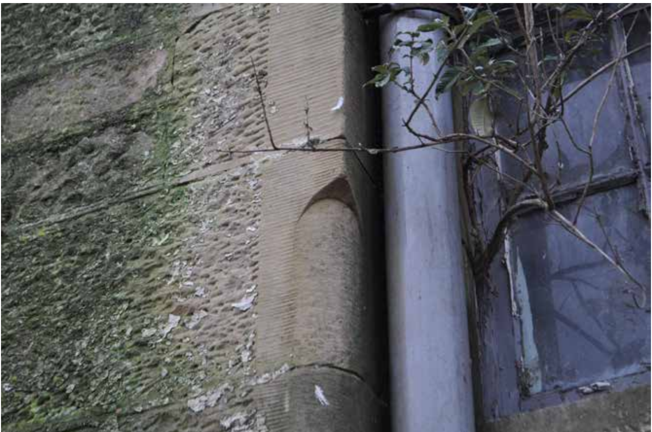
Plate 19: Building 1, detail view of converging stop on column between gables on ENE facing elevation, looking south