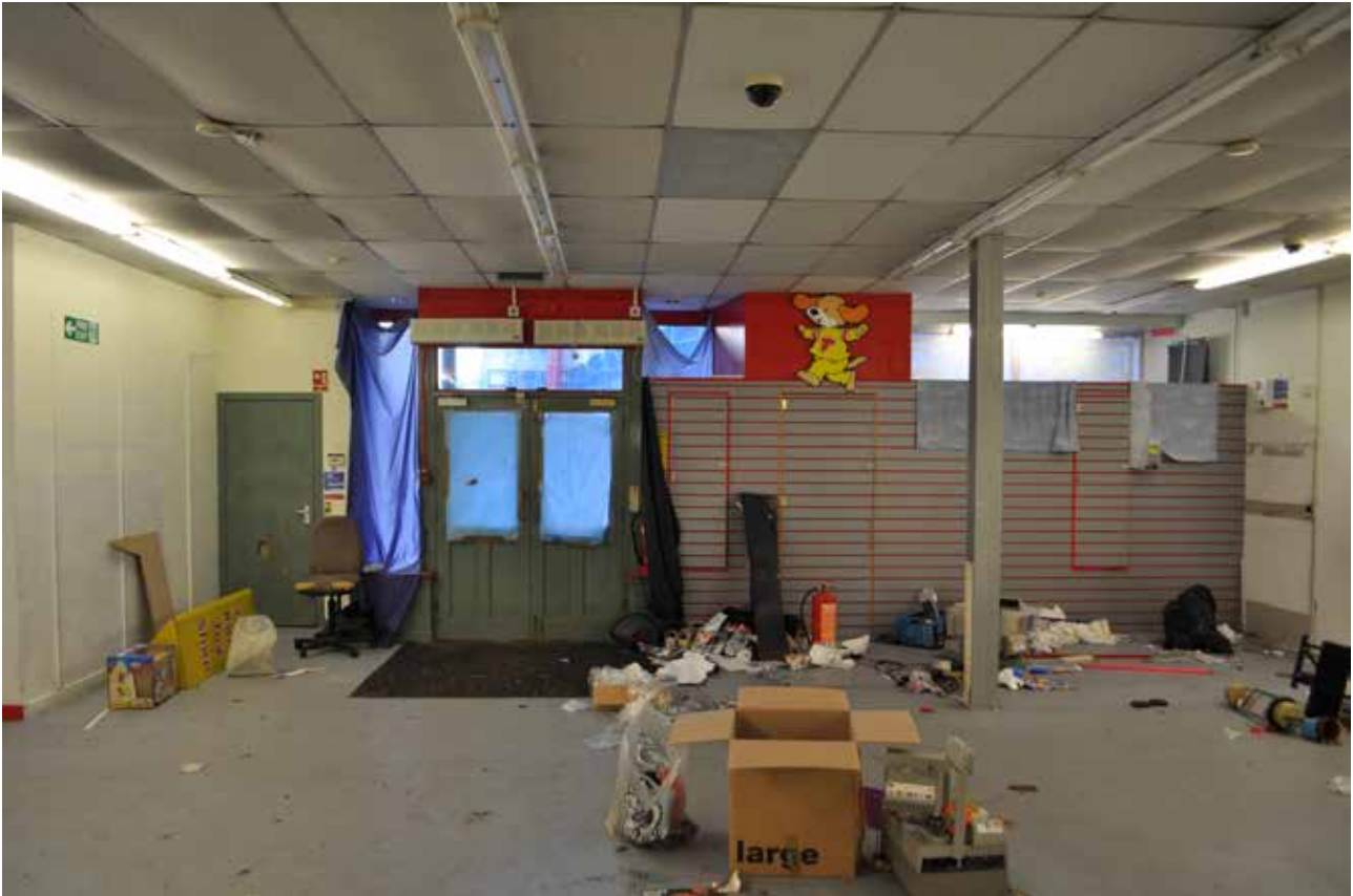
Plate 110: Building 3, Room 1/1, general view of NNW facing wall, looking SSE