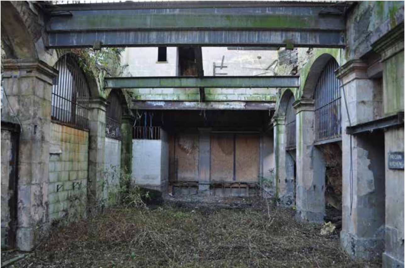
Plate 170: Building 4, Room 1/1, general view of NNW facing wall, looking SSE