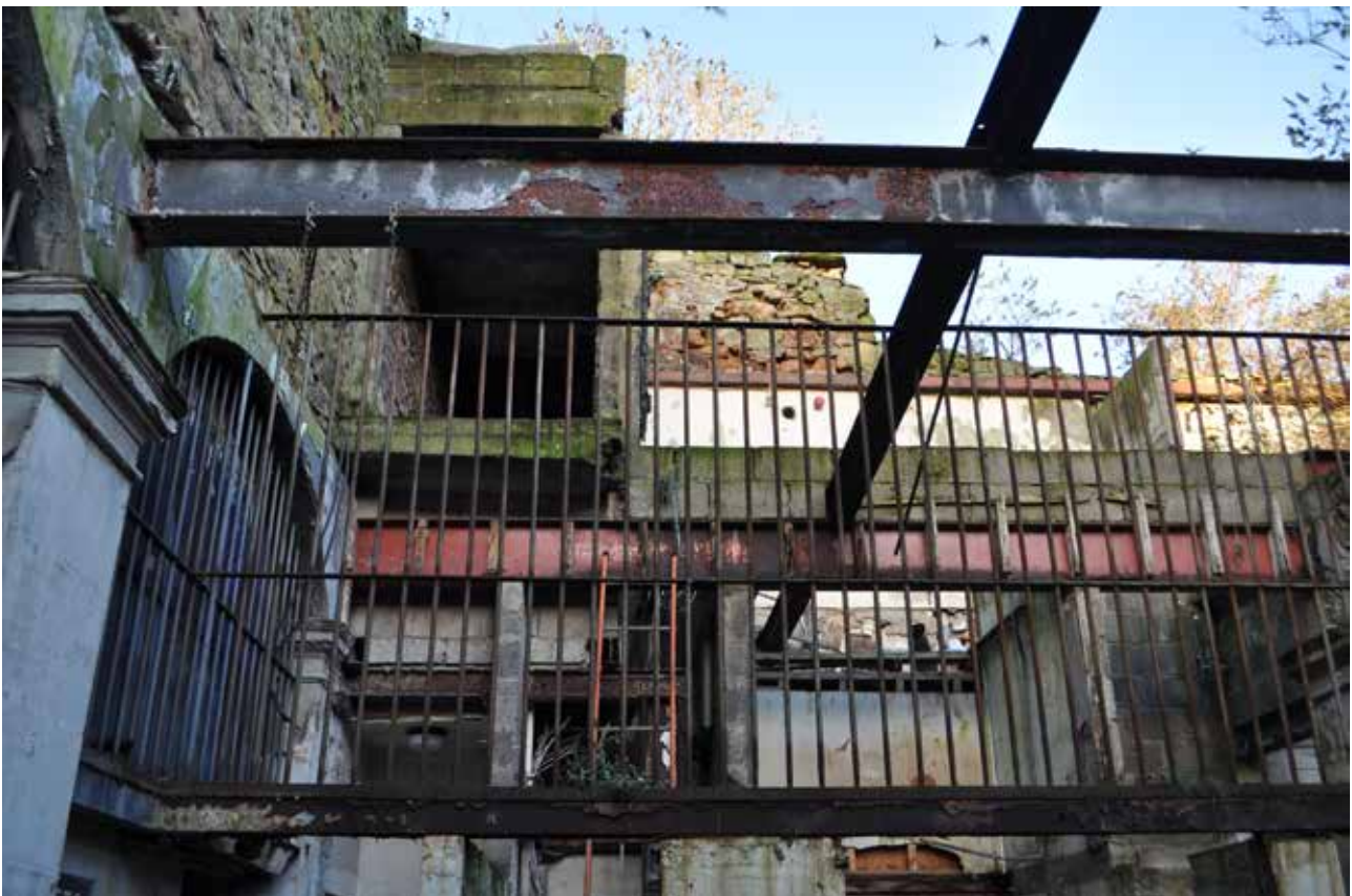
Plate 159: Building 4, Room 1/1, general view of SSE facing wall - west end, upper detail, looking NNW