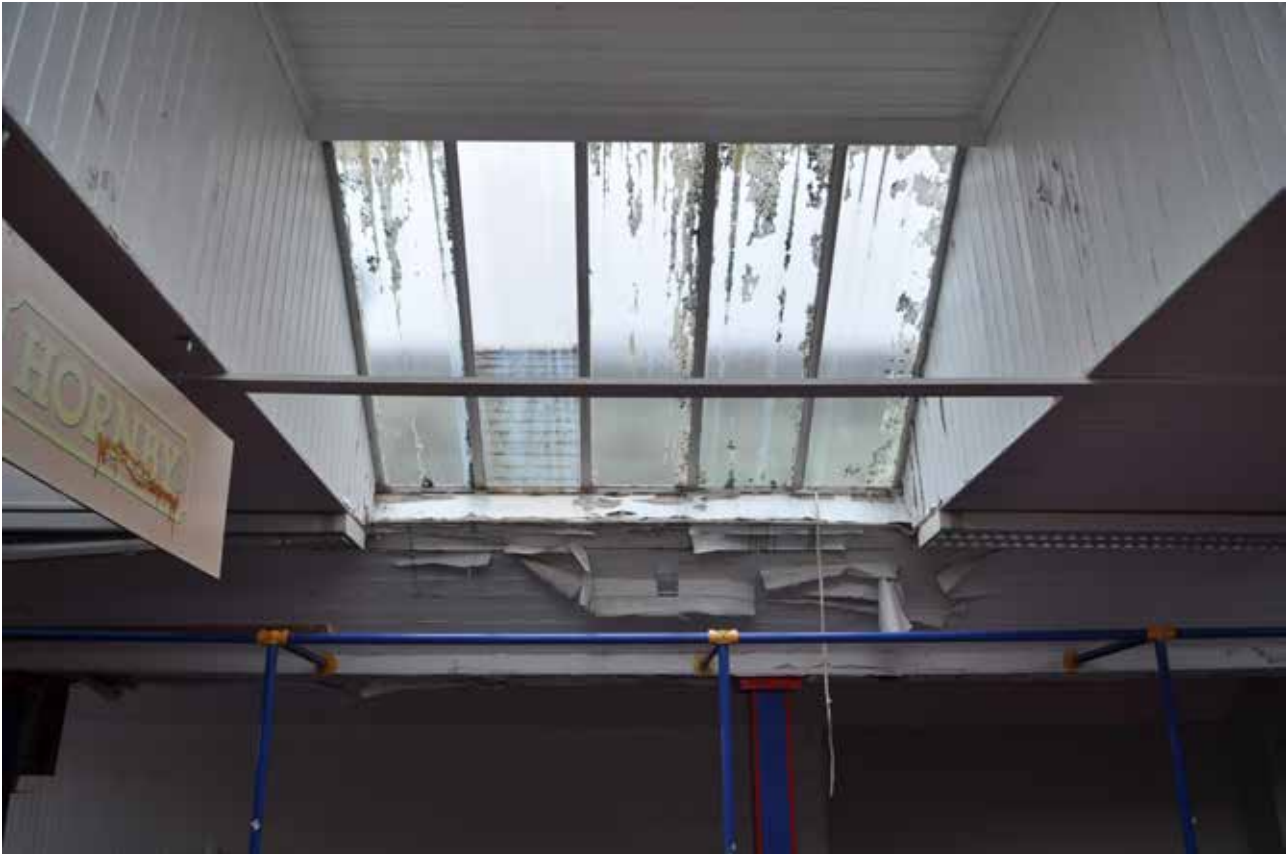
Plate 82: Building 1, Room 2/6, detailed view of central skylight - west, looking WSW