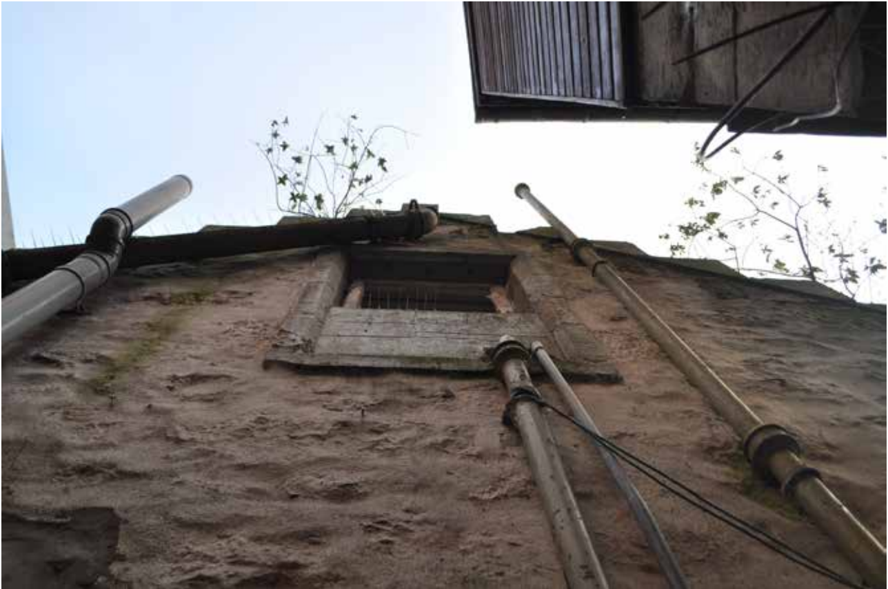
Plate 214: Building 5, detail view of upper window on NNW facing elevation of east building, looking SSE