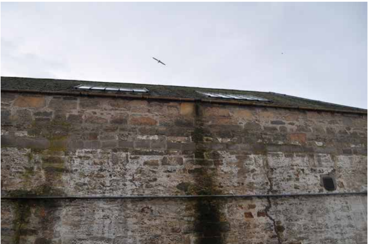
Plate 15: Building 1, general view of roof detail above blocked openings (004) and (006) showing skylights on ENE facing elevation, looking west