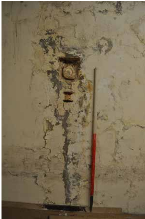
Plate 108: Building 3, Room 0/2, detailed view of pipework set within ENE facing wall, looking WSW