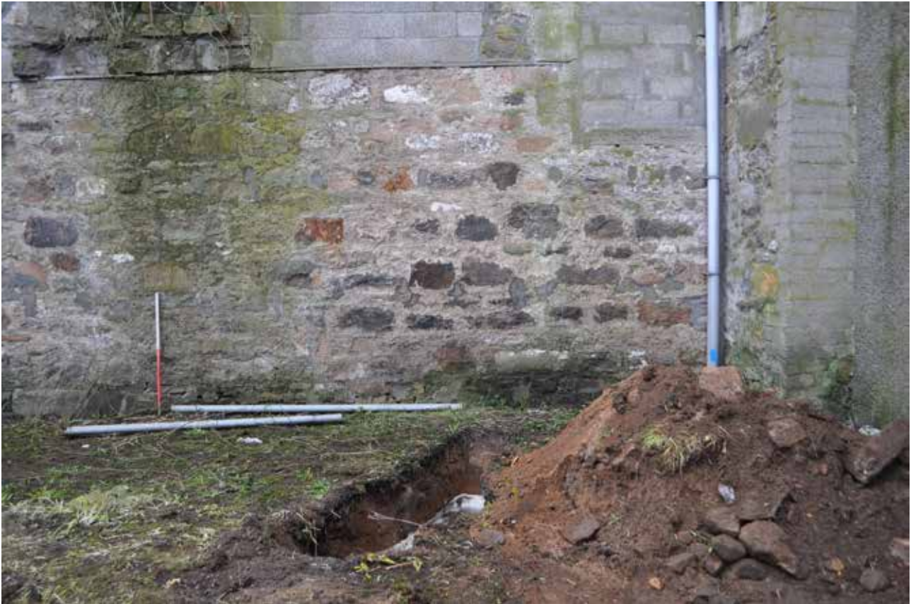
Plate 8: Building 1, general view of NNW facing elevation - upper west detail, looking SSE