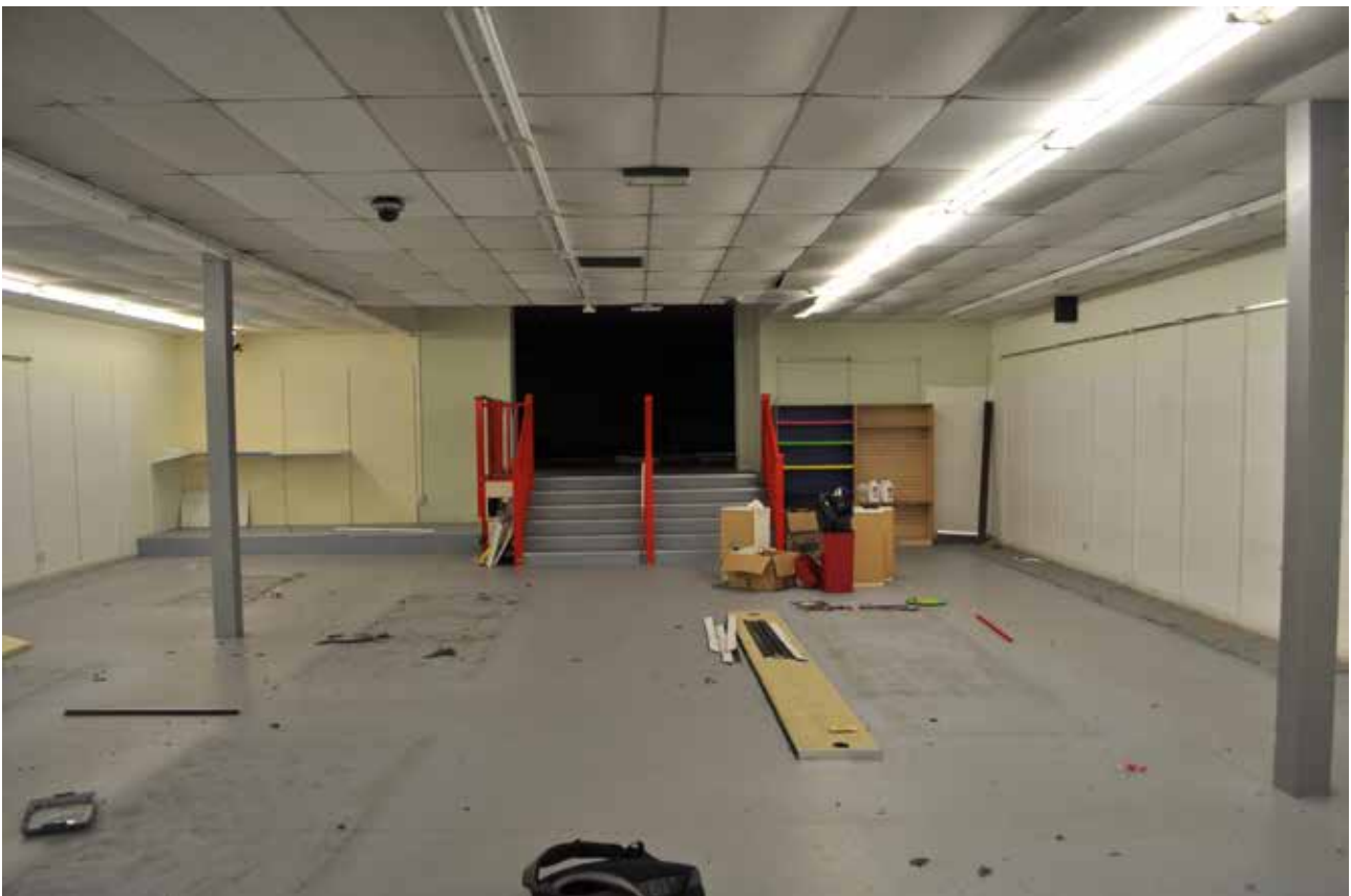
Plate 111: Building 3, Room 1/1, general view of SSE facing wall, looking NNW