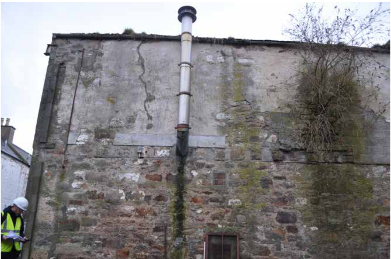
Plate 7: Building 1, general view of NNW facing elevation - lower west detail, looking SSE