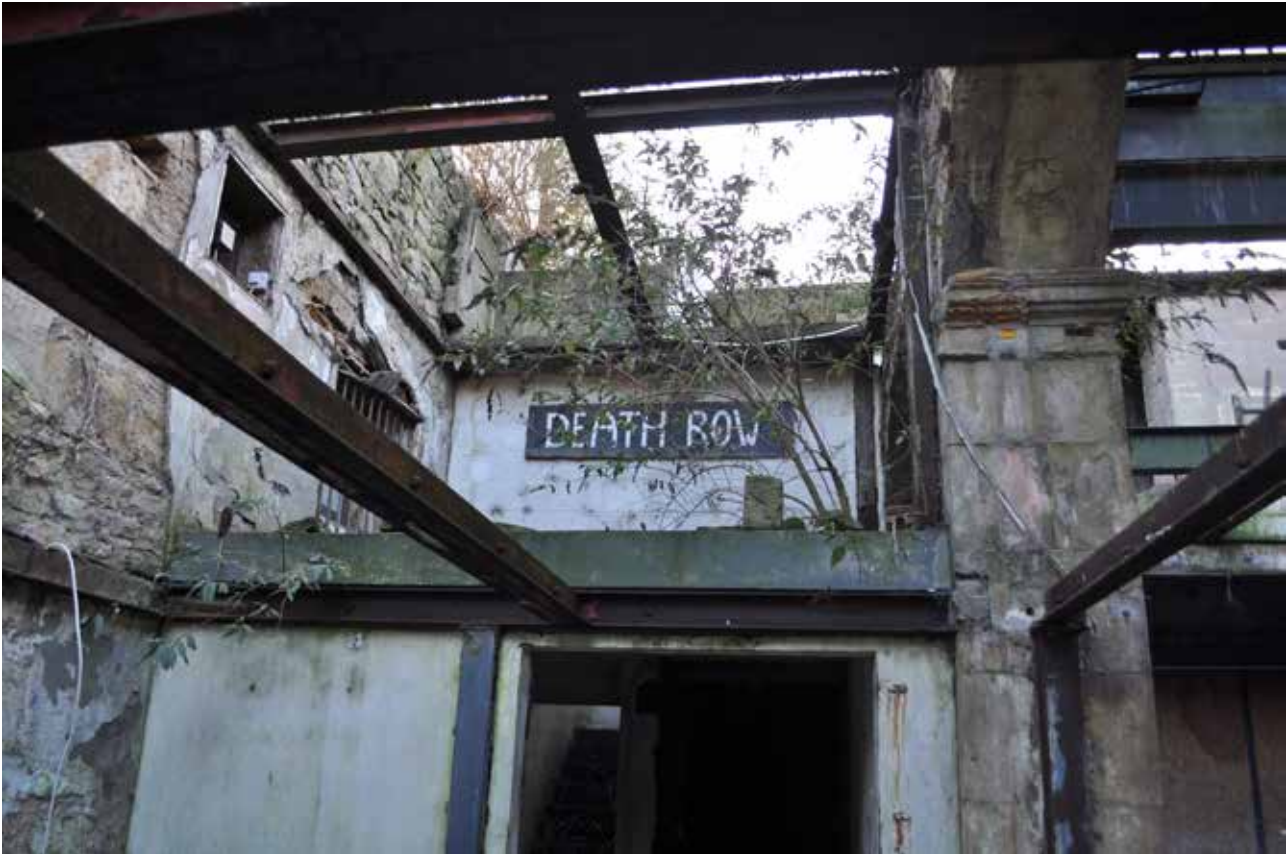
Plate 196: Building 4, Building 4, Room 1/14, general view of NNW facing wall - upper detail, looking SSE