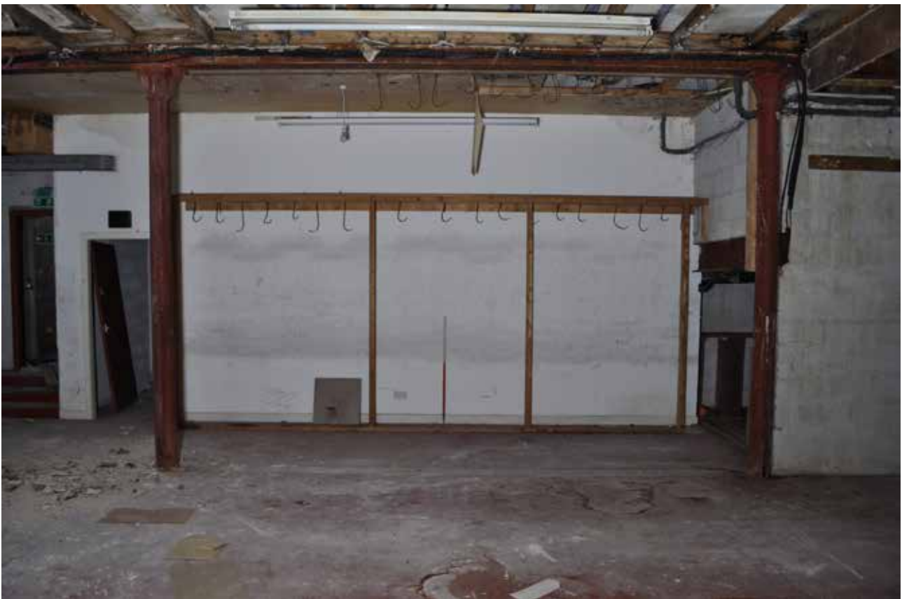
Plate 31: Building 1, Room 0/2, general view of entrance on NNW facing wall, looking SSE