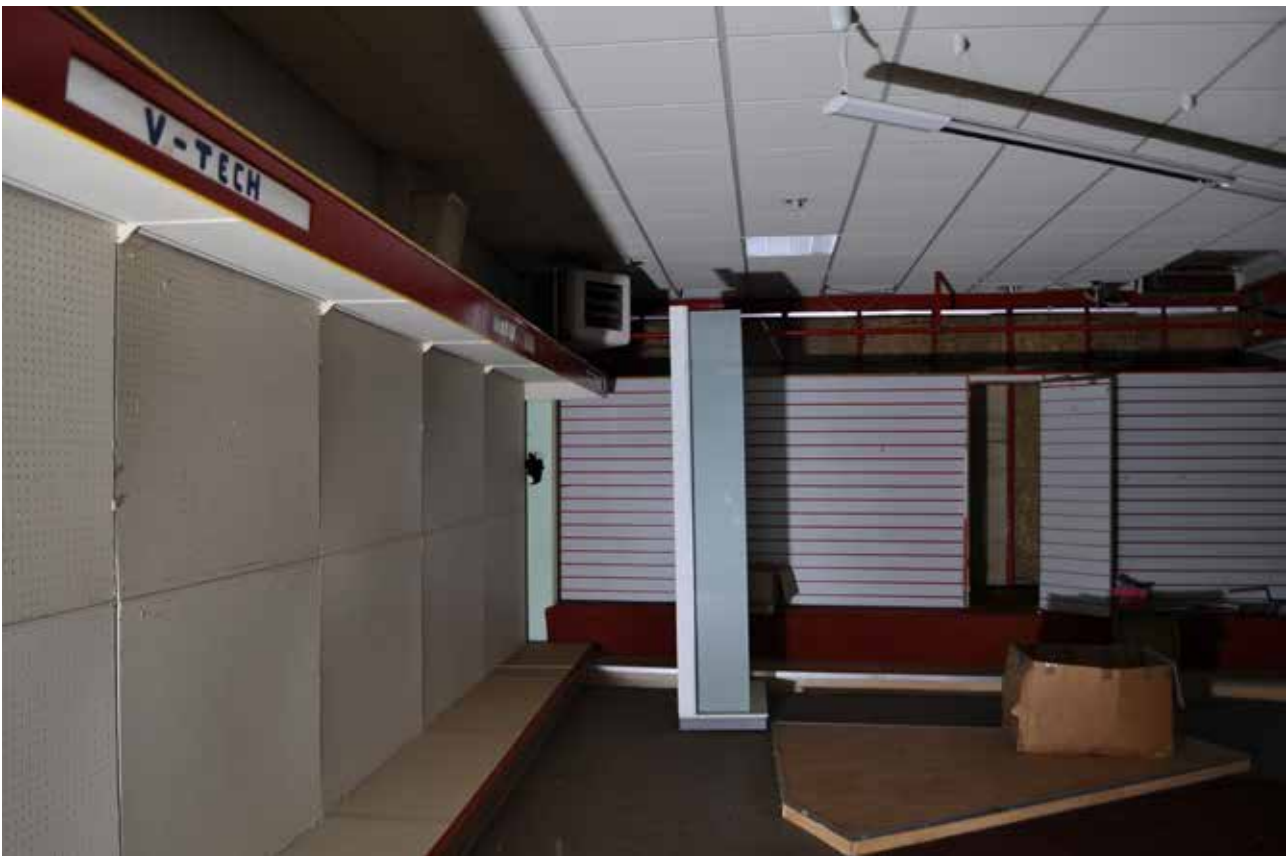
Plate 45: Building 1, Room 1/1, general view of window display area on NNW facing wall - east end, looking SSE