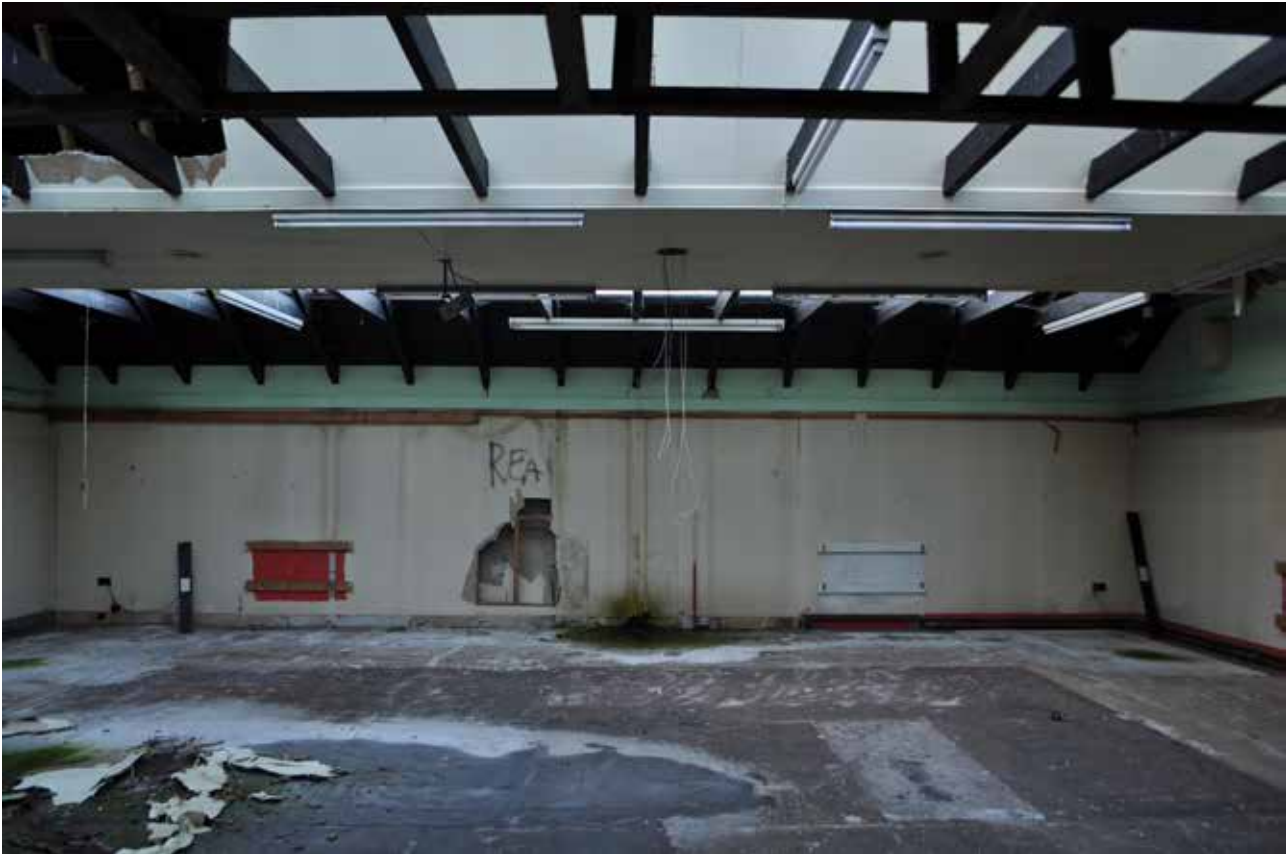
Plate 58: Building 1, Room 2/1, general view of SSE facing wall, looking NNW