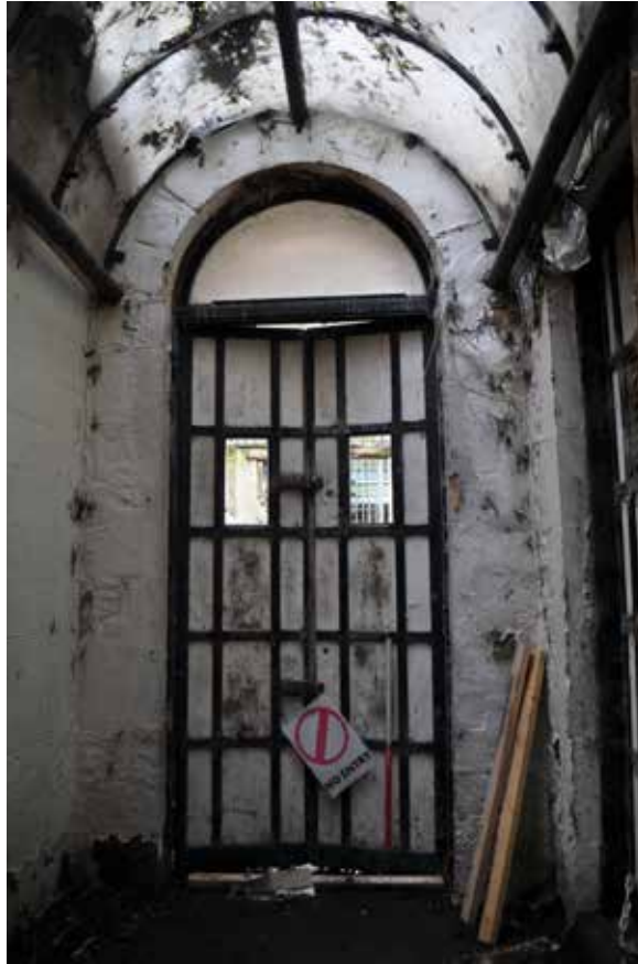
Plate 154: Building 4, general view of NNW facing elevation, looking SSE