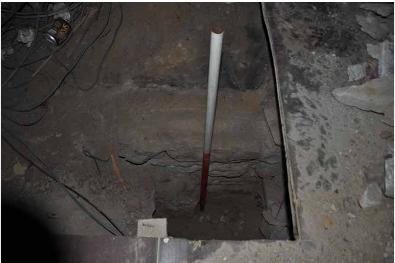
Plate 223: Building 1, ENE facing elevation of wall (007) in test pit 6