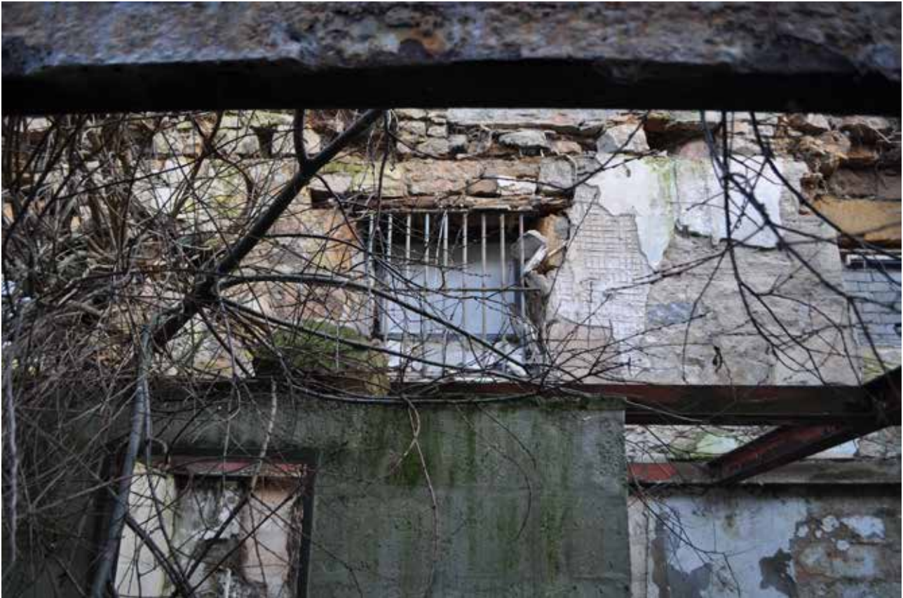
Plate 194: Building 4, detailed view of window on WSW facing wall above Room 1/13, looking ENE