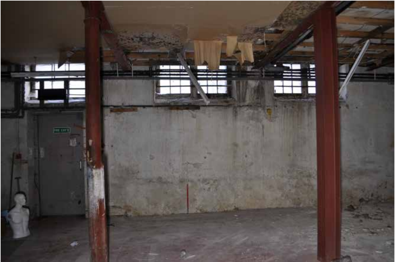
Plate 30: Building 1, Room 0/2, general view of WSW facing wall, looking ENE