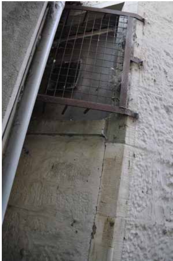
Plate 209: Building 5, detailed view of chamfered wall on northeast corner of NNW facing elevation - upper detail, looking SSW