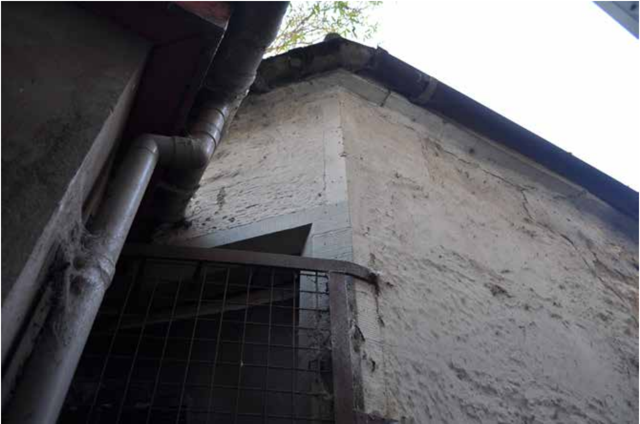
Plate 210: Building 5, detailed view of chamfered wall on northeast corner of NNW facing elevation - roof detail, looking SSW