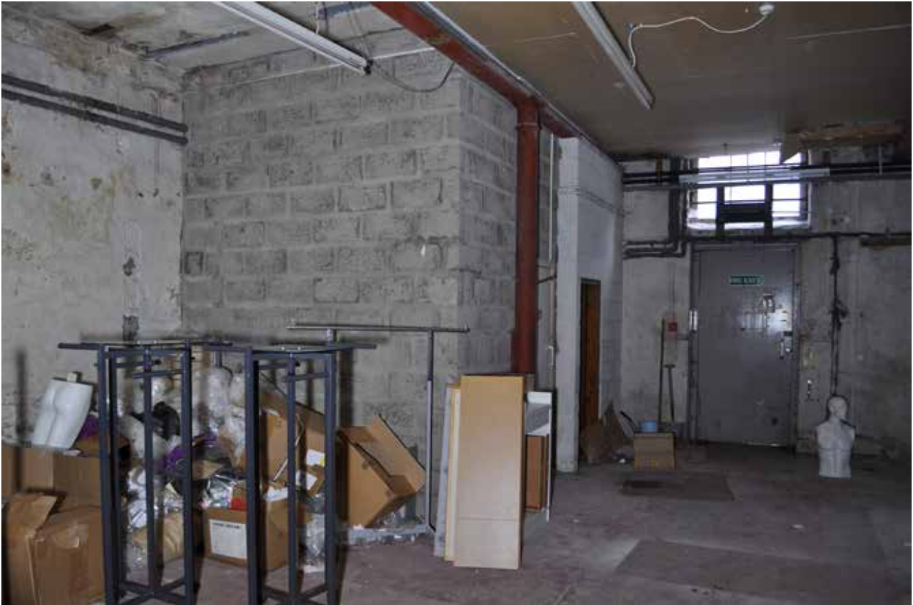
Plate 36: Building 1, general view of northeast corner of Room 0/2, looking northeast