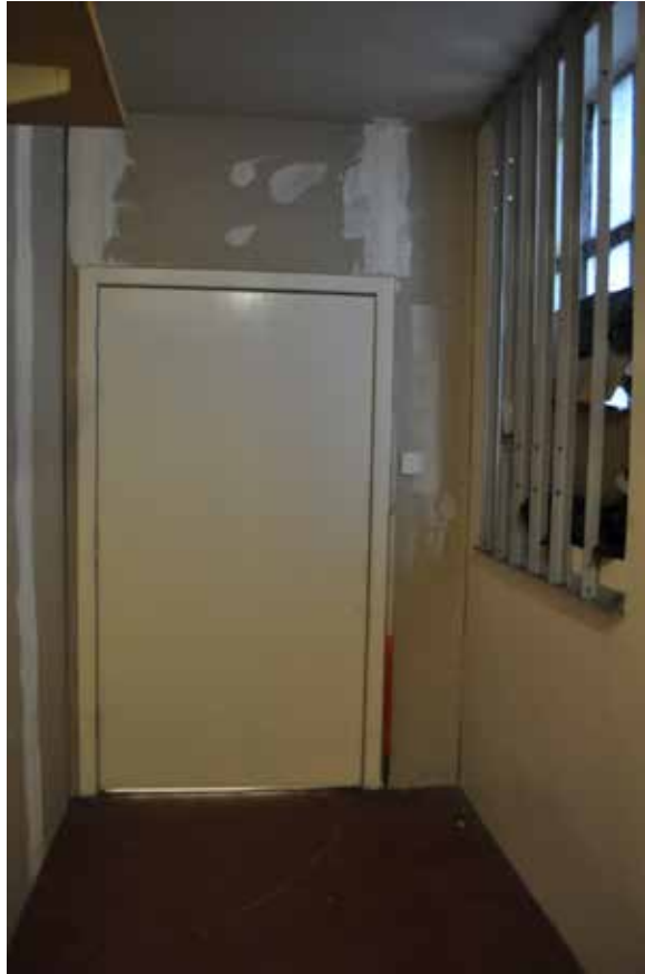
Plate 126: Building 3, general view of NE corner of Room 1/4, looking north