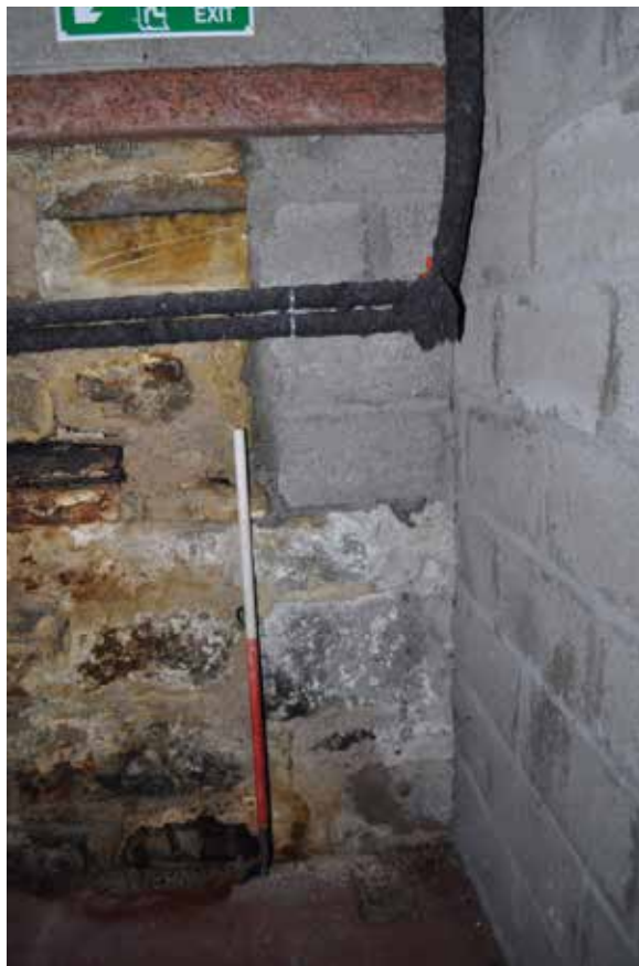
Plate 55: Building 1, Room 1/4, detailed view of WSW facing wall showing blocked opening (006), looking ENE