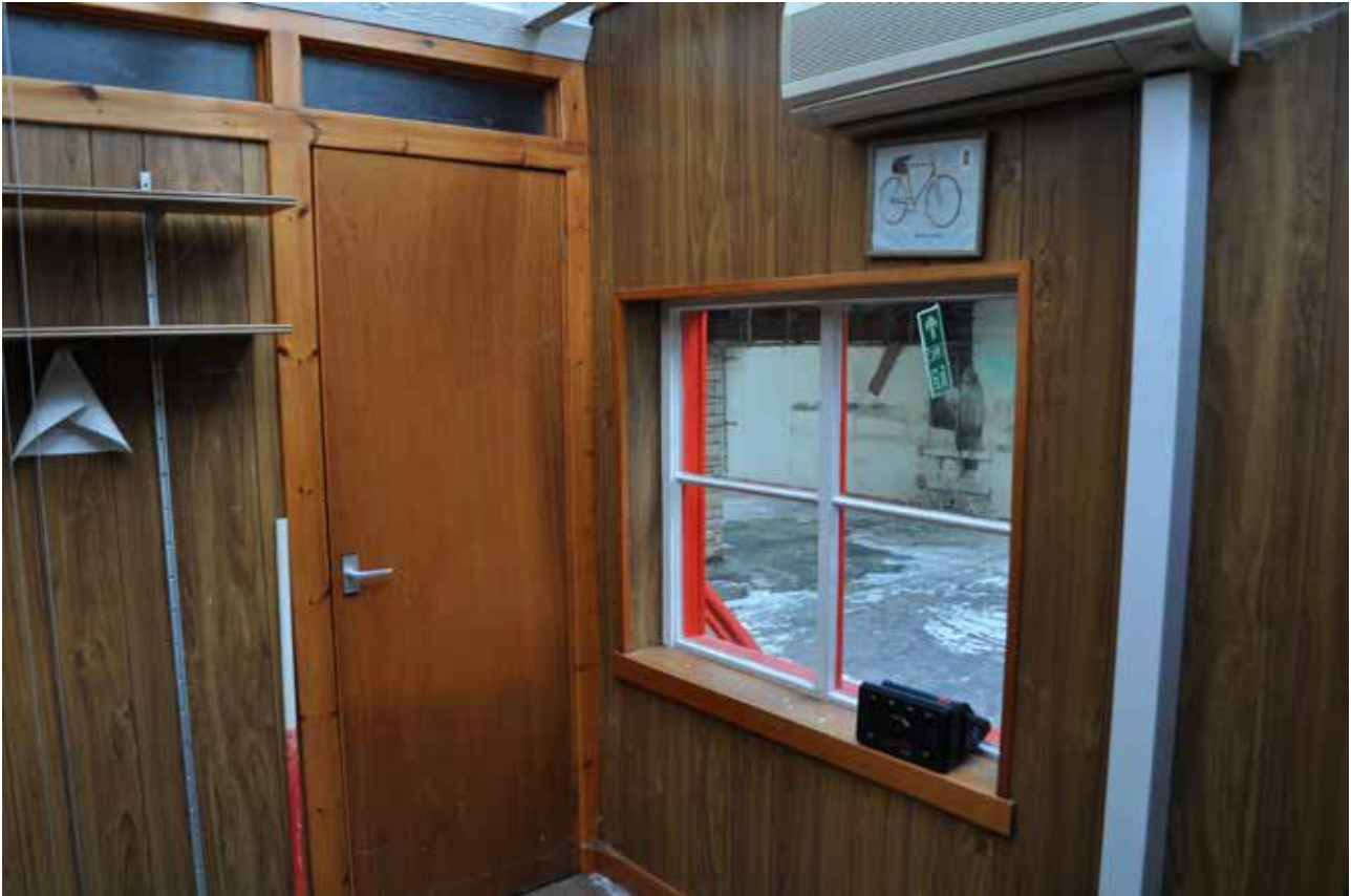
Plate 74: Building 1, Room 2/4, general view of NE corner of Room 2/4, looking northeast