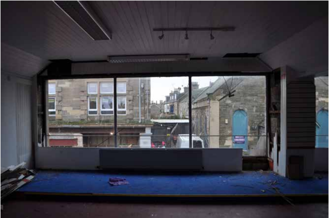
Plate 78: Building 1, Room 2/6, general view of NNW facing wall - east end, looking SSE