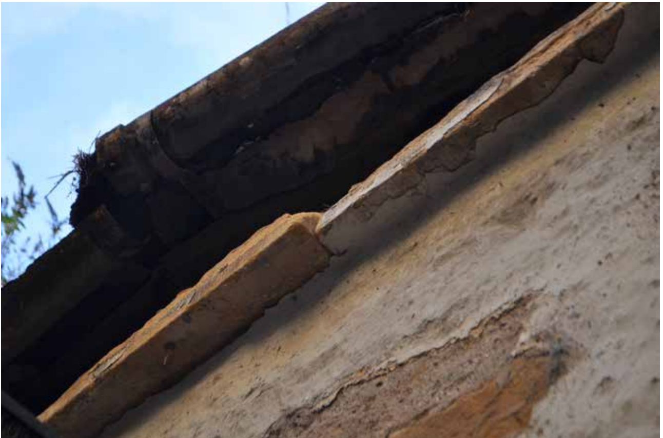
Plate 207: Building 5, detailed view of coping stones on NNW facing elevation, looking southeast