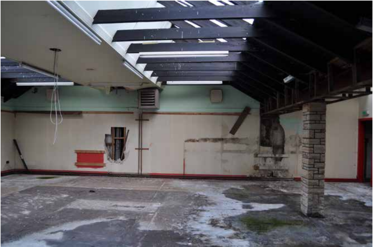
Plate 64: Building 1, Room 2/1, general view of WSW facing wall, looking ENE