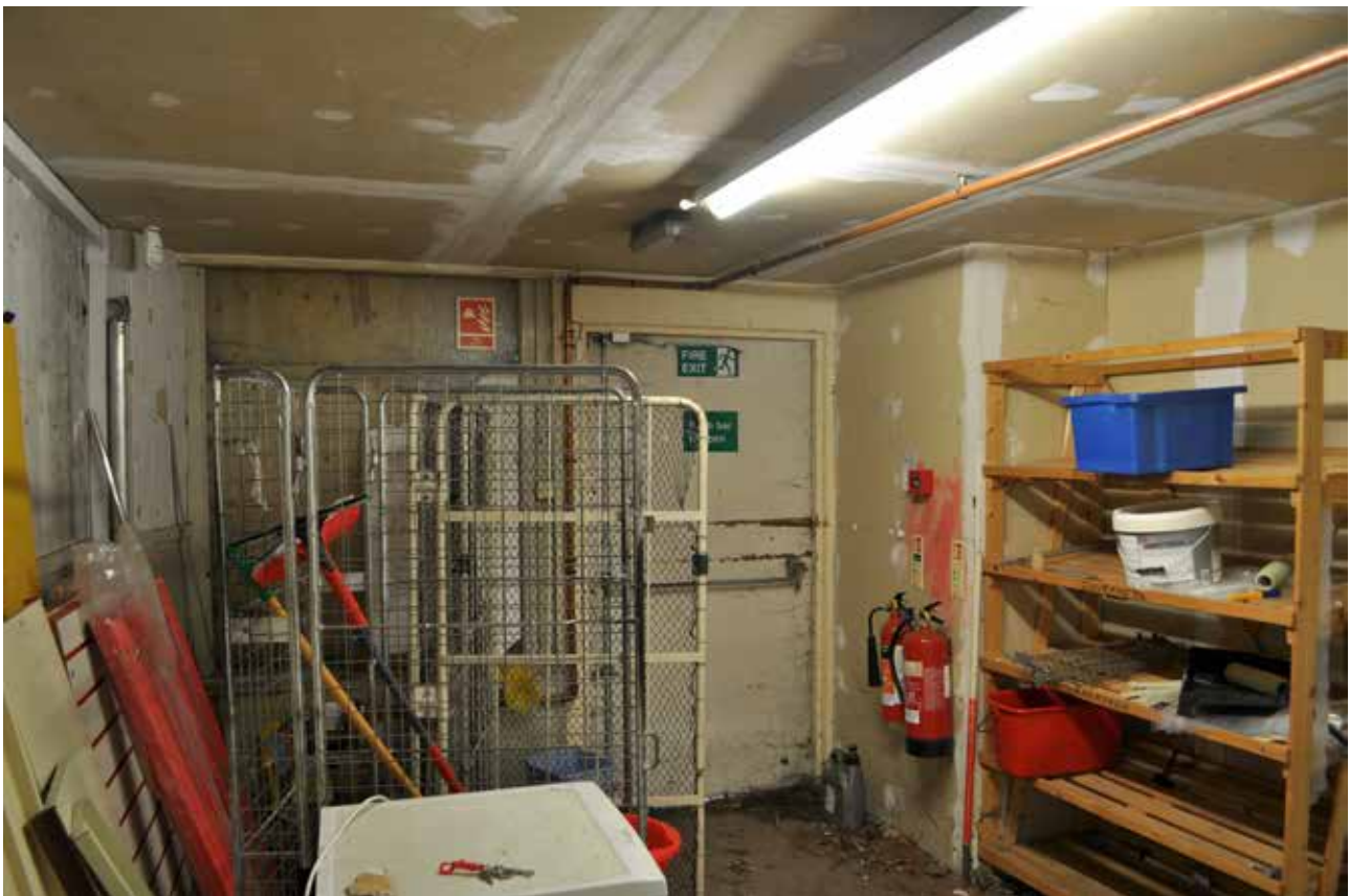
Plate 117: Building 3, Room 1/3, general view of NNW facing wall, looking south