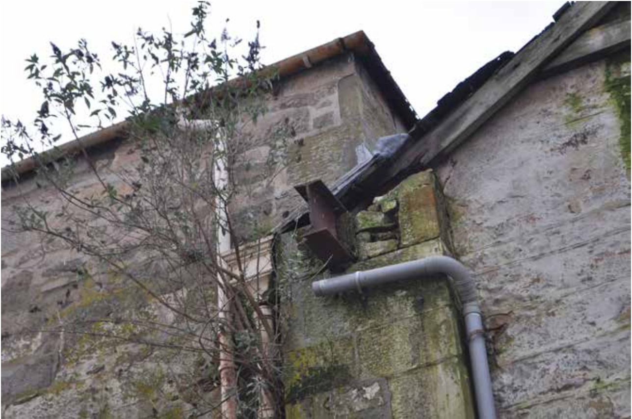
Plate 18: Building 1, detail view of steel roof beam on southern edge of south gable on ENE facing elevation, looking WSW