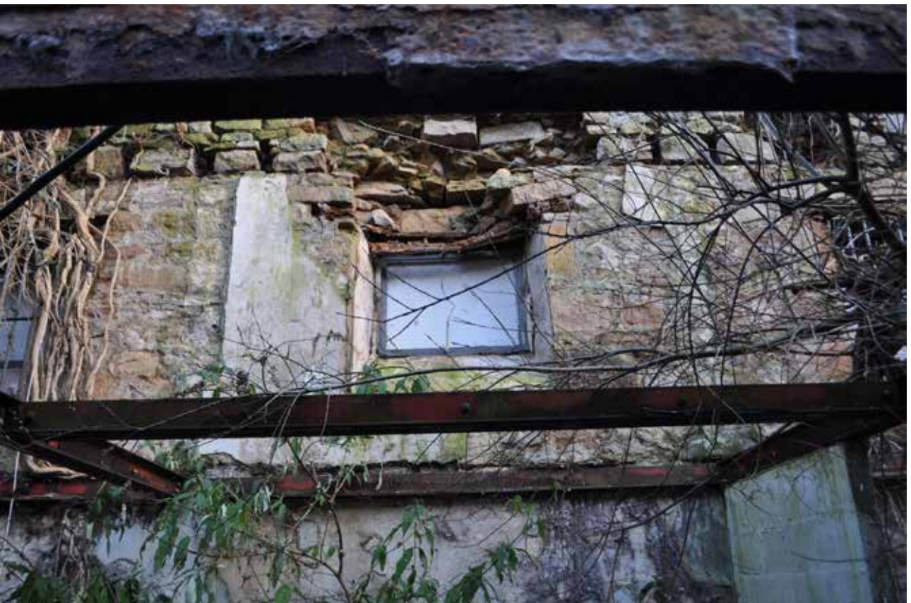
Plate 191: Building 4, Room 1/12, detailed view of south window on WSW facing wall, looking ENE