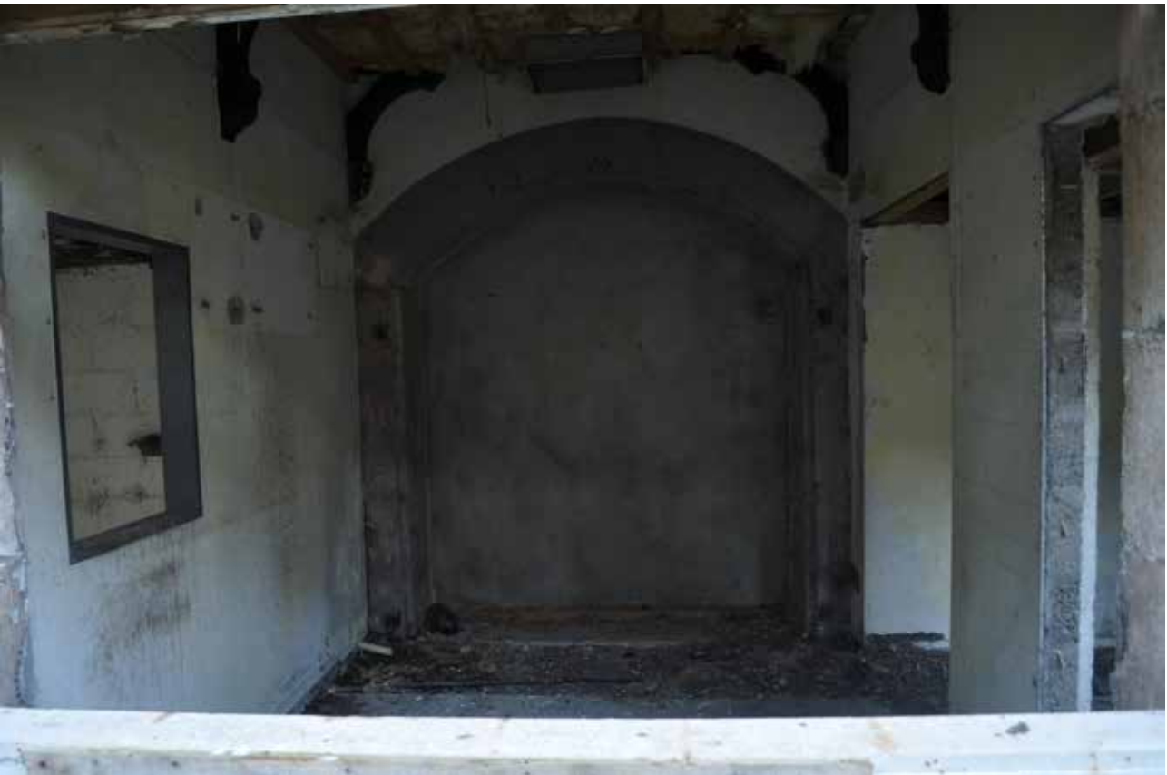
Plate 177: Building 4, Room 1/3, general view of ENE facing elevation, looking WSW