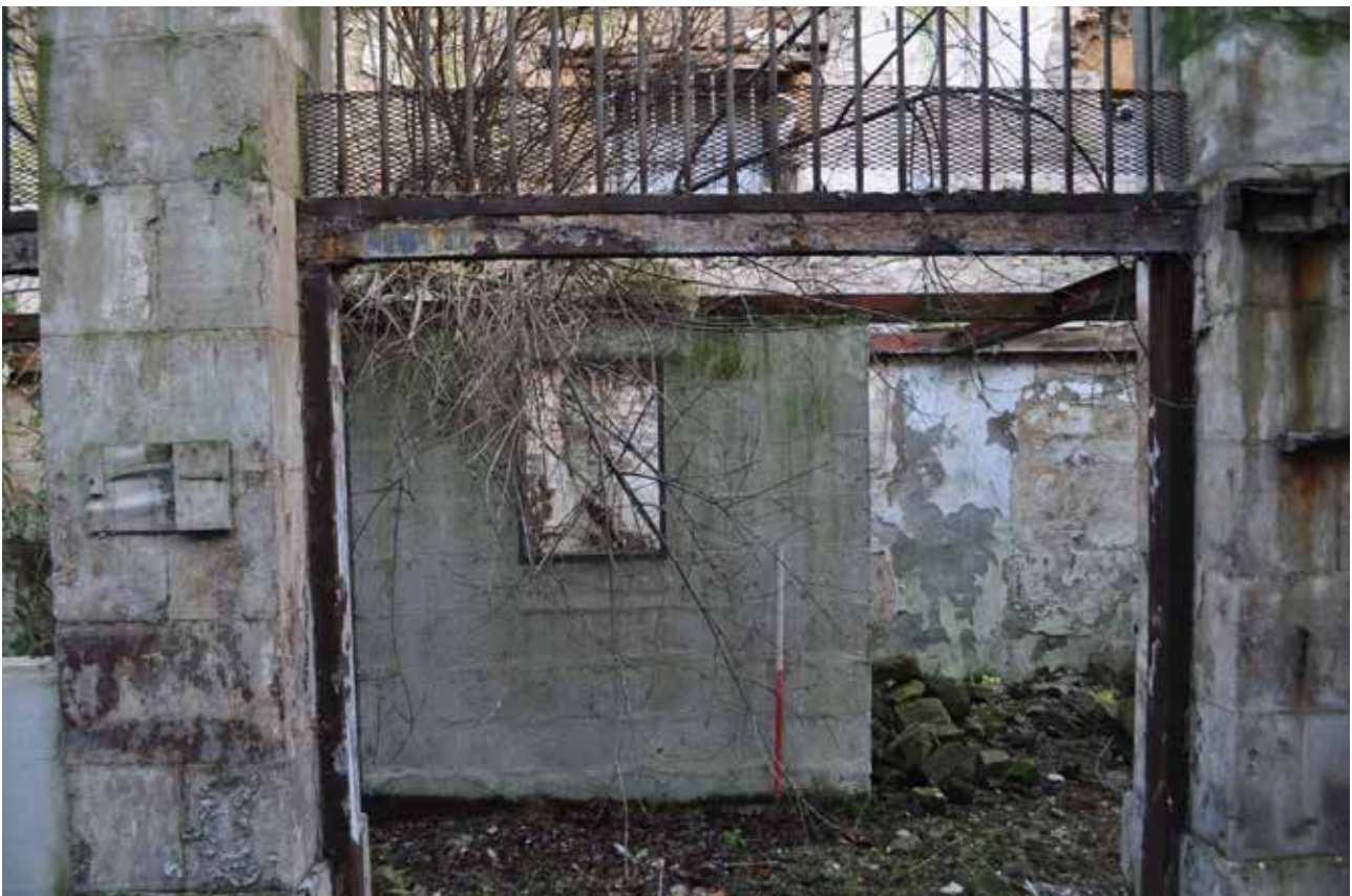
Plate 197: Building 4, Room 1/14, general view of WSW facing wall showing Room 1/13, looking ENE