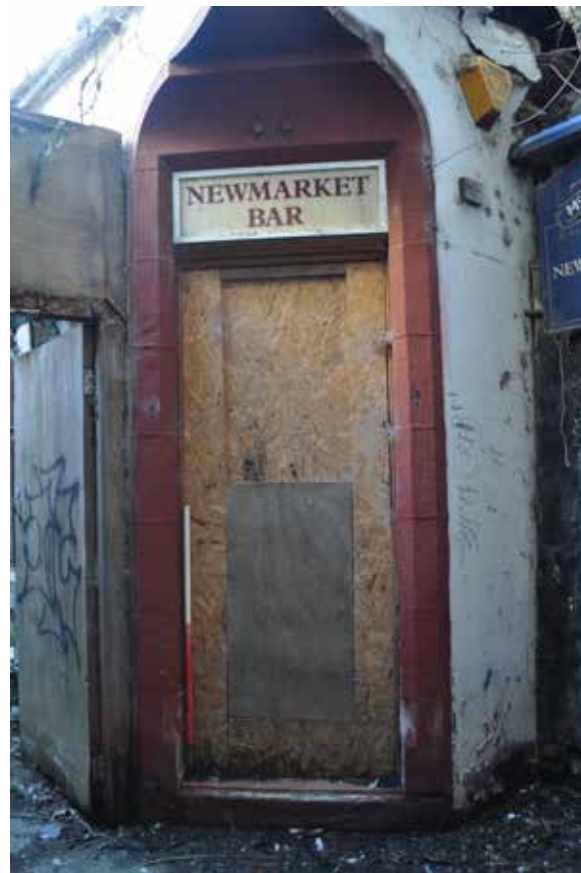
Plate 203: Building 5, detailed view of door chamfered wall on WSW facing elevation, looking southeast