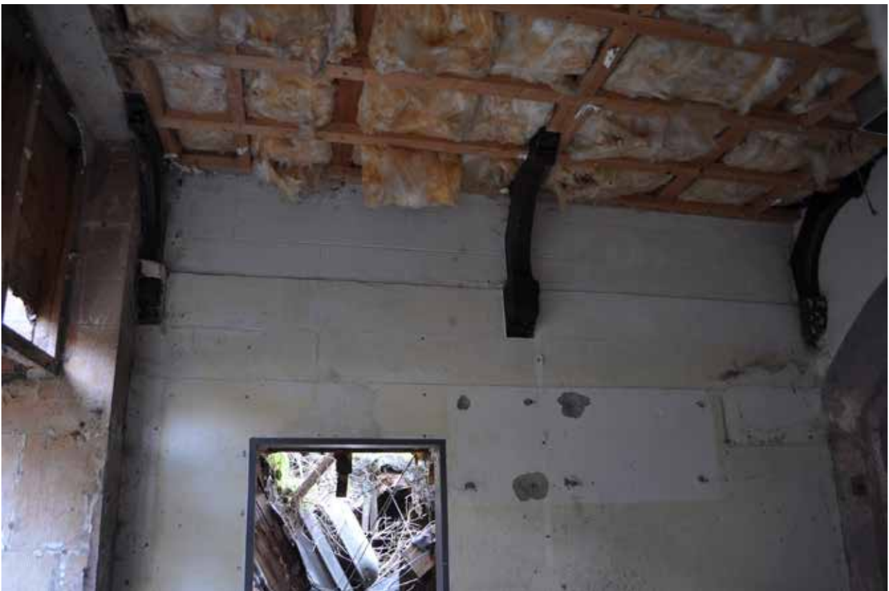
Plate 175: Building 4, Room 1/3, general view of NNW facing elevation - upper detail, looking SSE