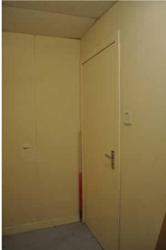
Plate 132: Building 3, general view of southeast corner of Room 1/6, looking southeast