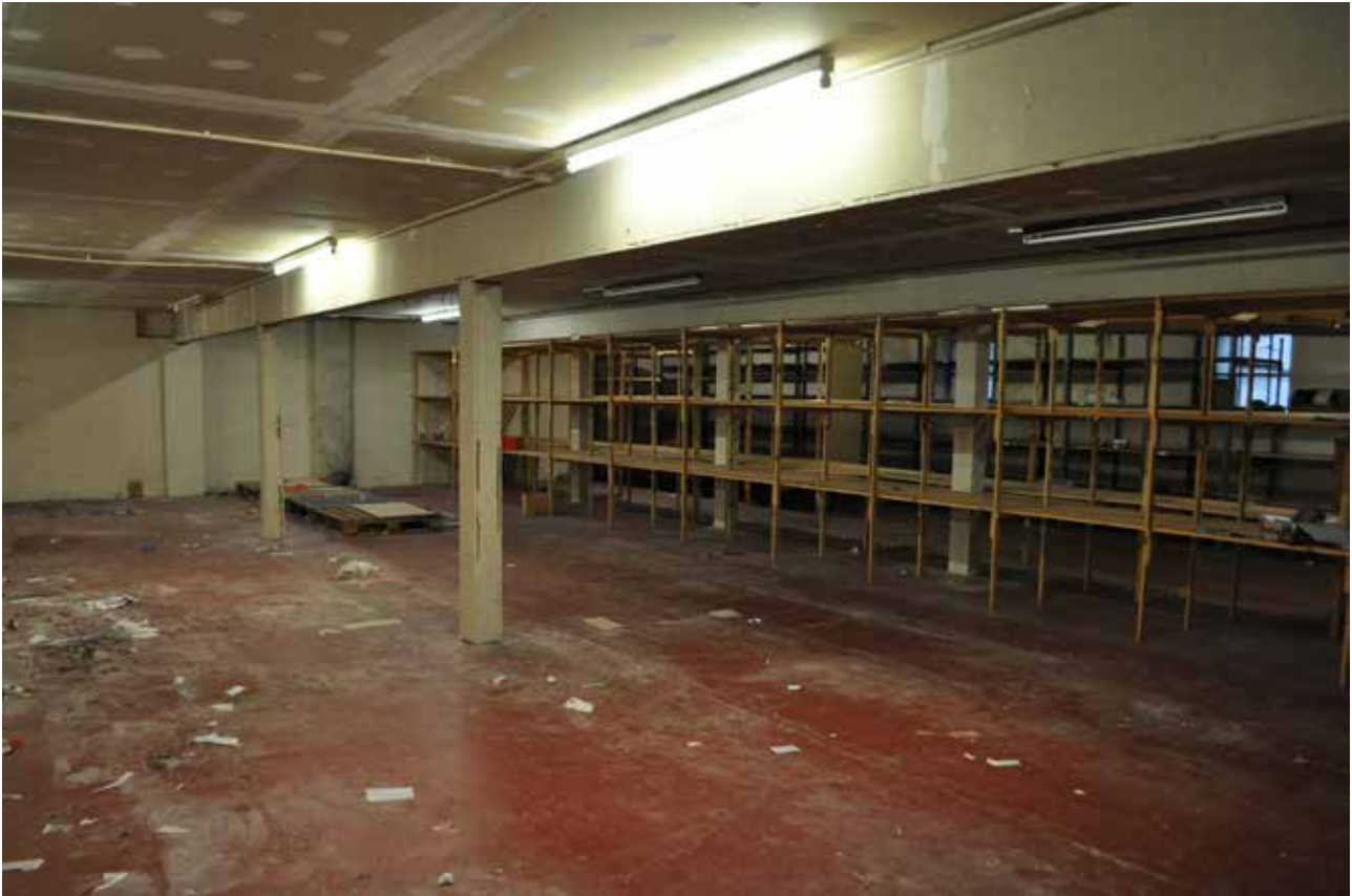
Plate 102: Building 3, general view of NE corner of Room 0/2, looking northeast