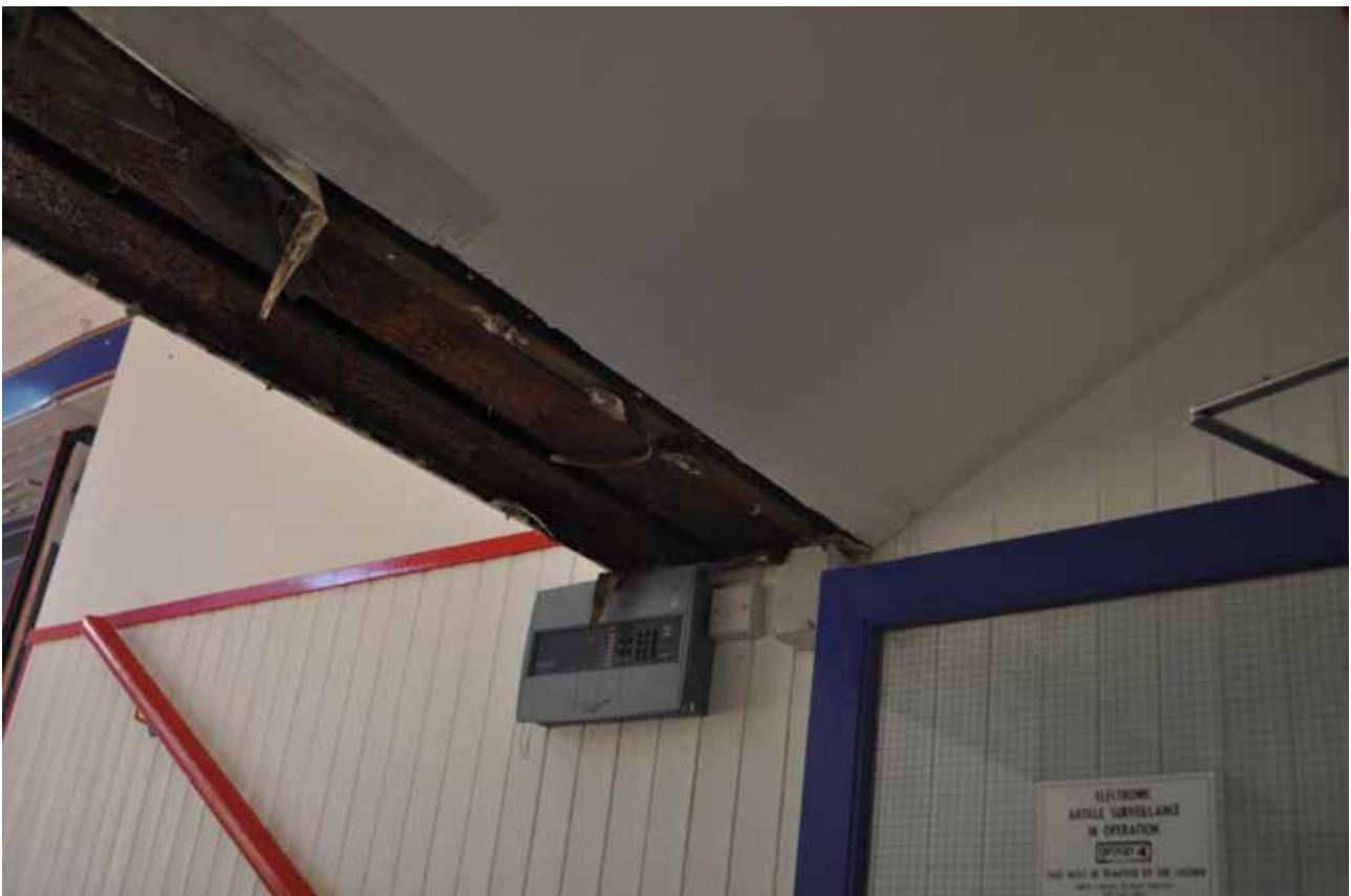
Plate 87: Building 1, Room 2/6, detailed view of beams above stairs, looking WSW