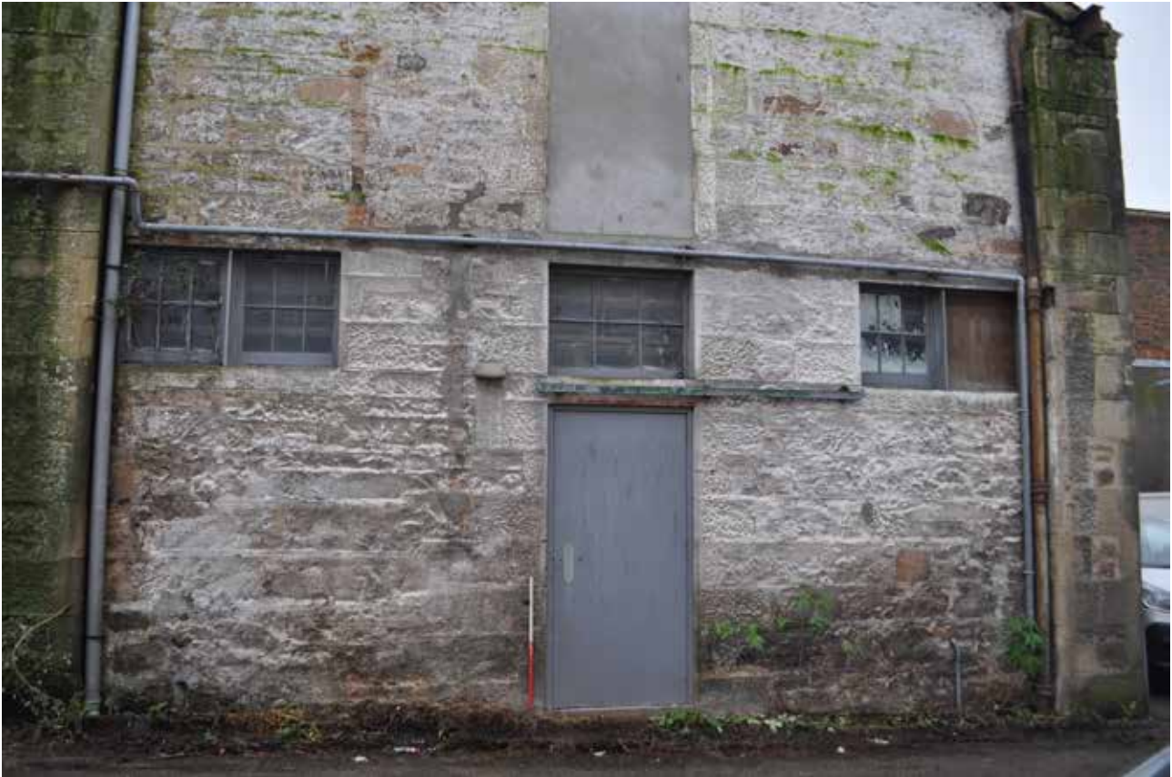
Plate 20: Building 1, general view of north gable on ENE facing elevation - lower detail, looking WSW