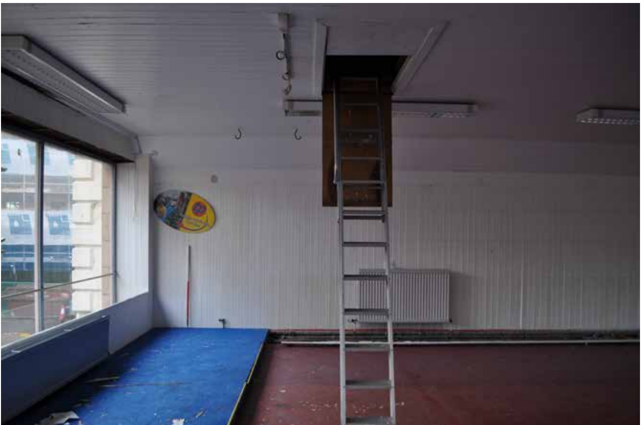
Plate 81: Building 1, Room 2/6, general view of ENE facing wall - south end, looking WSW