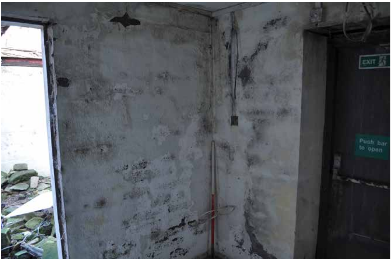
Plate 199: Building 4, general view of NE corner of Room 1/15, looking northeast