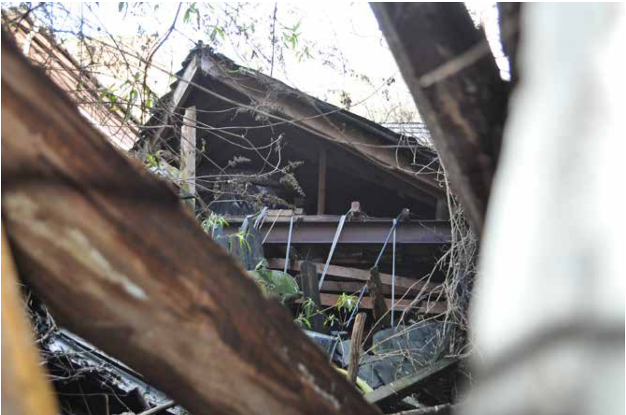
Plate 205: Building 5, Internal collapse detail taken from window on WSW facing elevation, looking northeast