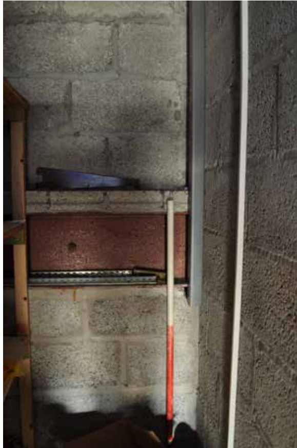
Plate 90: Building 1, general view of Room 2/7 looking towards SSE facing wall - lower detail, looking NNW