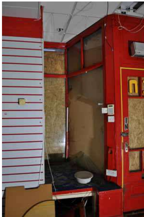
Plate 43: Building 1, detailed view of windows to east of entrance in Room 1/1, looking southwest