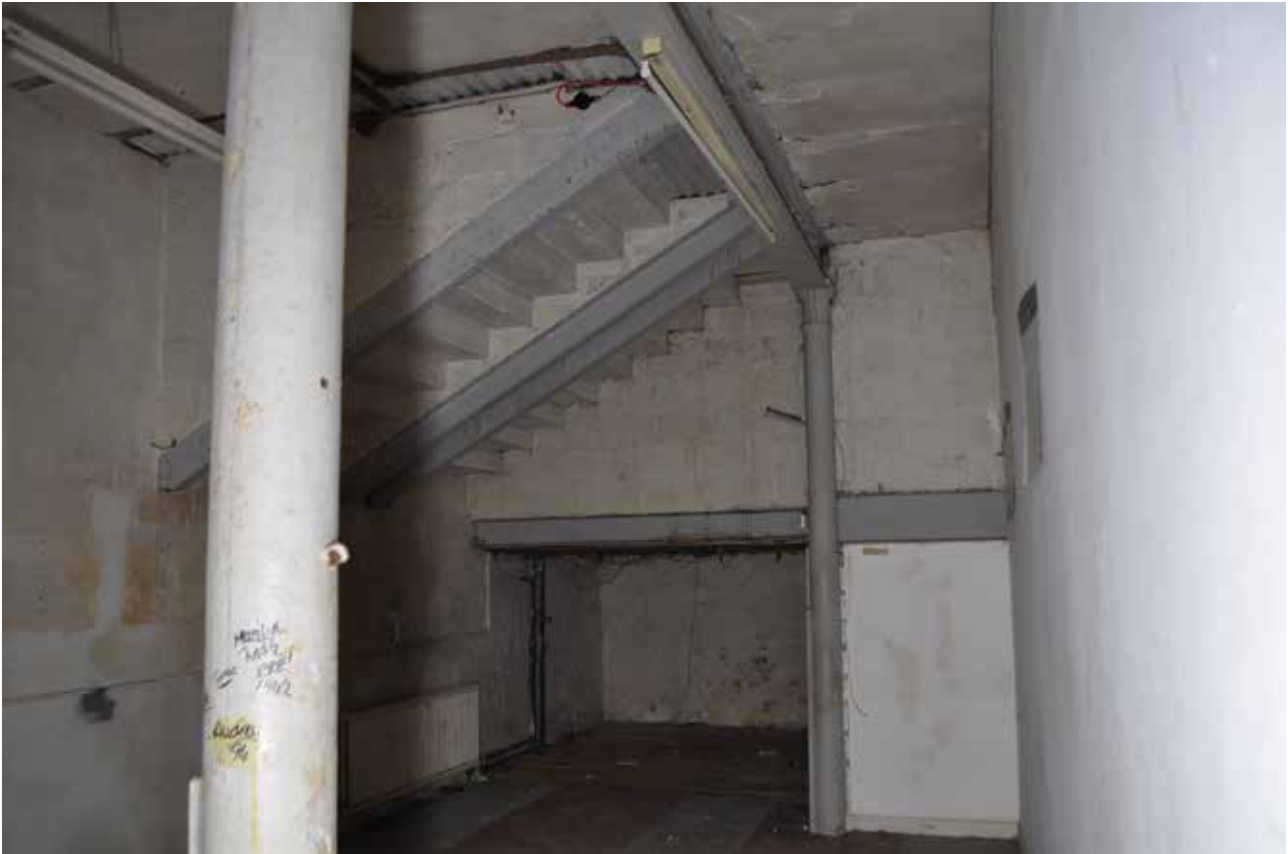
Plate 38: Building 1, Room 0/3, general view of ENE facing wall, looking WSW