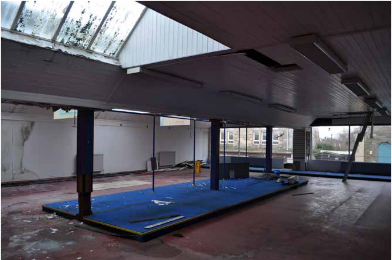
Plate 86: Building 1, Room 2/6, general view of Room 2/6 , looking southeast