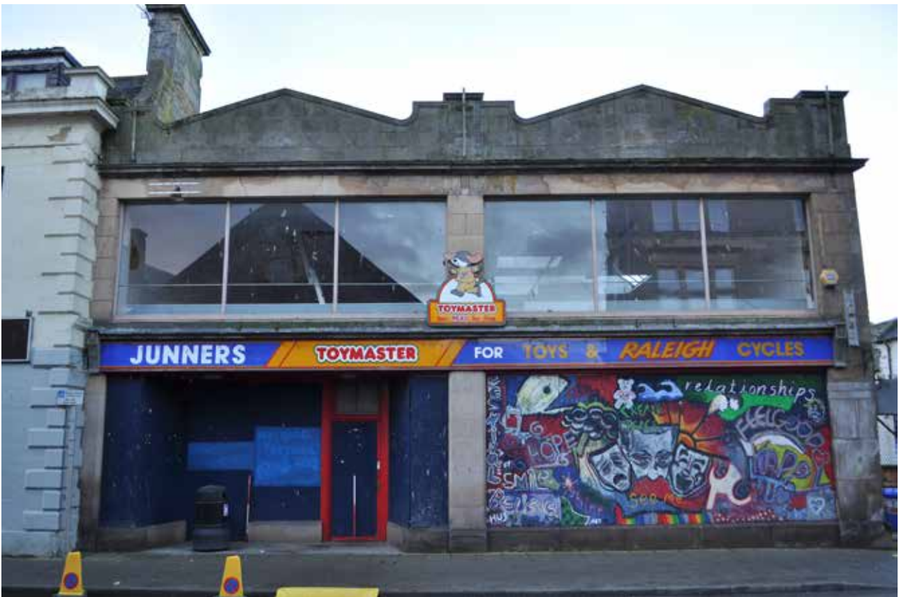
Plate 23: Building 1, general view of SSE facing elevation, looking NNW