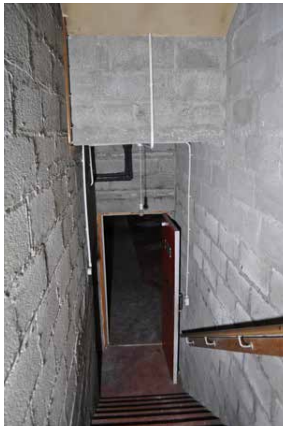
Plate 57: Building 1, Room 1/4, general view of door on NNW facing wall, looking SSE