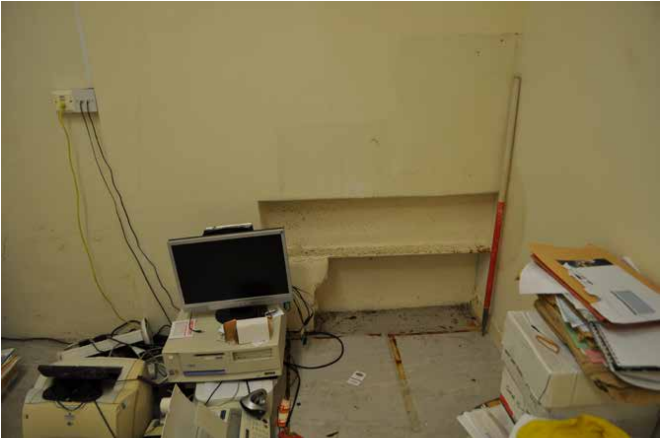
Plate 144: Building 3, general view of NE corner of Room 1/11 - lower detail, looking northeast