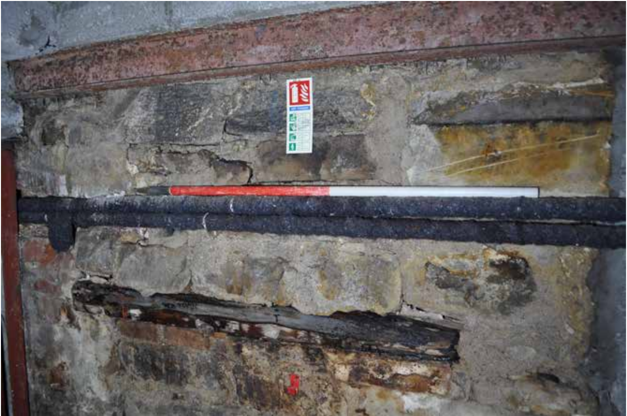
Plate 56: Building 1, Room 1/4, detailed view of WSW facing wall showing blocked opening (007), looking northeast