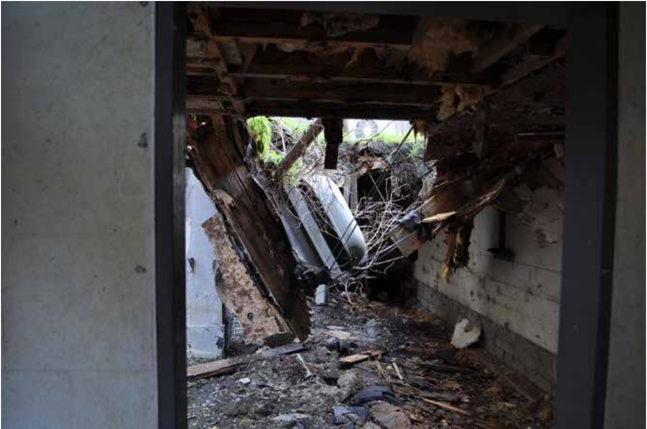
Plate 174: Building 4, Room 1/2, general view of NNW facing elevation, looking SSE