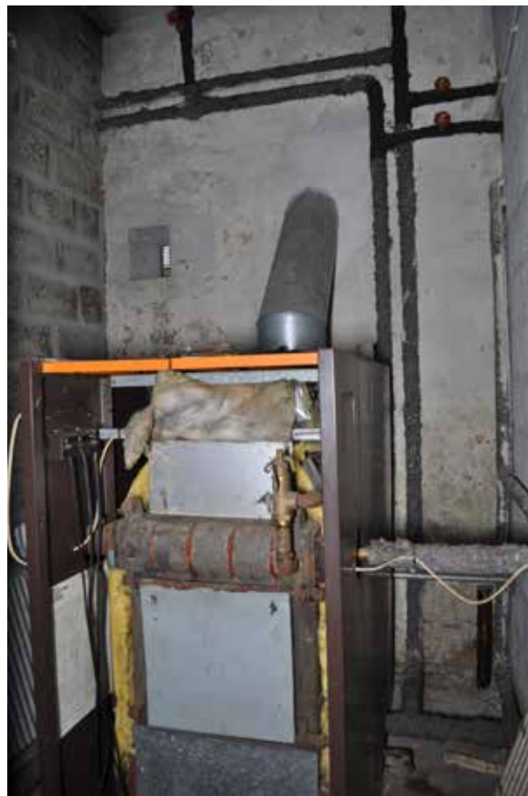
Plate 39: Building 1, Room 0/4, general view of SSE facing wall, looking NNW