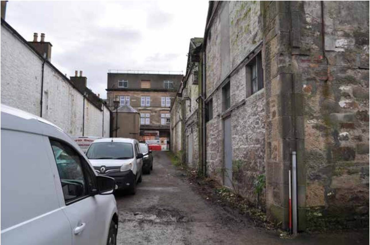
Plate 22: Building 1, general view of northeast corner, looking south