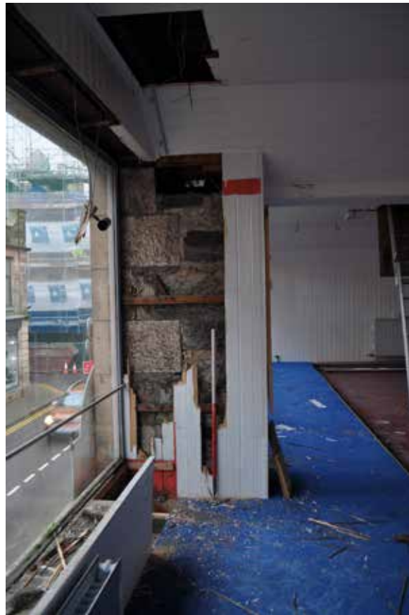
Plate 79: Building 1, Room 2/6, detailed view of exposed stone in centre of NNW facing wall, looking WSW