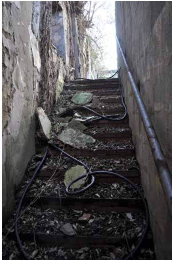
Plate 187: Building 4, Room 1/10, general view of stairs, looking SSE