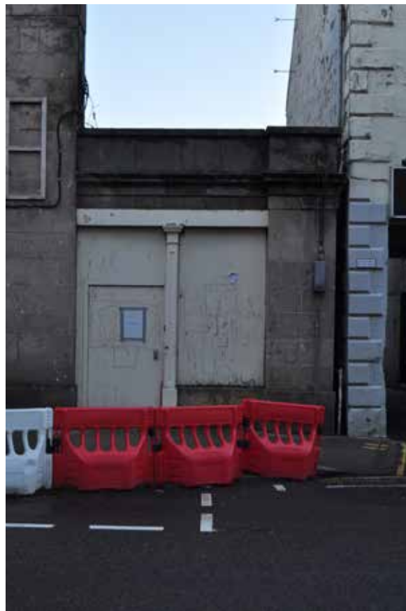
Plate 95: Building 3, general view of SSE facing elevation to east of arch, looking NNW