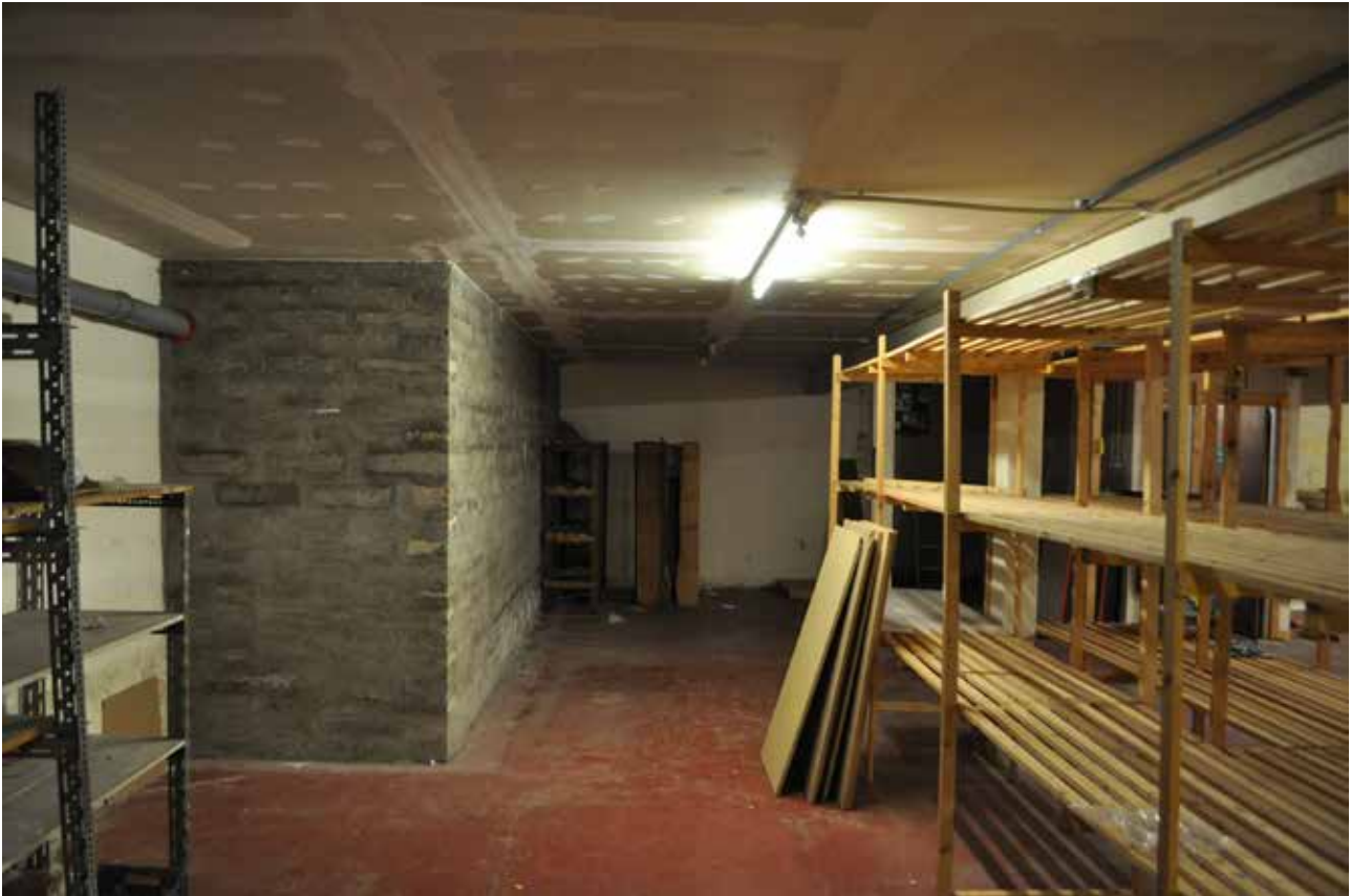
Plate 104: Building 3, Room 0/2, general view of NNW facing wall - east end, looking SSE