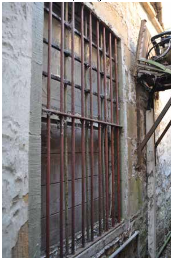
Plate 211: Building 5, detailed view of east window on NNW facing elevation - oblique, looking west