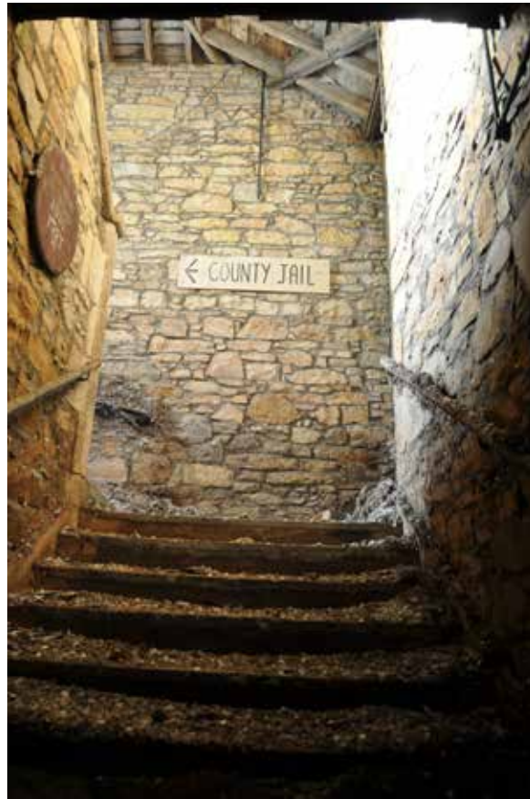
Plate 150: Building 4, detailed view of stairs behind north door on ENE facing elevation, looking WSW