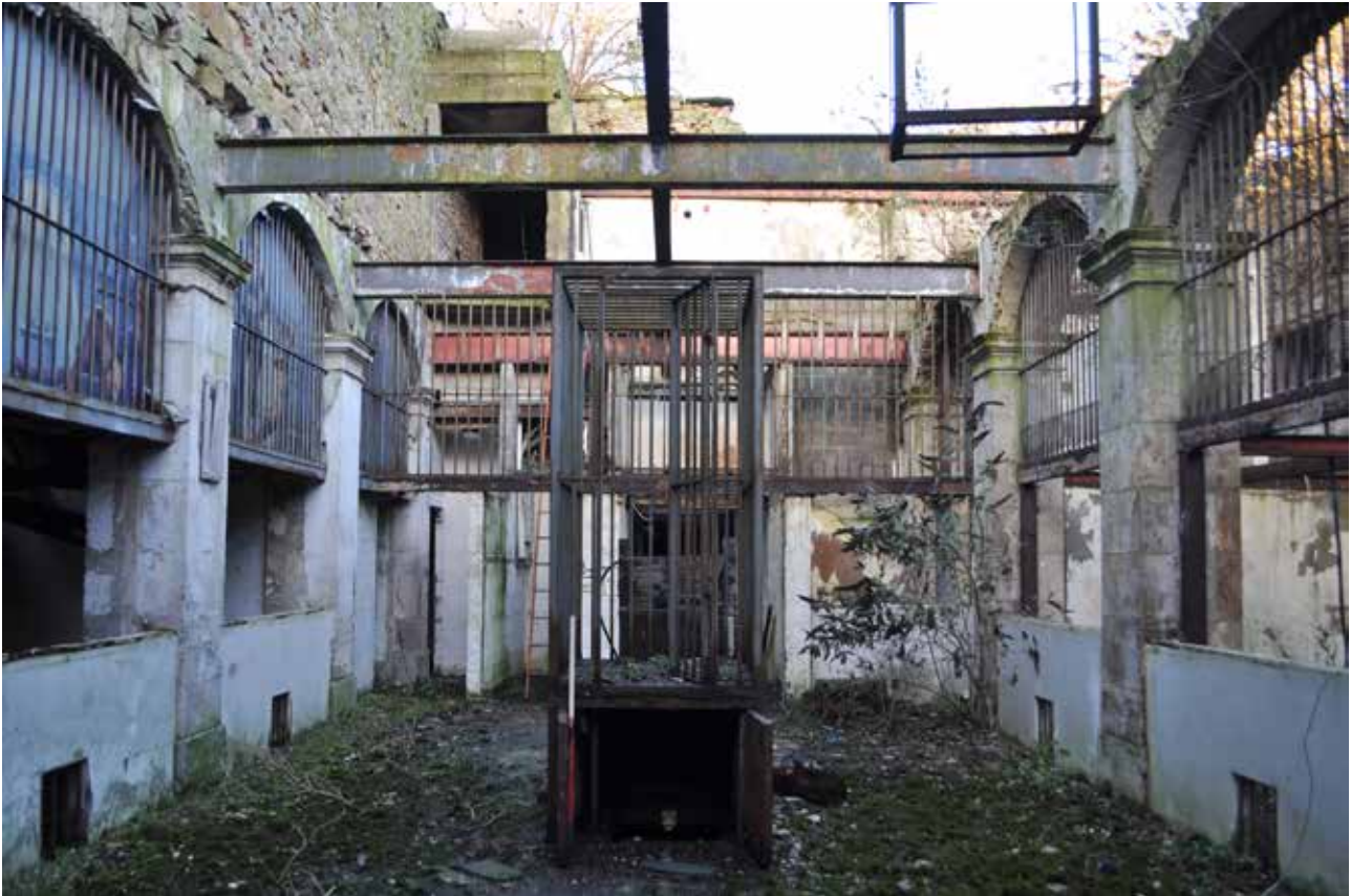
Plate 160: Building 4, general view of Room 1/1 from south, looking NNW