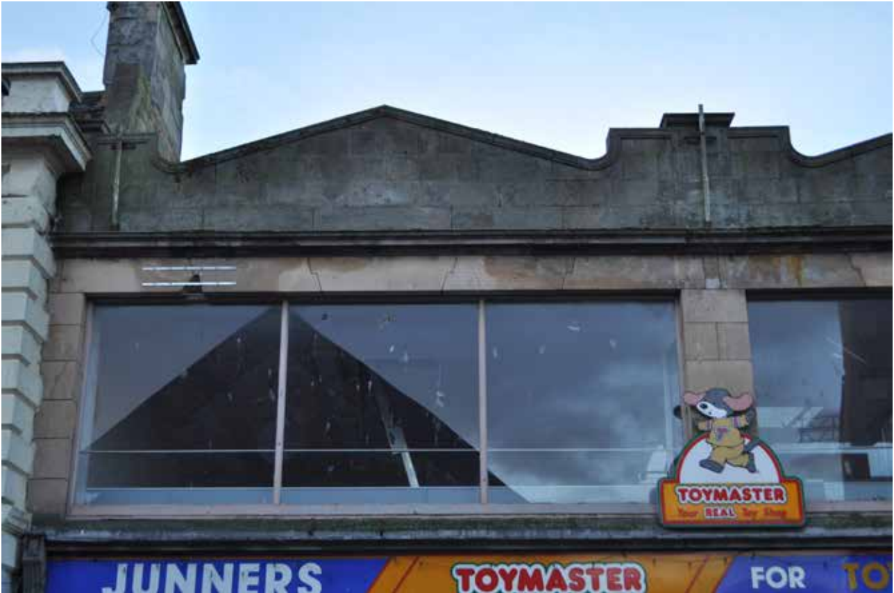
Plate 24: Building 1, general view of SSE facing elevation - upper west detail, looking NNW