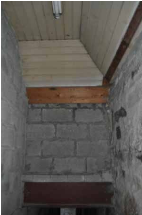
Plate 77: Building 1, general view of Room 2/5 looking towards NNW facing wall - upper detail, looking SSE