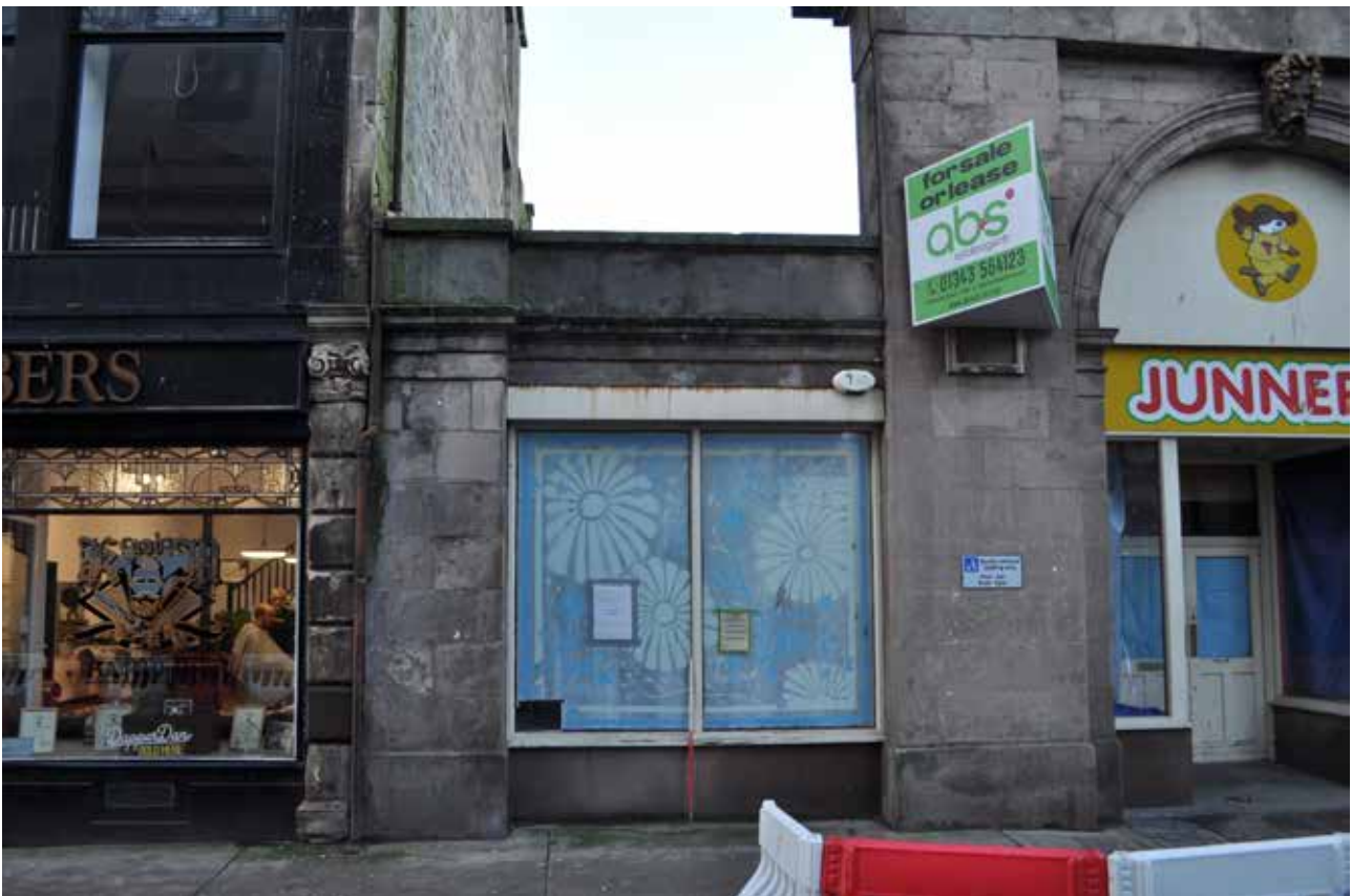
Plate 97: Building 3, general view of SSE facing elevation to west of arch, looking NNW