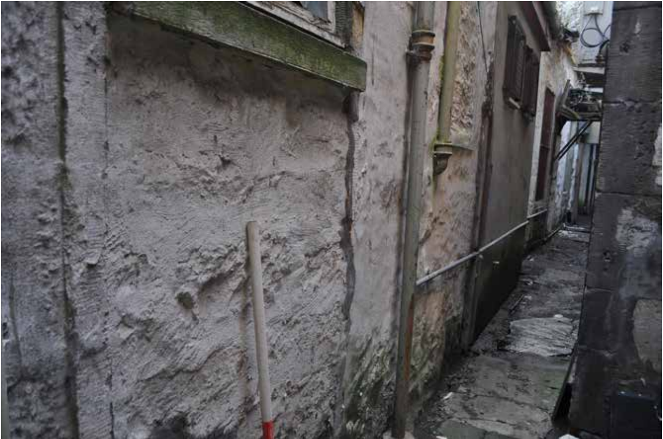
Plate 212: Building 5, general view of NNW facing elevation - lower detail on east building, looking southwest