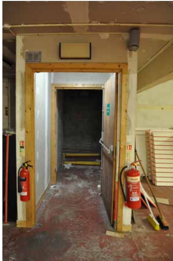
Plate 106: Building 3, Room 0/2, general view of NNW facing wall showing Room 0/1, looking SSE