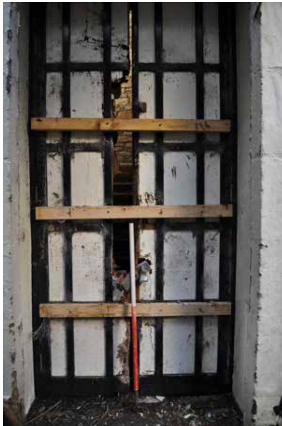
Plate 149: Building 4, detailed view of north door on ENE facing elevation , looking WSW