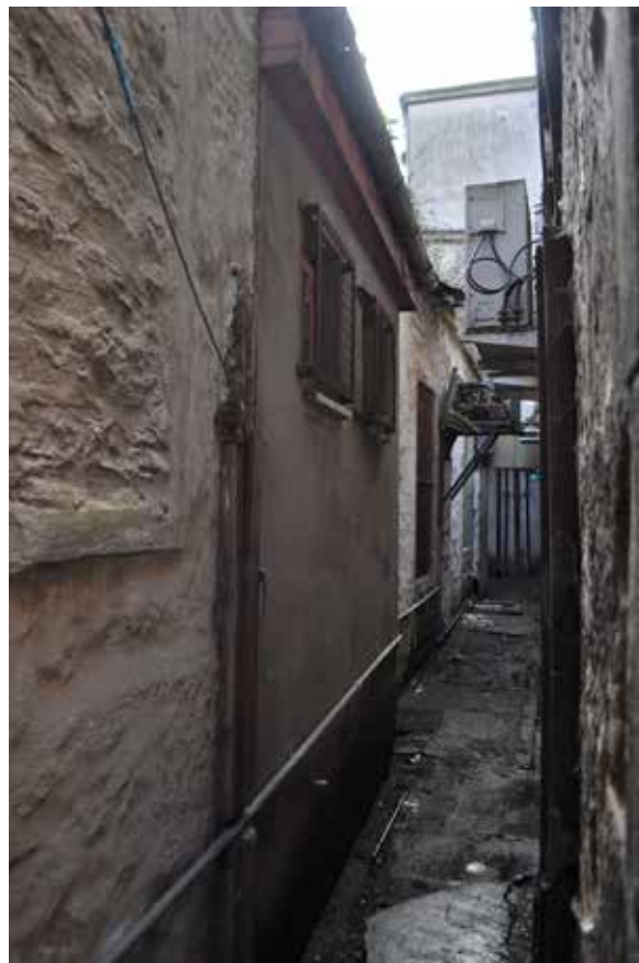
Plate 215: Building 5, general view of NNW facing elevation - central building, looking southwest