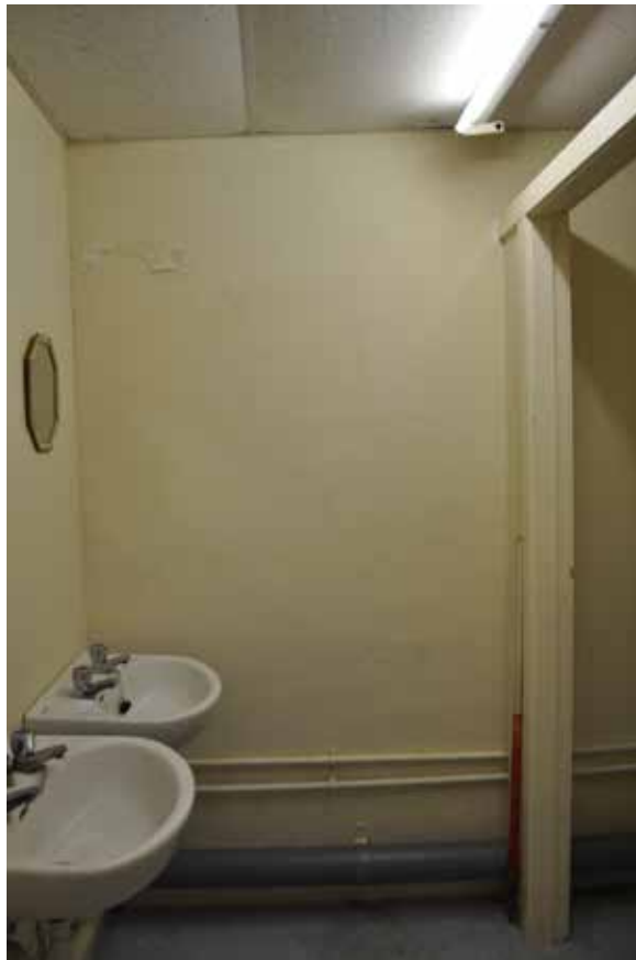
Plate 133: Building 3, Room 1/7, general view of SSE facing wall - west end, looking NNW