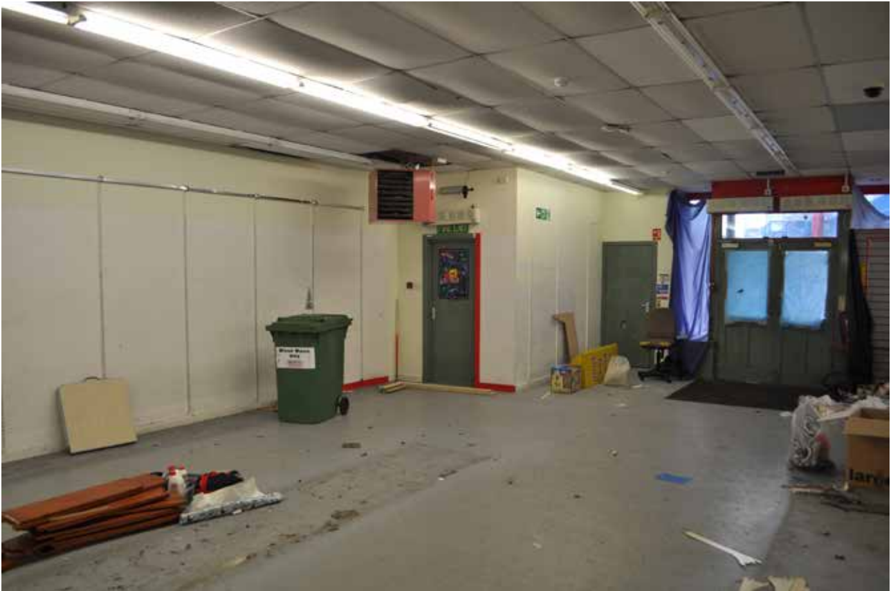
Plate 112: Building 3, general view of SE corner of Room 1/1, looking southeast