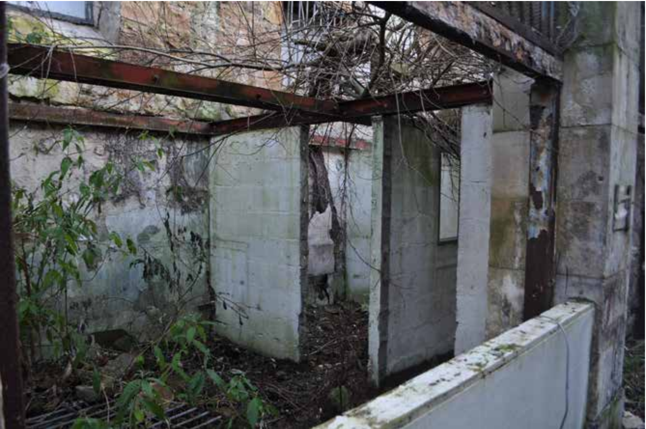
Plate 192: Building 4, Room 1/12, general view of WSW facing wall intersection with Room 1/13, looking southeast