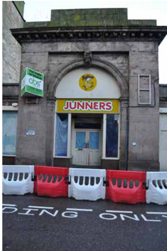
Plate 94: Building 3, general view of triumphal arched entrance on SSE facing elevation, looking NNW