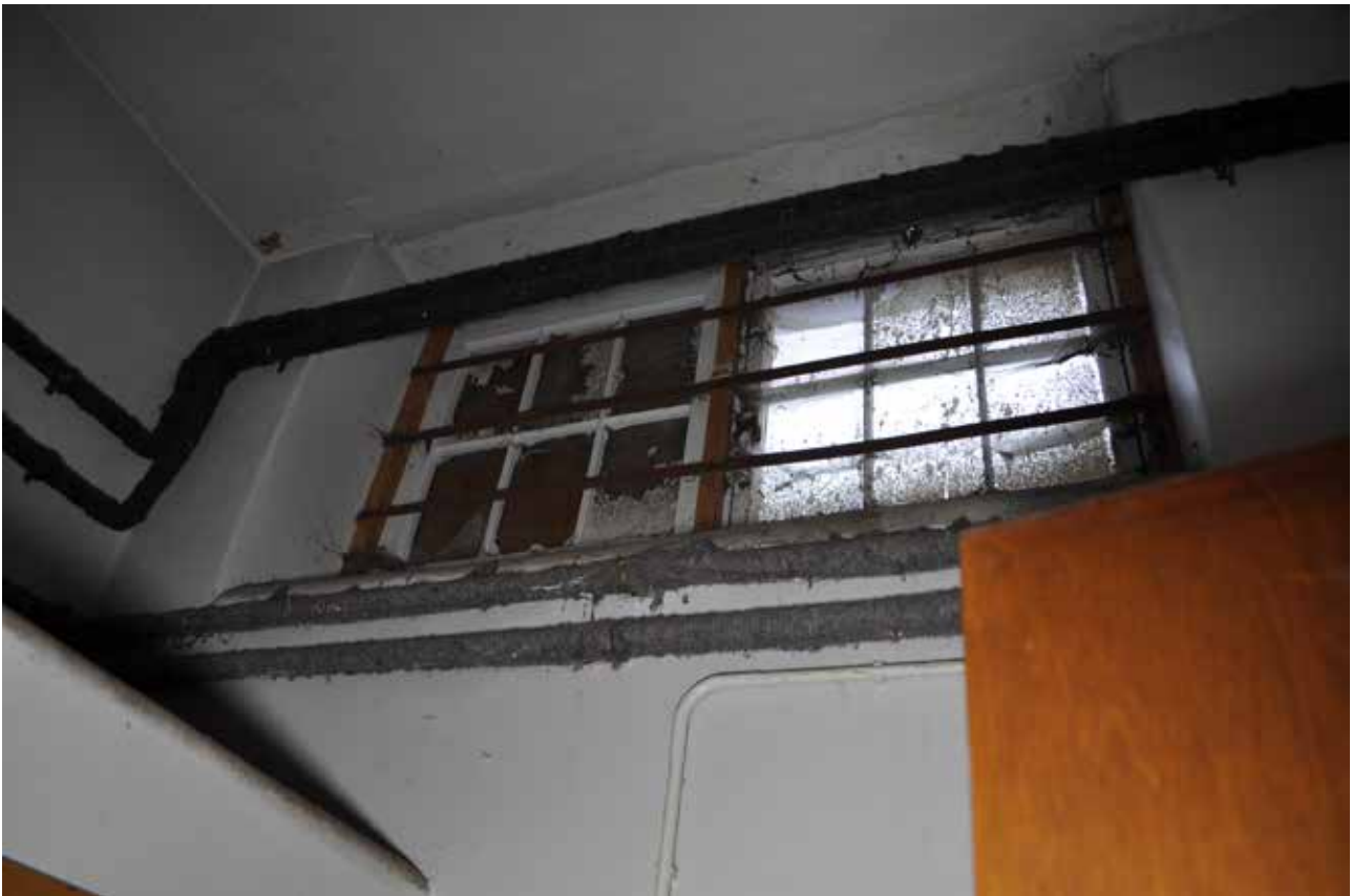
Plate 41: Building 1, Room 0/5, detailed view of window (014) on WSW facing wall, looking ENE