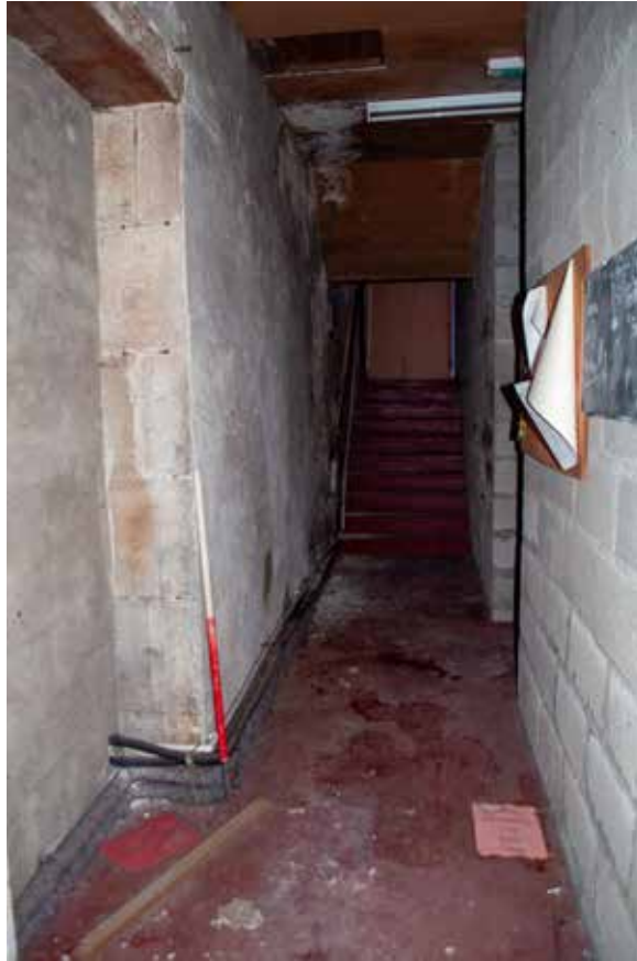
Plate 76: Building 1, general view of Room 2/5 looking towards NNW facing wall, looking SSE