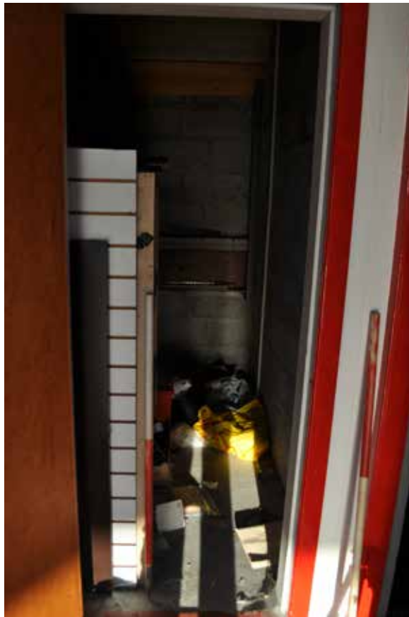
Plate 91: Building 1, general view of Room 2/7 looking towards SSE facing wall, looking NNW