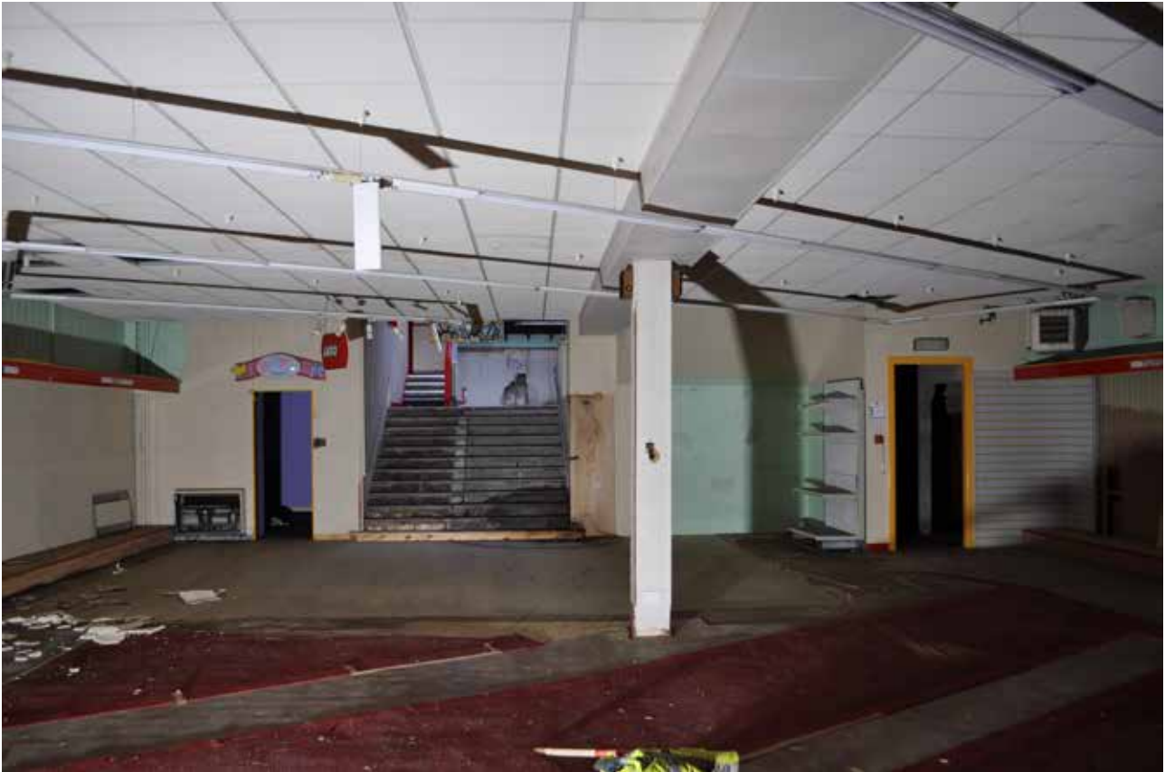
Plate 46: Building 1, Room 1/1, general view of SSE facing wall, looking NNW