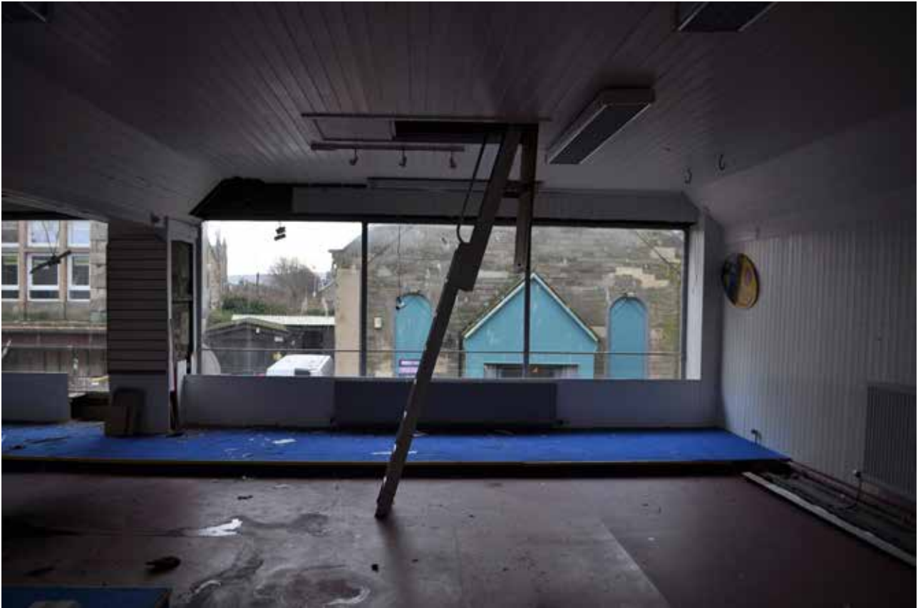
Plate 80: Building 1, Room 2/6, general view of NNW facing wall - west end, looking SSE