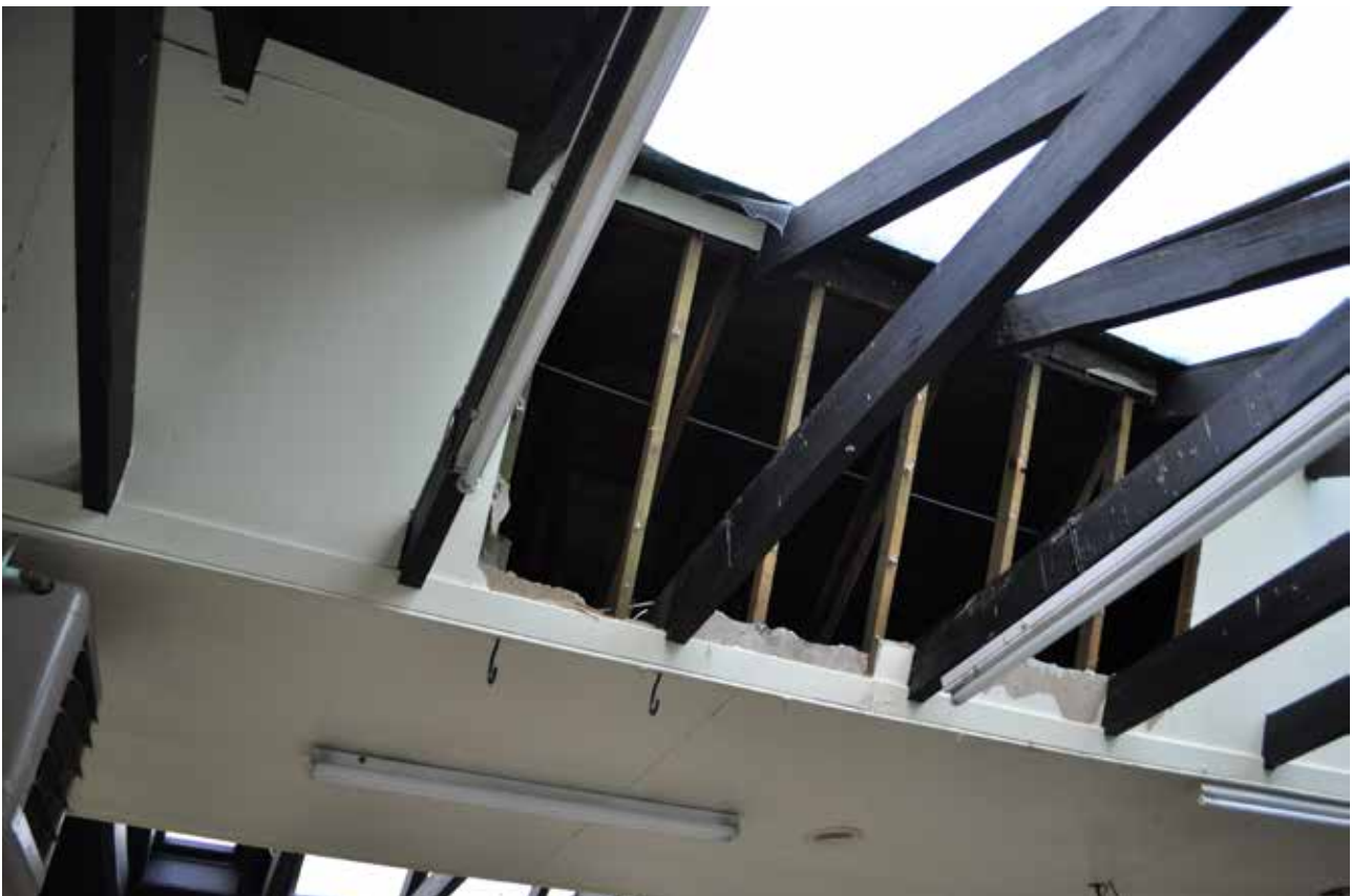
Plate 65: Building 1, Room 2/1, general view of exposed roof timbers and skylights, looking northeast