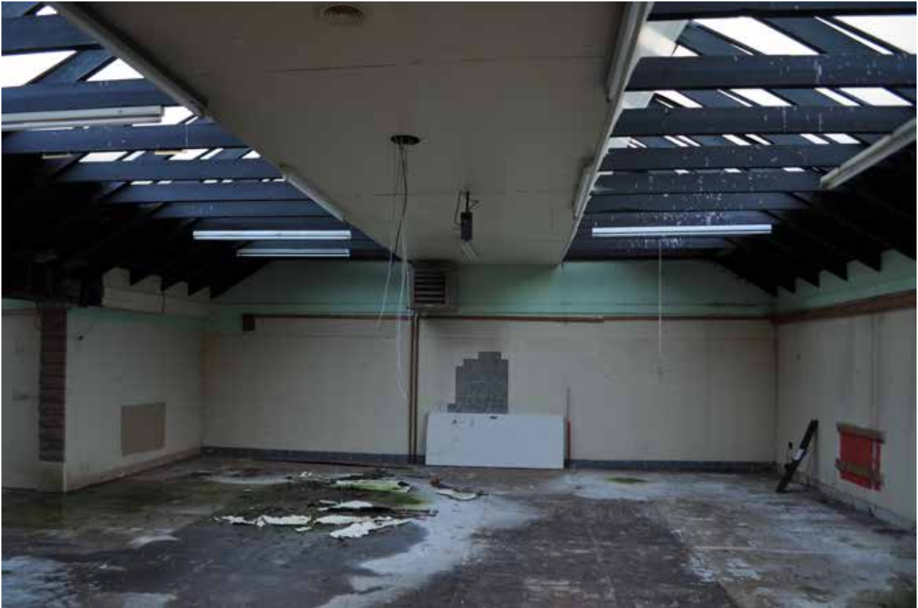
Plate 60: Building 1, Room 2/1, general view of ENE facing wall, looking WSW