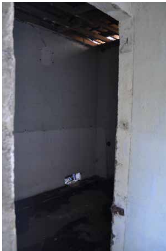
Plate 181: Building 4, general view of SW corner of Room 1/6, looking southwest