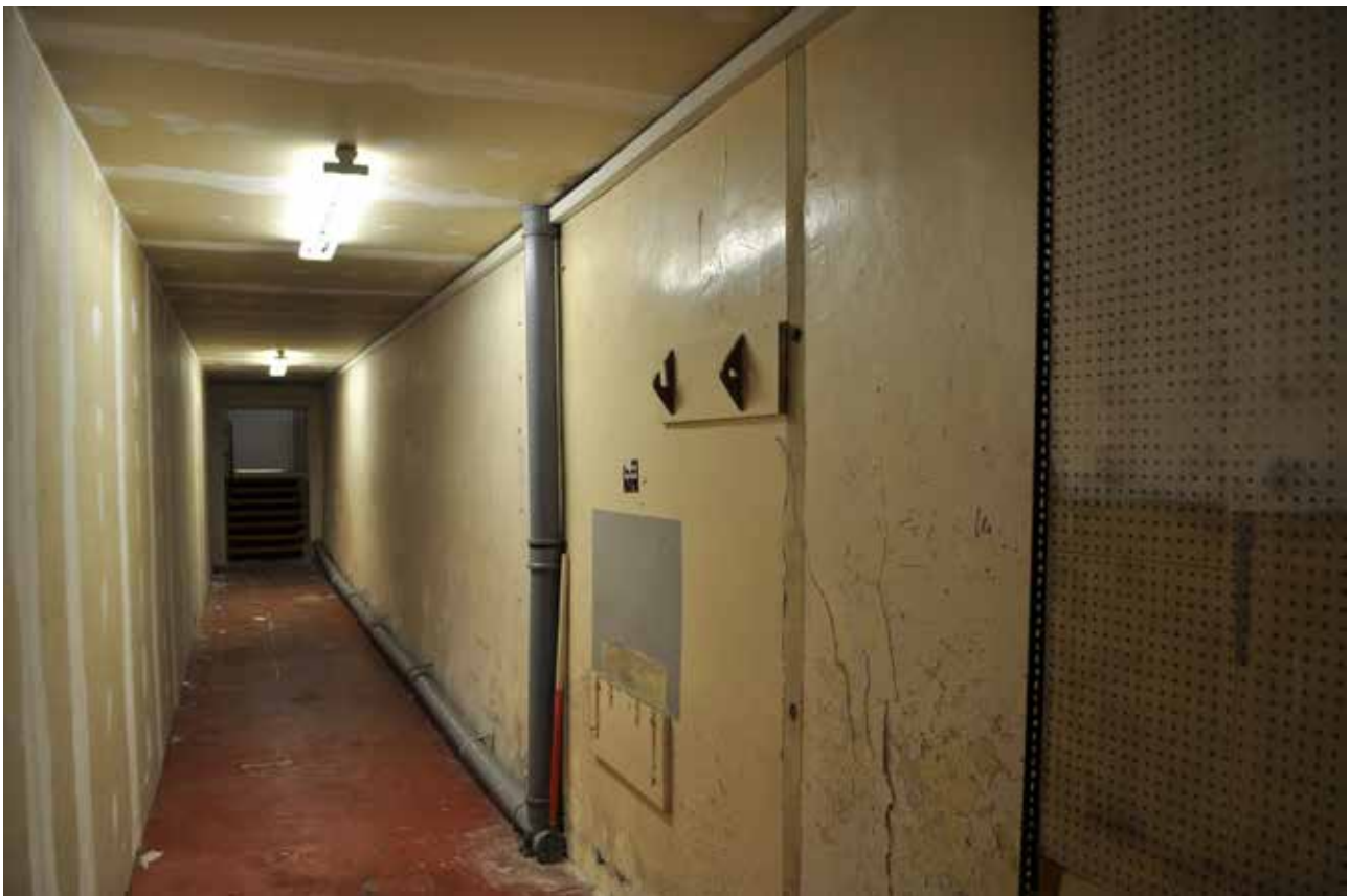
Plate 121: Building 3, Room 1/3, general view of corridor running along WSW facing wall - showing change in material, looking N