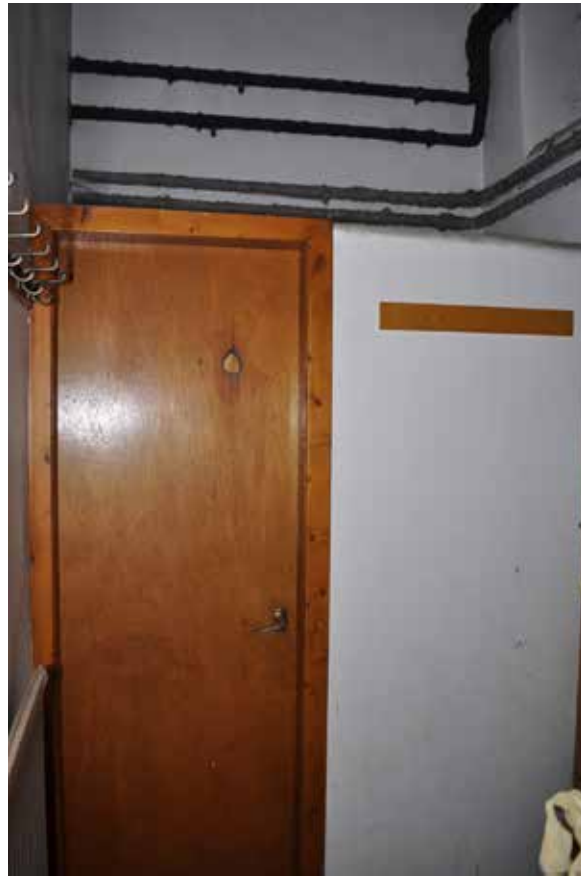
Plate 40: Building 1, Room 0/5, general view of SSE facing wall, looking NNW