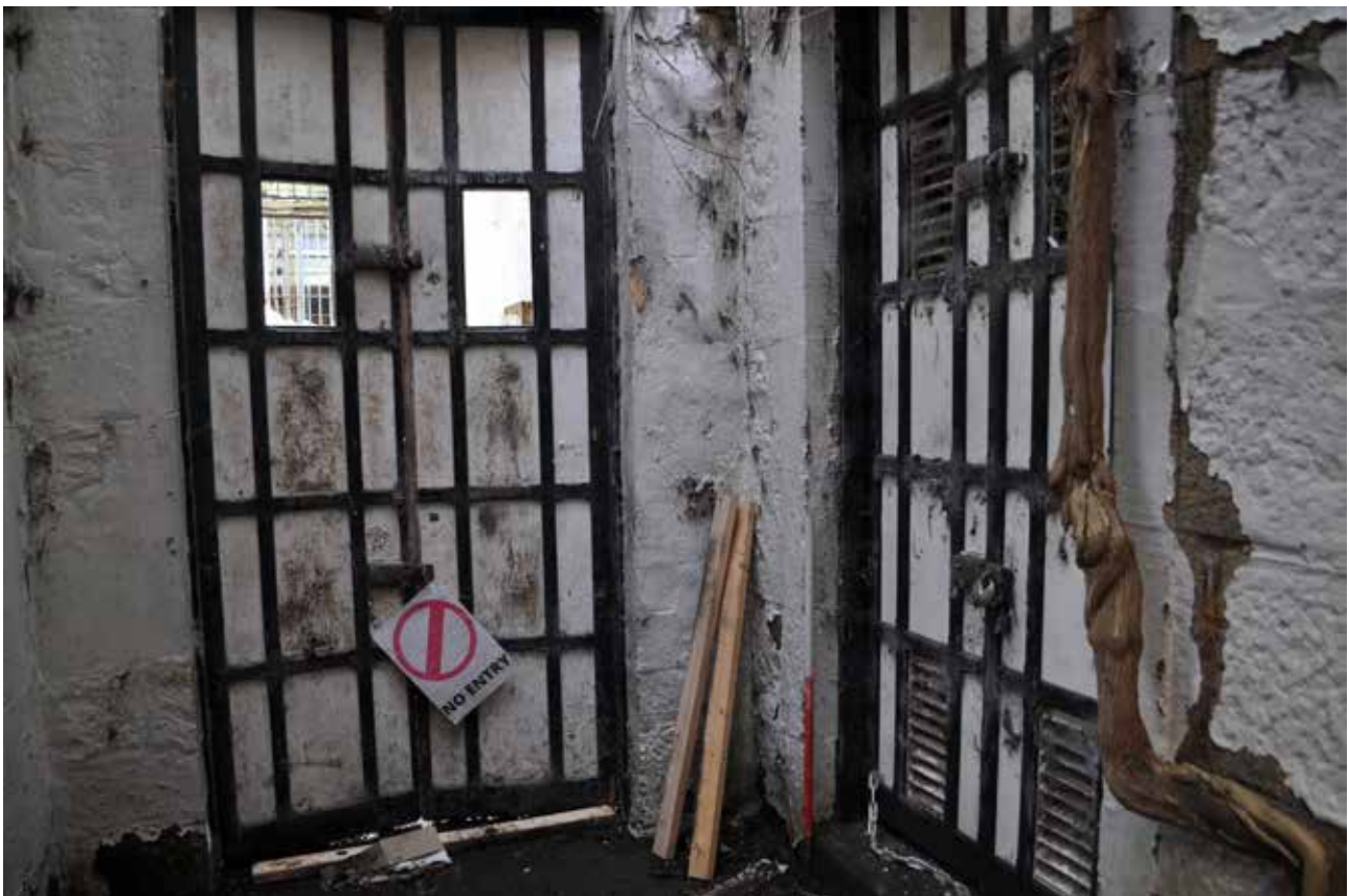
Plate 151: Building 4, general view of interface between ENE and NNW facing elevations, looking southwest