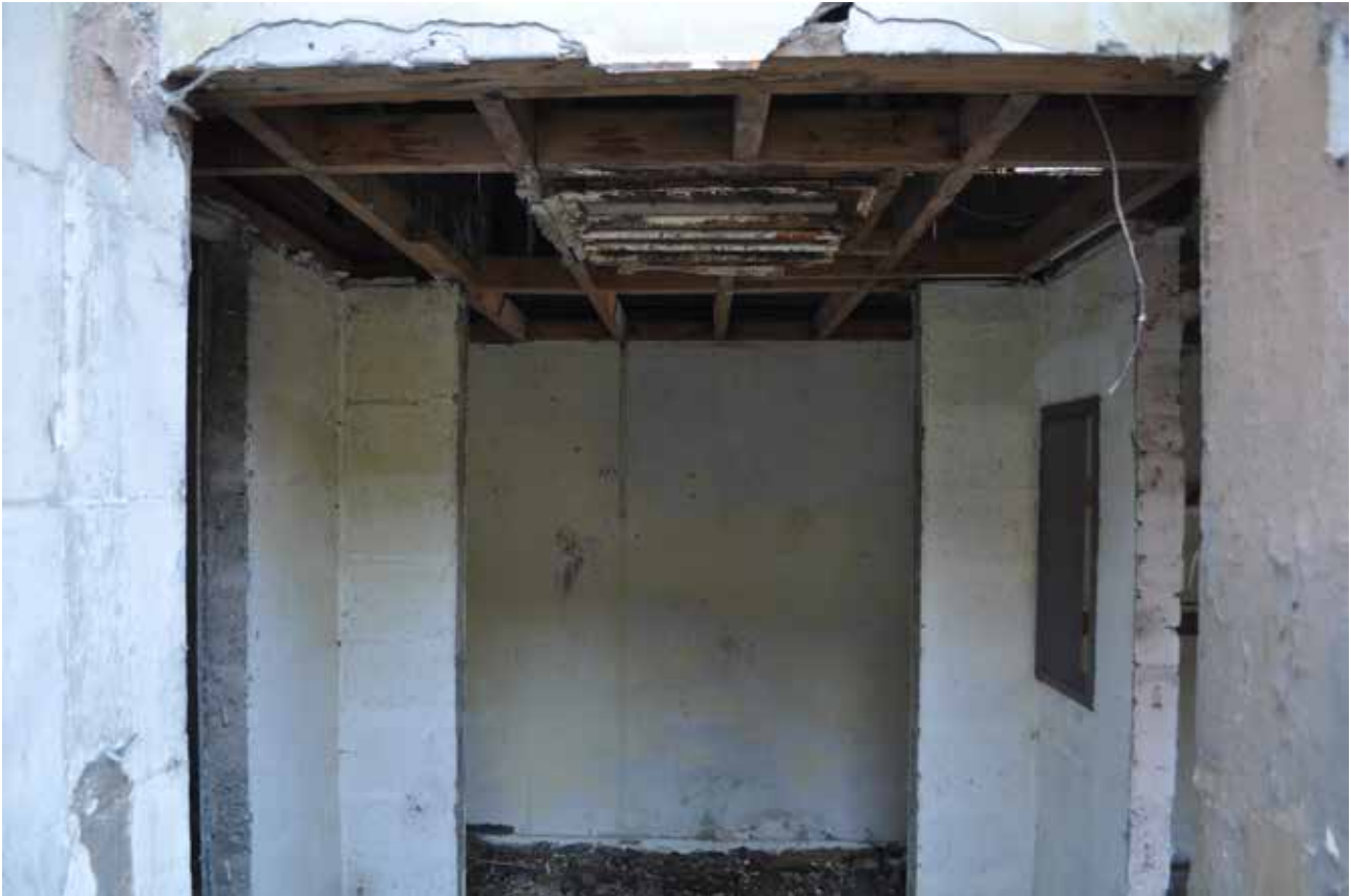
Plate 178: Building 4, Room 1/4, general view of ENE facing elevation, looking WSW