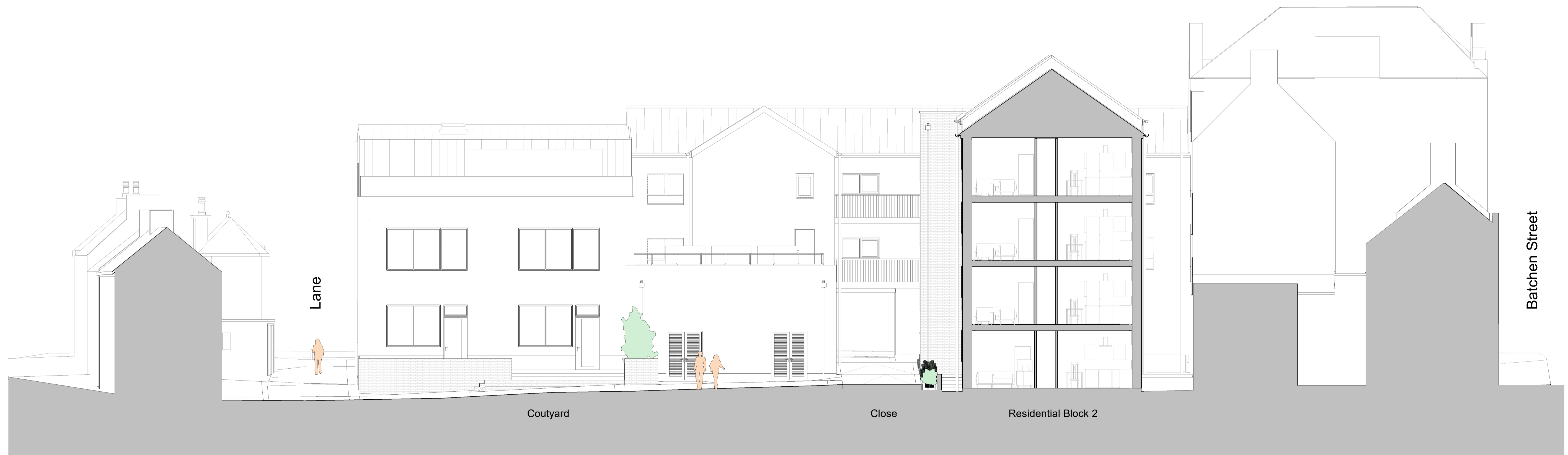
Section 6 - Looking South 1 : 100