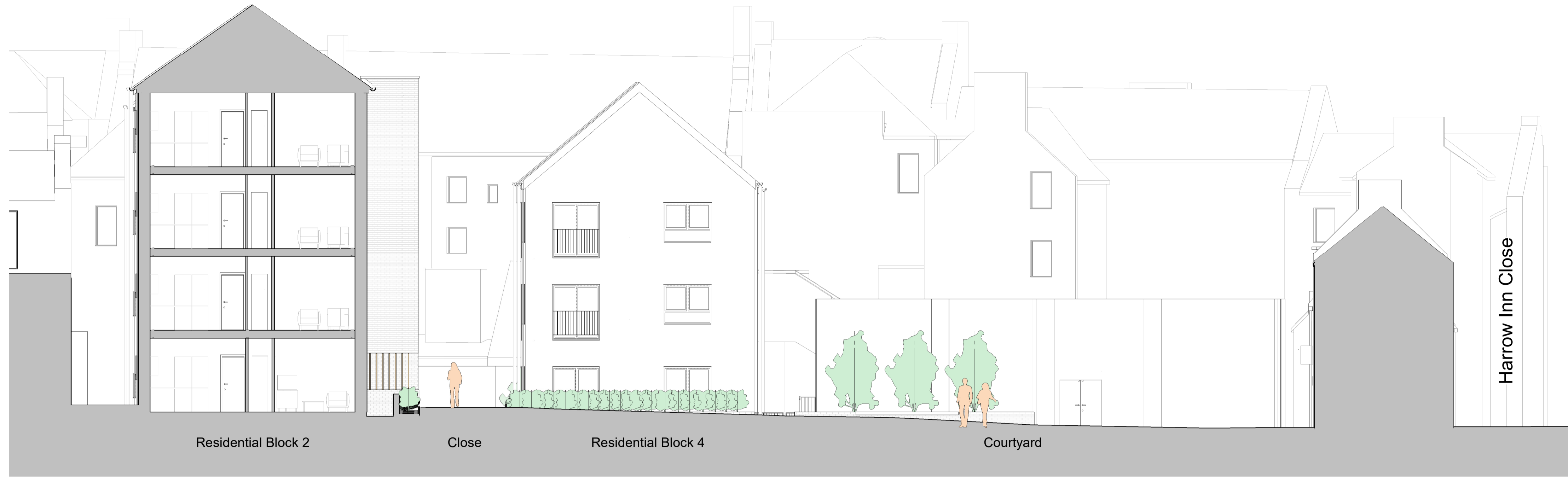
Section 5 - Looking North 1 : 100