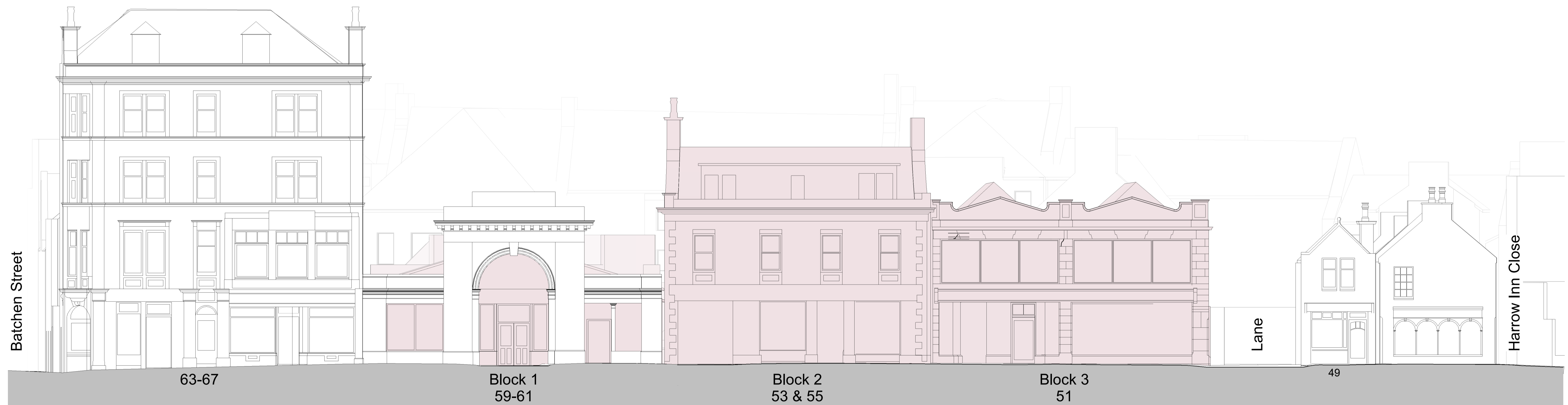
Elevation 1 - South Street 1 : 100