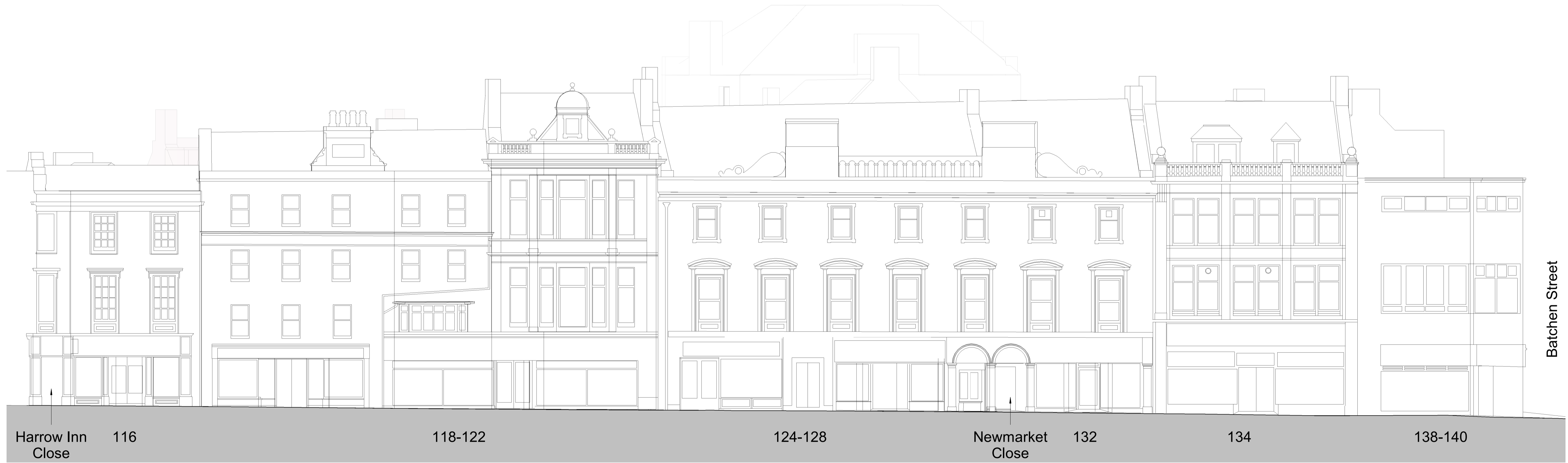
Elevation 3 - High Street 1 : 100