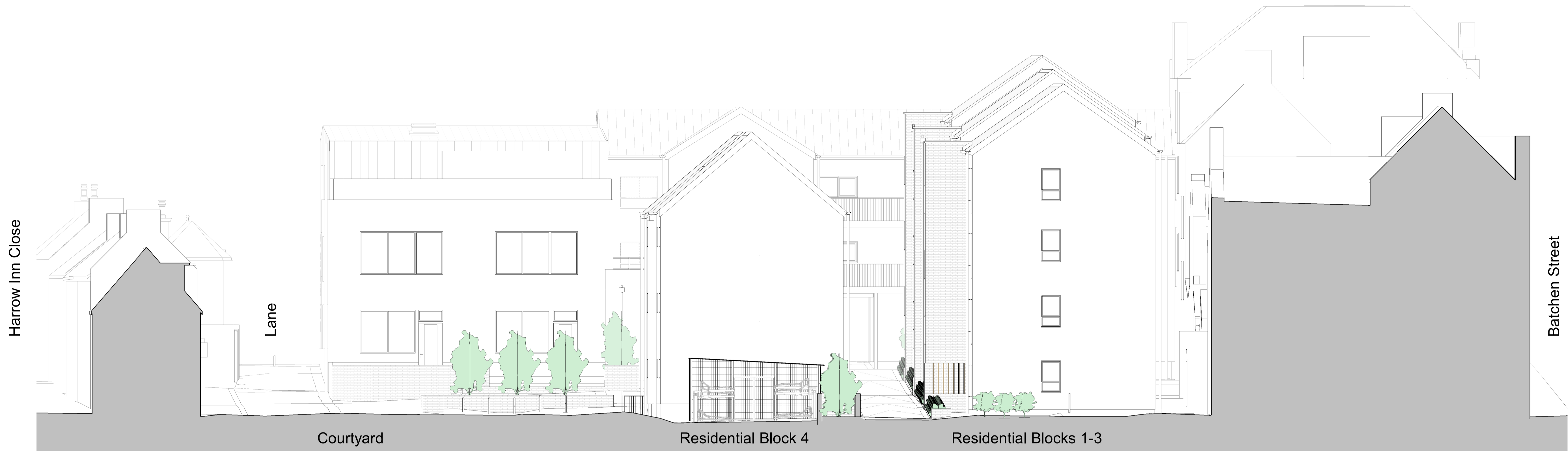
Section 3 - Looking South 1 : 100