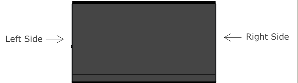
Roof Plan - 01 | 1:100 @ A4