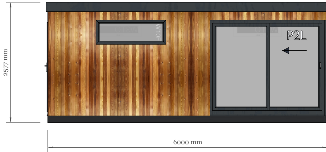
High Side Elevation - 03 | 1:50 @ A4