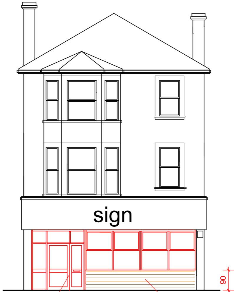
front (east) elevation